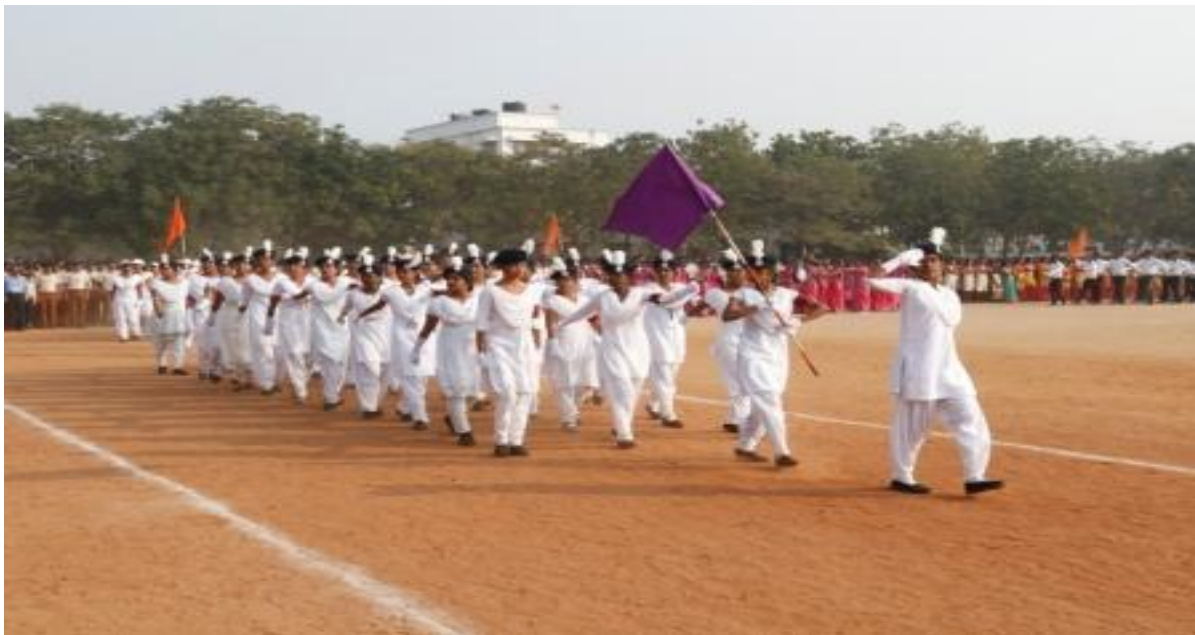
Our students participating in the march past in the Republic Day Celebration