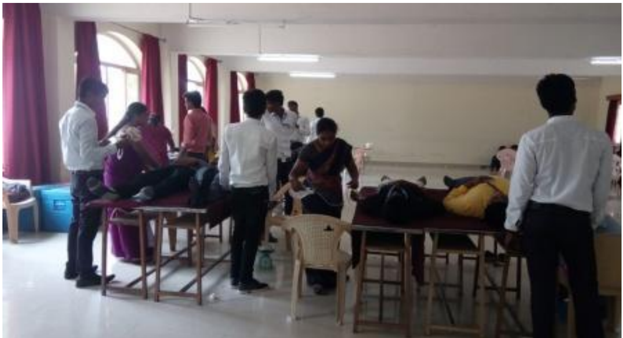
Our Volunteers and Students Donating their Blood