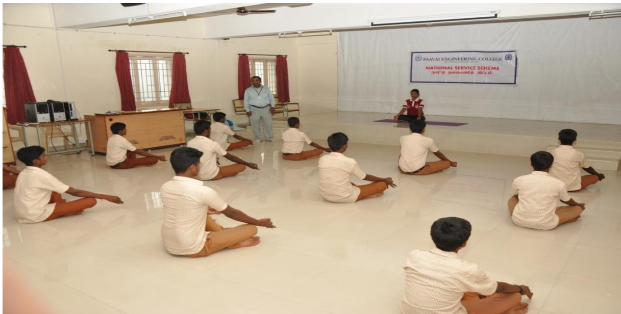
Our students performing the various Yoga- Asanas