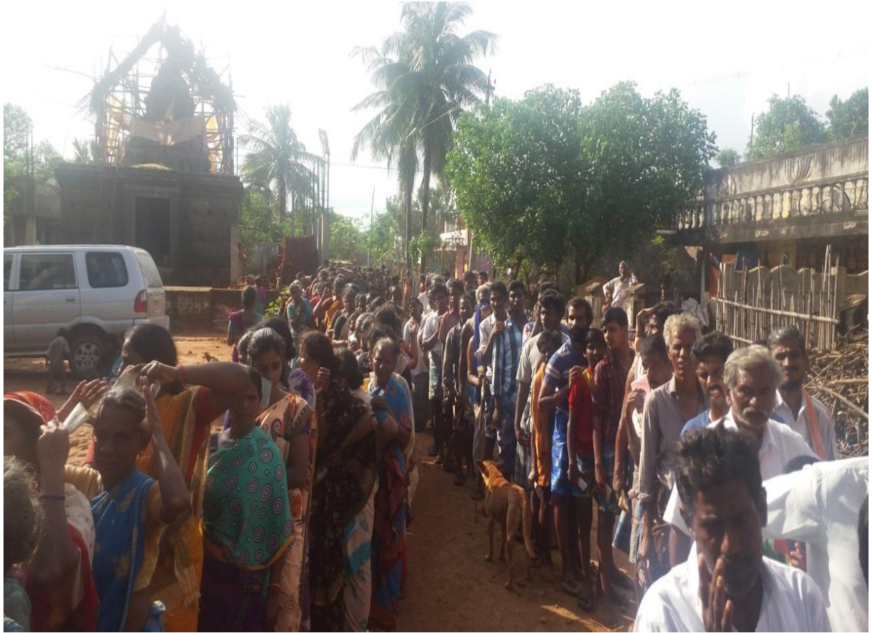
The contributed materials we were issued to the KilaKuppam village people in Cuddalore District.