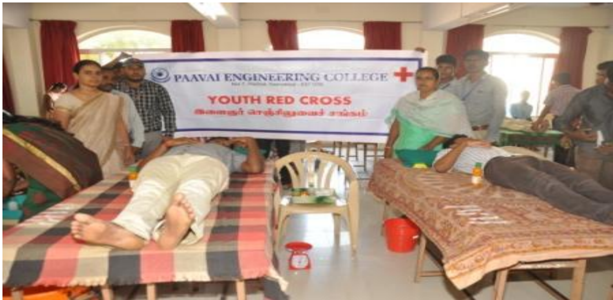
Our Volunteers and Students Donating their Blood