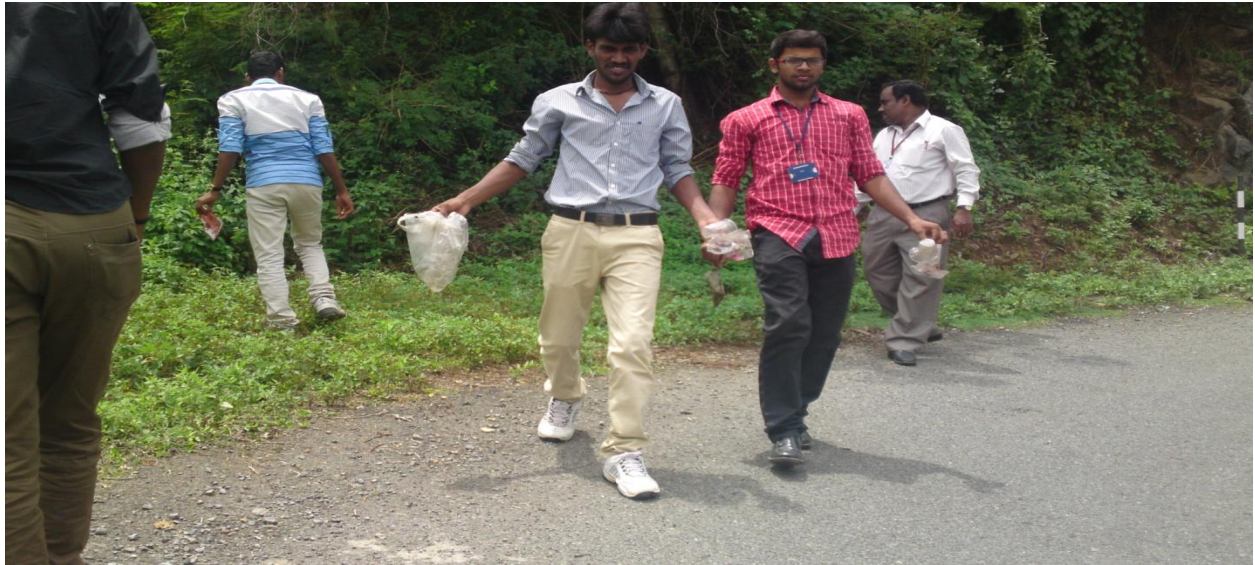
Our Volunteers Removing Polythene bags and Plastic bottles in the Kolli Hills