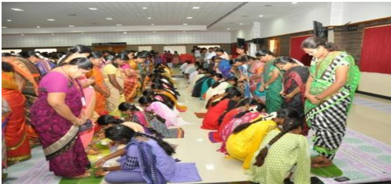
Our students doing Patha Pooja for Teachers