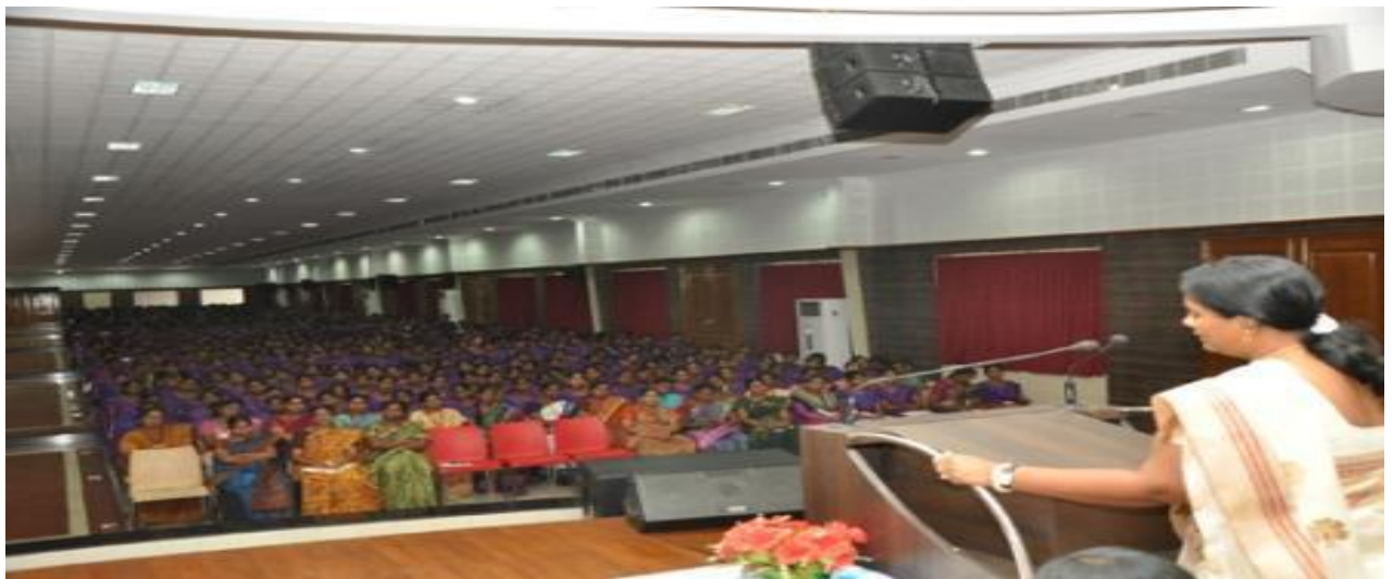
Celebrating International Women's Day