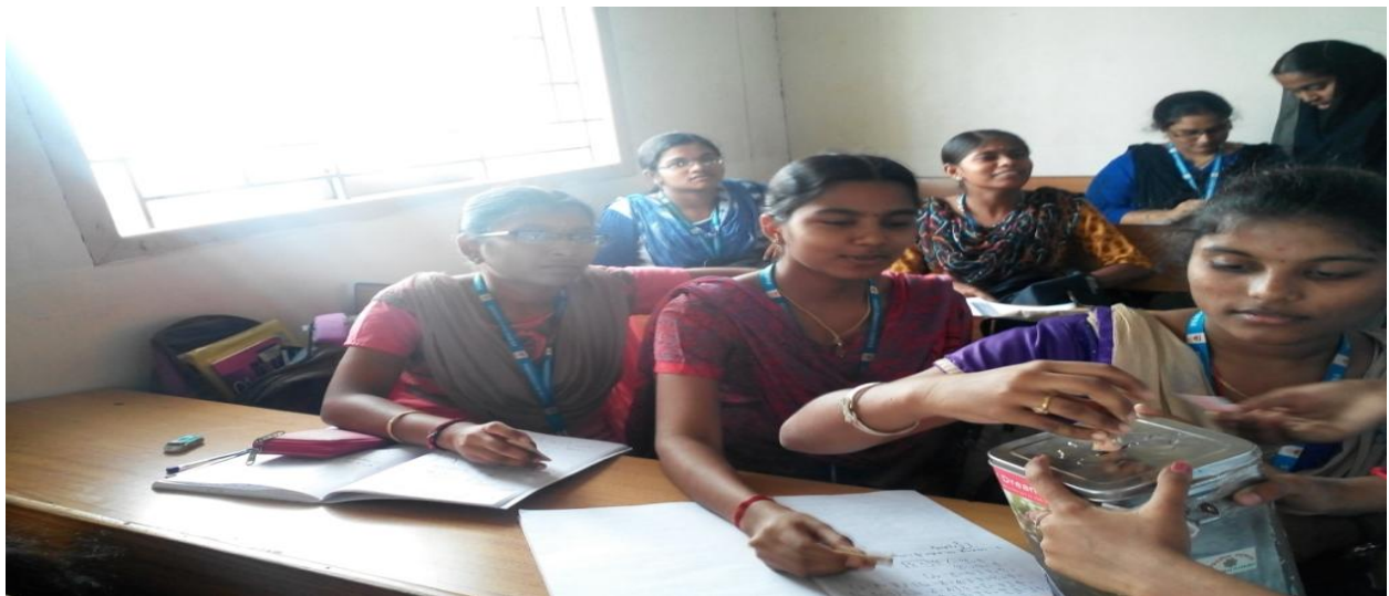
Our students contributing the amount for Flag-Day Celebration