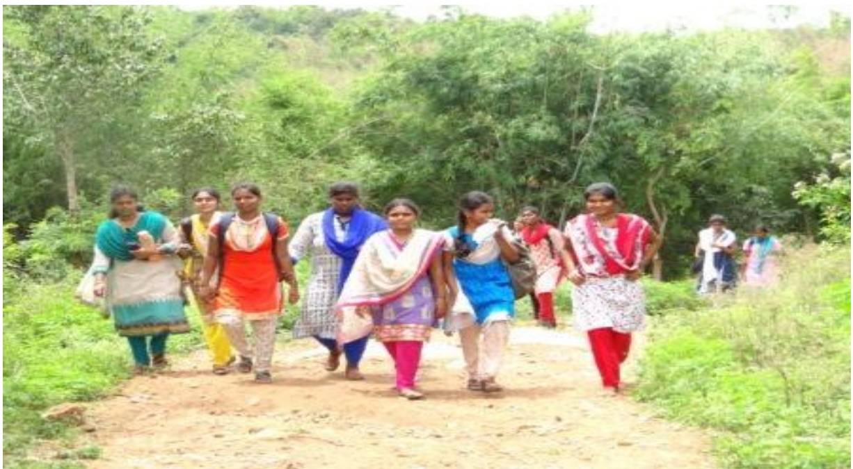
A trekking expedition to Yercaud