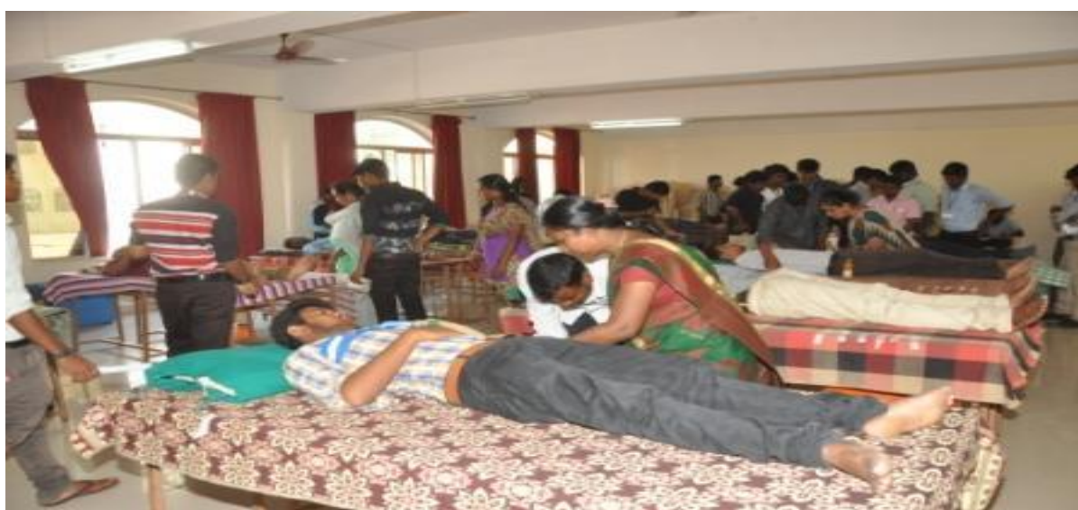
Our Volunteers and Students Donating their Blood