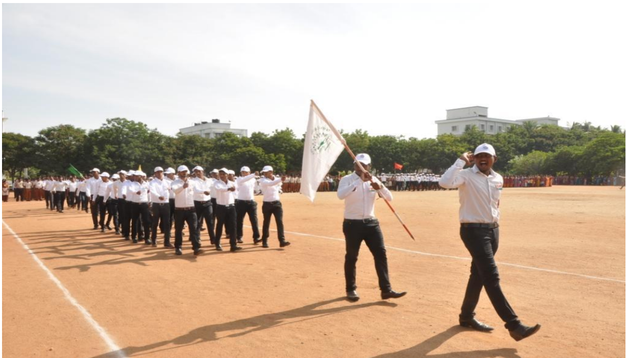
Our NSS Volunteers March past in the Independence Day Celebration