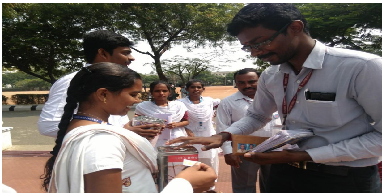
Our NSS Volunteers Collecting Fund for Visually Challenged People.