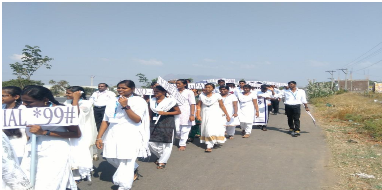
Our NSS Volunteers Creating Awareness in the VISAKA Campaign