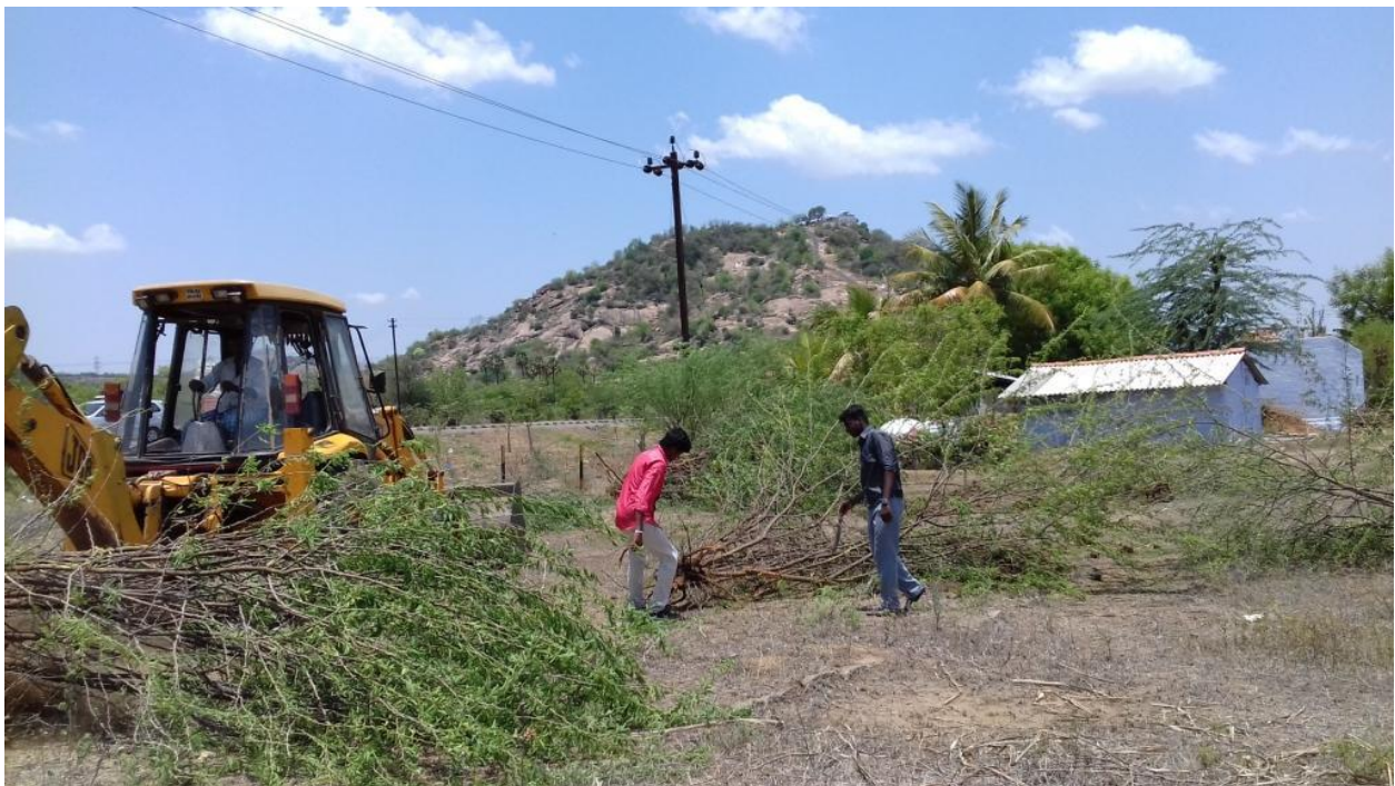
Our NSS Volunteers removing the Semai Karuvelan Trees