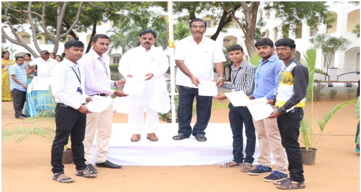
NSS Volunteers in the Republic Day March Past and Receiving Blood Donation certificates