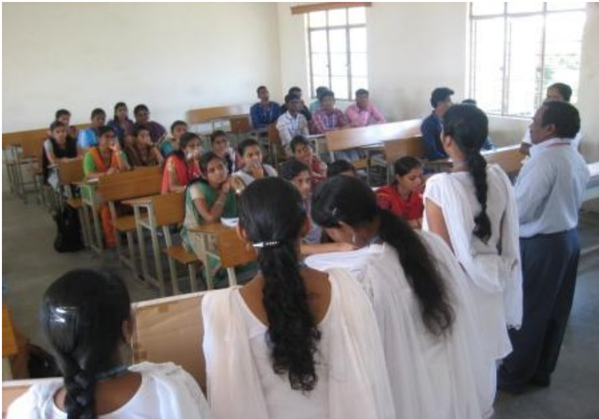
An Oratorical and Essay writing competition conducted for Students

In connection with creating awareness and observance of World AIDS Day, we have conducted an oratorical competition and essay writing competition on 01.12.2016 (Thursday) in our college and more than 100 students were participated in these events.