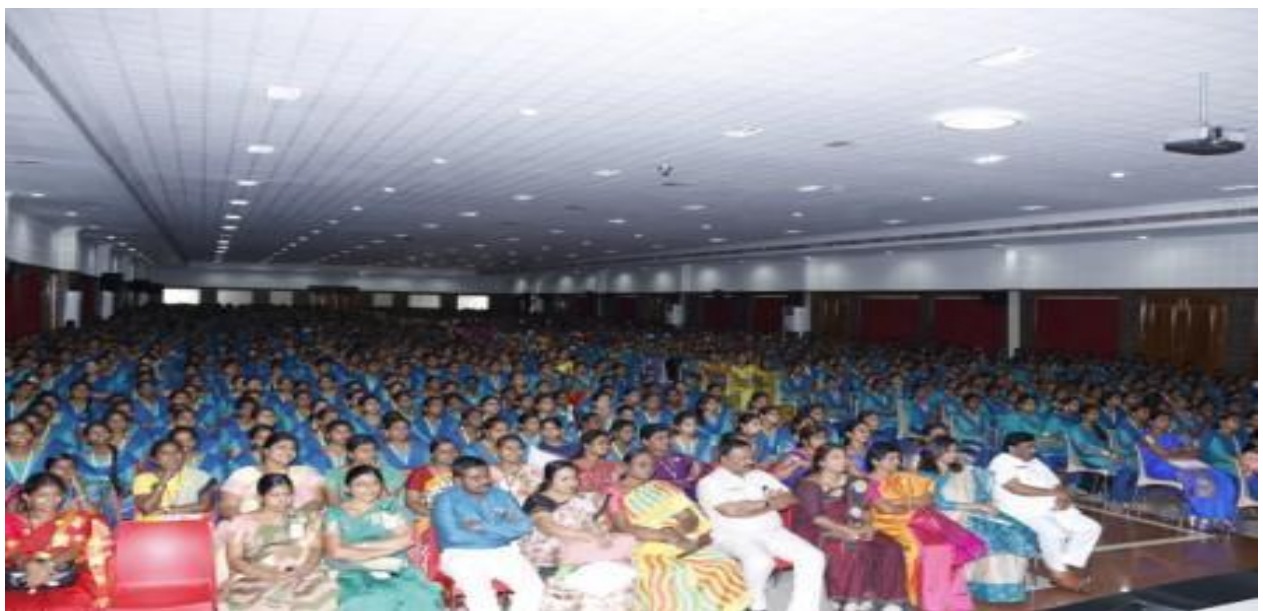
Celebrating International Women's Day