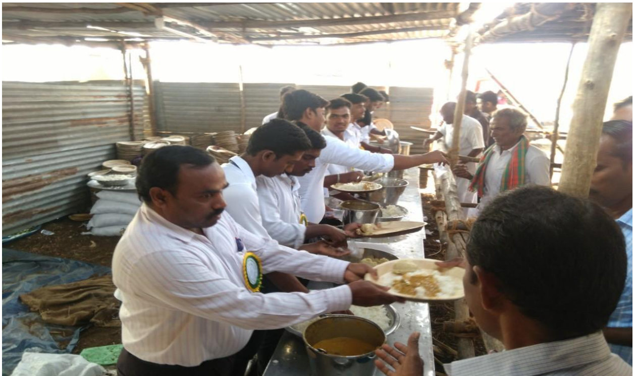
Our NSS Volunteers Organizing Food Committee