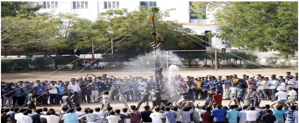
Astra Inauguration and providing volunteer ship for events