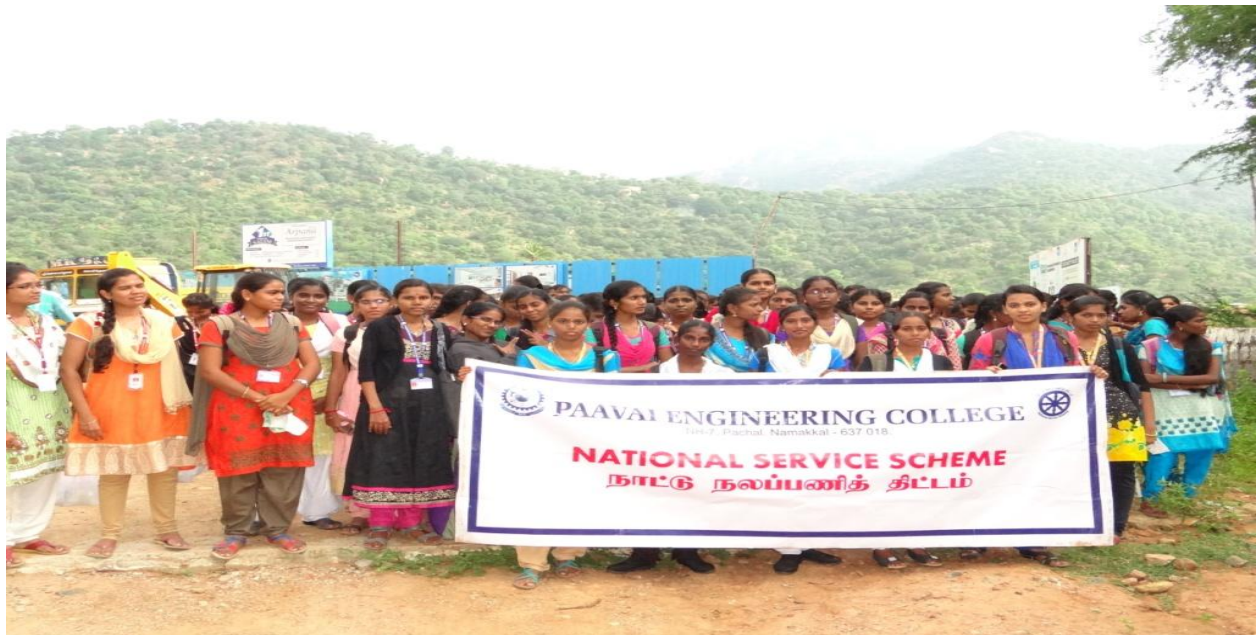
A trekking expedition to Yercaud