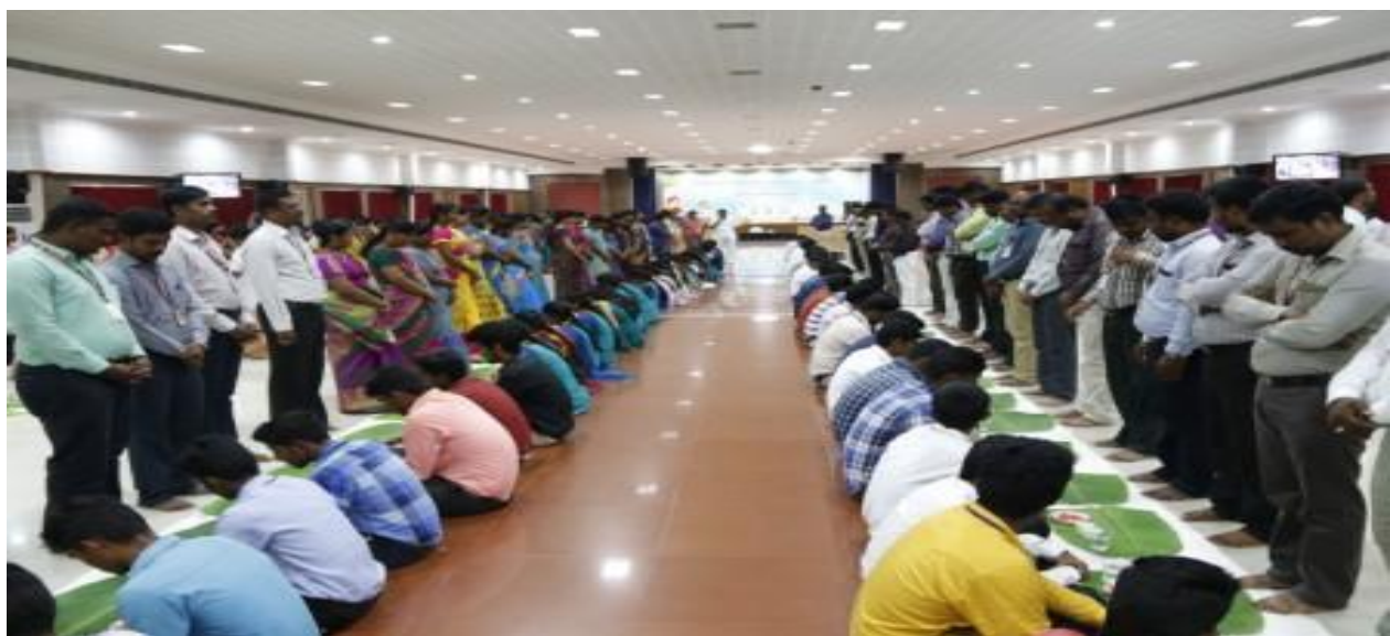
Our students doing Patha Pooja for Teachers