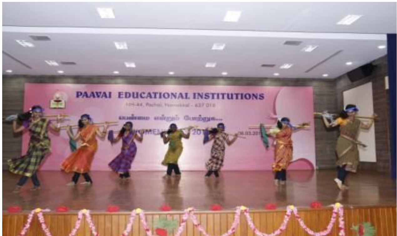
Celebrating International Women's Day