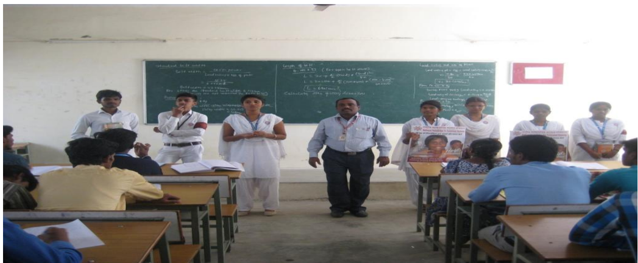
Our NSS Volunteers collecting Fund from our college Students and Staff Members