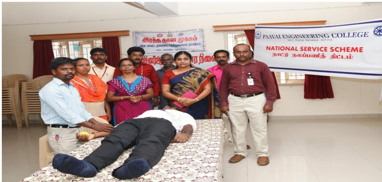
Our Volunteers and students donating their blood