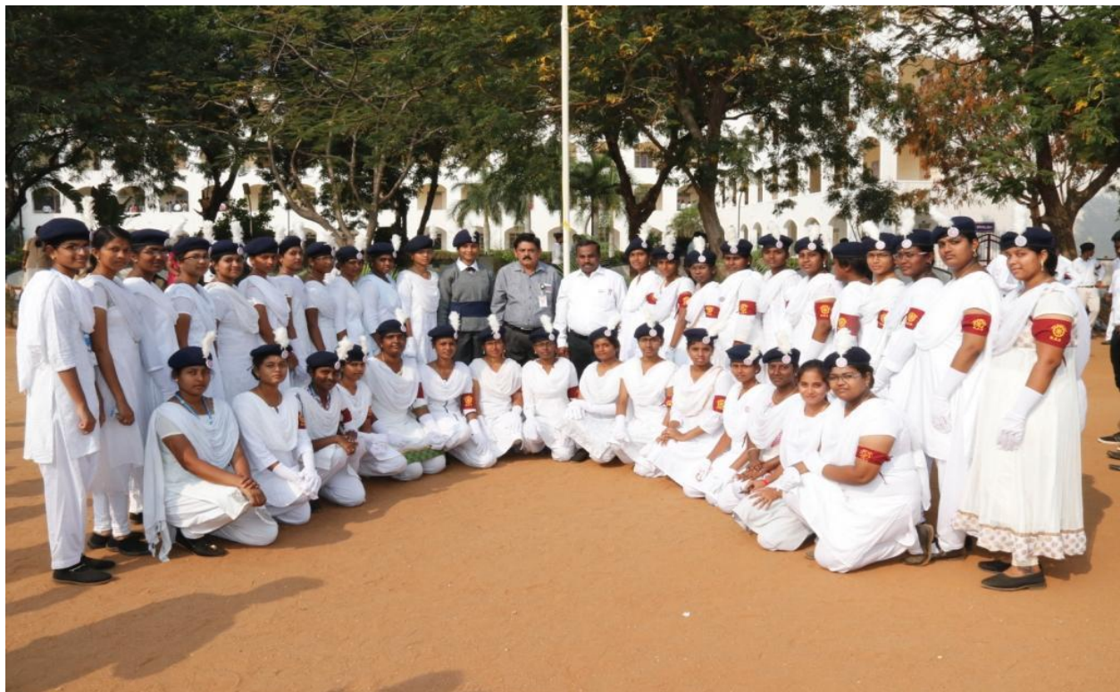
Our volunteers and students receiving Award and Appreciation certificates in Republic Day Celebration