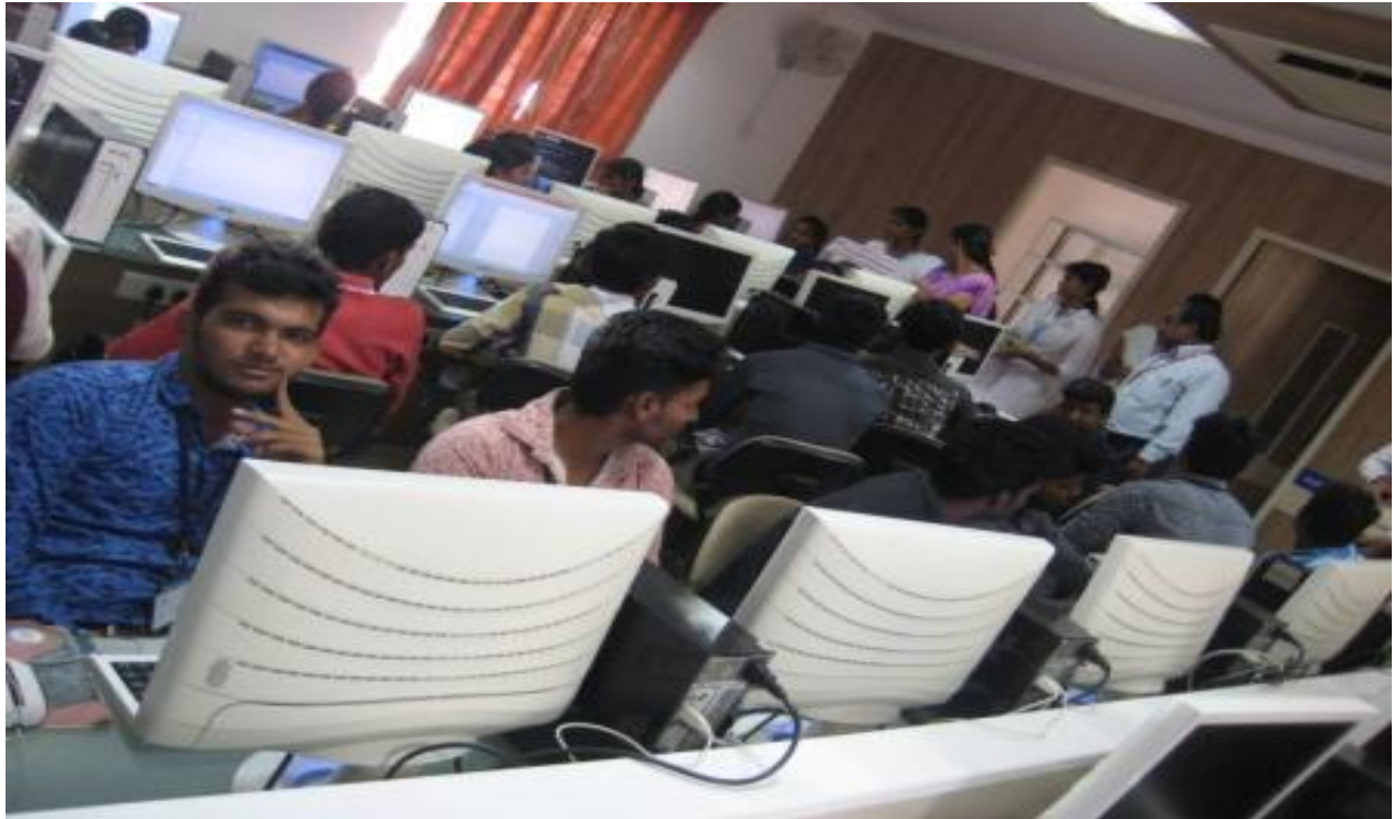
An Oratorical and Essay writing competition conducted for Students

In connection with creating awareness and observance of World AIDS Day, we have conducted an oratorical competition and essay writing competition on 01.12.2017 (Friday) in our college and more than 200 students were participated in these events.