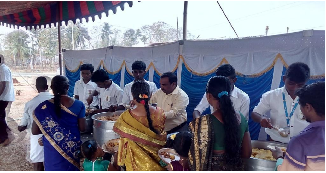
Our Volunteers providing volunteer ship for Sri Shirdi Saibaba Kovil Kumbhaseikam