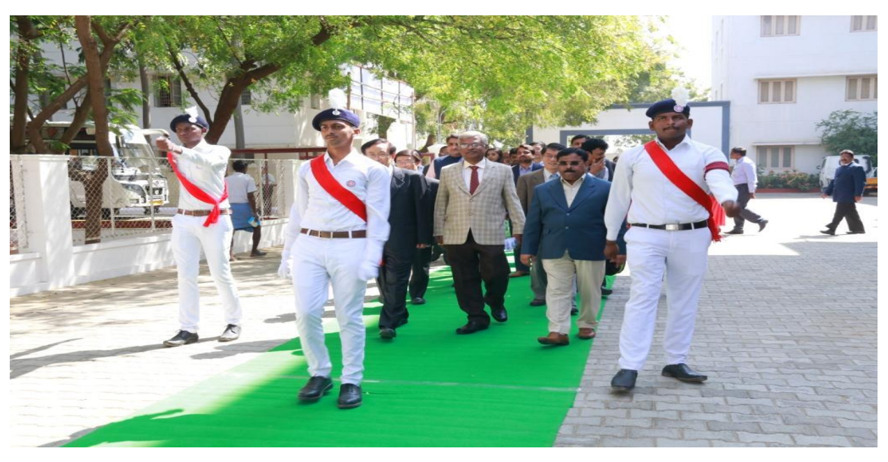
Inauguration of INDO-TAIWAN SUMMIT and Providing volunteer ship