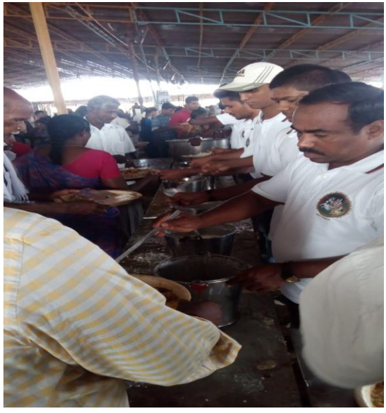
Our volunteers providing volunteer ship for Navaladiyan Kovil Kumbhaseikam