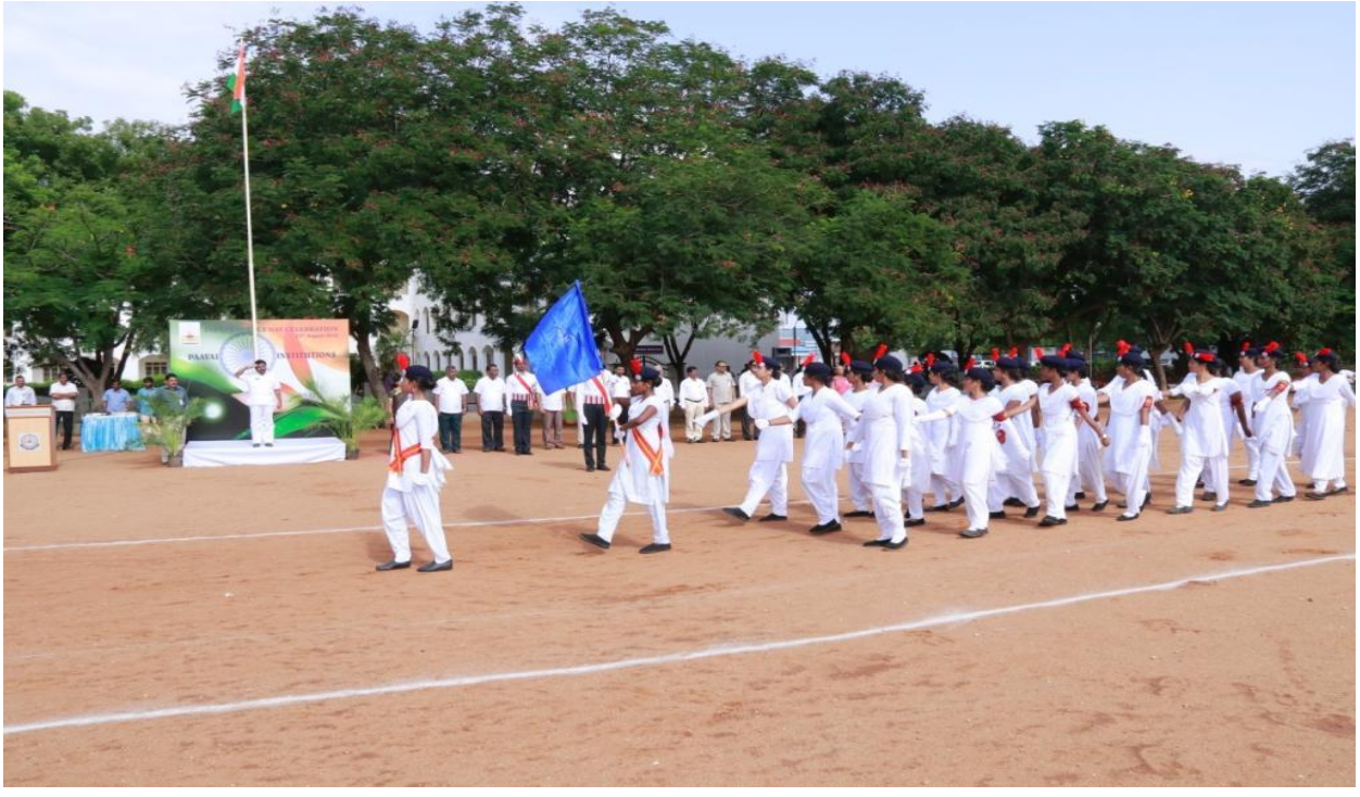
Our students participating in the march past in the Independence Day Celebration