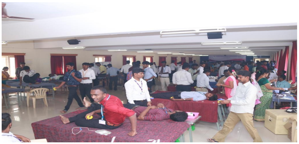
Our Volunteers and Students Donating their Blood