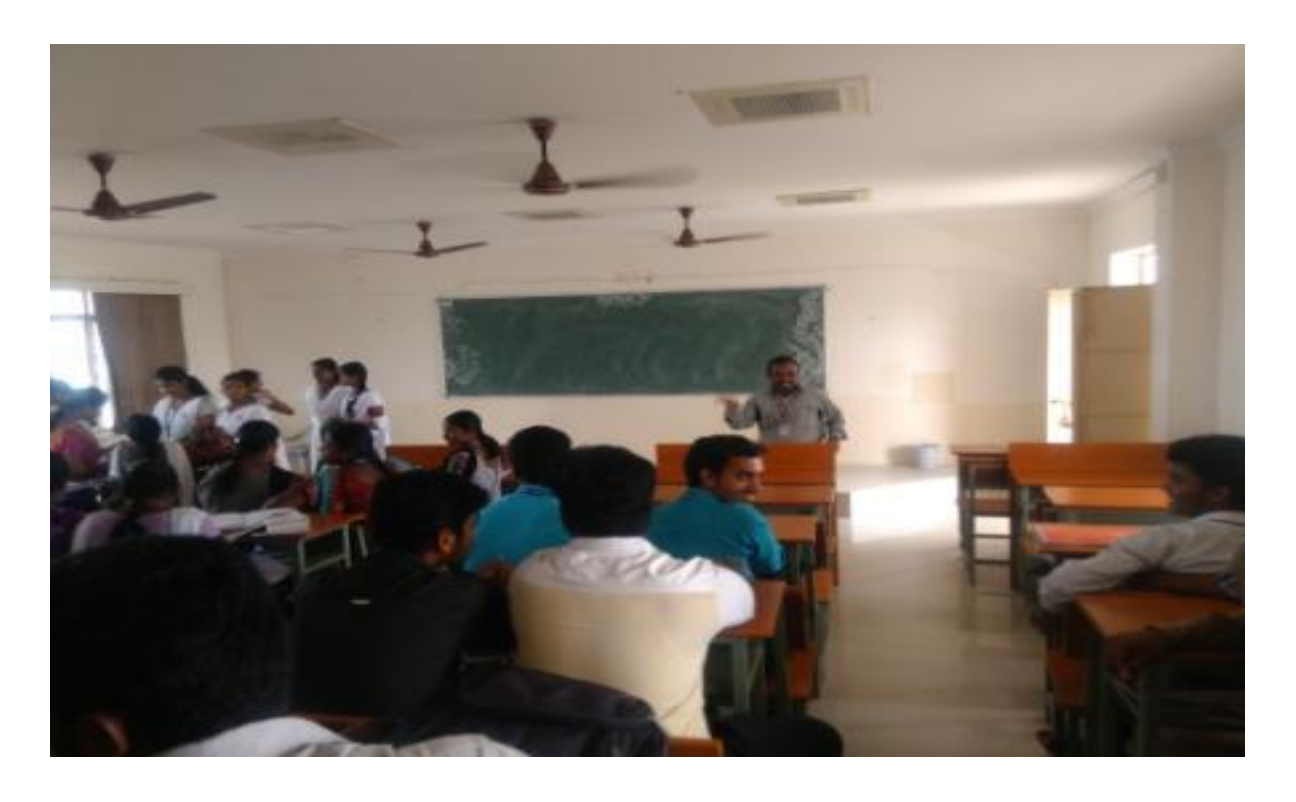
Systematic Voter Education and Electoral Participation Awareness creating and providing Voter ID Enrollment

The SVEEP activity (Systematic Voter Education and Electoral Participation) awareness created on 23.02.2019 (Thursday). We took the survey those who are not having EPIC card and awareness given them and provided Voter ID enrollment in online Tamil Nadu Elections website (http://elections.tn.gov.in). In this activity 10 volunteers helped and 180 first year students were benefitted.