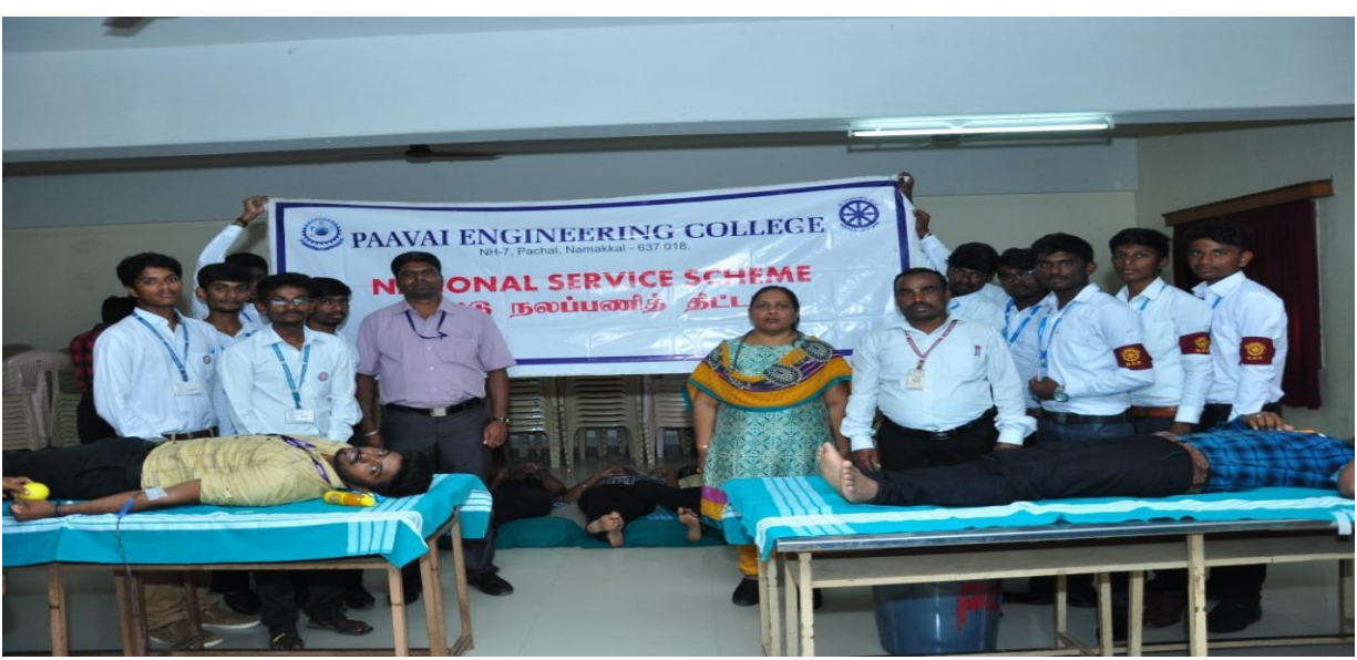
Our Volunteers and Students Donating their Blood