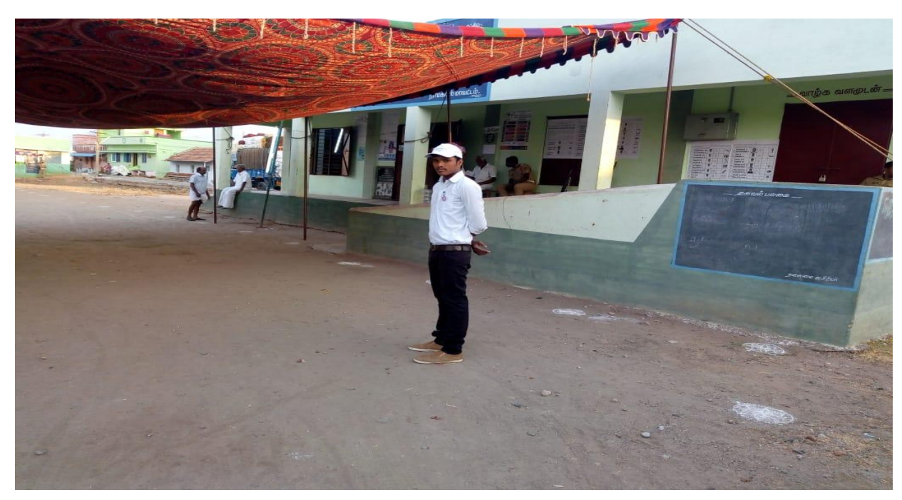
Volunteer ship in Lok Sabha Election 2019