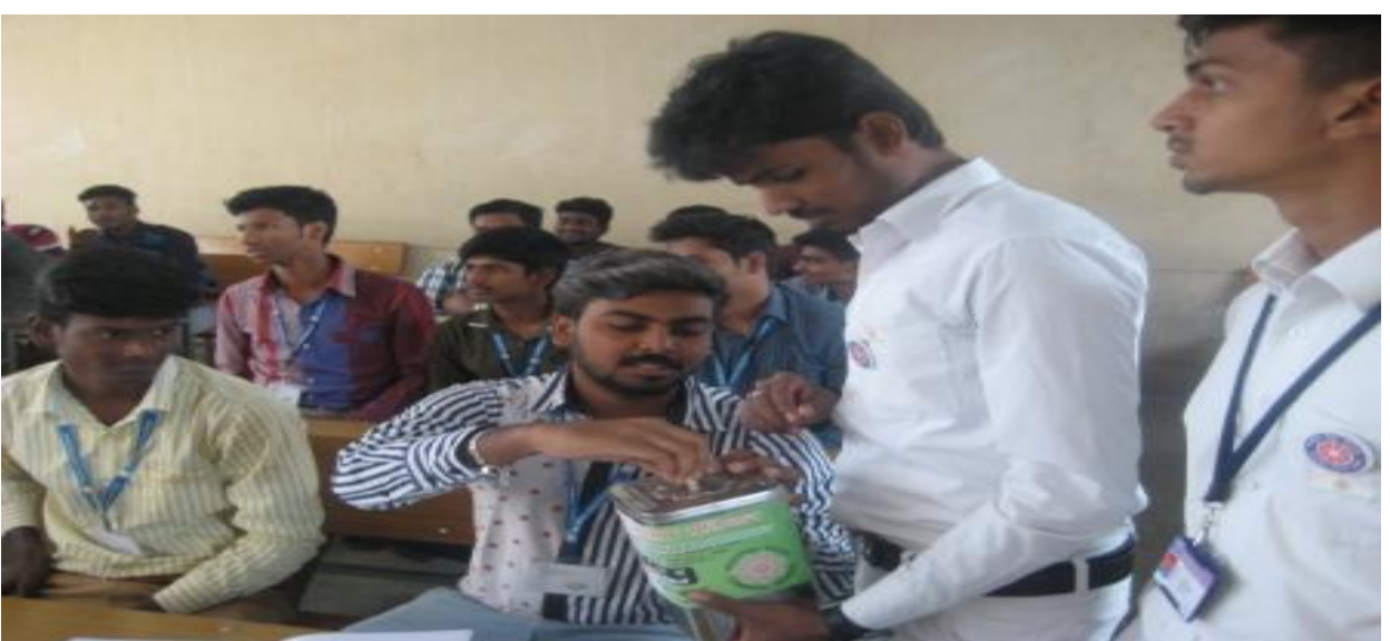
Our NSS Volunteers collecting Fund from our college Students and Staff Members