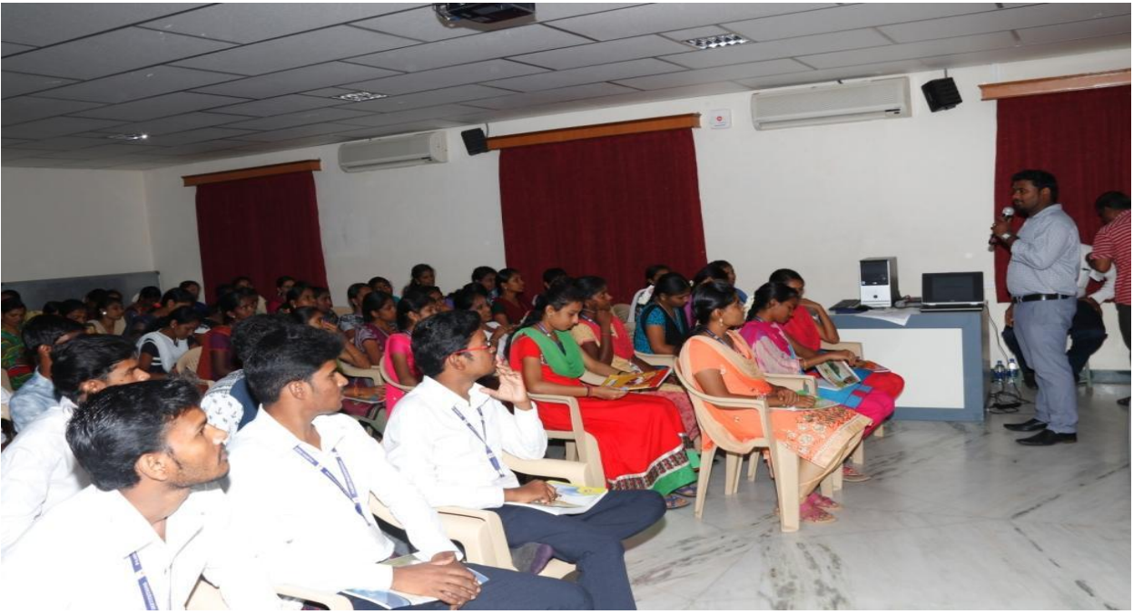
General Guide lines and Awareness given to the Students