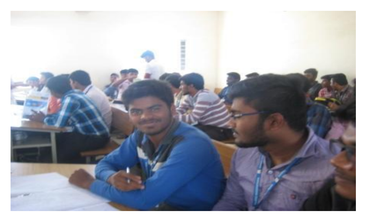
An Oratorical and Essay Writing Competition conducting for Students

In connection with creating awareness and observance of World AIDS Day, we have conducted an oratorical competition and essay writing competition on 03.12.2018 (Monday) in our college and more than 200 students were participated in these events.