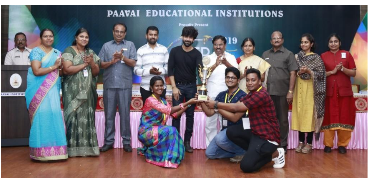
Inauguration of ASTRA-19 and Providing volunteer ship