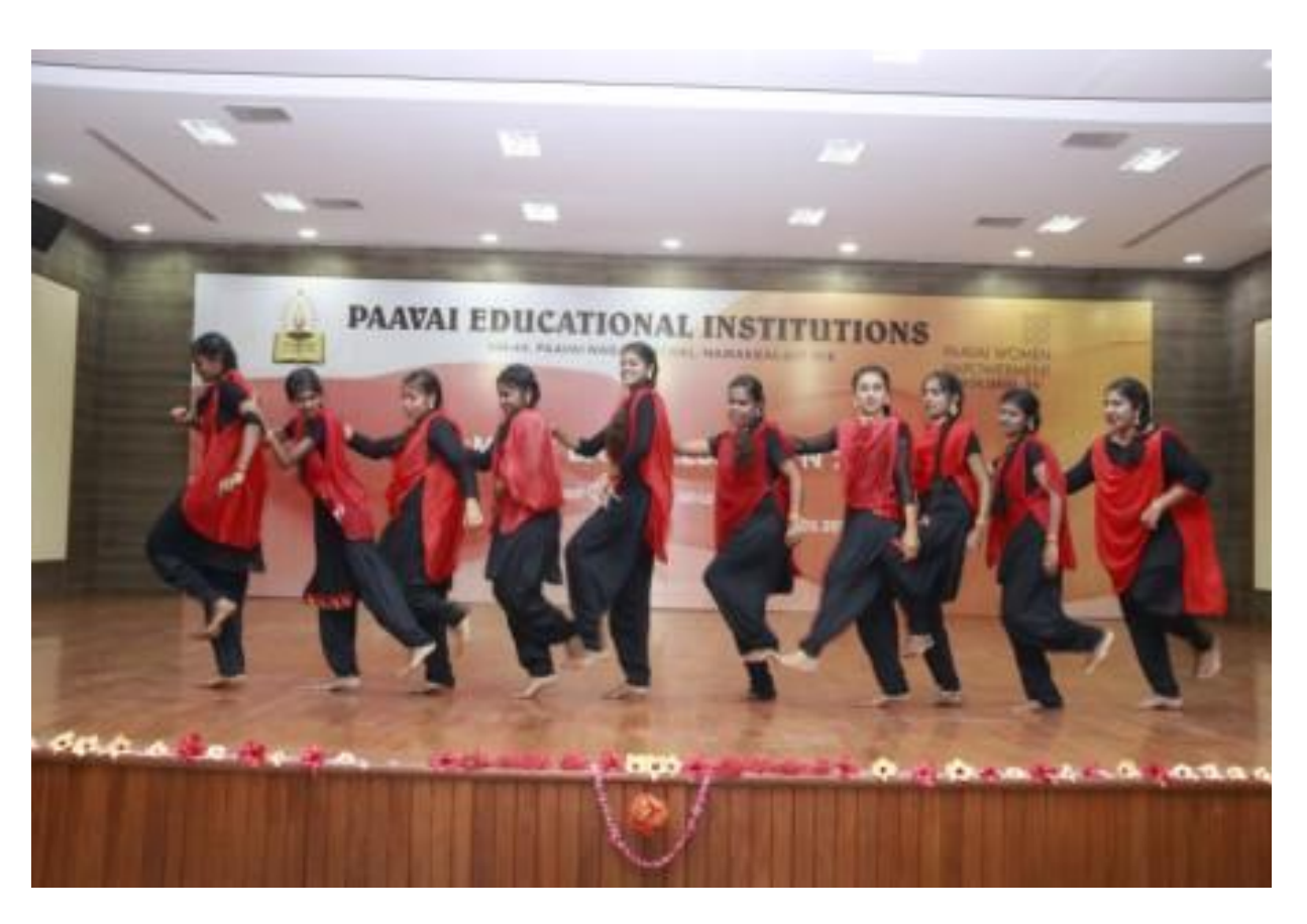
Celebrating International Women's Day