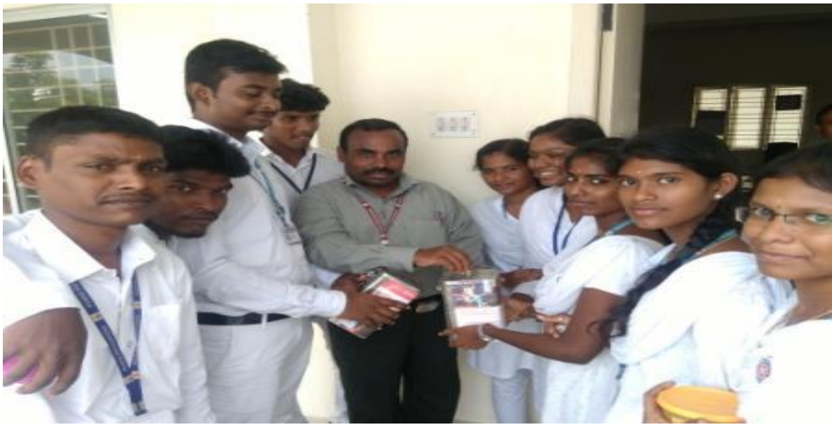
Our NSS Volunteers collecting Fund from our college Students and Staff Members