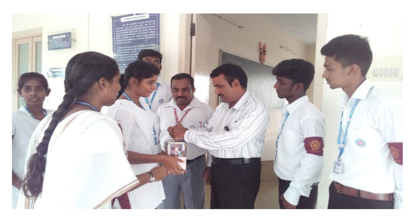
Our NSS Volunteers collecting Fund from our college Students and Staff Members