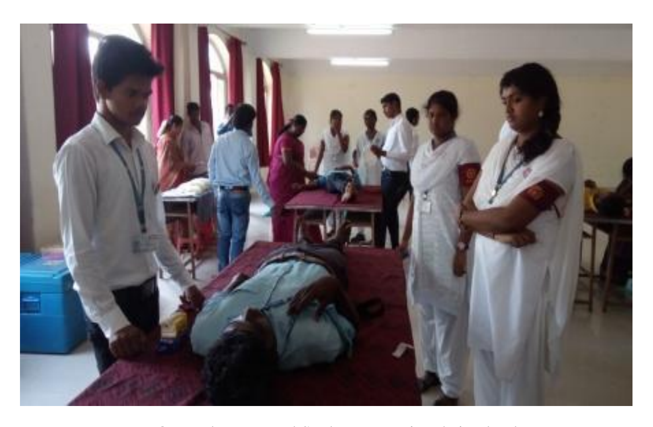
Our Volunteers and Students Donating their Blood