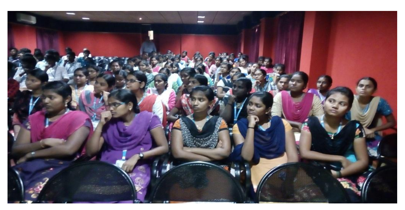
Spiritual Awakening given to the students