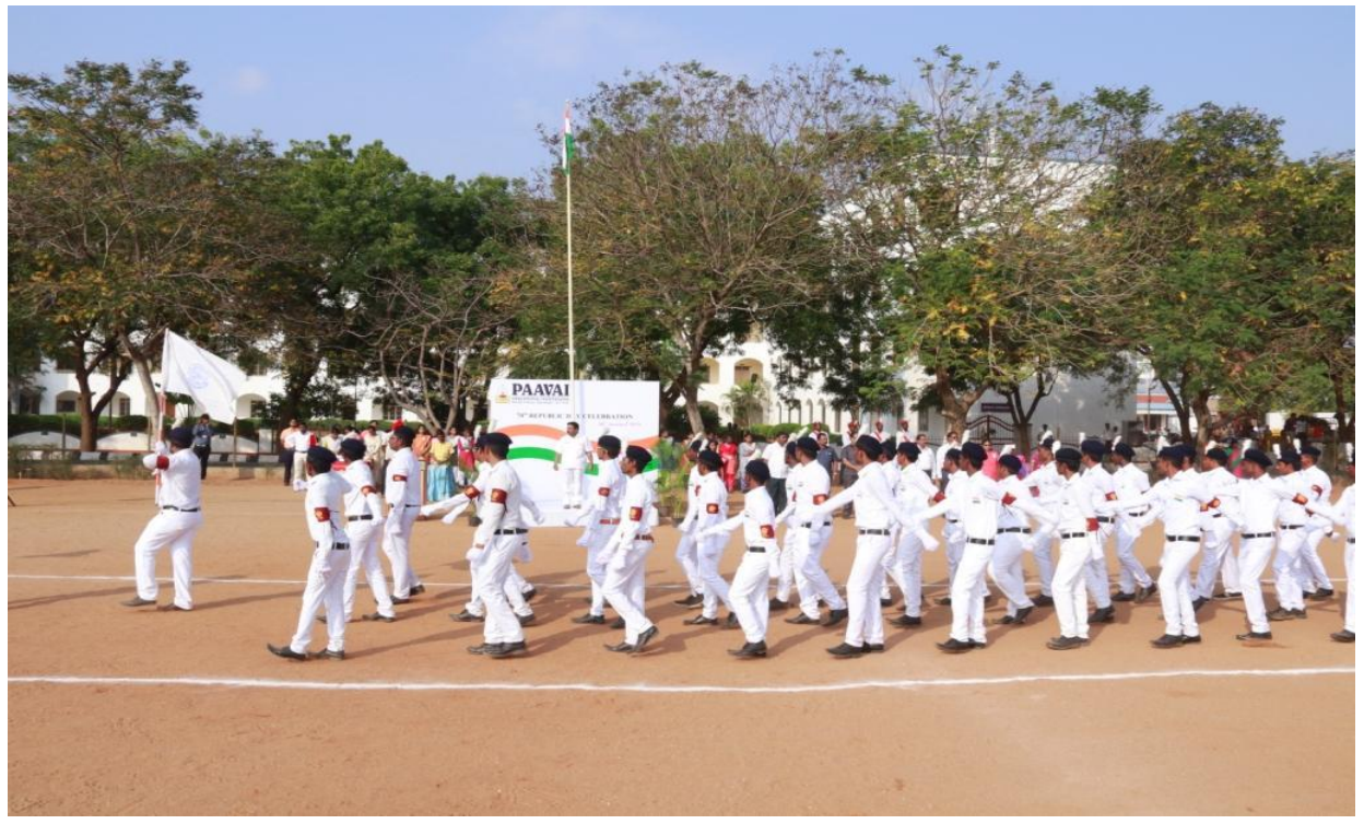
Our students participating in the march past in the Republic Day Celebration