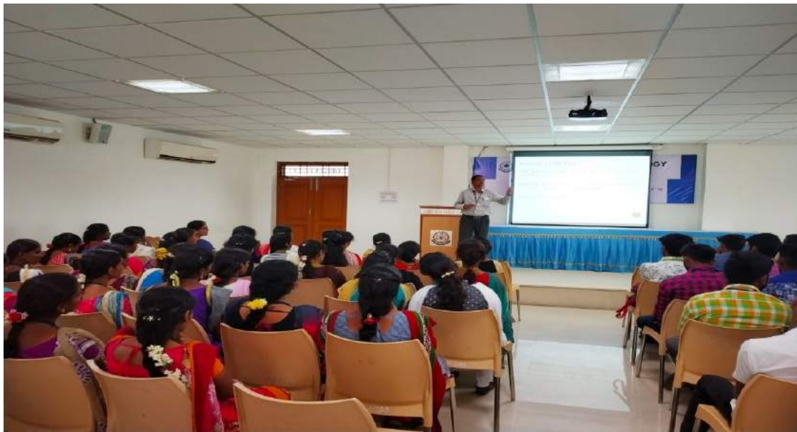
General Guide lines and Awareness given to Students