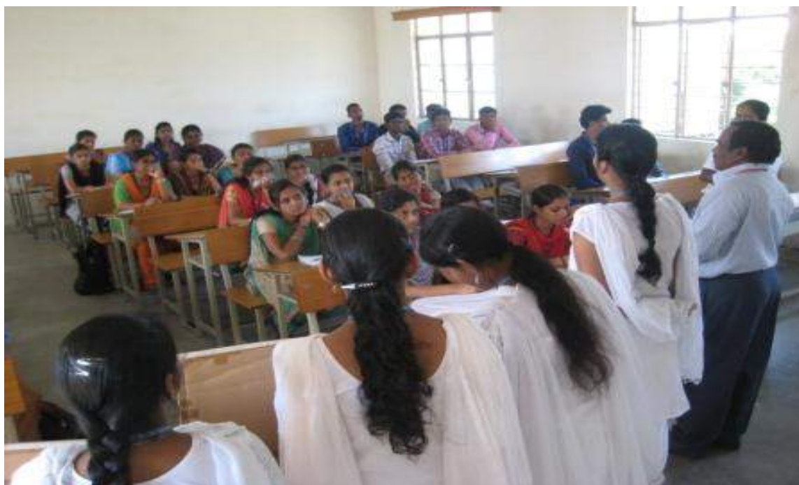
An Oratorical and Essay writing competition conducted for Students

In connection with creating awareness and observance of World AIDS Day, we have conducted an oratorical competition and essay writing competition on 02.12.2019 (Monday) in our college and more than 200 students were participated in these events.