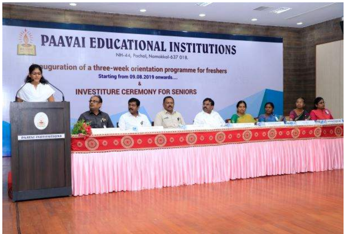
Prayer Song and Welcome address by our students