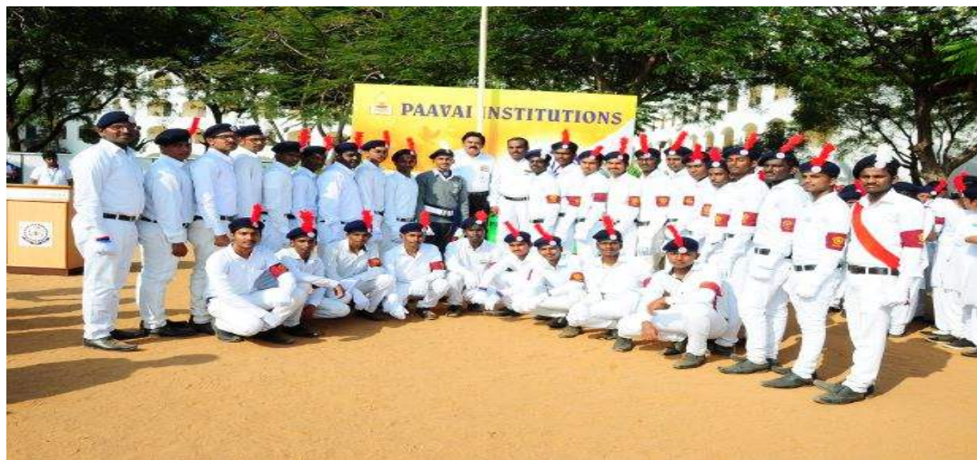
Our volunteers and students receiving Award and Appreciation certificates in Republic Day Celebration