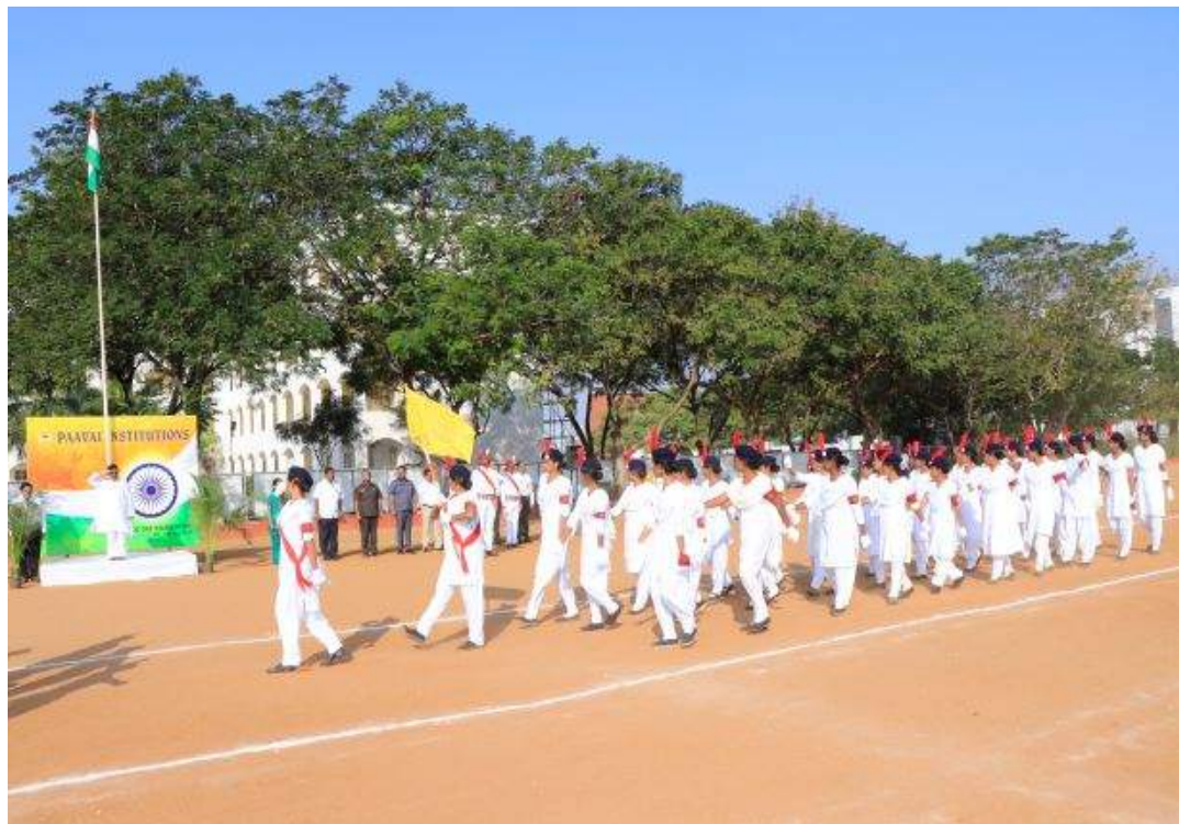
Our students participating in the march past in the Republic Day Celebration