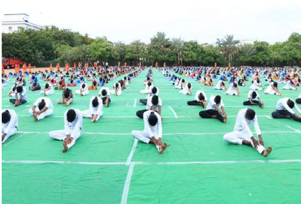
Students performing the fundamental Asanas in Yoga