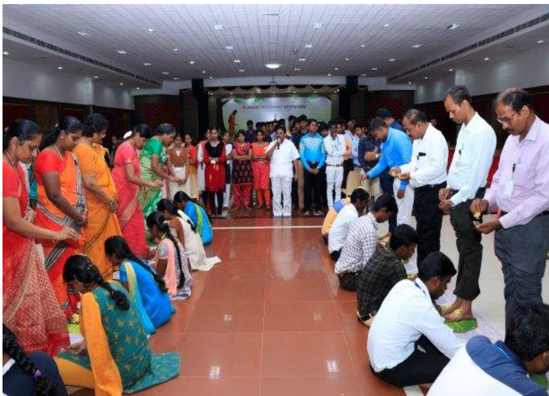
Our students doing Patha Pooja for Teachers