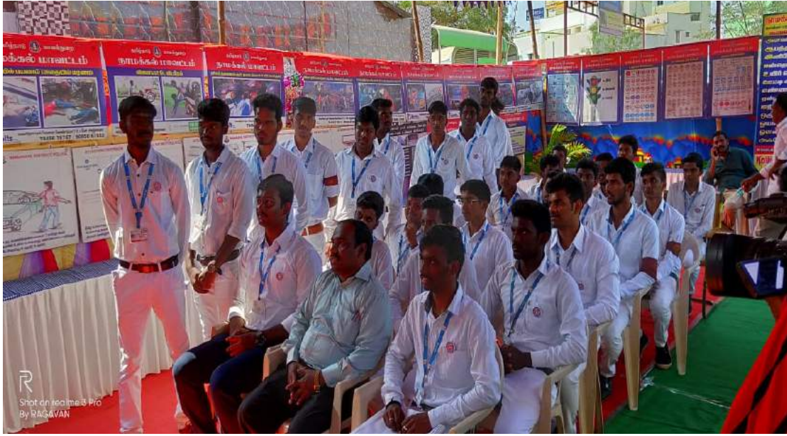
Our Volunteers participating Road safety Awareness programme