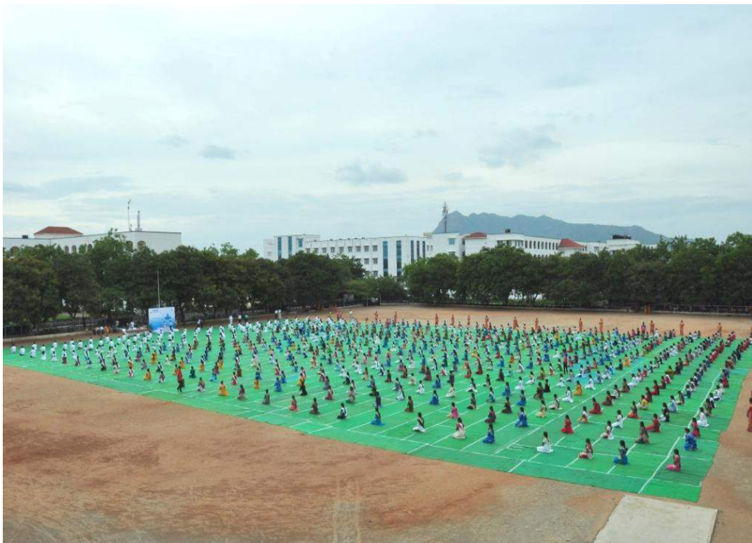
Students performing the fundamental Asanas in Yoga