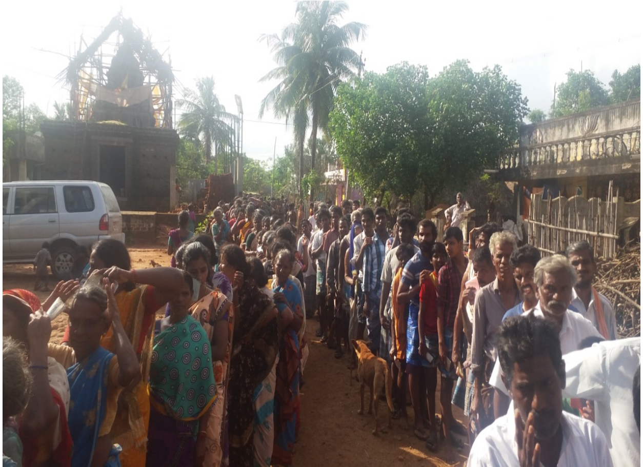
The contributed materials we were issued to the KilaKuppam village people in Cuddalore District.