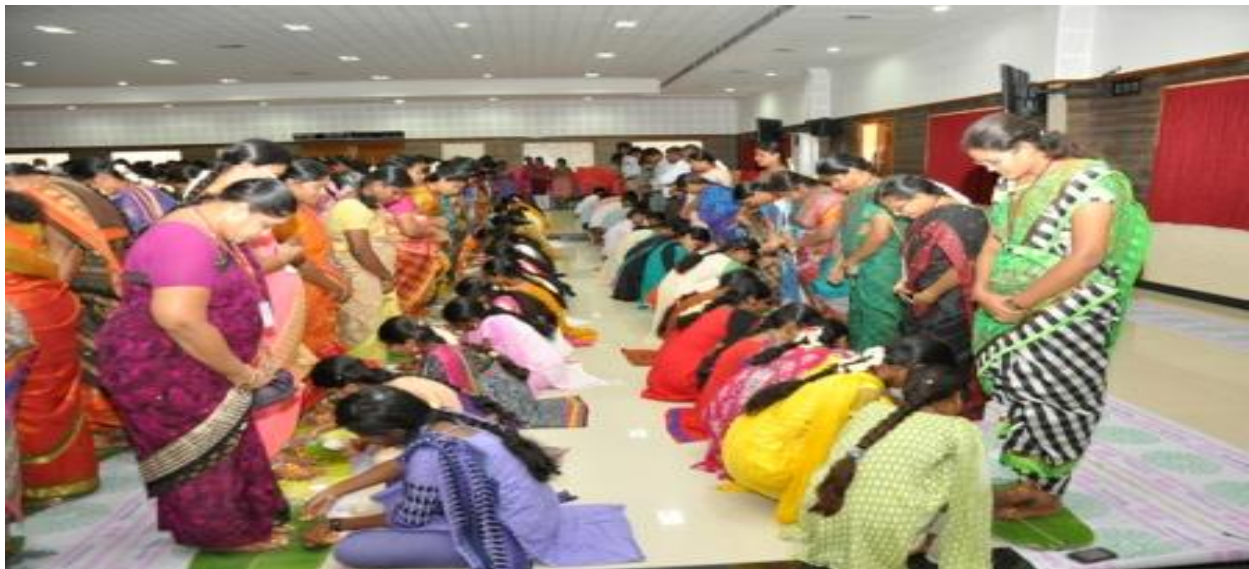
Our students doing Patha Pooja for Teachers