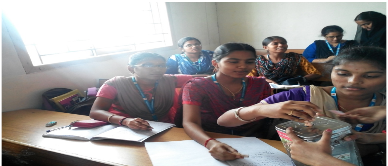
Our students contributing the amount for Flag-Day Celebration