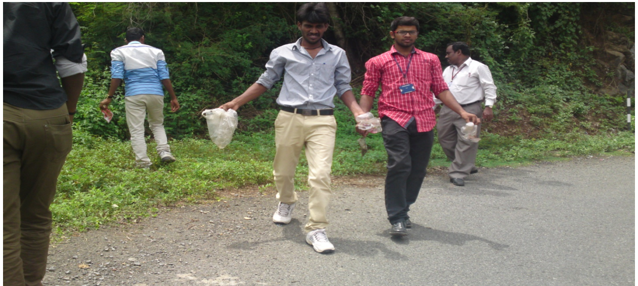
Our Volunteers Removing Polythene bags and Plastic bottles in the Kolli Hills