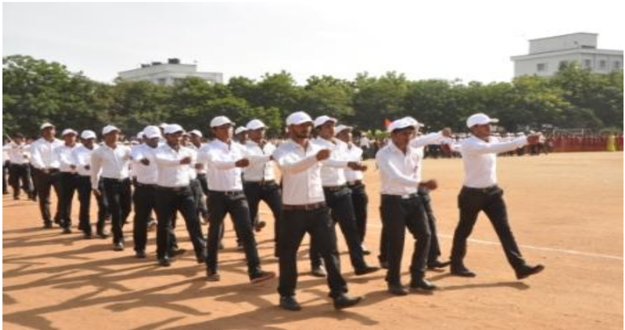
Our students participating in the march past in the Independence Day Celebration