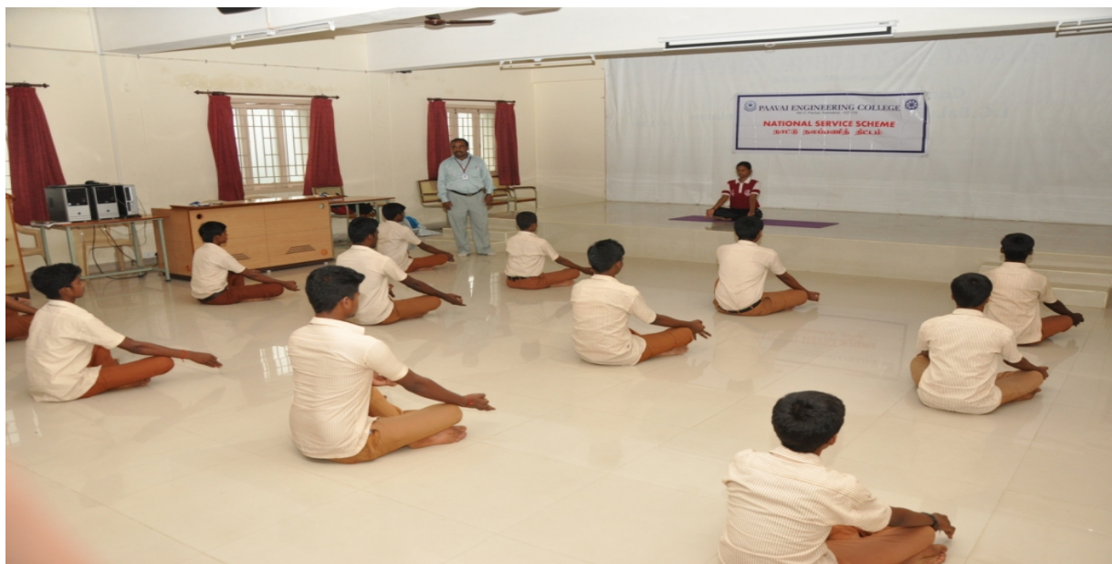
Our students performing the various Yoga- Asanas