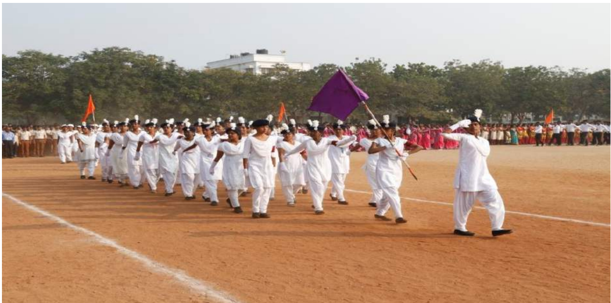
Our students participating in the march past in the Republic Day Celebration