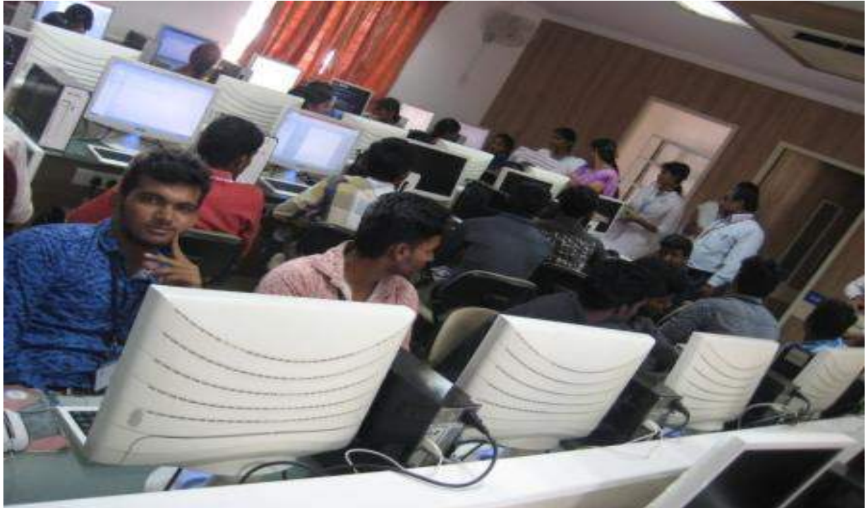
An Oratorical and Essay writing competition conducted for Students

In connection with creating awareness and observance of World AIDS Day, we have conducted an oratorical competition and essay writing competition on 01.12.2017 (Friday) in our college and more than 200 students were participated in these events.