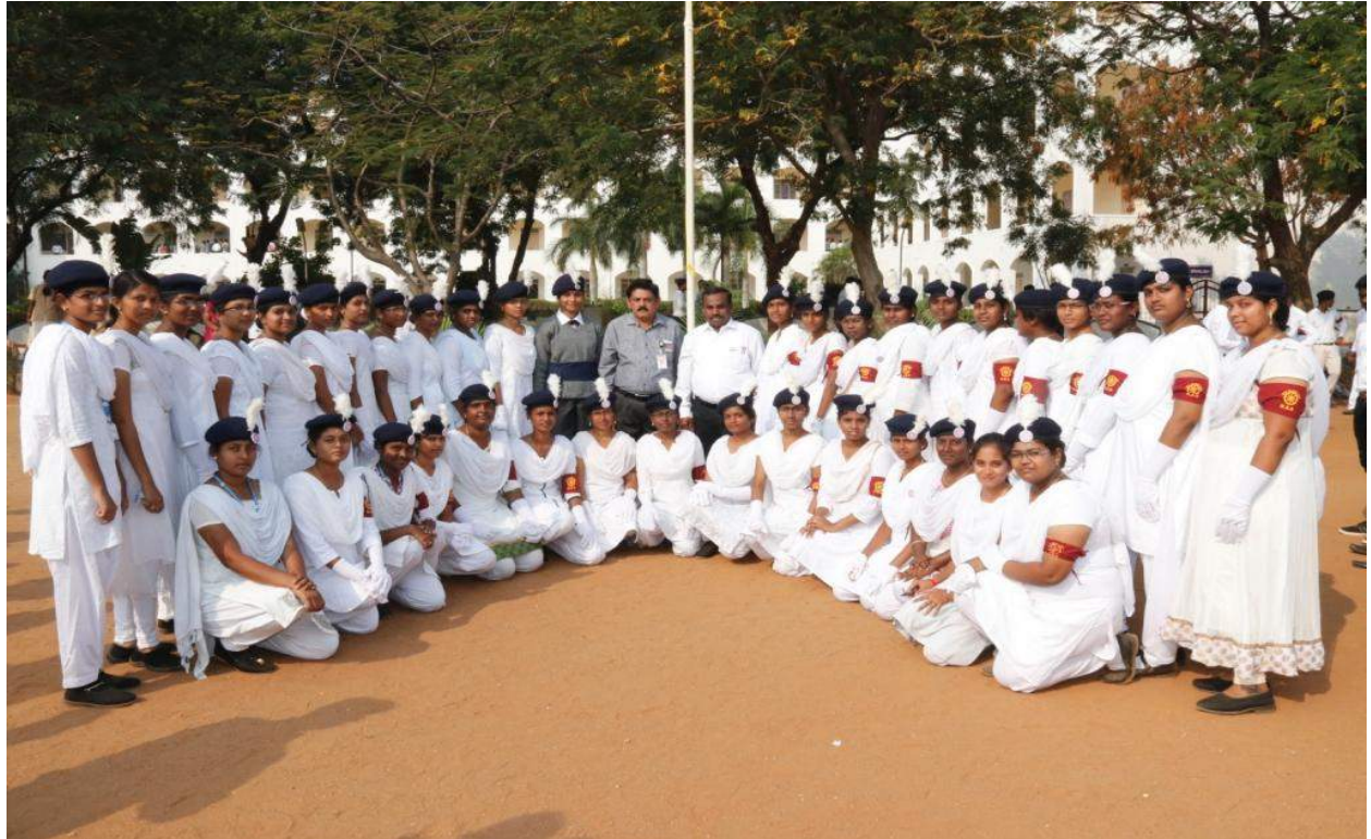
Our volunteers and students receiving Award and Appreciation certificates in Republic Day Celebration