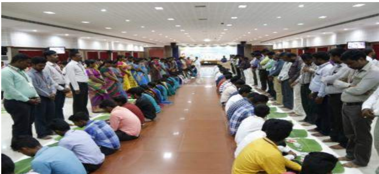
Our students doing Patha Pooja for Teachers