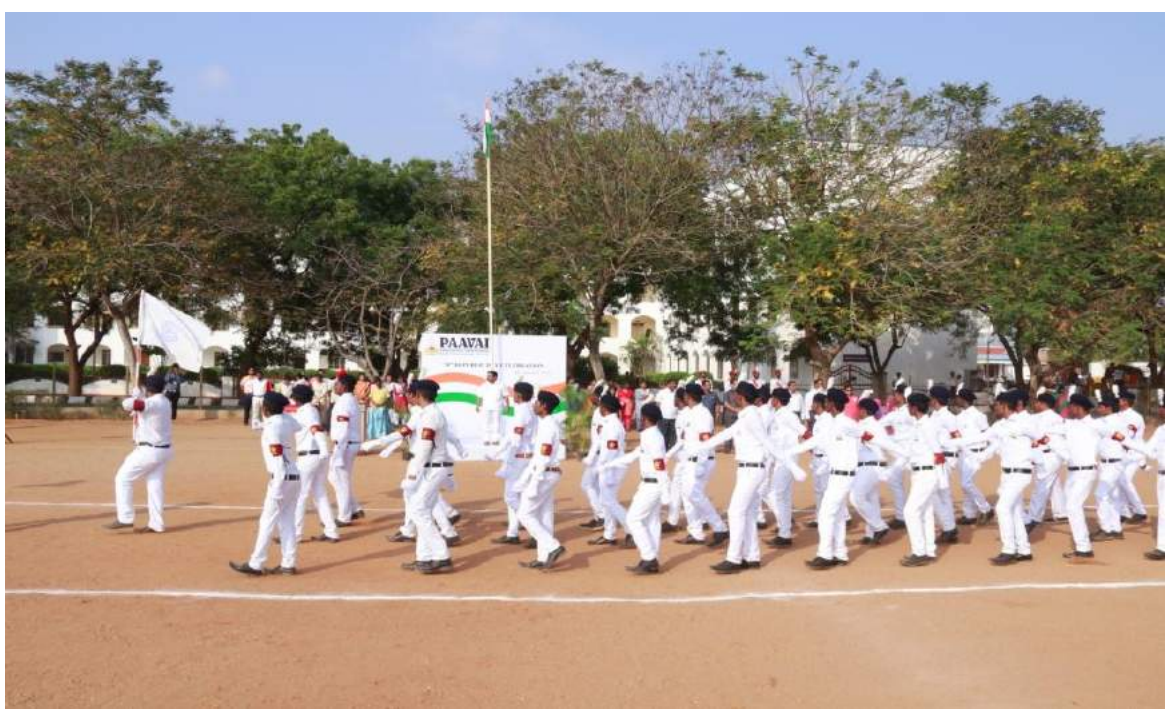
Ourstudents participating in the march past in the Republic Day Celebration