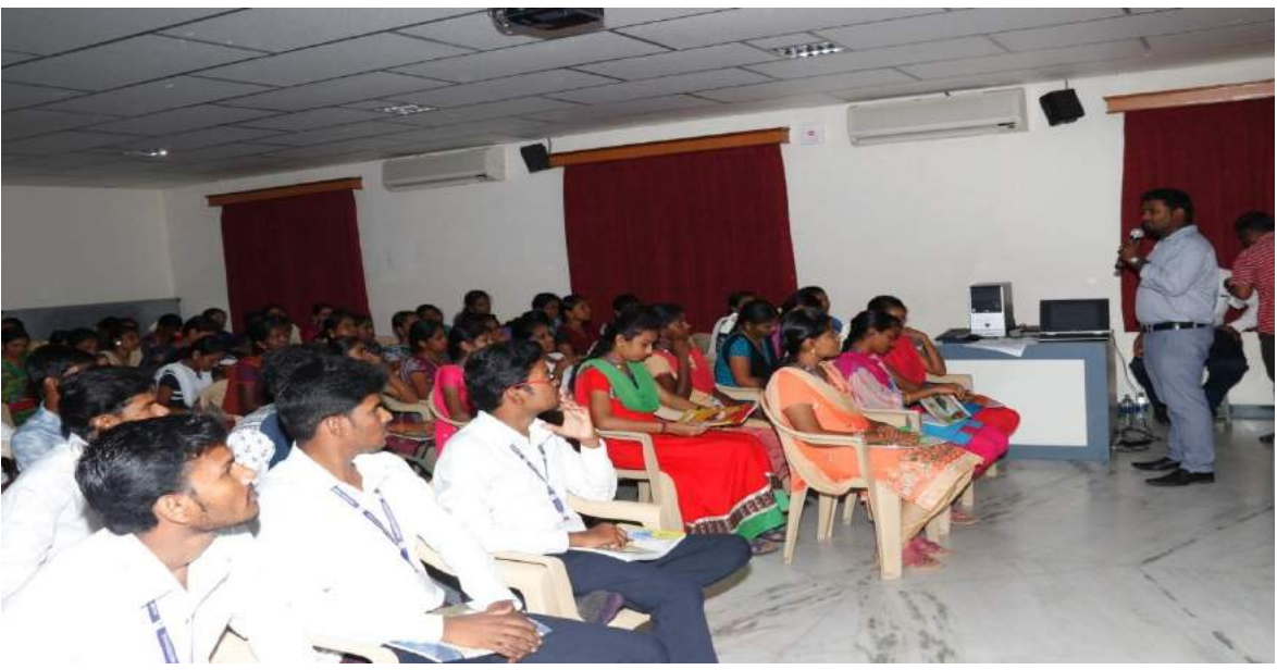
General Guide lines and Awareness given to the Students