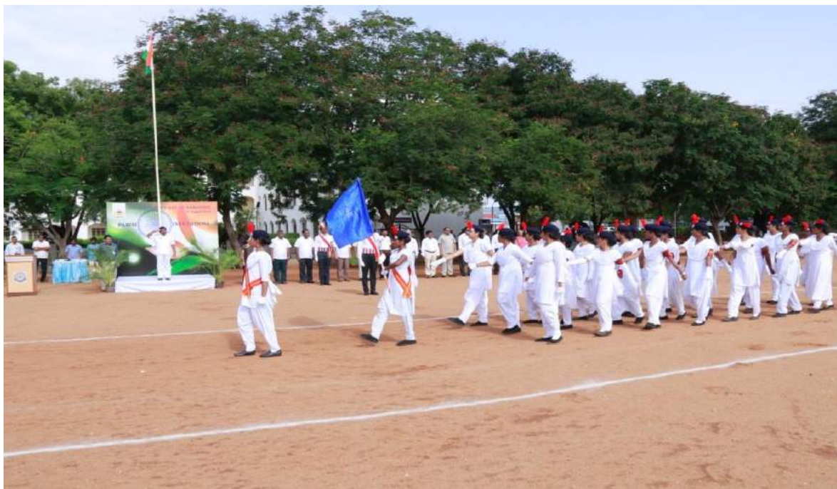
Ourstudents participating in the march past in the Independence Day Celebration