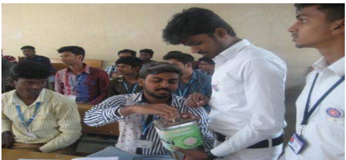
Our NSS Volunteers collecting Fund from our college Students and Staff Members