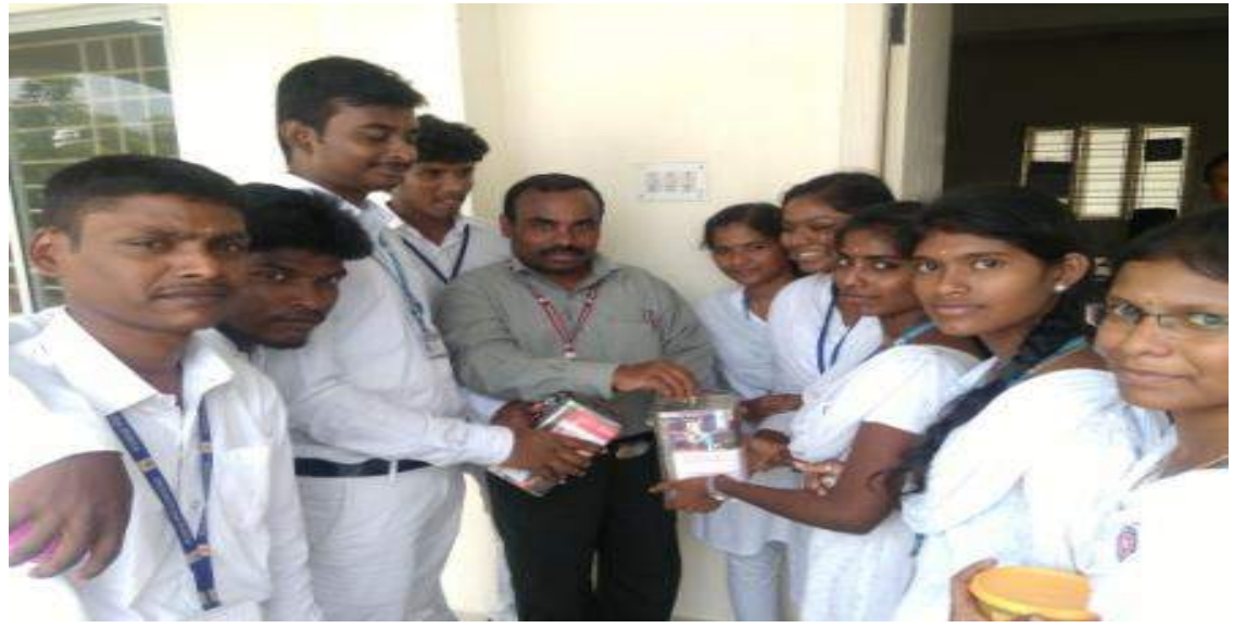
Our NSS Volunteers collecting Fund from our college Students and Staff Members