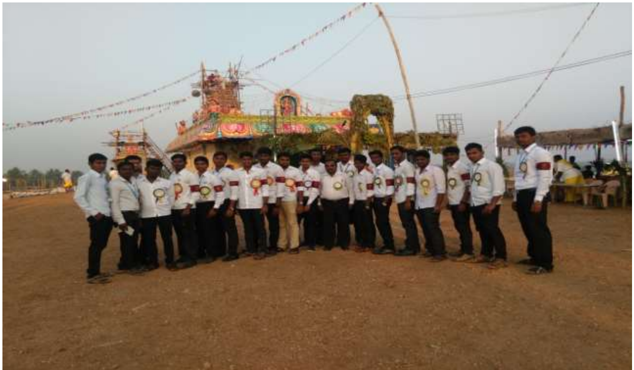
Outstanding work by our students