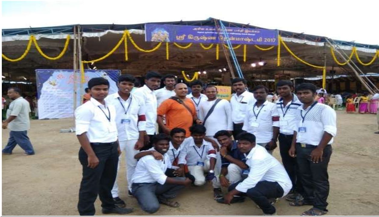
Glorious job done by our students