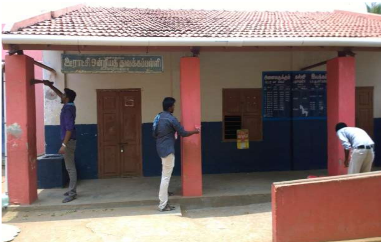
Glimpses of students at service to society