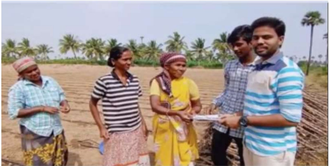
Say no to plastics- by our students