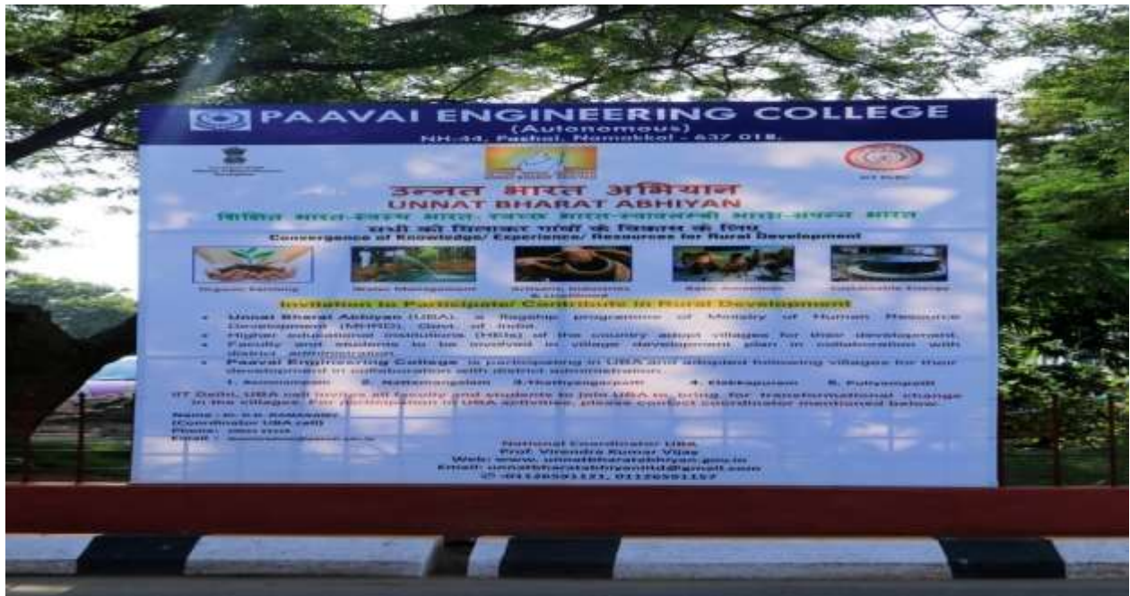
Mission on clean India