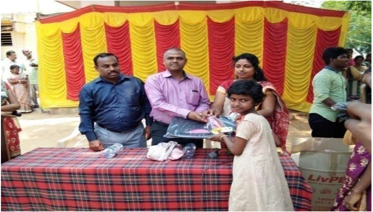
Sublime contribution to educational cause by our college