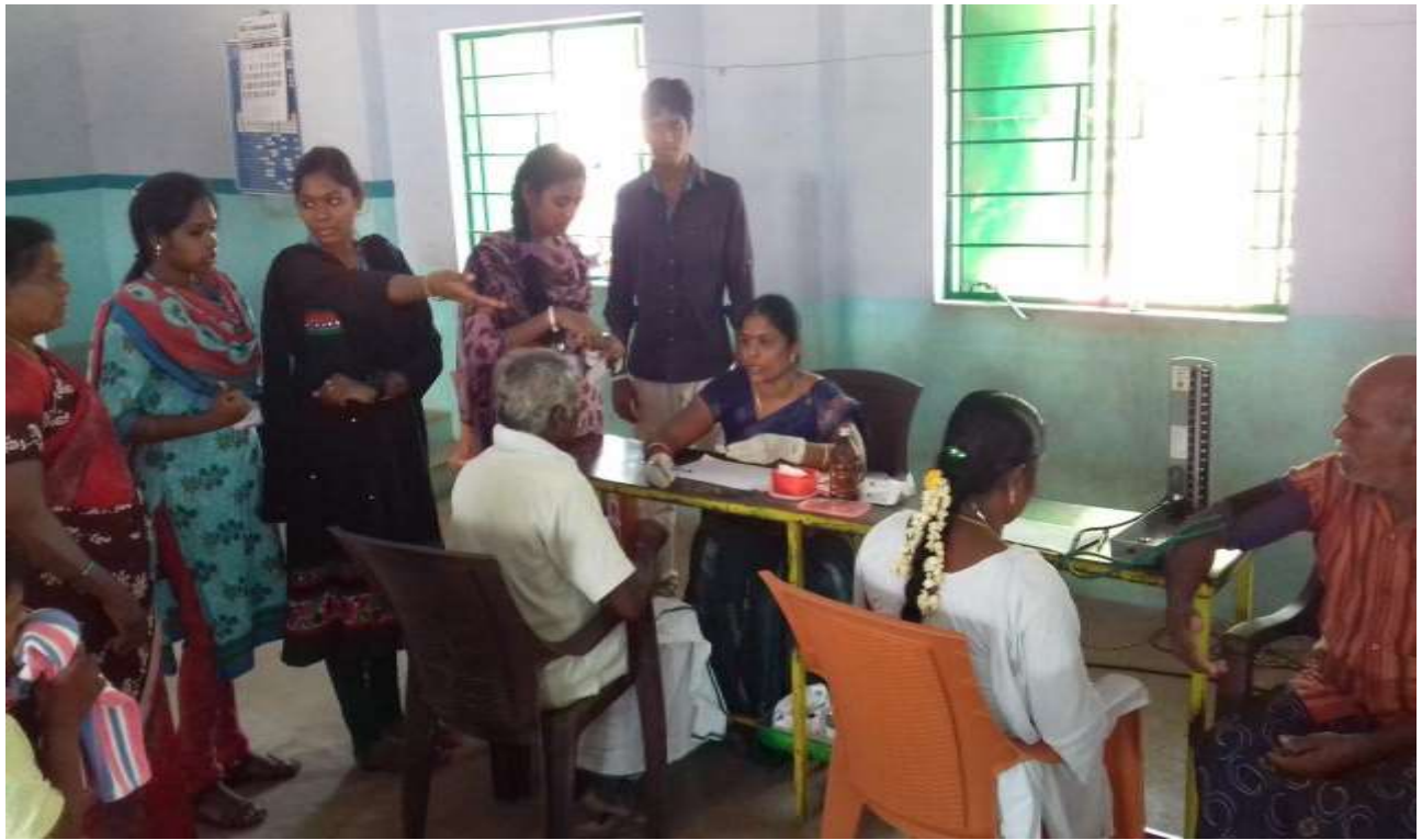
Medicare by our students