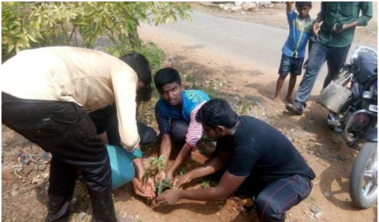
Wonderful sight of plantation by our students