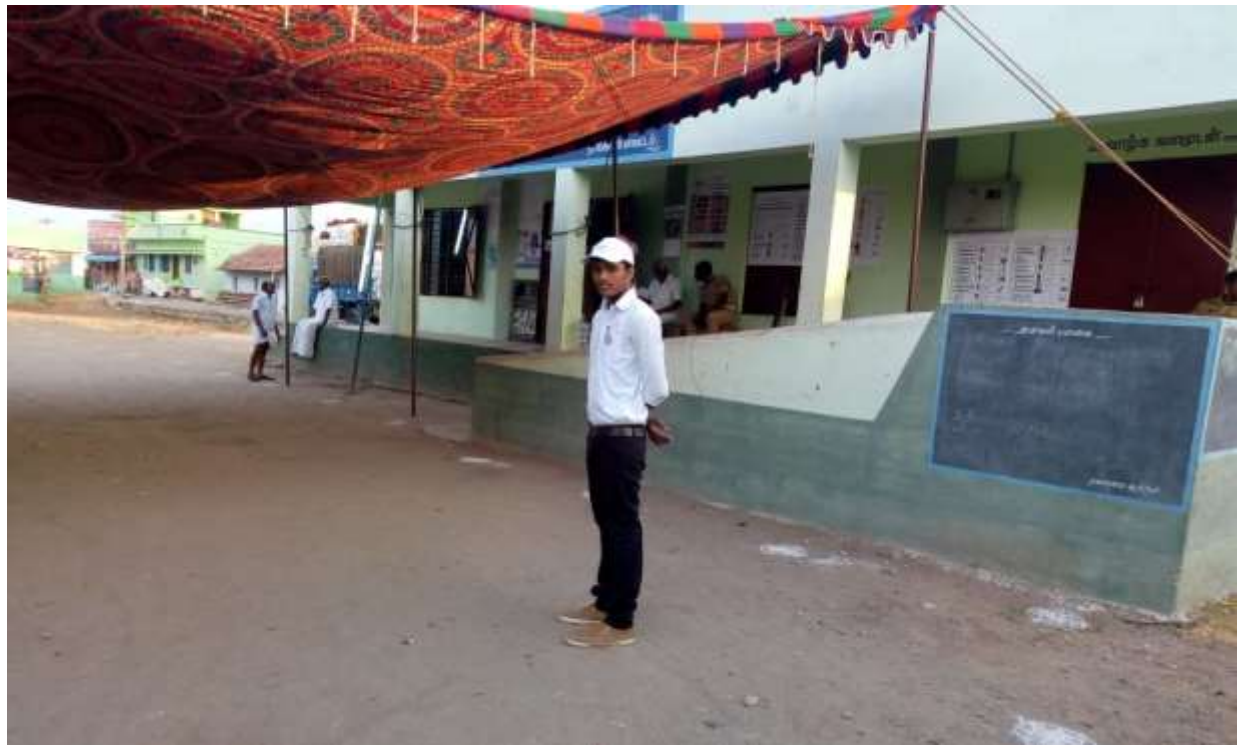
A Student at societal responsibility