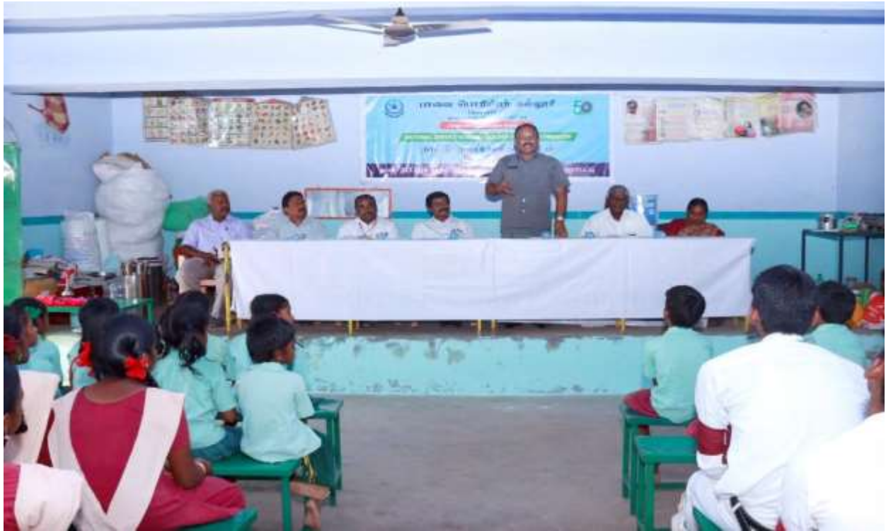
Captivating talk by our director