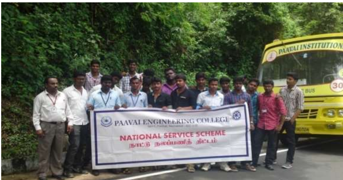
Mission on cleaning the society