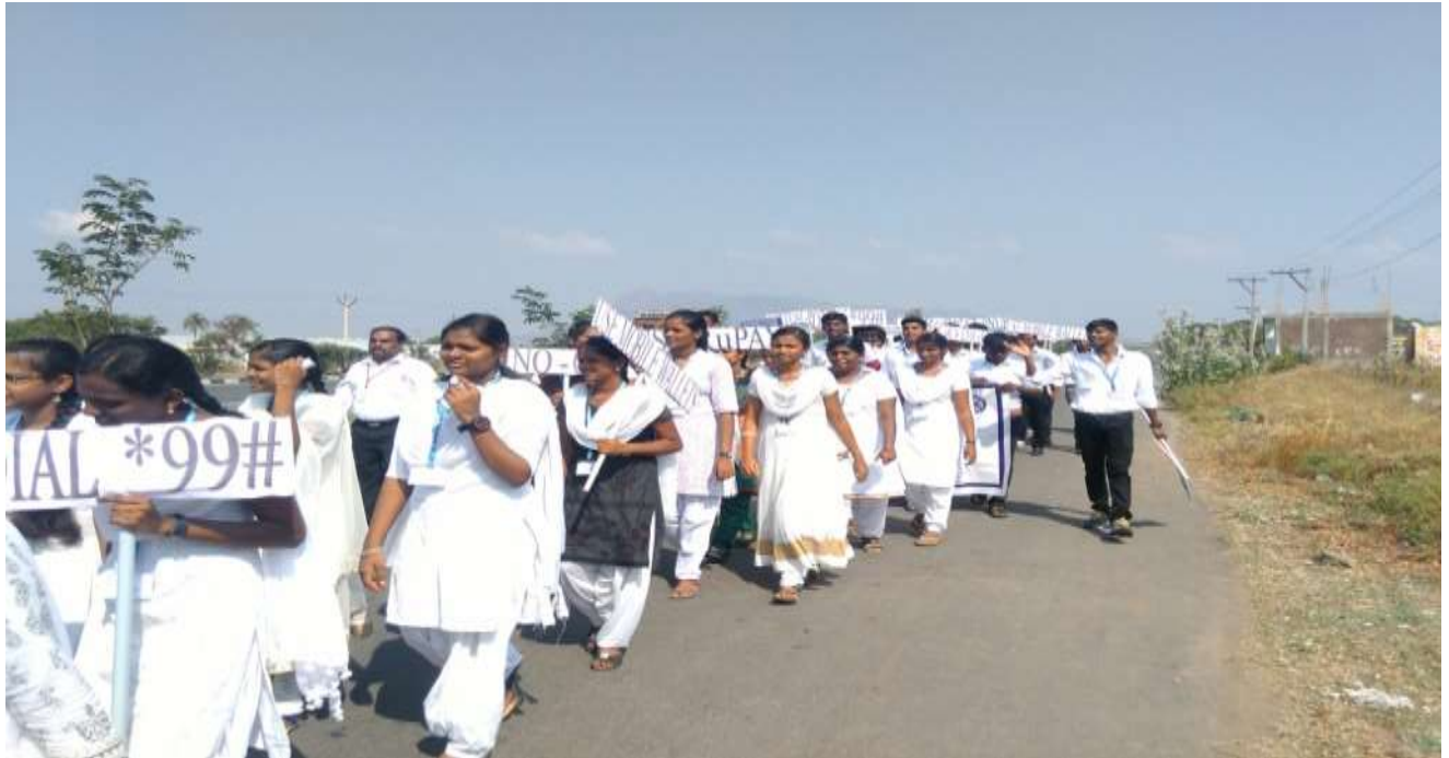
Sight of students at digital economy campaign