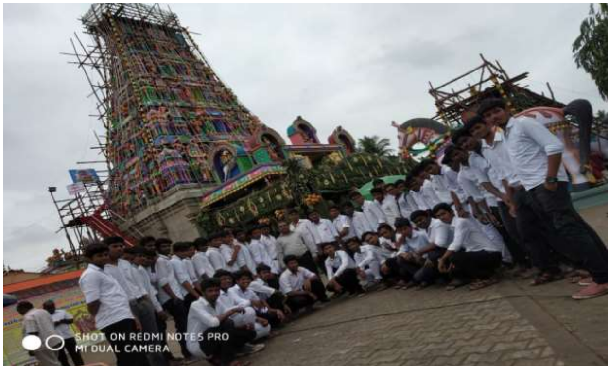
Sight of Inherent Divinity