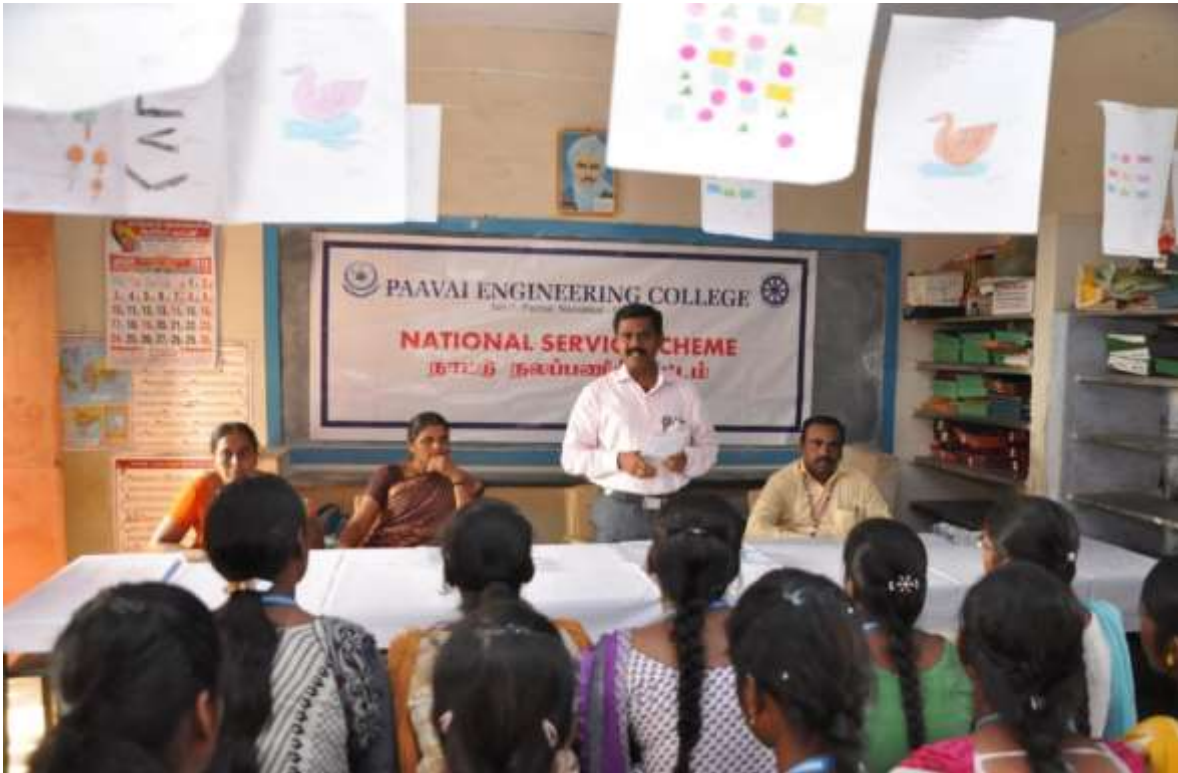
Exhilarating speech on youth empowerment