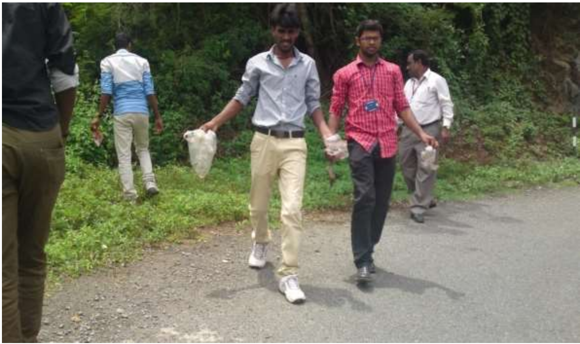
Students at Swachh Bharat Mission