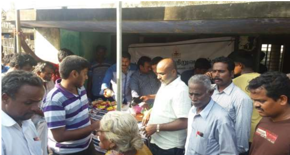
Students participate in disaster management activity