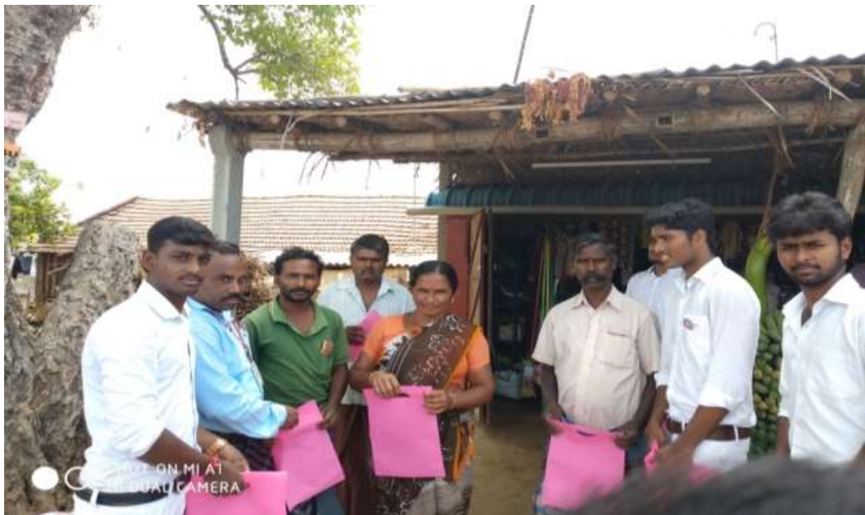
Providing cloth bag to local people by our students