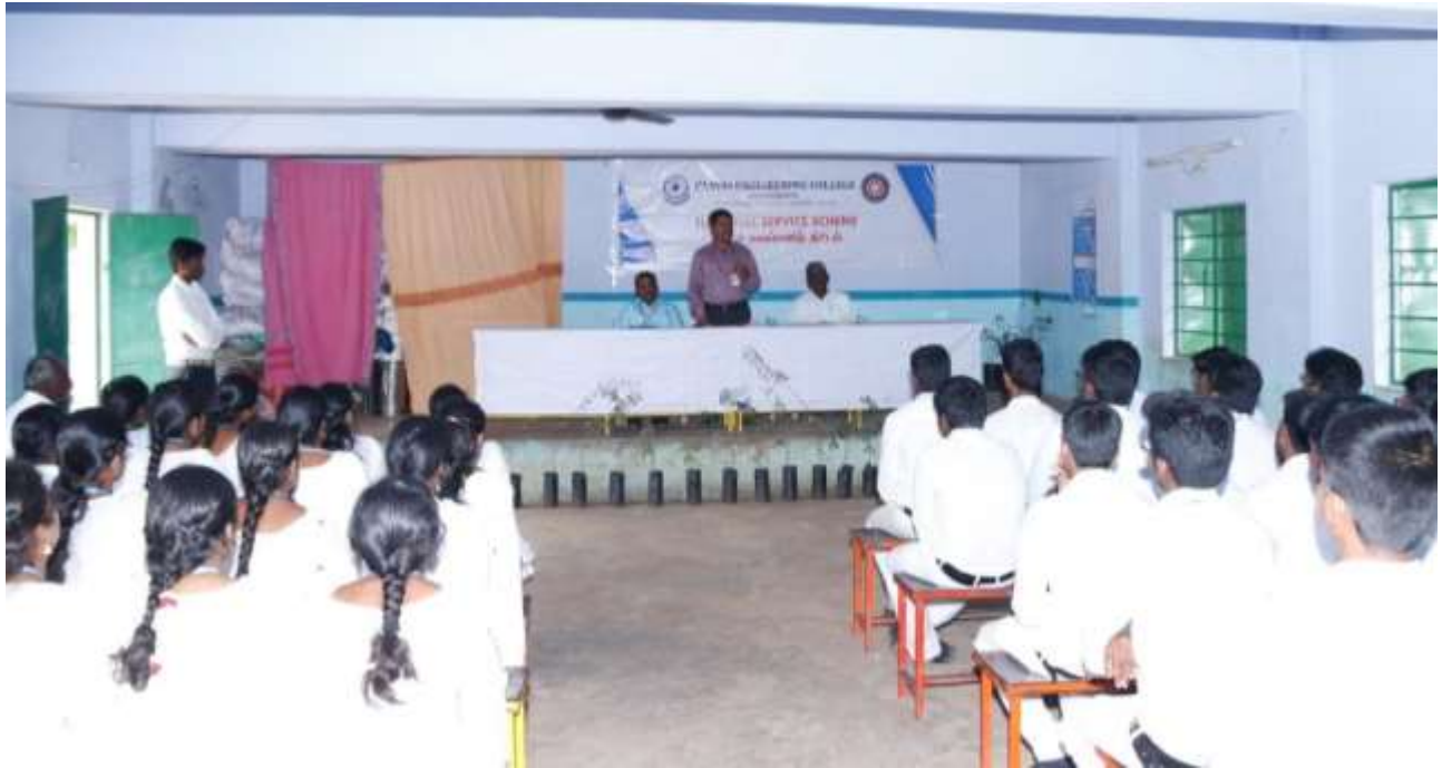
Educare - magnificent talk by our Principal