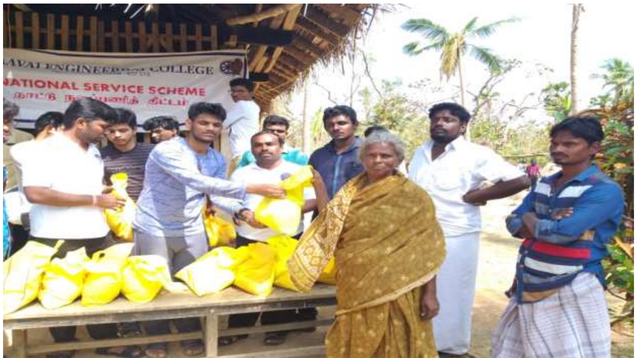
Offering the needy- notable work by our students and staff