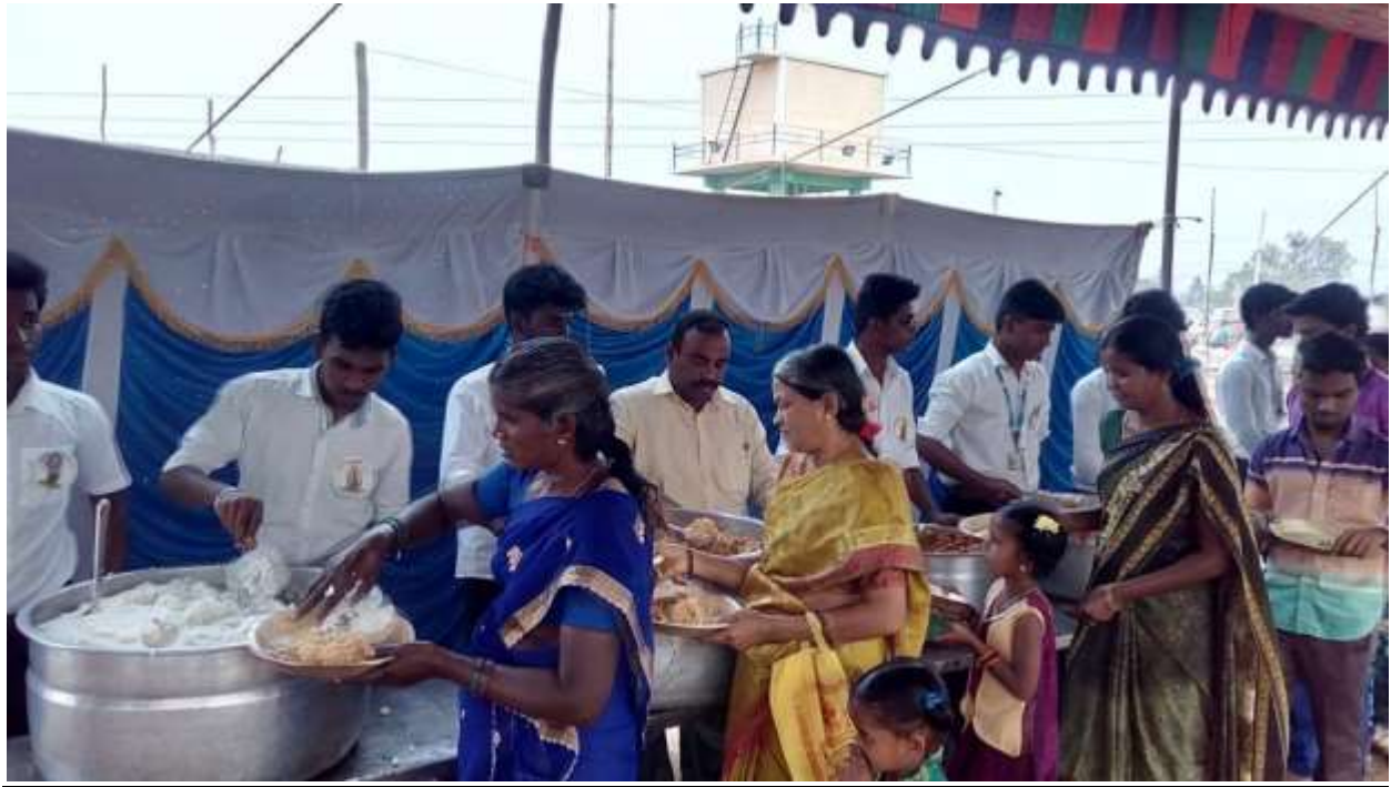
Service to humanity- at a glimpse