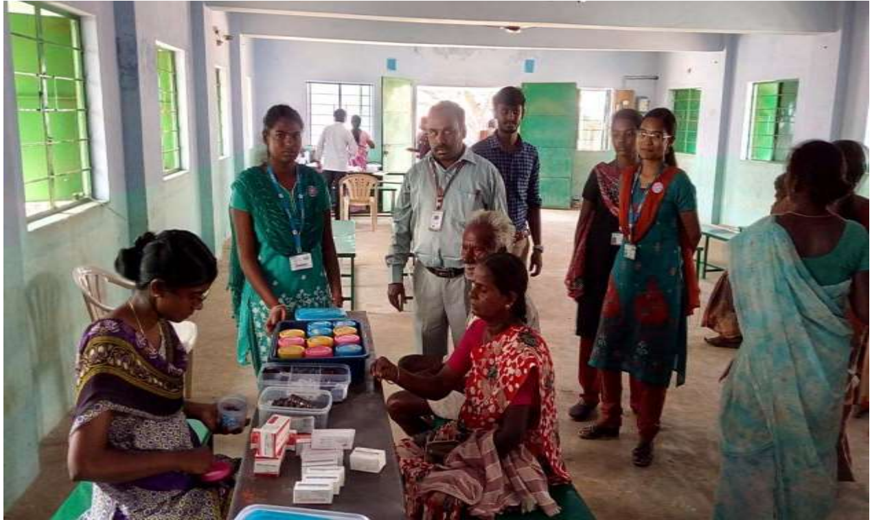
Medicare - Educare by our students