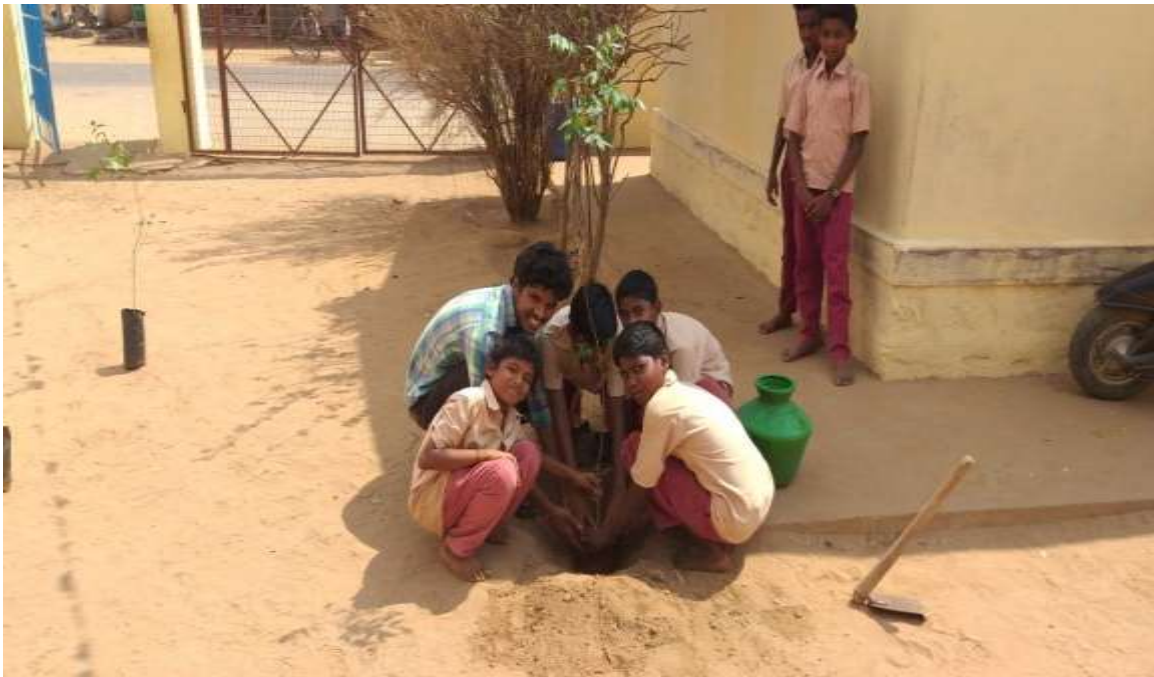
Plant trees to plant future