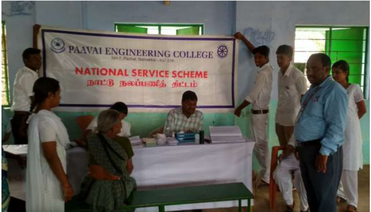
Volunteering at medical camp