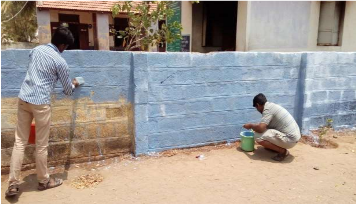
Valuable sight of painting school wall by our students