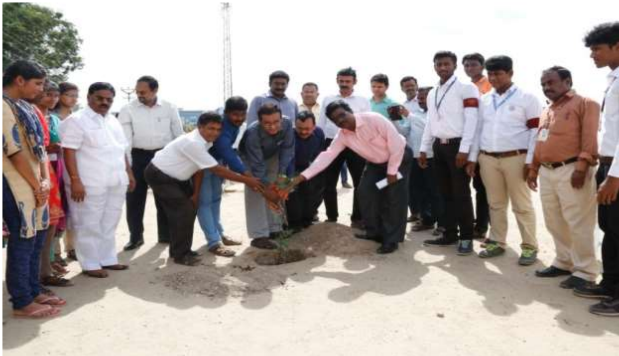
Each one plant one