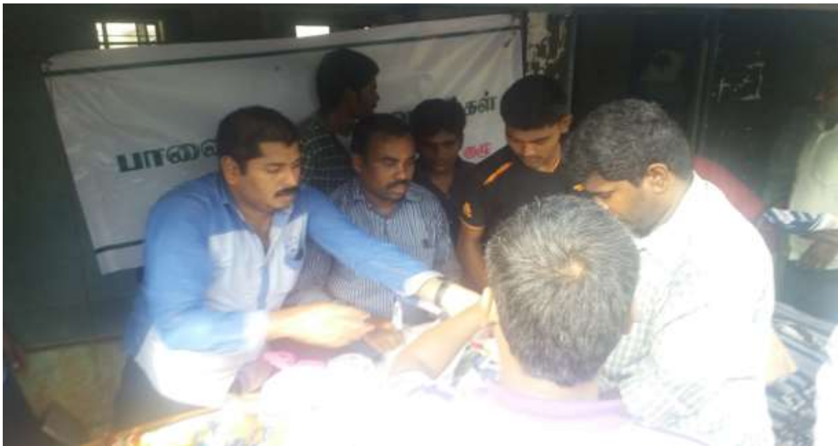
Collecting relief fund from the society