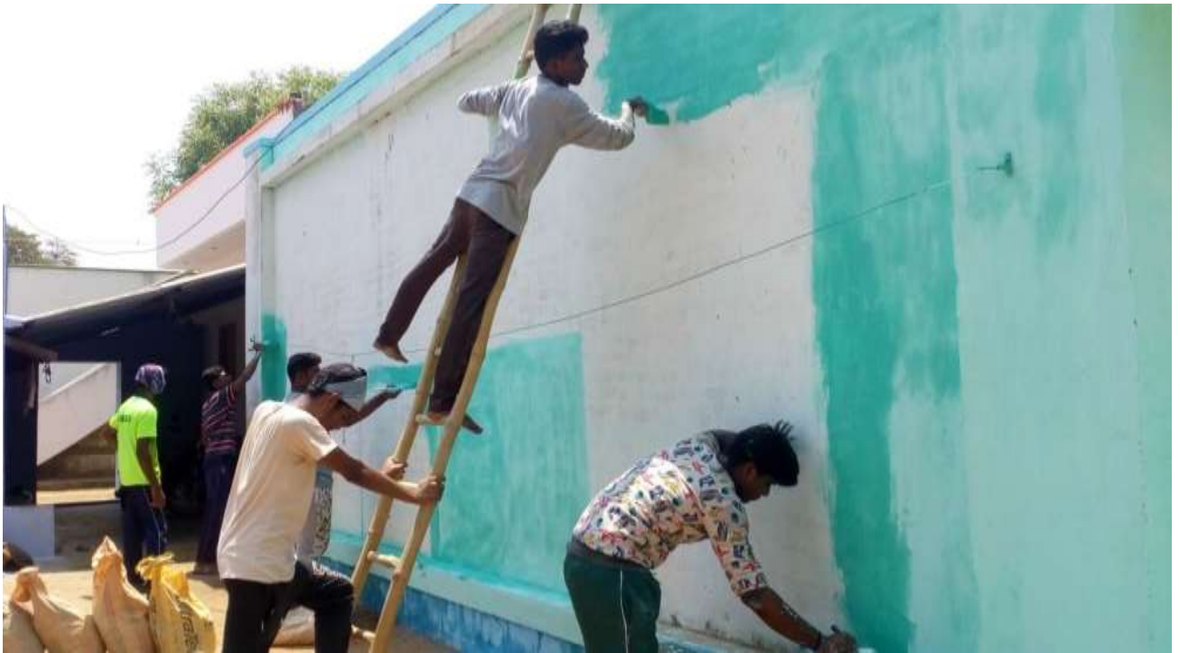
Colouring the wall to be more colourful in future