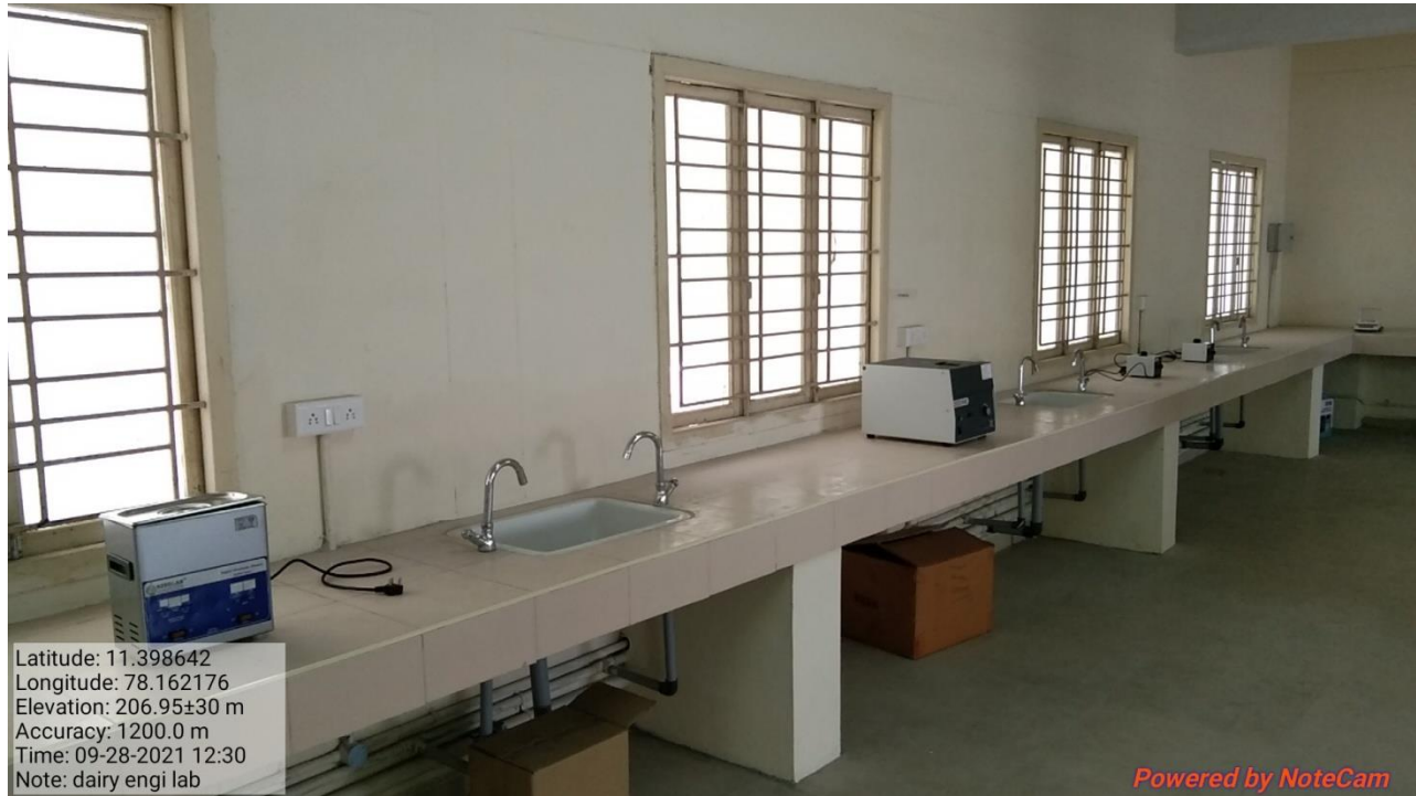
Dairy Engineering Lab