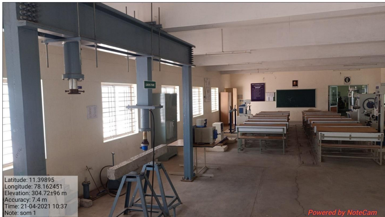
Advanced Structural Engineering Laboratory