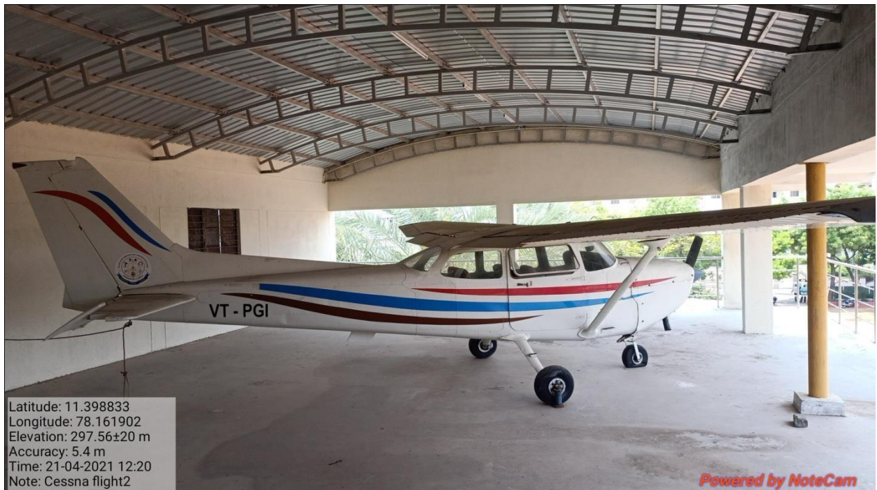
Cessna 172 Aircraft