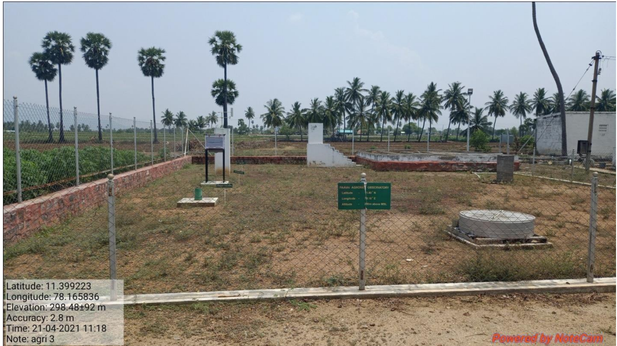
Agricultural Meteorology Laboratory