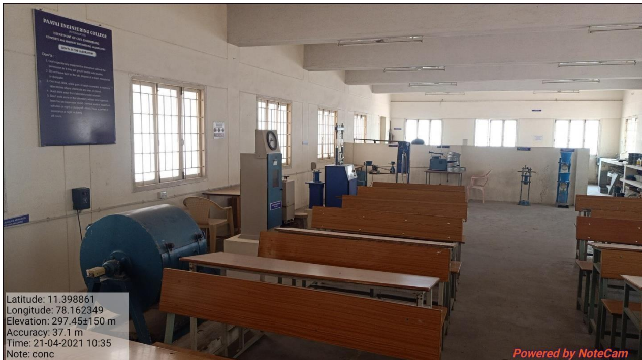
Concrete & Highway Engineering Laboratory