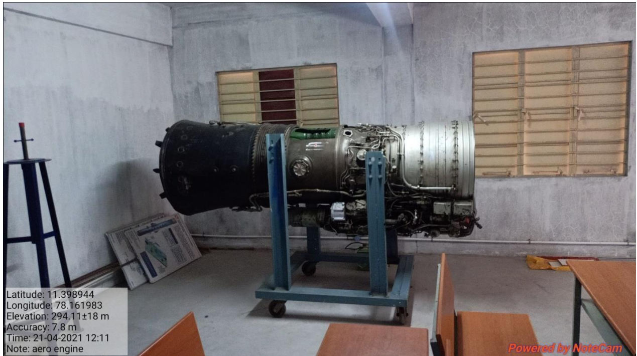
Aero Engine Repair and Maintenance Laboratory