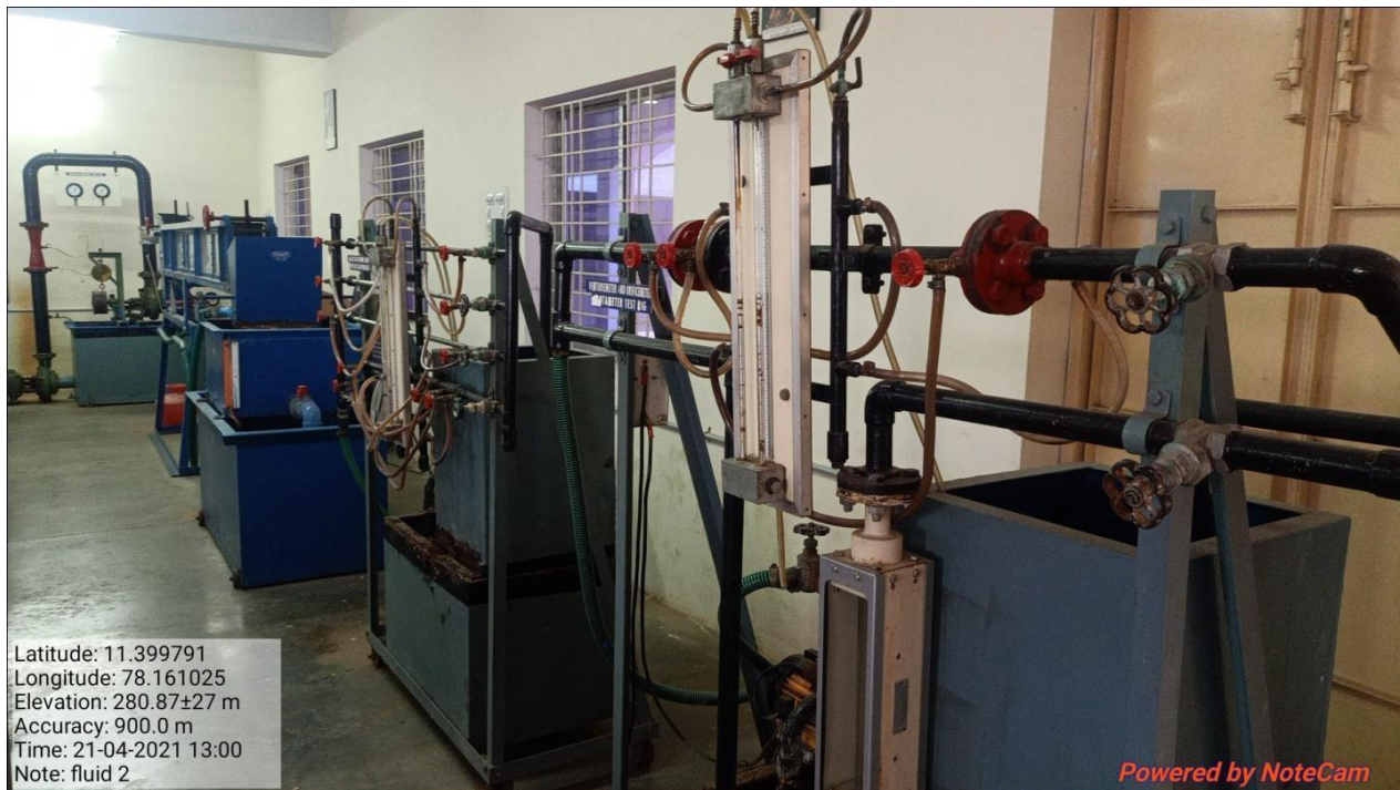
Fluid Mechanics Laboratory