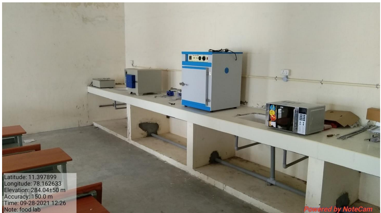
Food Technology Lab