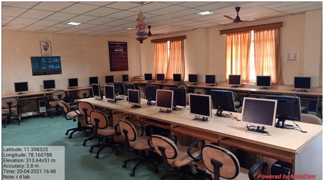
Digital Signal Processing Laboratory