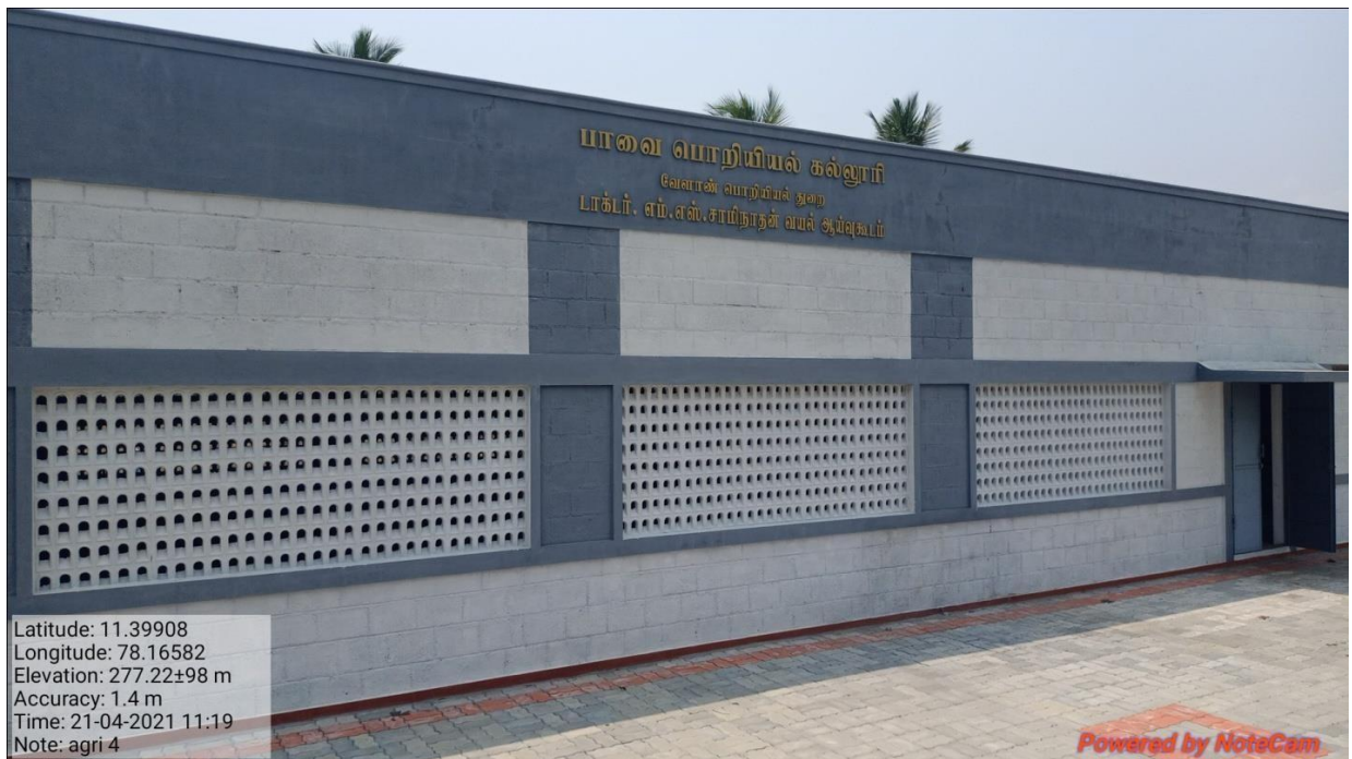
Farm Machinery Laboratory