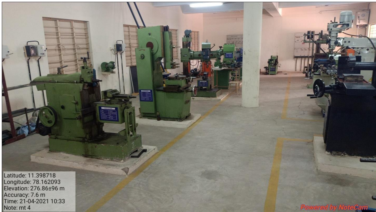
Manufacturing Technology Laboratory