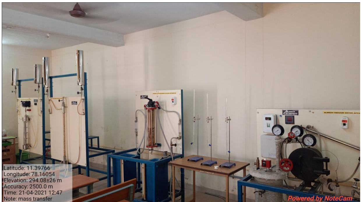
Mechanical Operations Laboratory