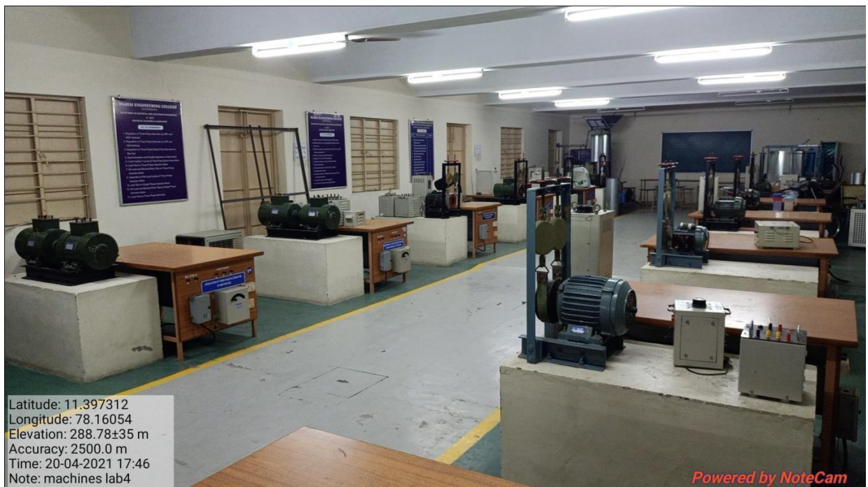
Electrical Machines Laboratory