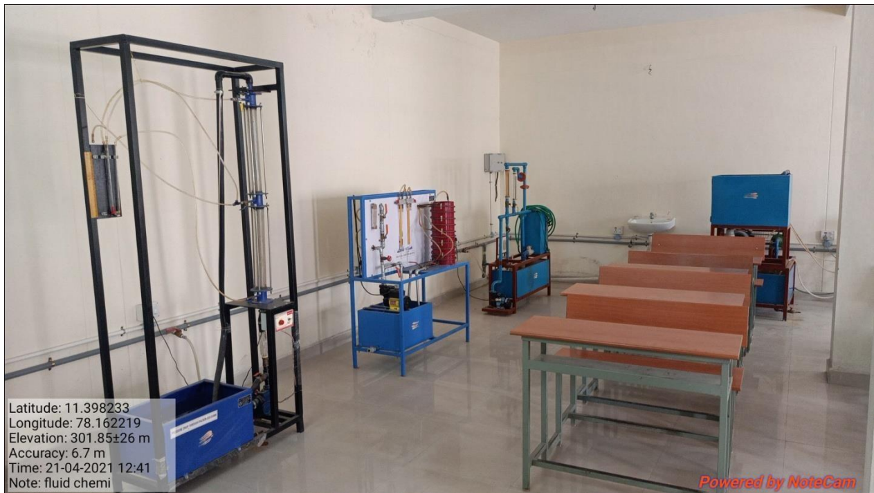
Fluid Mechanics Laboratory