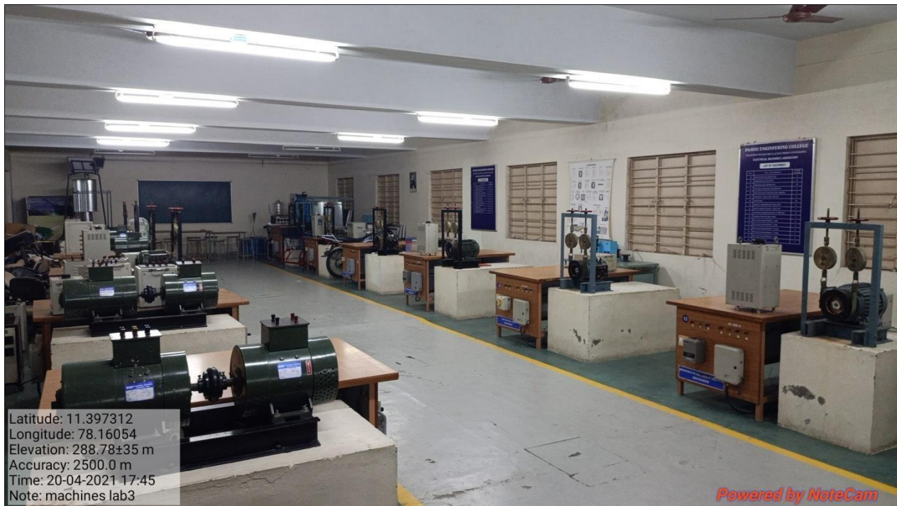
Electrical Machines Laboratory