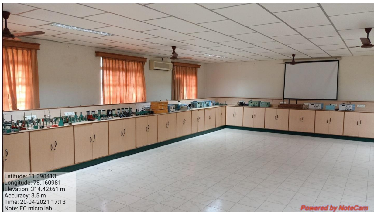
Microwave & Optical Laboratory