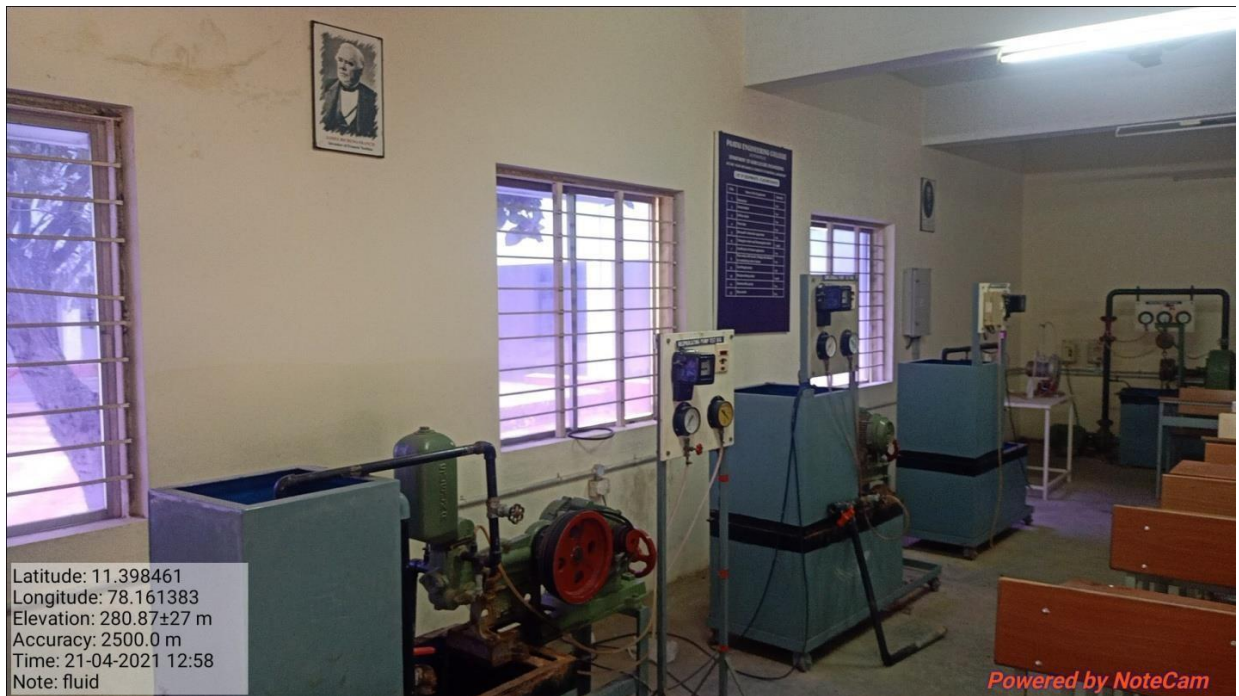
Fluid Mechanics Laboratory