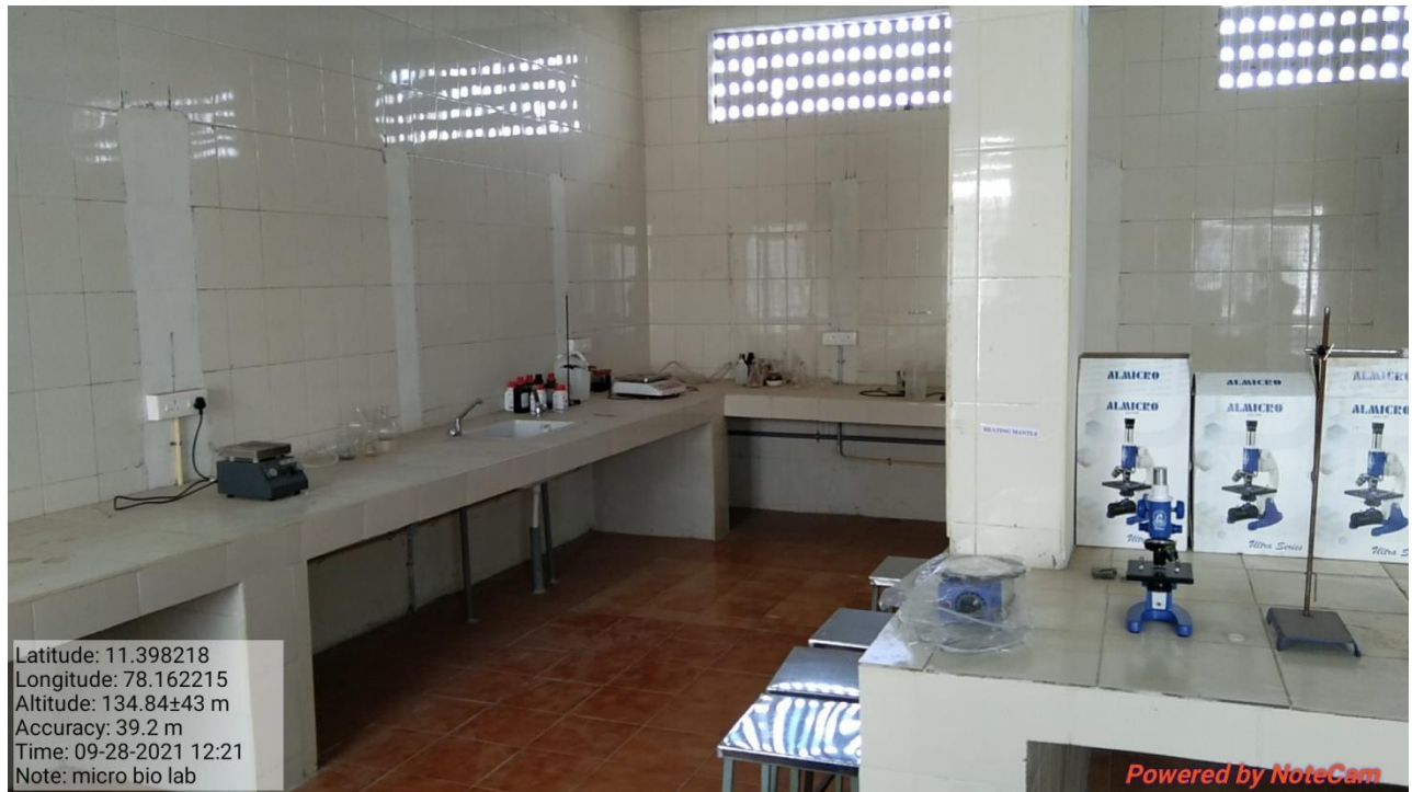
Micro Biology Lab