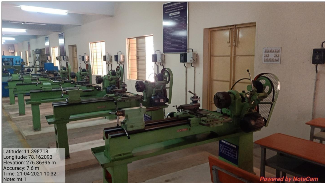
Manufacturing Technology Laboratory