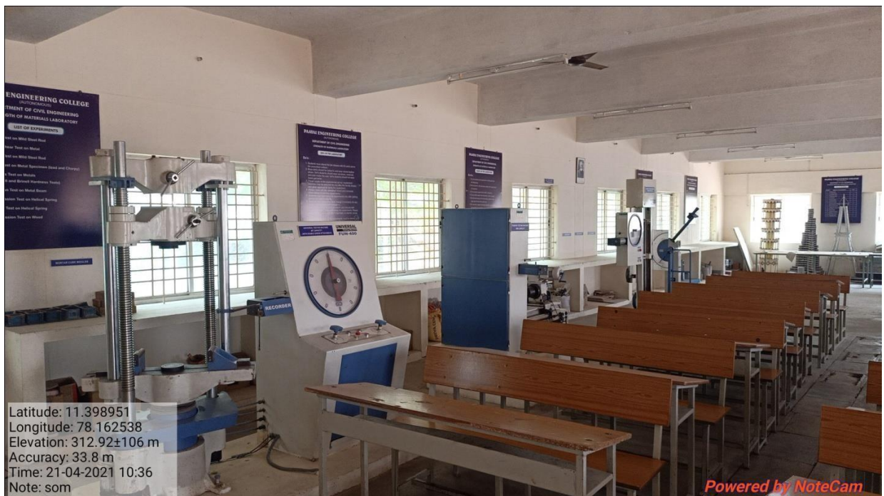
Strength of Material Laboratory