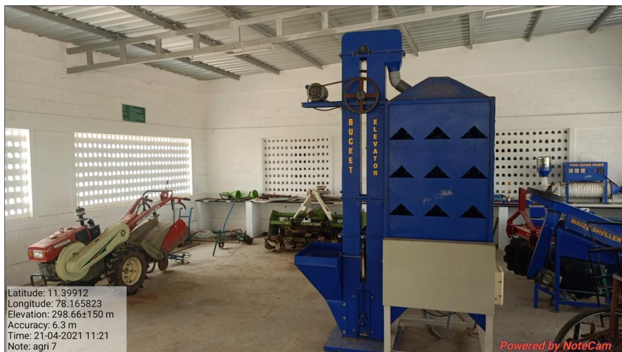
Farm Machinery Laboratory