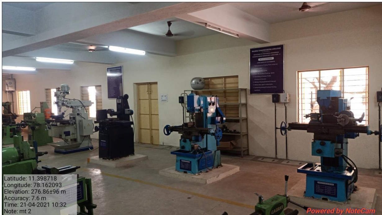
Manufacturing Technology Laboratory