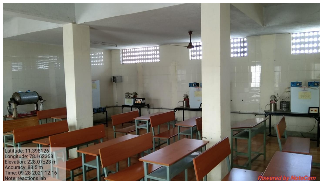
Chemical Reactions Lab