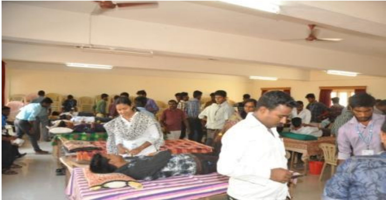
Our Volunteers and Students Donating their Blood (16.09.2015)