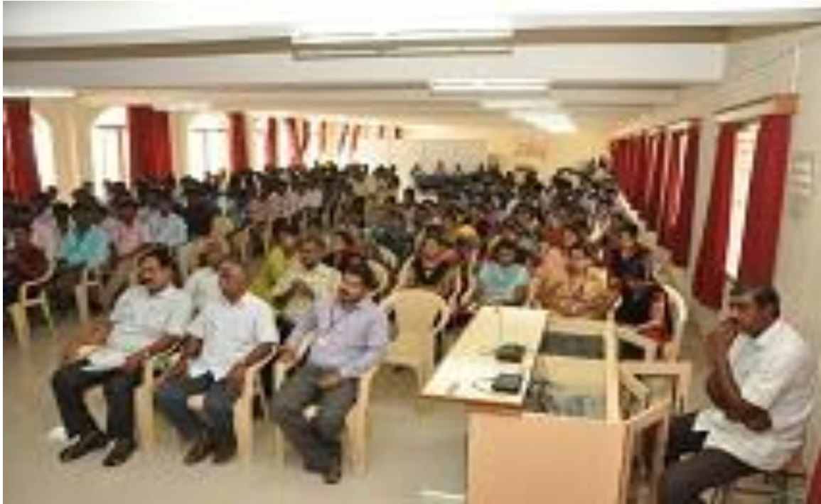
Blood Donation Awareness Programme (11.08.15)