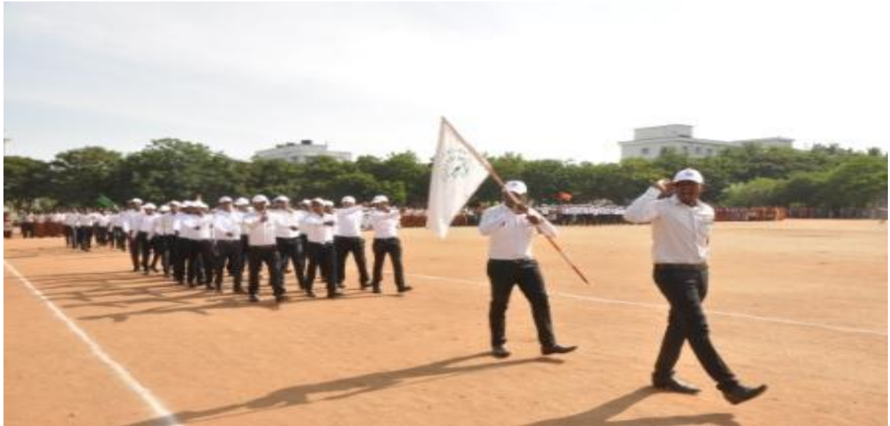
Our students participating in the march past in the Independence Day Celebration (15.08.2015)