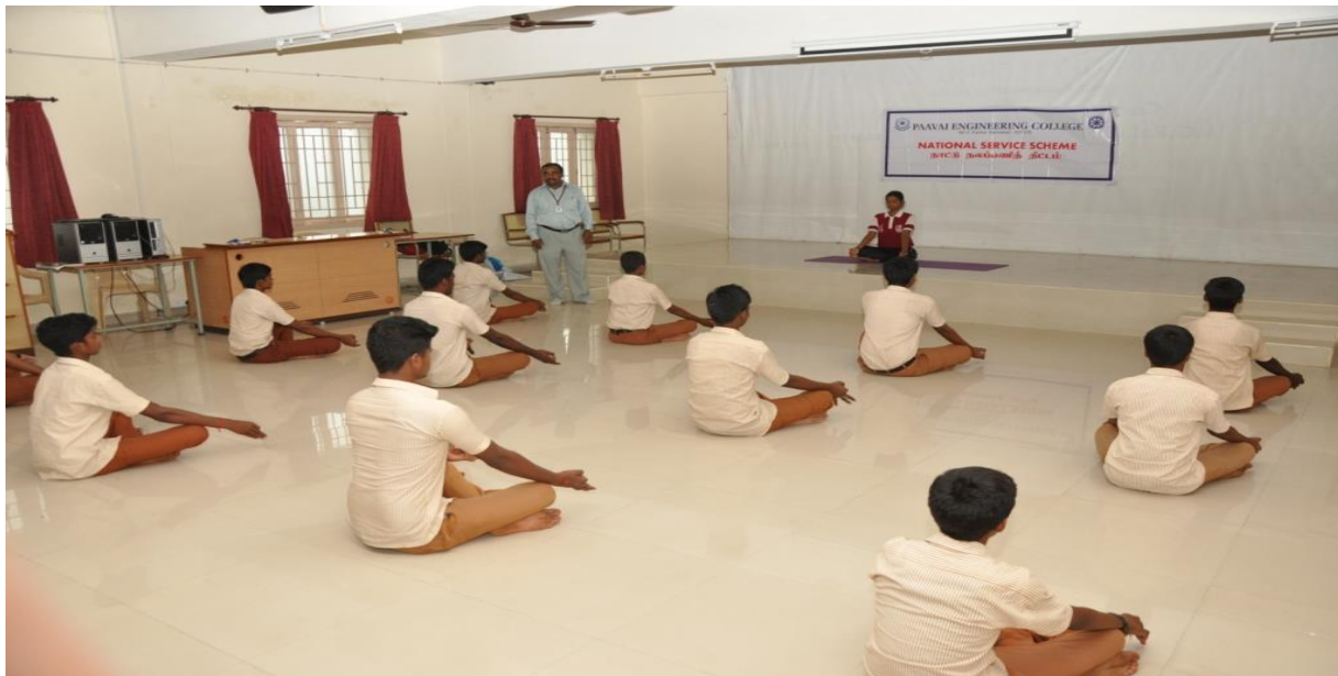
Yoga- Asanas (21.06.2015)