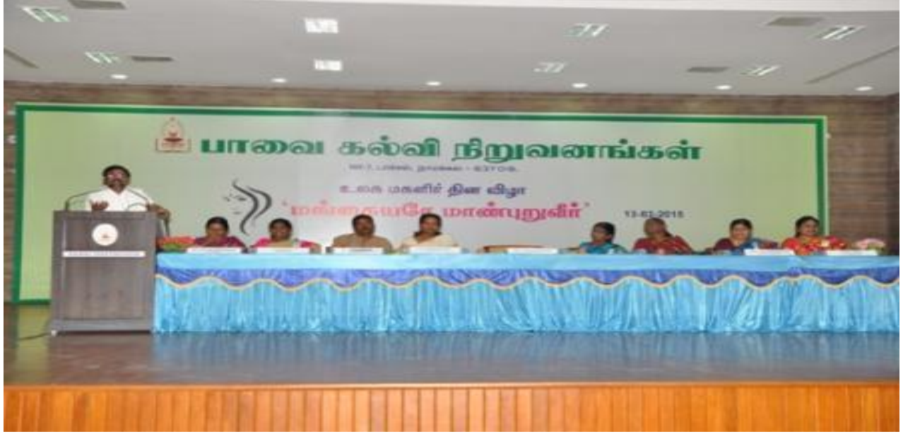
Celebrating International Women's Day (08.03.2016)