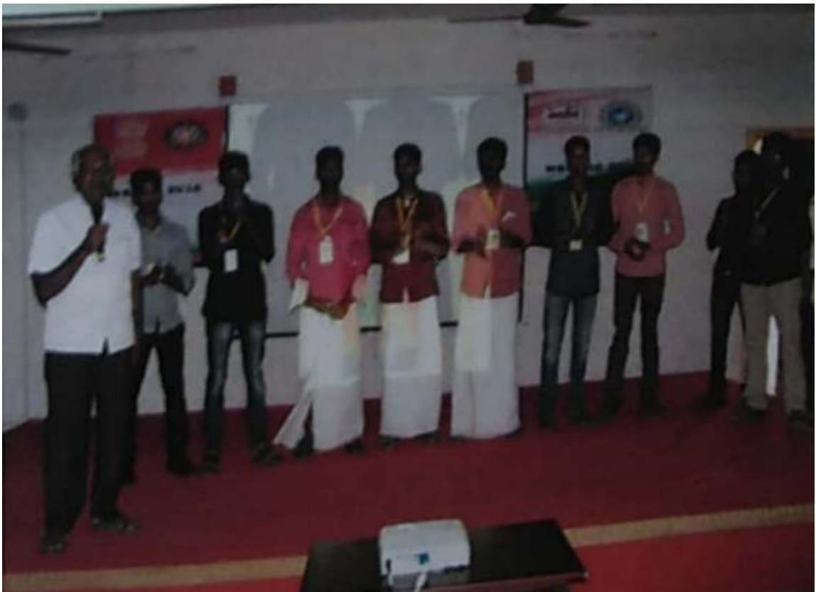
Group Photo- National Integration Camp-2016, Davangere, Karnataka. (15.03.16)