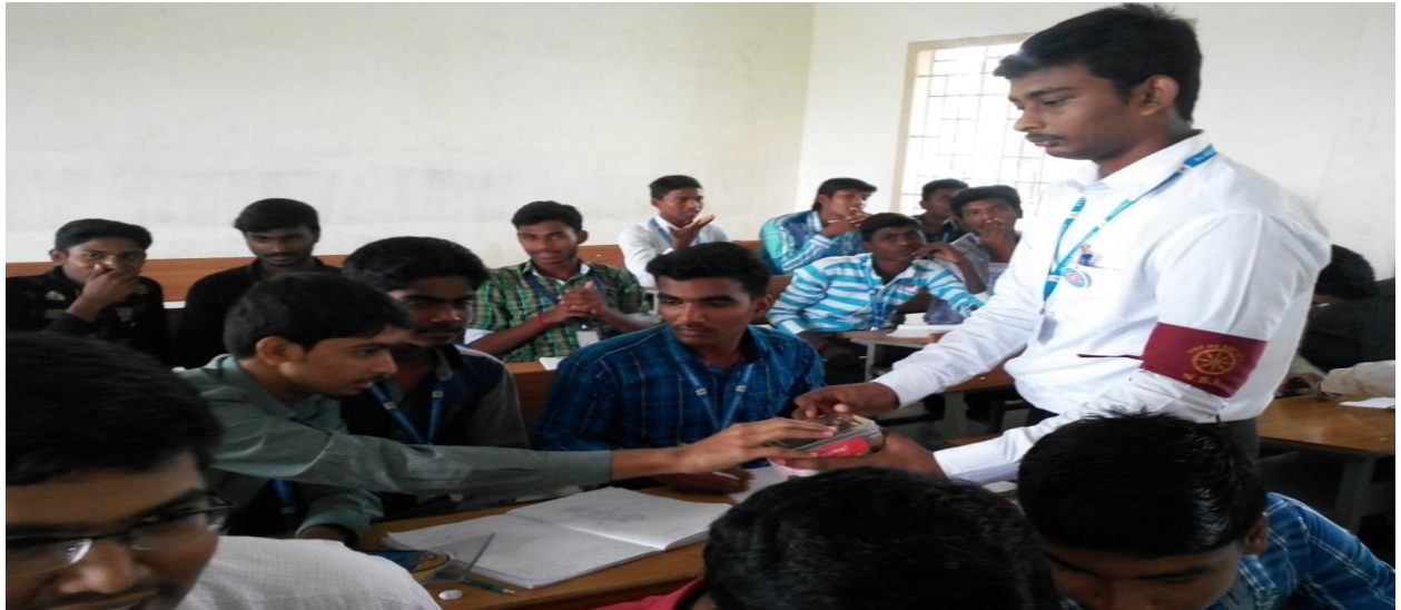
Our students contributing the amount for Flag-Day Celebration (20.11.2015)