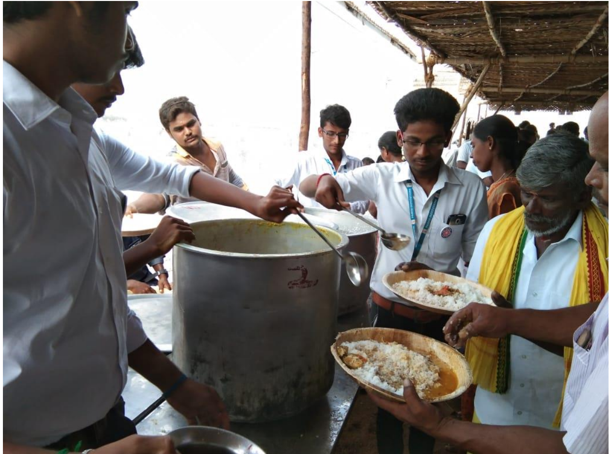
Our Volunteers providing volunteer ship for NSS Volunteership for Janmasthmi-ISKCON,Salem (05.09.2015)