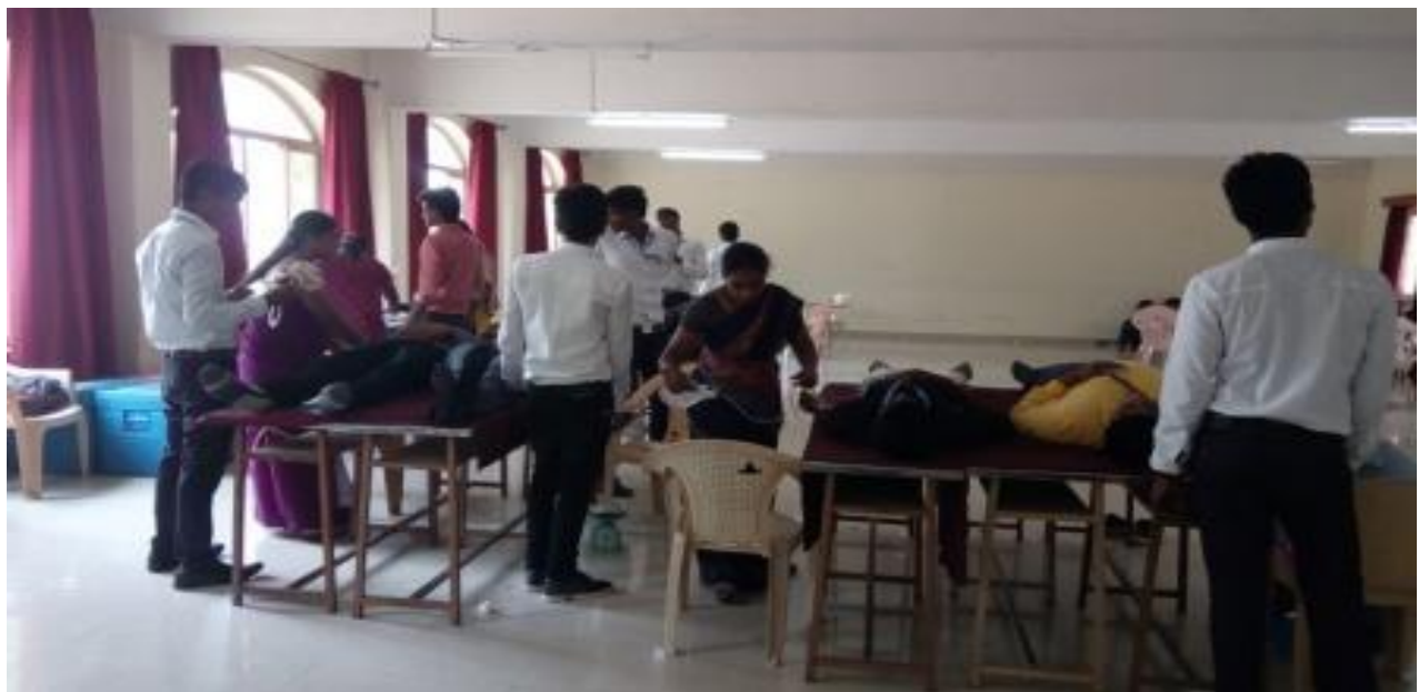
Our Volunteers and Students Donating their Blood (23.03.2016)