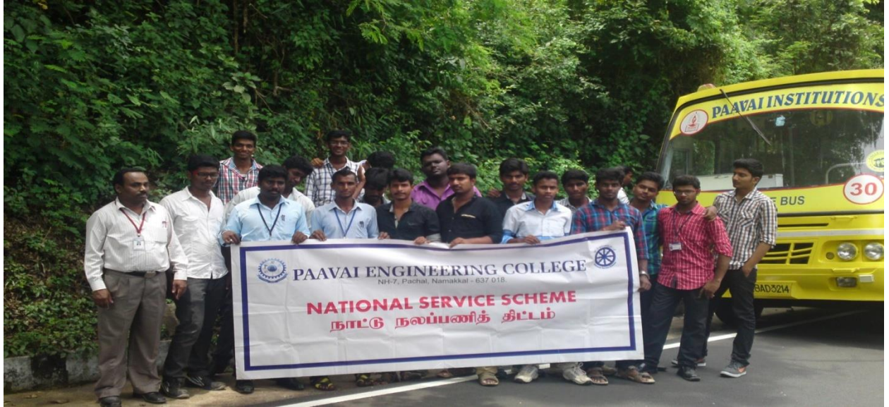
Our Volunteers Removing Polythene bags and Plastic bottles in the Kolli Hills (01.08.2015)