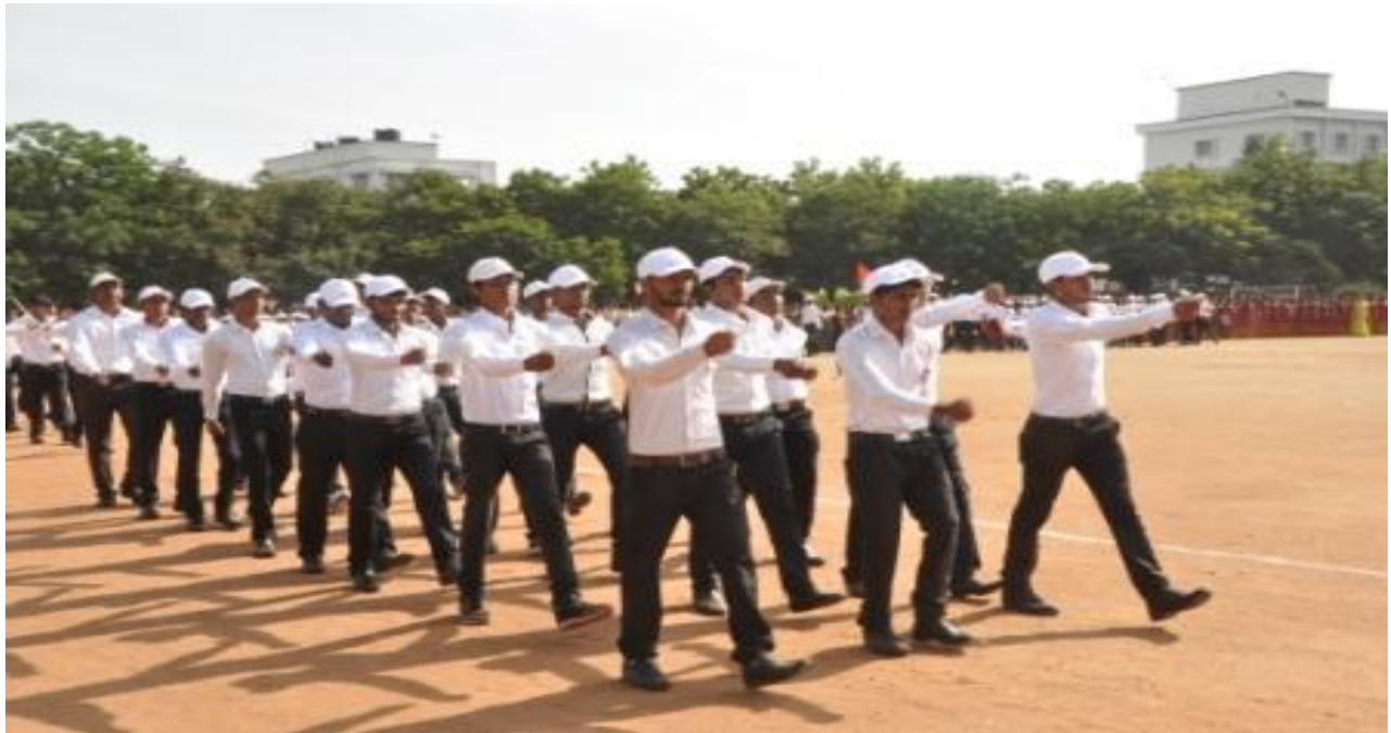
Our students participating in the march past in the Independence Day Celebration (15.08.2015)