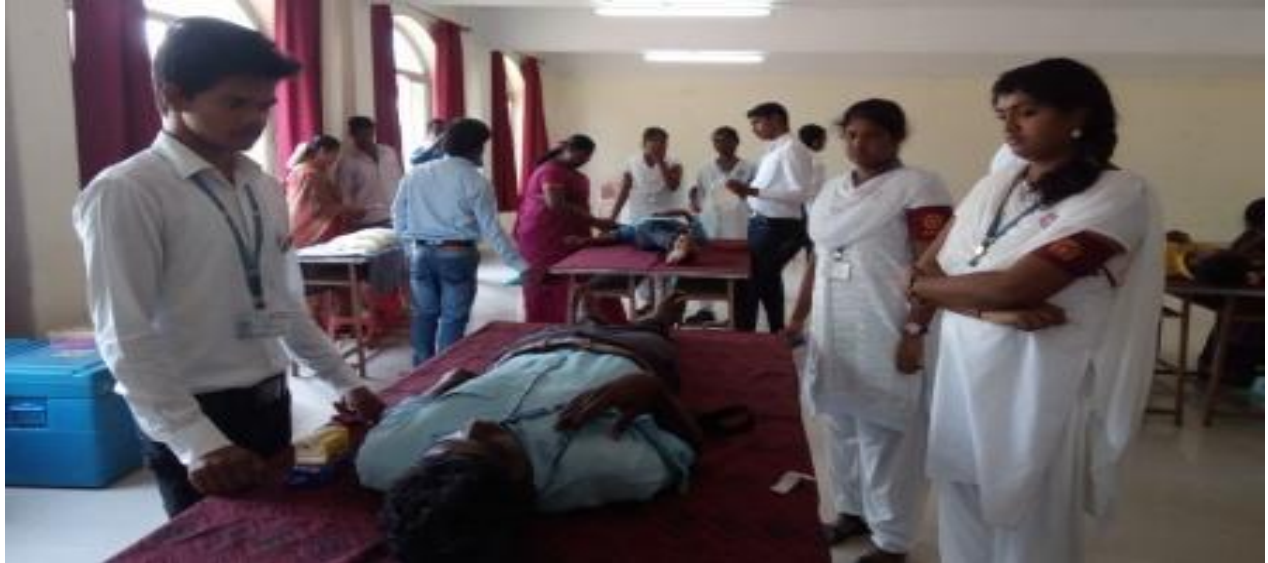
Our Volunteers and Students Donating their Blood (23.03.2016)