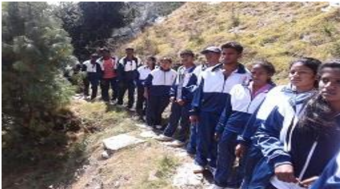
Trekking-Adventure Camp (16.10.15)