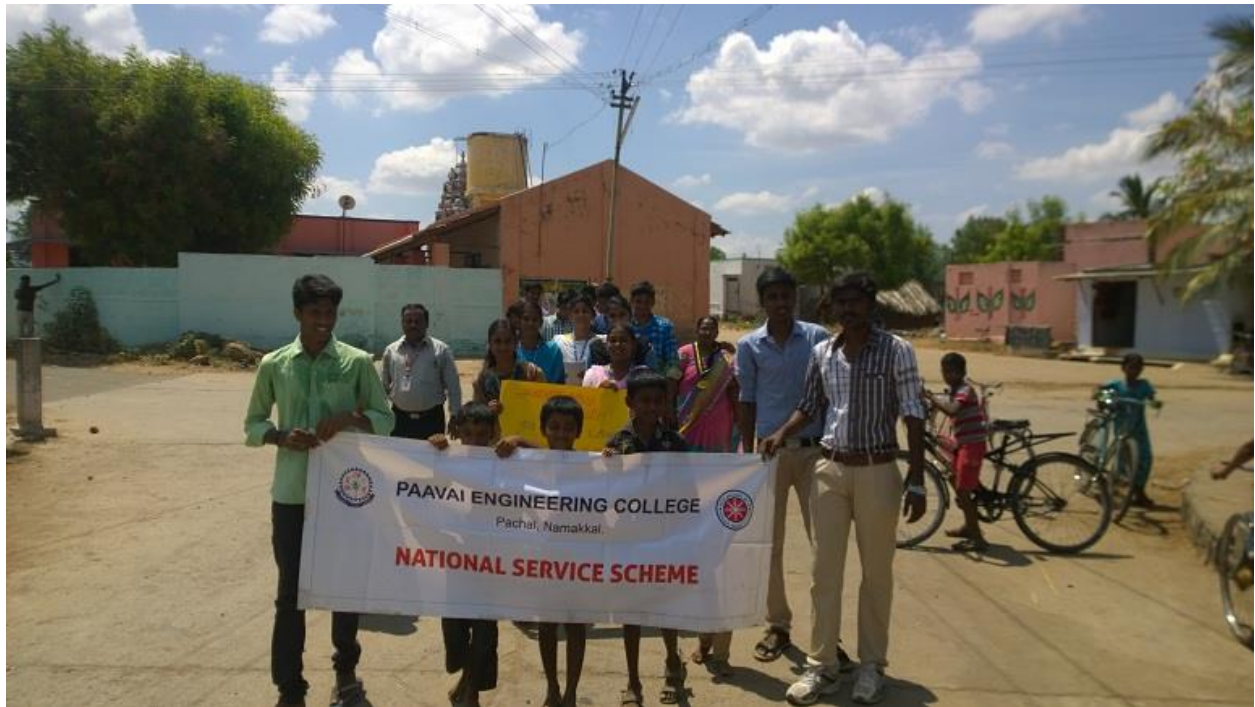
Health Awareness Rally (18.04.16)