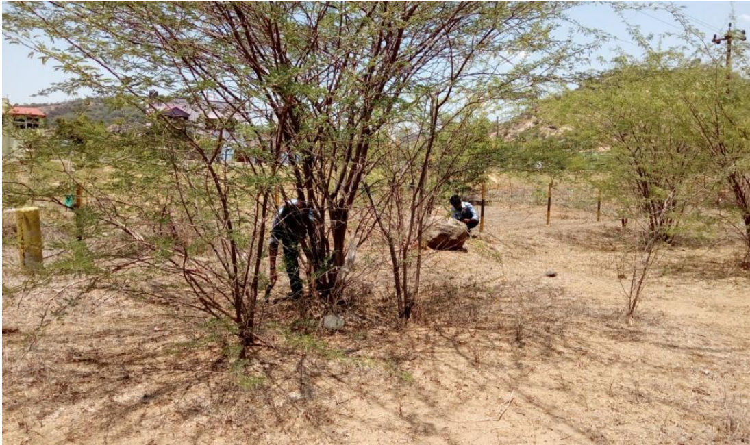
Our Volunteers removing the Semai Karuvelan Trees (15.12.2015)