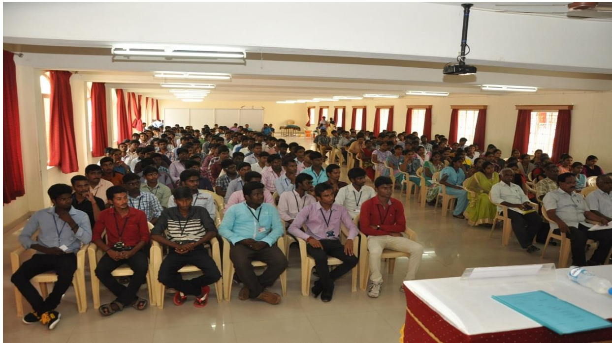
Blood Donation Awareness Programme (23.03.2016)