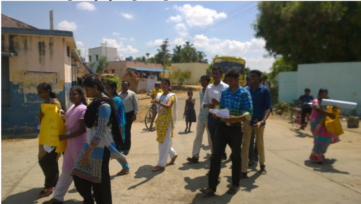
We took the census of village population (08.12.2015)