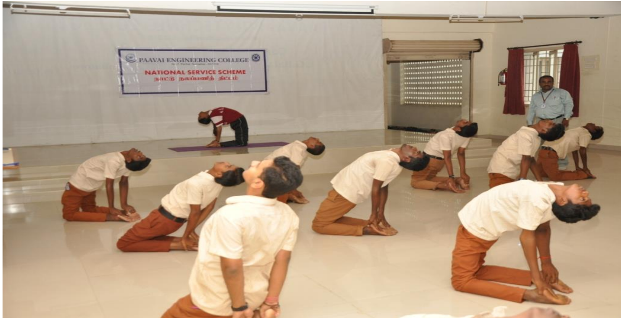
Yoga- Asanas (21.06.2015)