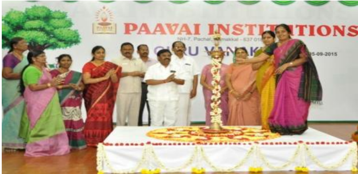
Our students doing Patha Pooja for Teachers (05.09.2015)