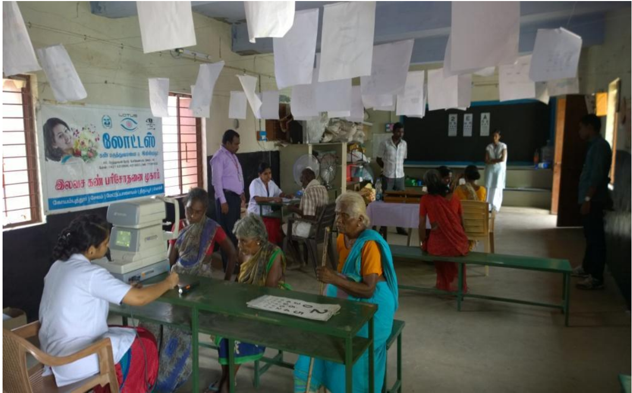
Free Eye Camp conducted by Lotus Eye Hospital, Salem (15.04.2016)