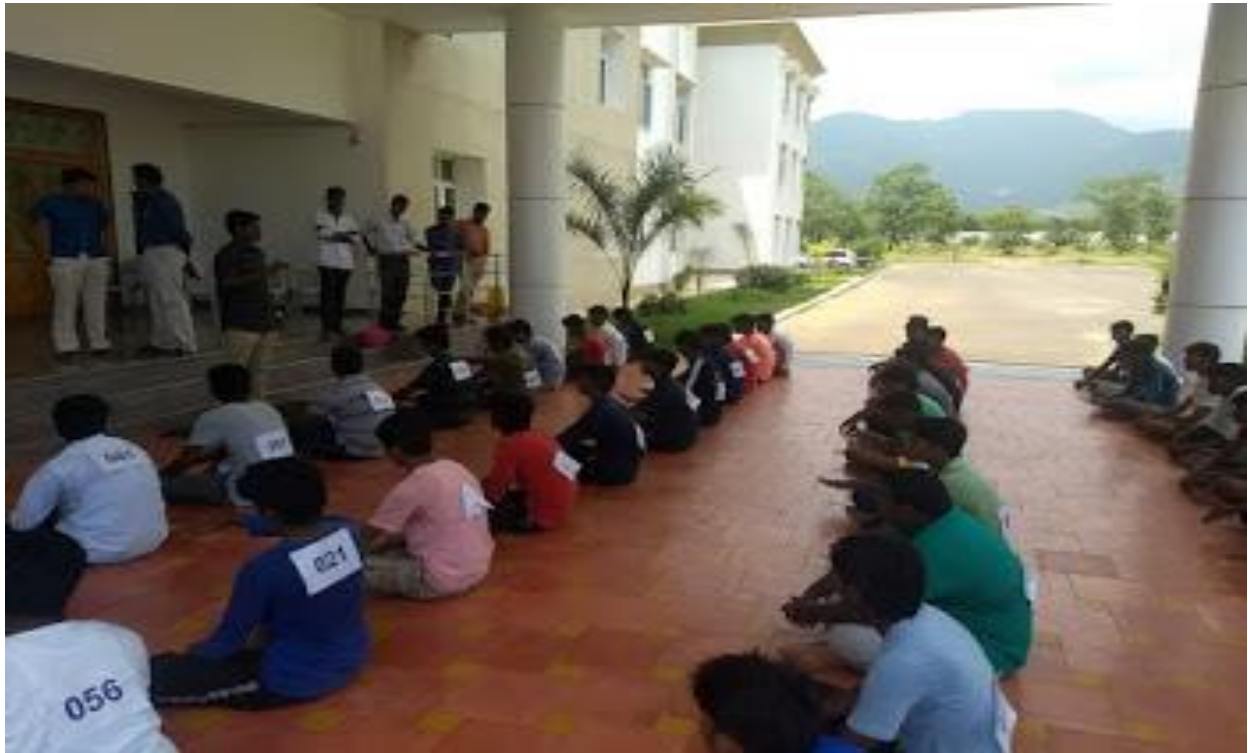
Anna University Pre RD Camp Selection (03.09.2015)

Activity Name: Anna University Pre RD Camp Date: 03.09.2015