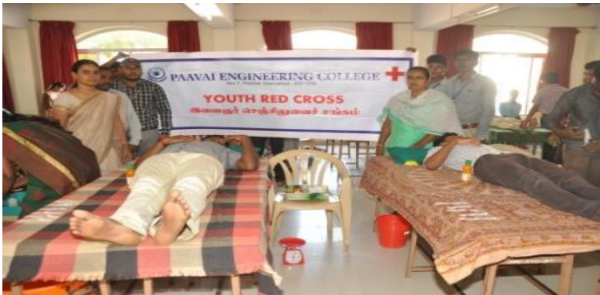
Our Volunteers and Students Donating their Blood (16.09.2015)