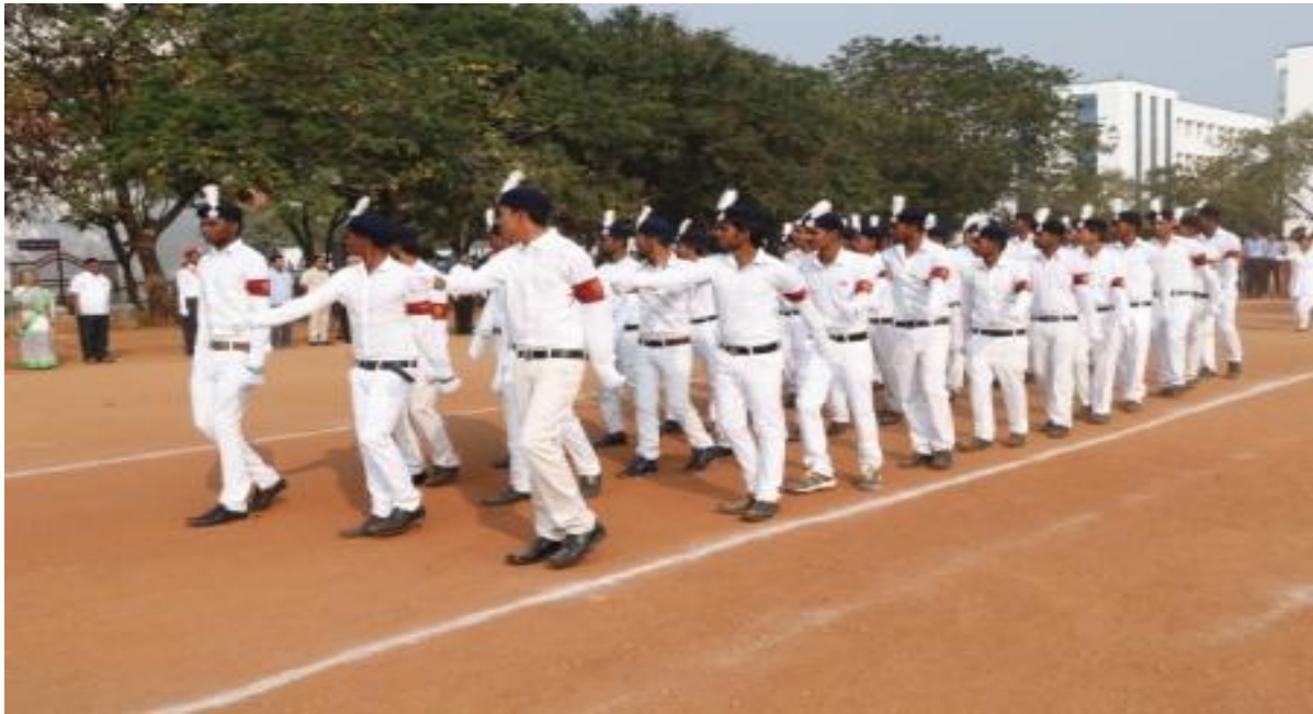
Our students participating in the march past in the Republic Day Celebration (26.01.2016)