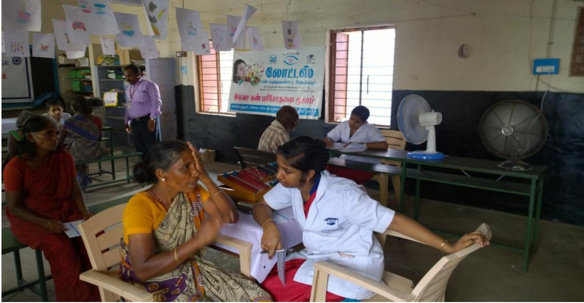
Free Eye Camp conducted by Lotus Eye Hospital, Salem (15.04.2016)