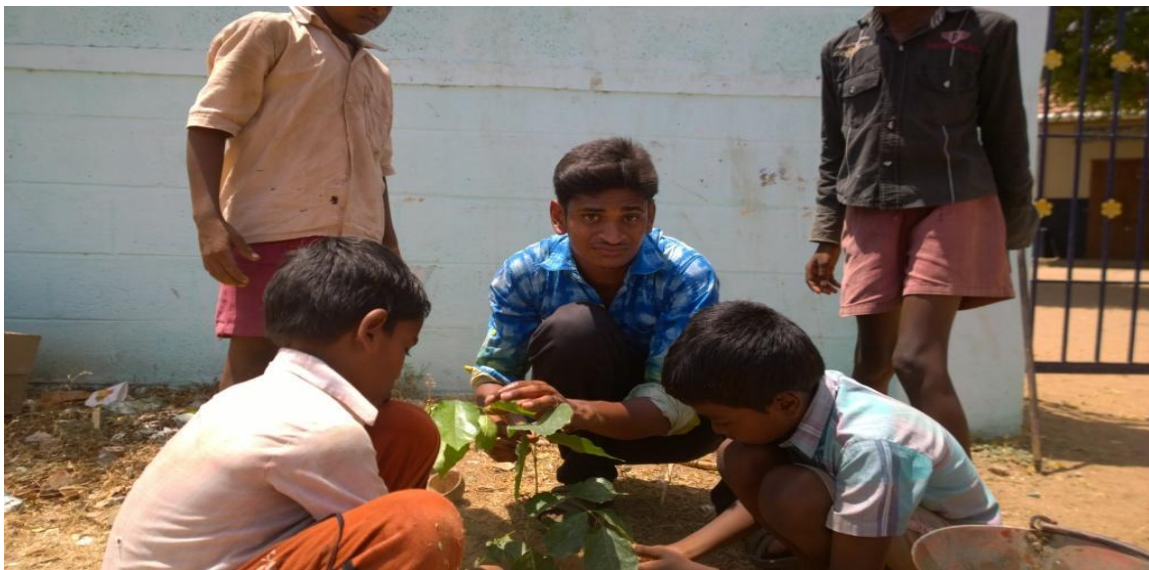
Our NSS Volunteers Planting the Trees in the School Premises (17.04.2016)