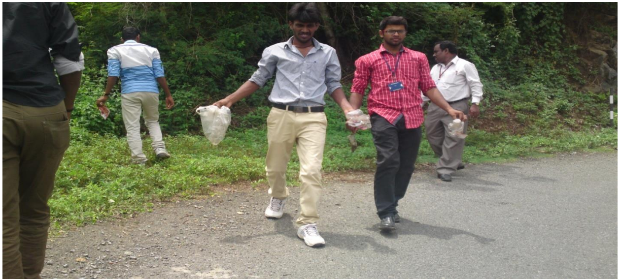
Our Volunteers Removing Polythene bags and Plastic bottles in the Kolli Hills (01.08.2015)