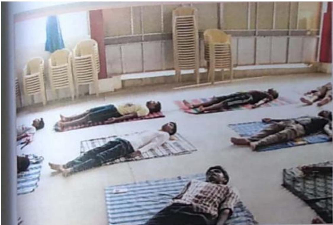
Performing Yoga Asana- National Integration Camp-2016, Pollachi, Tamil Nadu. (02.05.16)