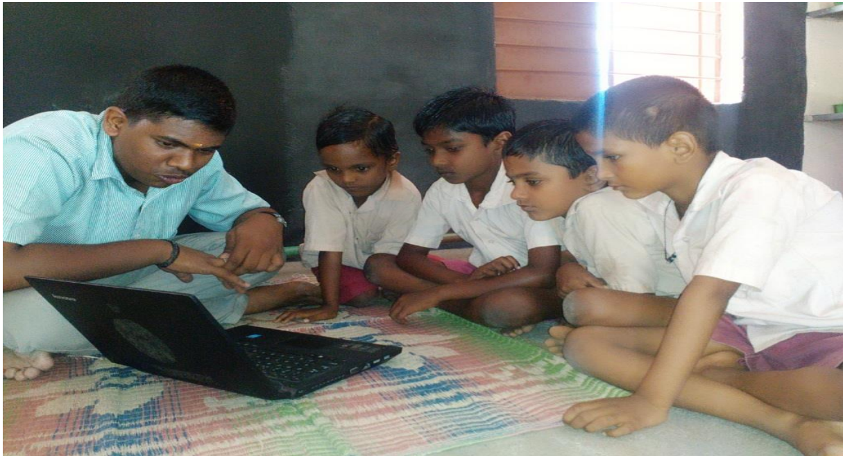
Training in laptop usage was given to the school students (08.12.2015)

Activity Name: Swachh Bharath Awareness Programme –Kalyani Date: 08.12.2015