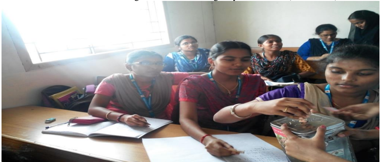
Our students contributing the amount for Flag-Day Celebration (20.11.2015)