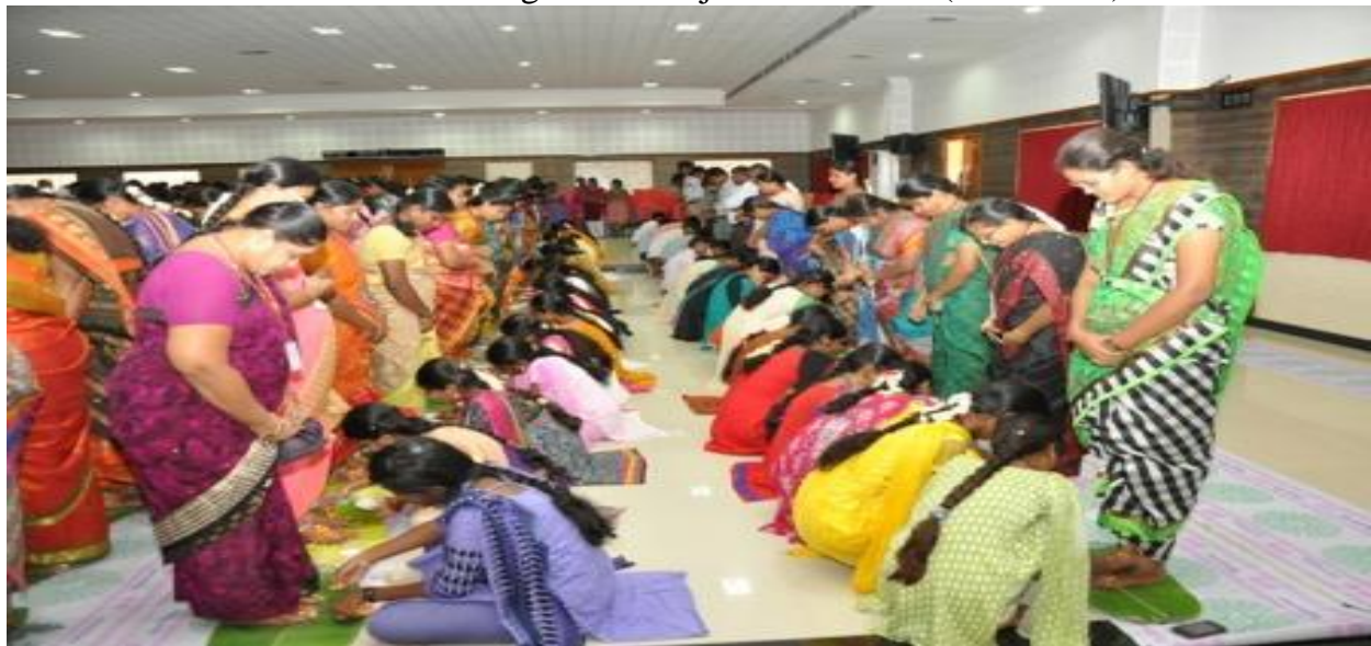
Our students doing Patha Pooja for Teachers (05.09.2015)