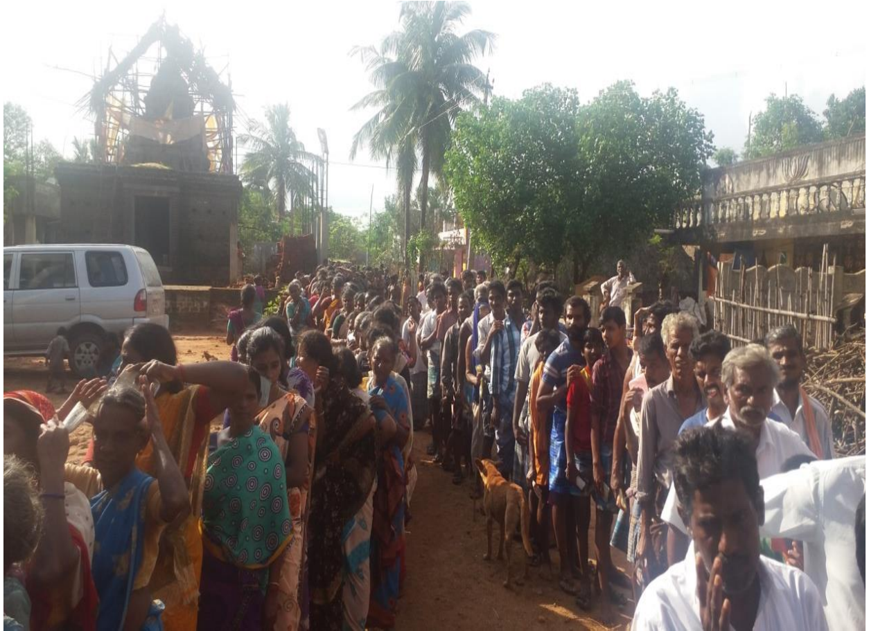
The contributed materials we were issued to the KilaKuppam village people in Cuddalore District. (12.12.2015)