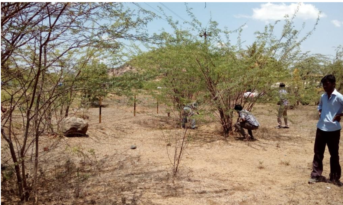
Our Volunteers removing the Semai Karuvelan Trees (15.12.2015)