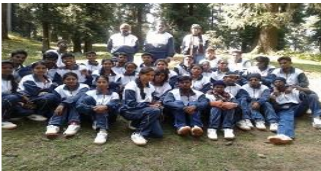
Group Photo - Adventure Camp (24.10.15)