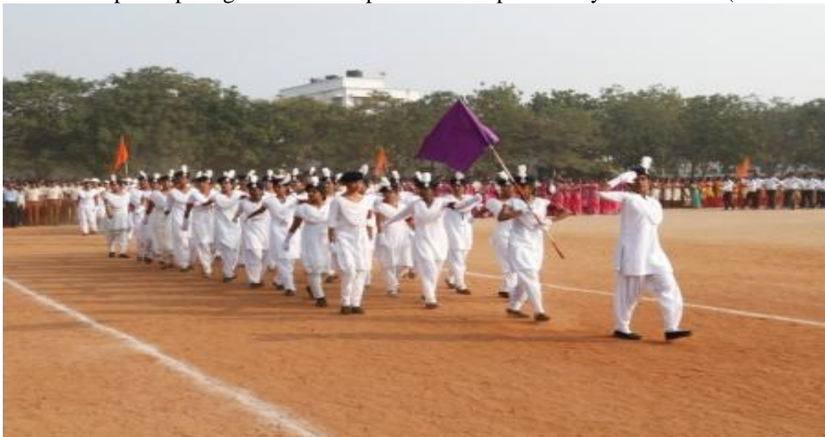
Our students participating in the march past in the Republic Day Celebration (26.01.2016)