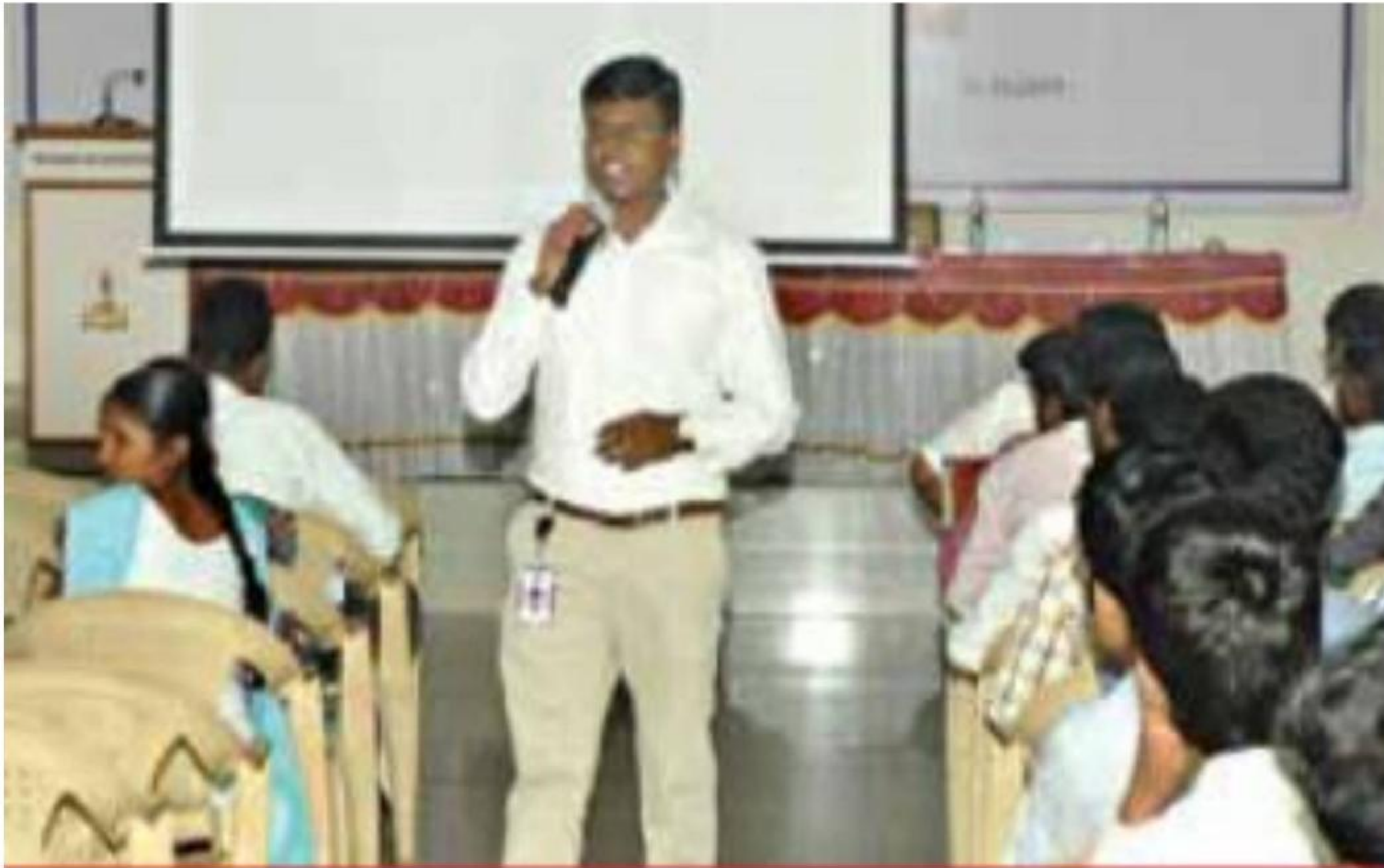
Personal Interview practice-21.9.2017