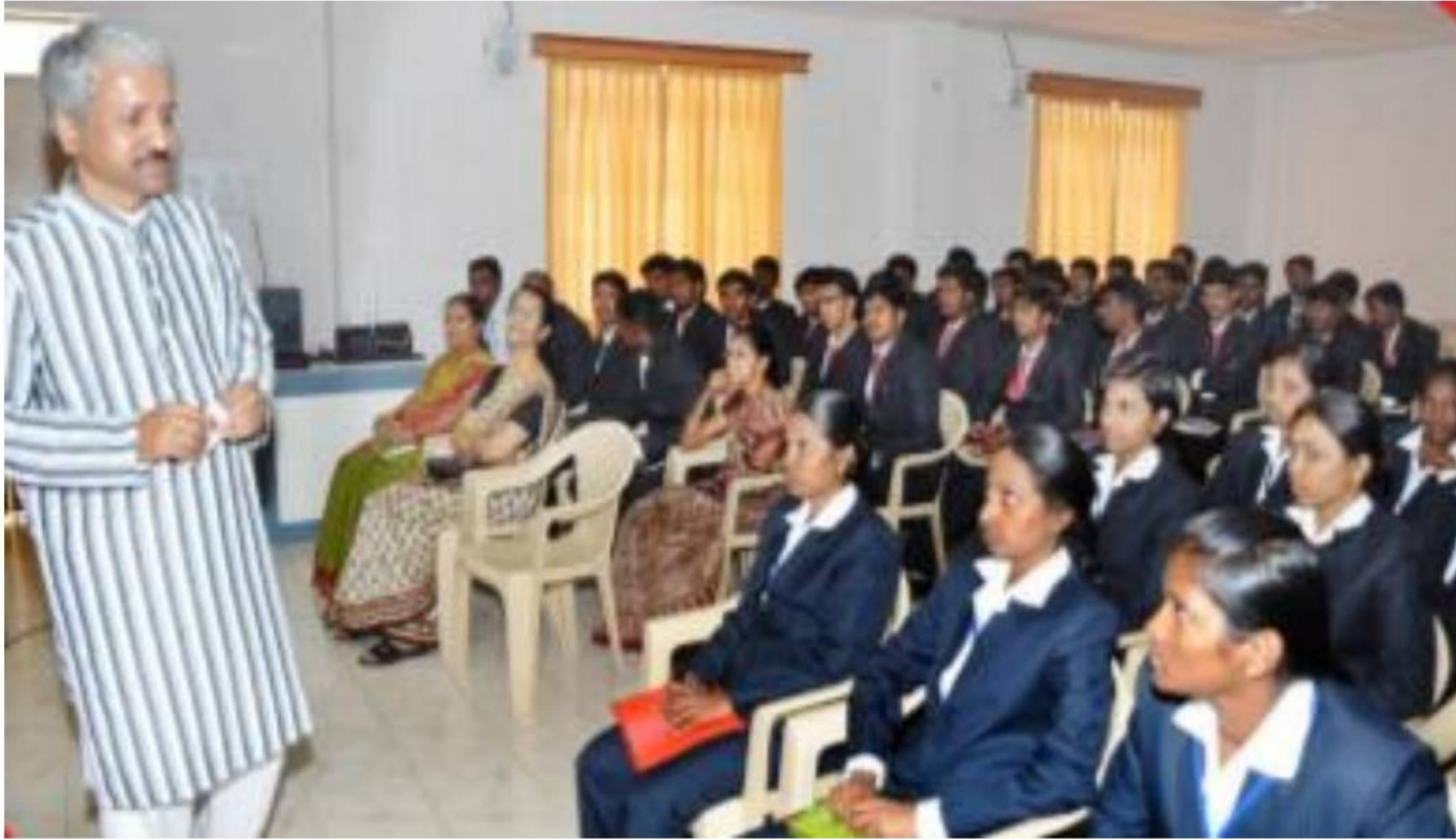
3rd Year Placement orientation On August06, 2018