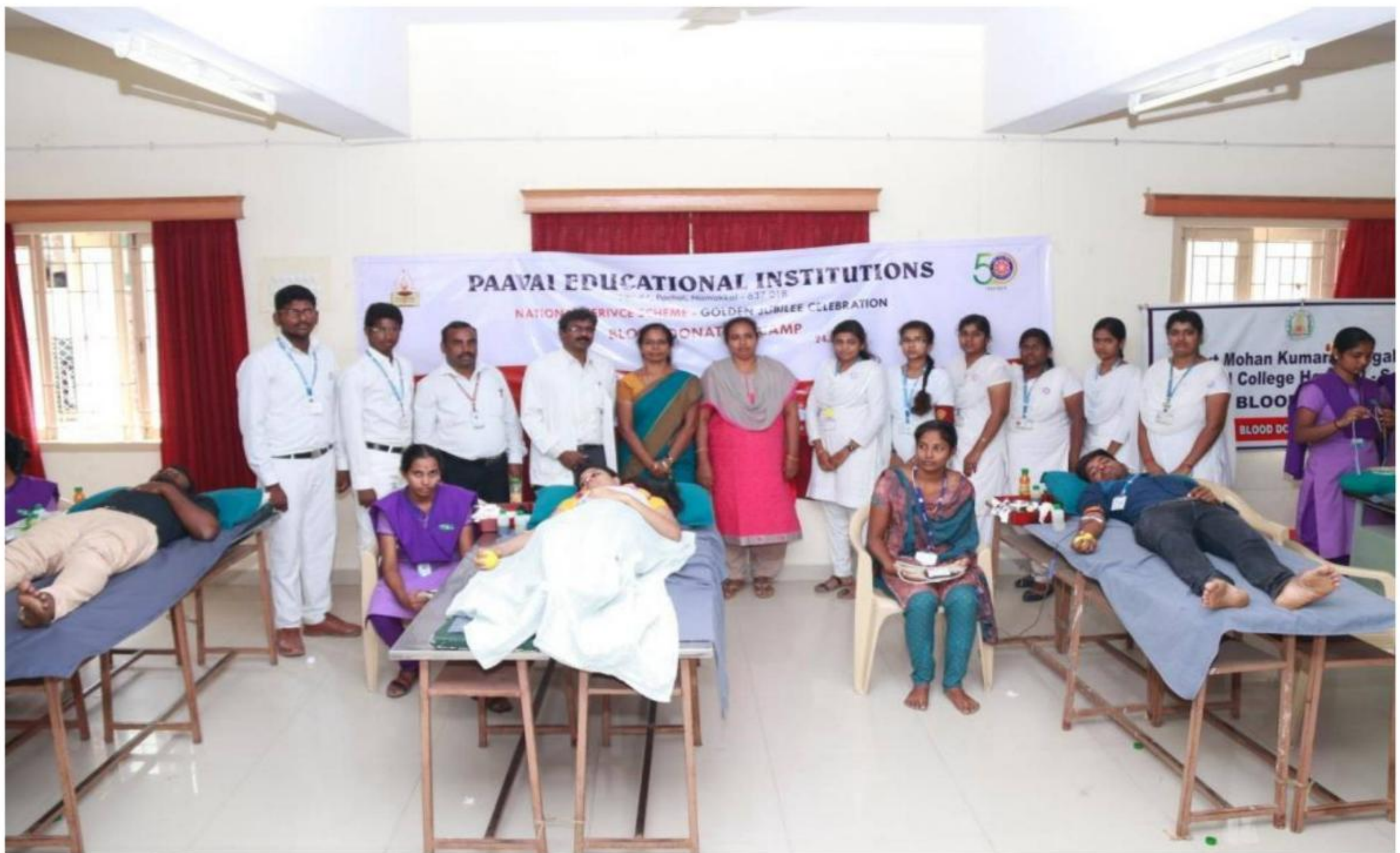
Blood Donation Camp on 24.01.2019