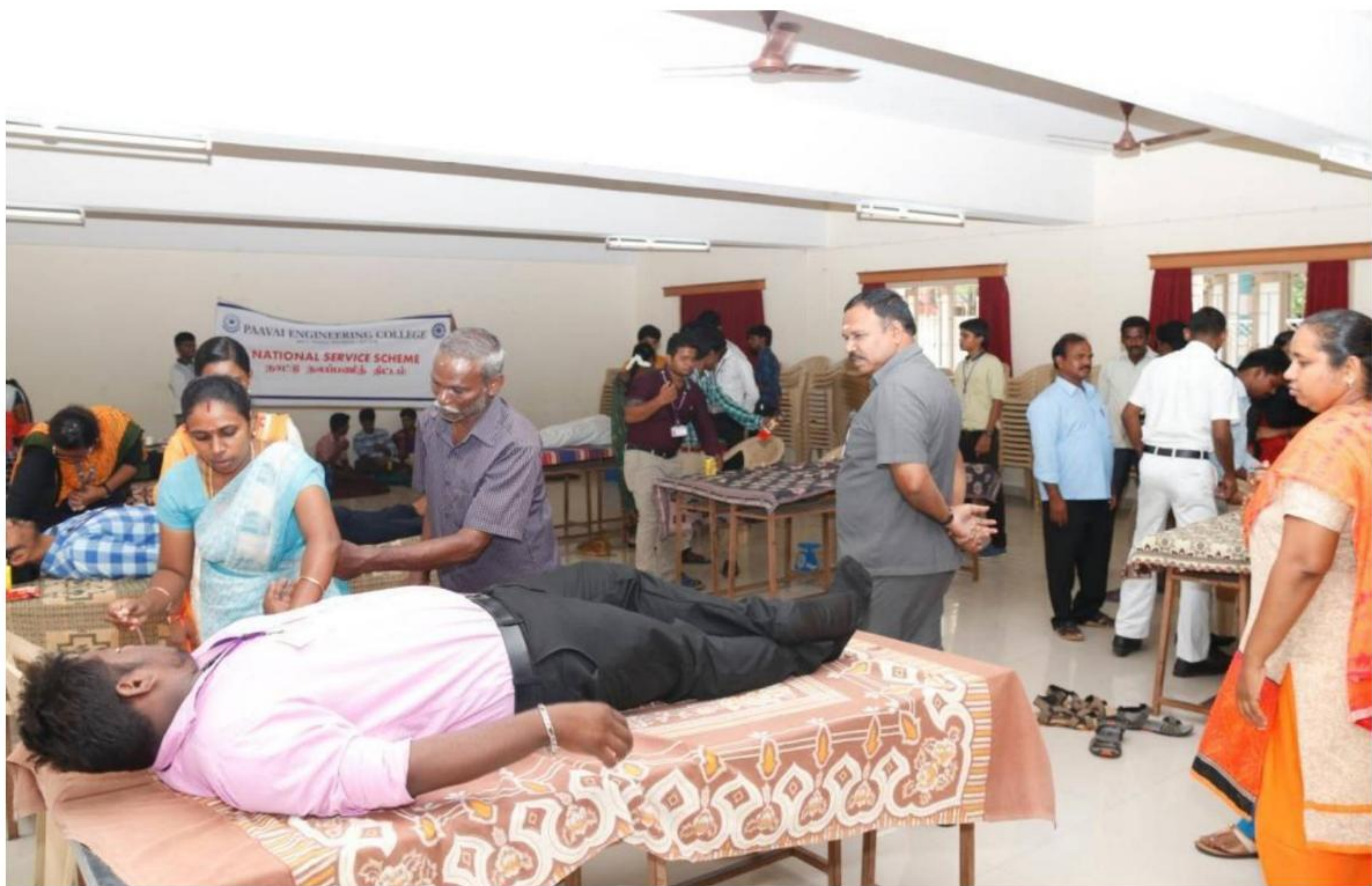
Blood Donation Camp on 10.08.2017