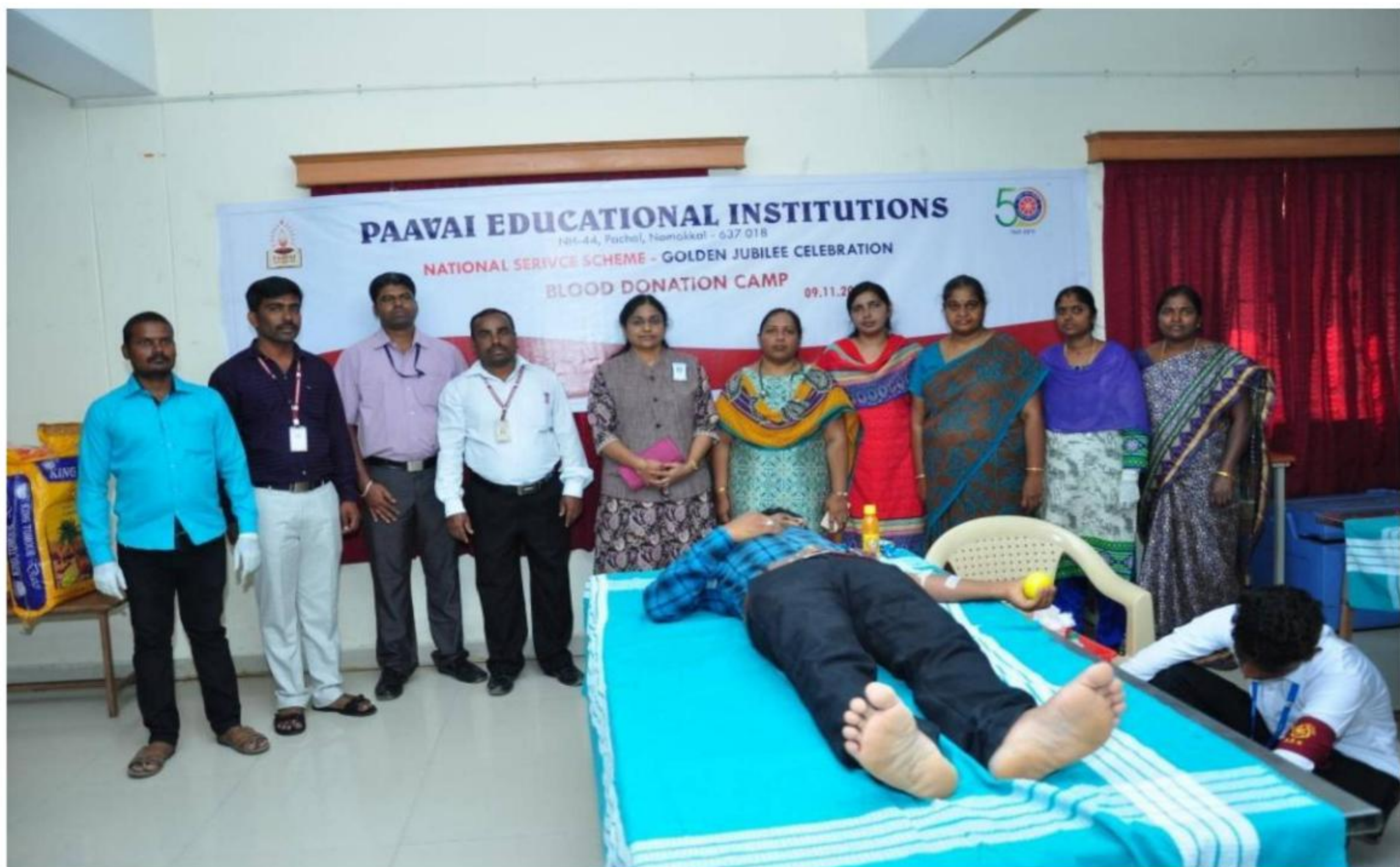
Blood Donation Camp - Date: 09.11.2018