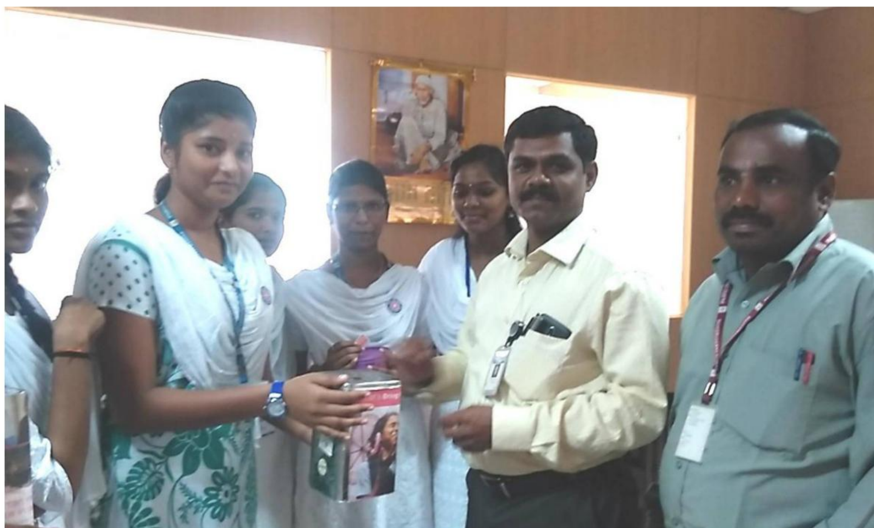
International White Cane Day on 27.09.2017

The donated amount DD for Rs.12170 bearing No. 323214 dated 09.11.2017 from Corporation Bank, Namakkal was sent to the “Indian Association for the Blind, Madurai-625104” for visually challenged children education purpose.