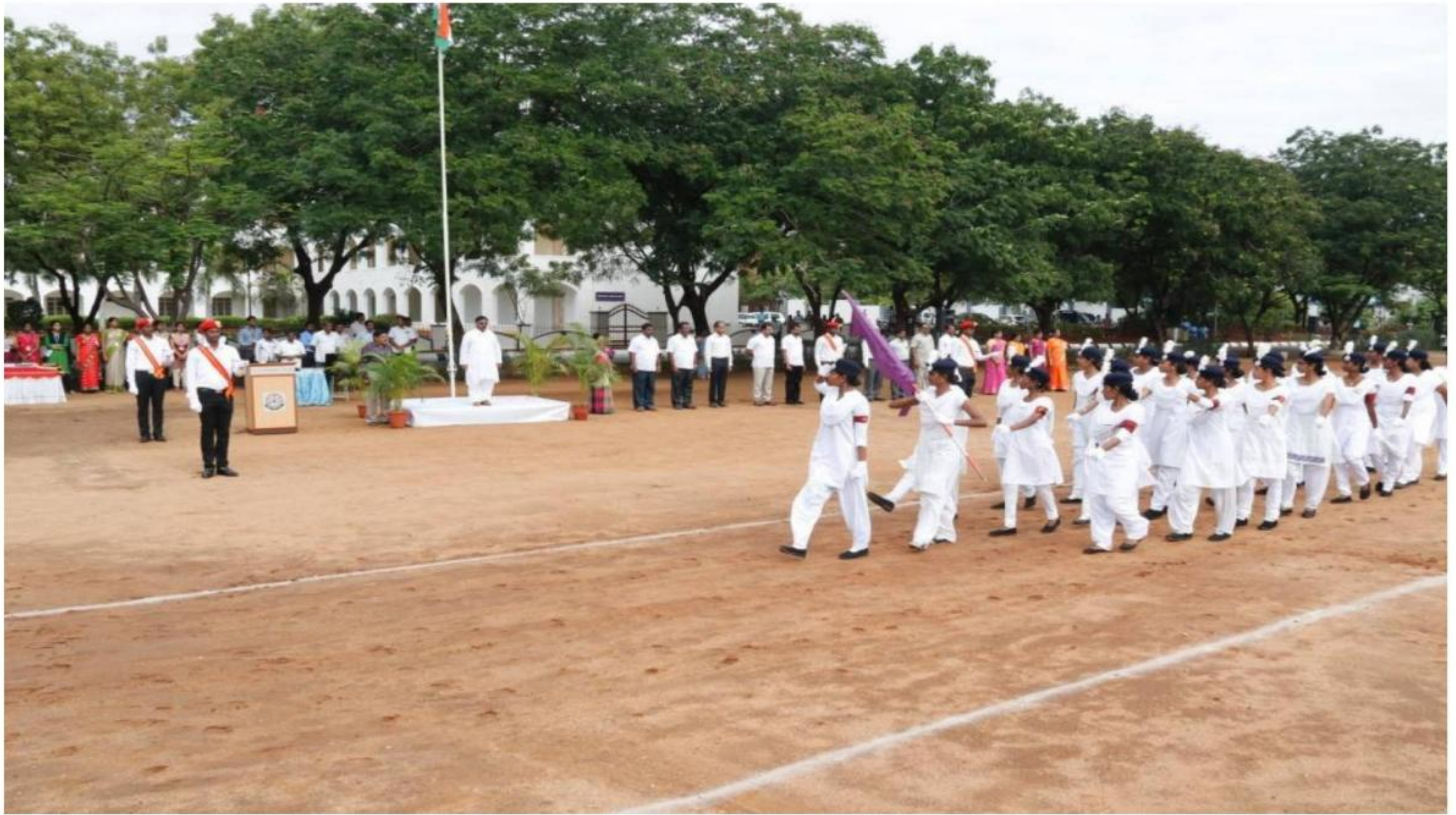
Independence Day Celebration on 15.08.2017