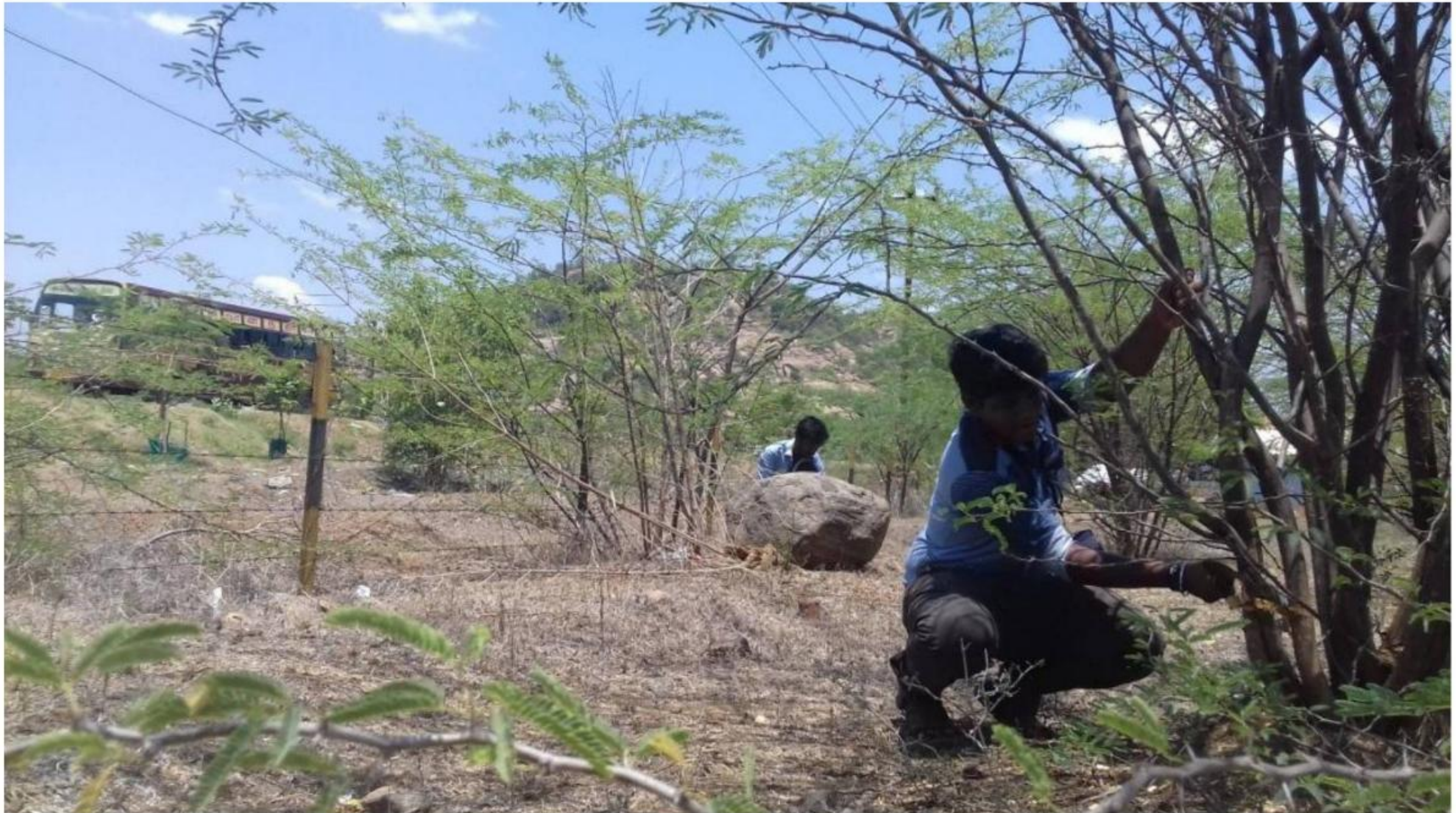
Removal of Kombaikadu Semai Karuvelan Trees on 31.03.2017 Our NSS Volunteers removing the Semai Karuvelan Trees

As per the circular issued by the Government of Tamilnadu , we removed the unwanted trees of Semai Karuvelan in Kombaikadu. Around 20 acres the semai karuvelan trees were removed from the land and save the water to the earth. In this activity 20 students were participated.