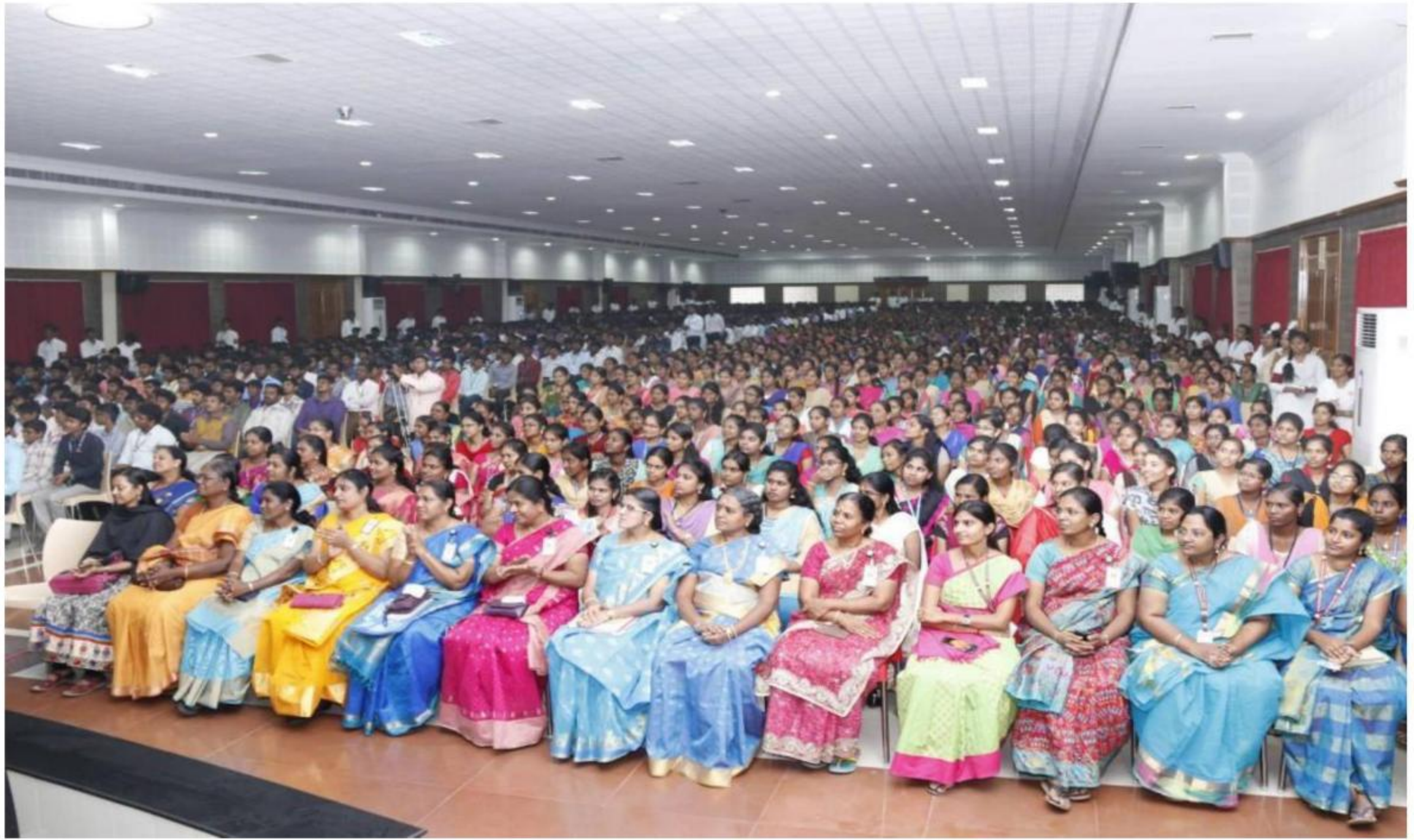
ASTRA-2018 on 08.02.2018 & 09.02.2018