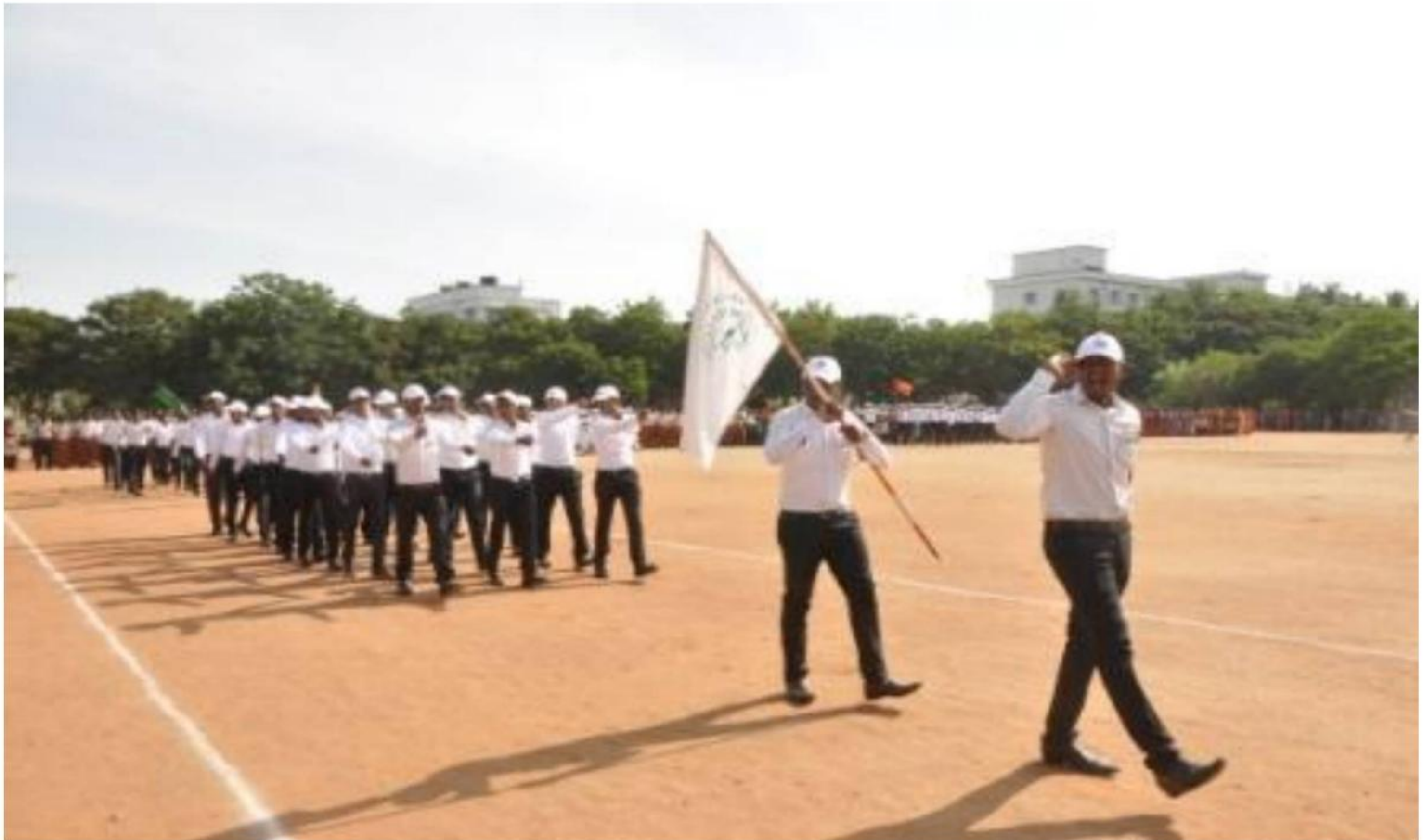
Independence Day Celebration on 15.08.2015

We celebrated our Independence Day on 15 th August, 2015. Our NSS volunteers more than 75 students willingly participated in the march past. At the end of the programme, Independence oath was taken by our students. The NSS Volunteers and Blood donors honored with the Certificates.