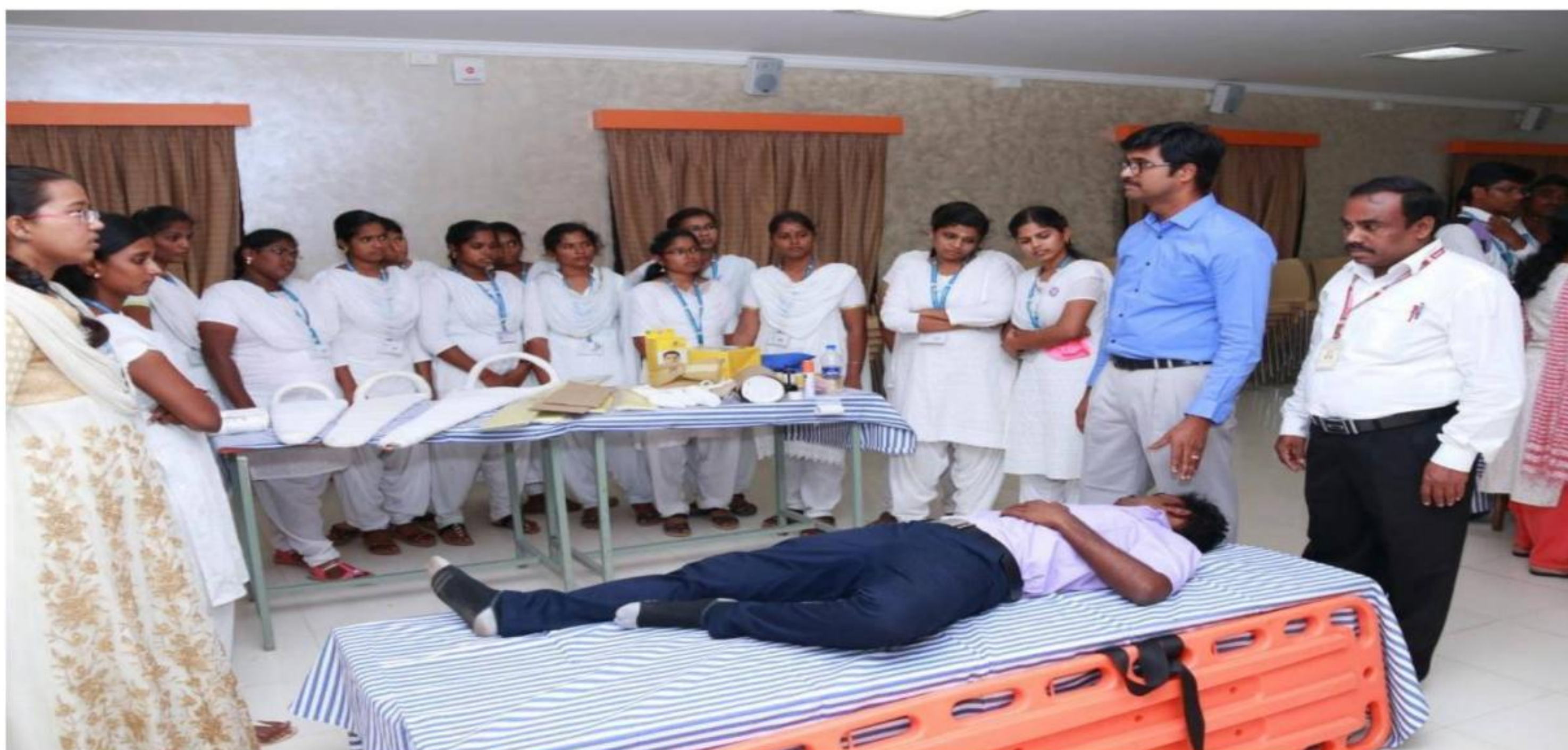
A one day workshop on First Aid- Awareness Programme - Date: 10.08.2018