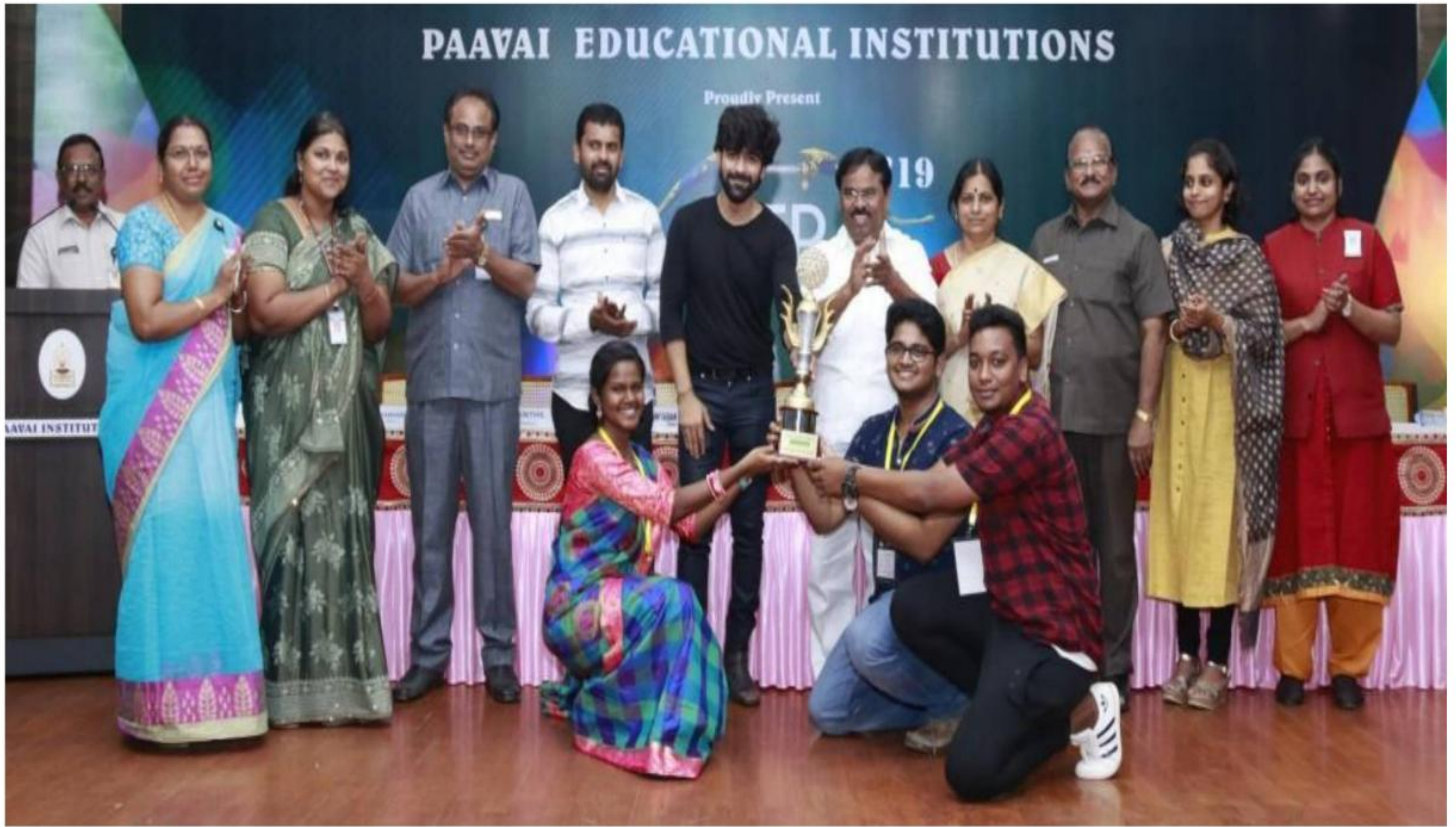
ASTRA-2019 - Date: 07.02.2019 & 08.02.2019