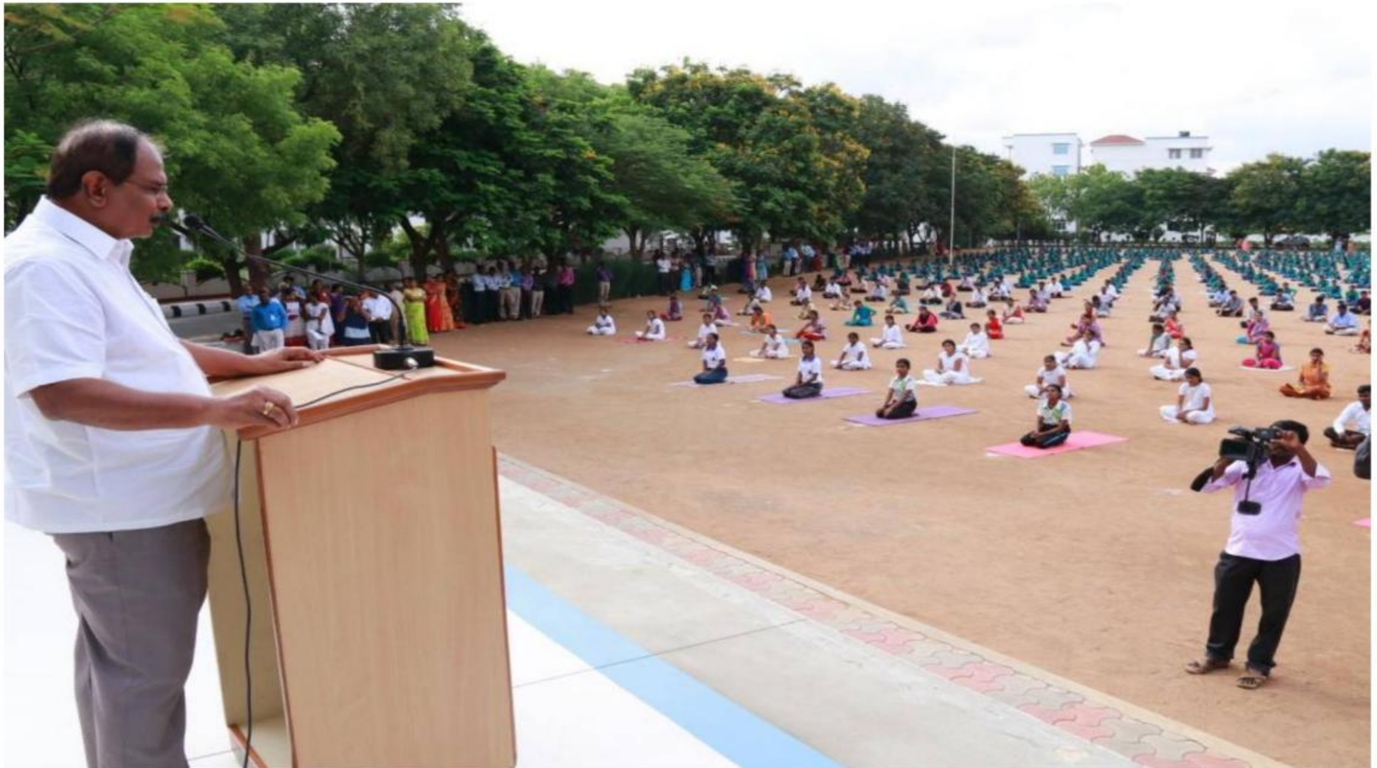
International Yoga Day Awareness and Celebration - Date: 21.06.2018