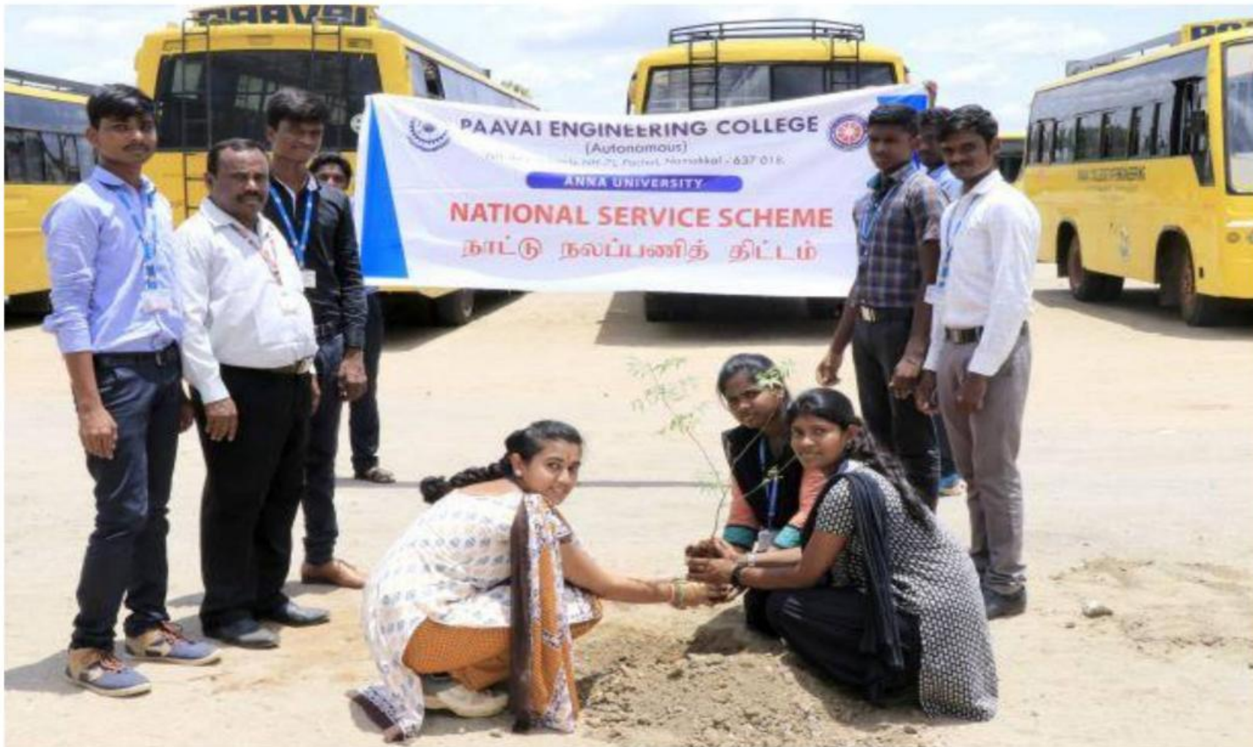
TREE PLANTATION - DATE: 14.08.2019