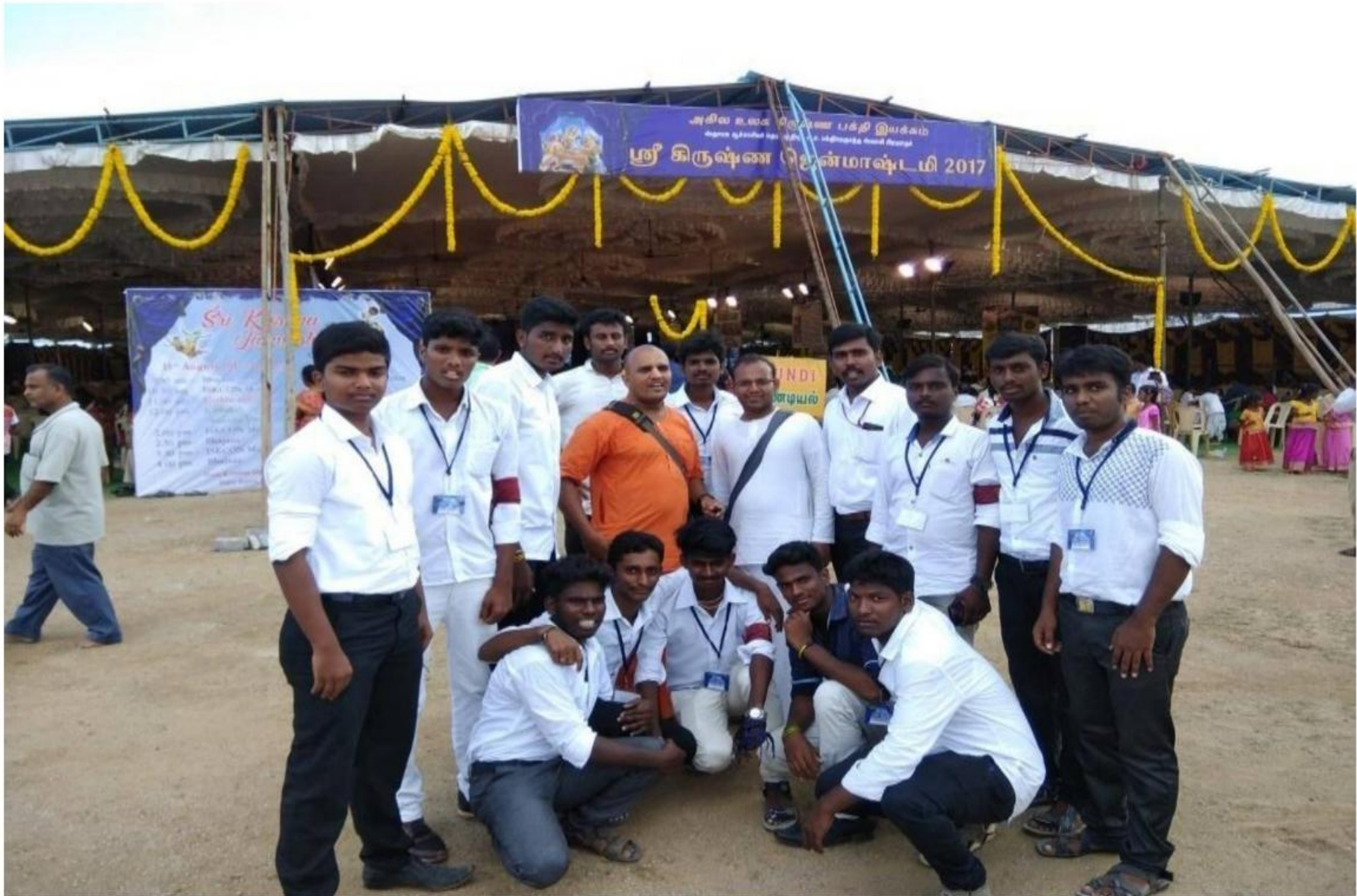
NSS Volunteership for Janmasthanmi-ISKCON, Salem on 15.08.2017

Our NSS Volunteers helped and supported various functions organized in the Krishna Jayanthi- Janmasthanmi, ISKCON, Salem on 15.08.2017 (Tuesday). Our students involved in the food committee, making the crowd properly visiting the Lord Krishna temple. In this activity 50 volunteers were participated.