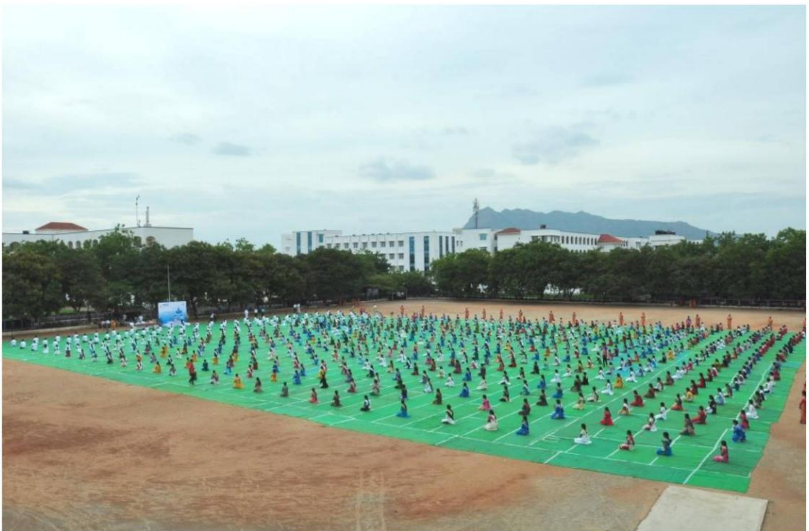
International Yoga Day Awareness and Celebration - Date: 21.06.2019