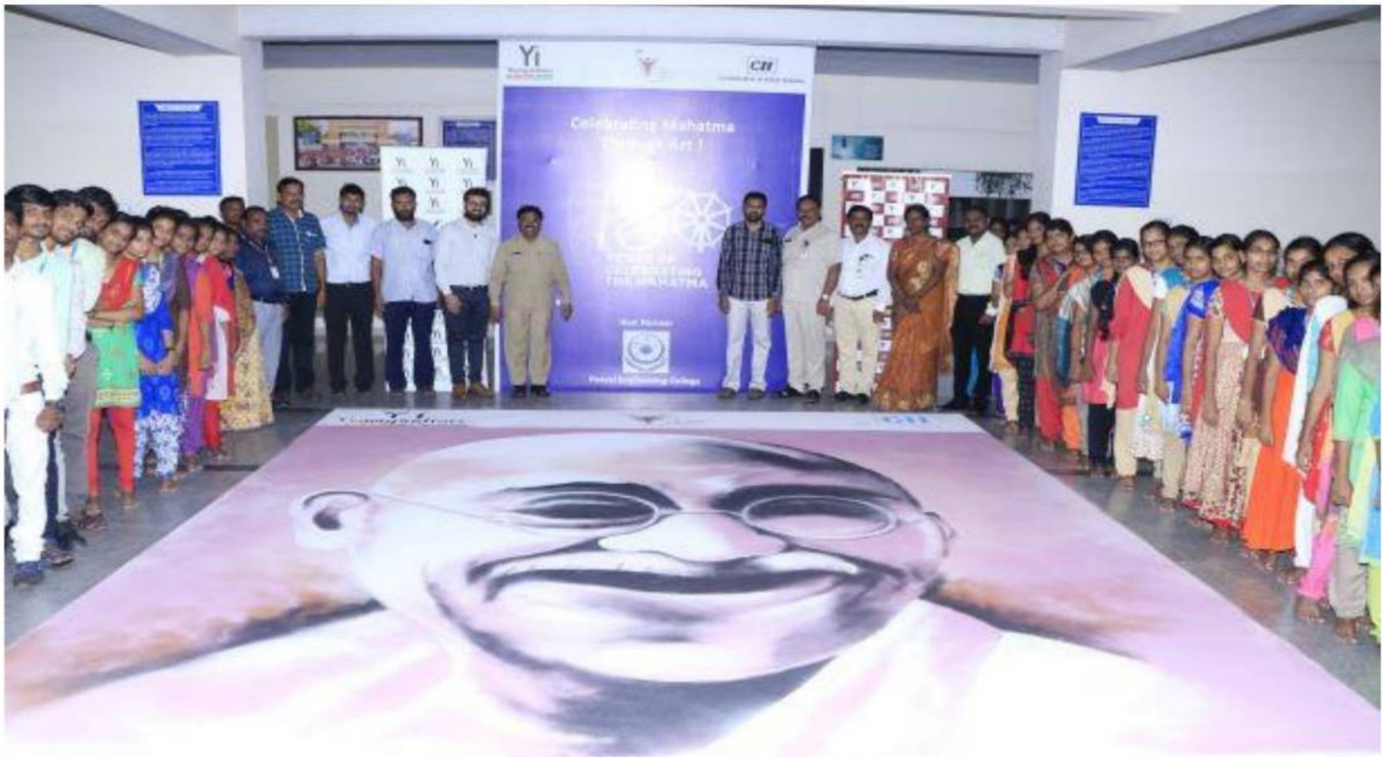
150 TH BIRTHDAY CELEBRATION OF MAHATMA GANDHI - DATE: 13.09.2019