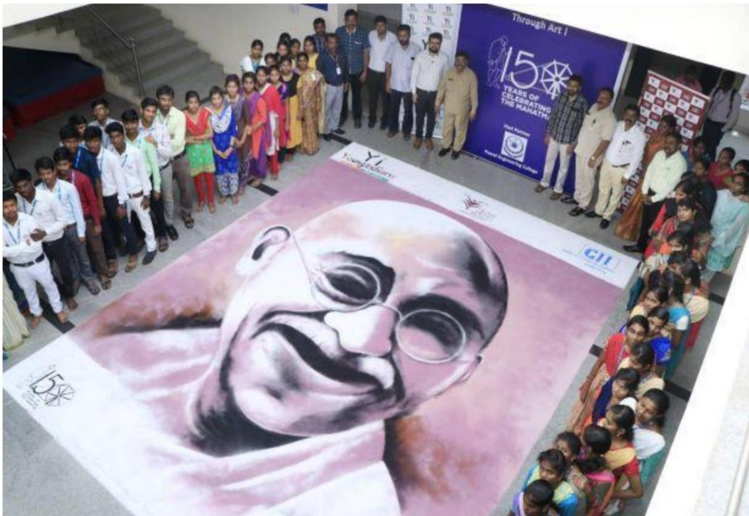
150 TH BIRTHDAY CELEBRATION OF MAHATMA GANDHI - DATE: 13.09.2019