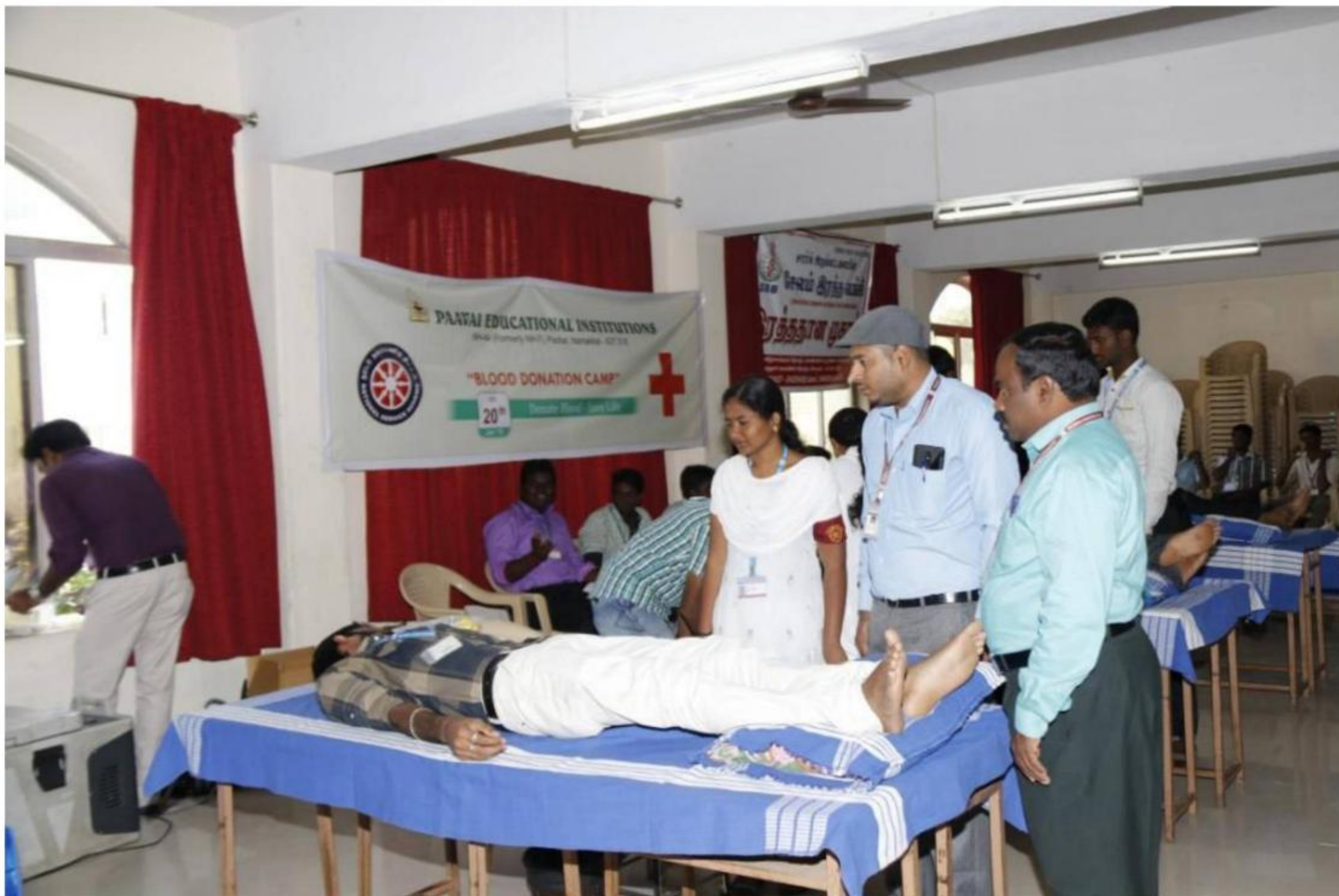
Blood Donation Camp on 20.01.2018