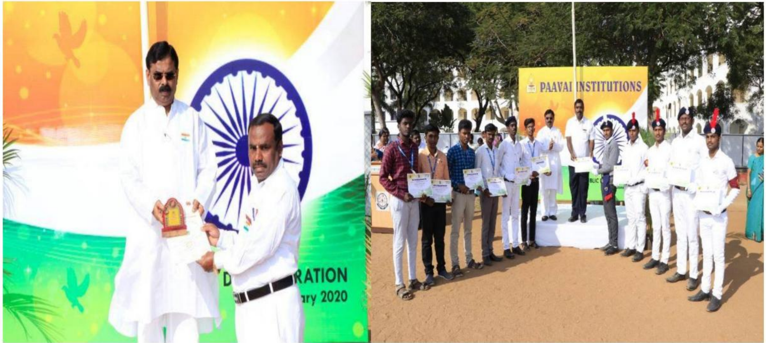
REPUBLIC DAY CELEBRATION - DATE: 26.01.2020