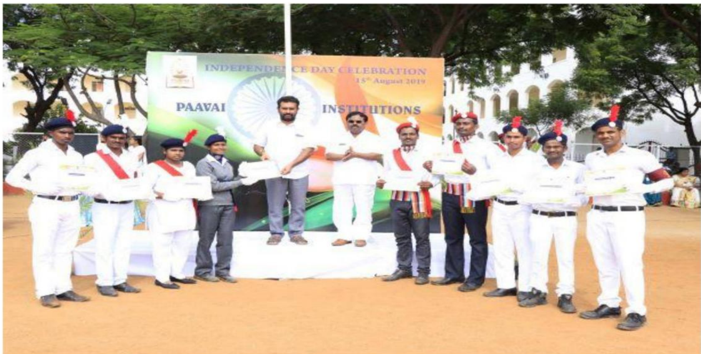
INDEPENDENCE DAY CELEBRATION - DATE: 15.08.2019