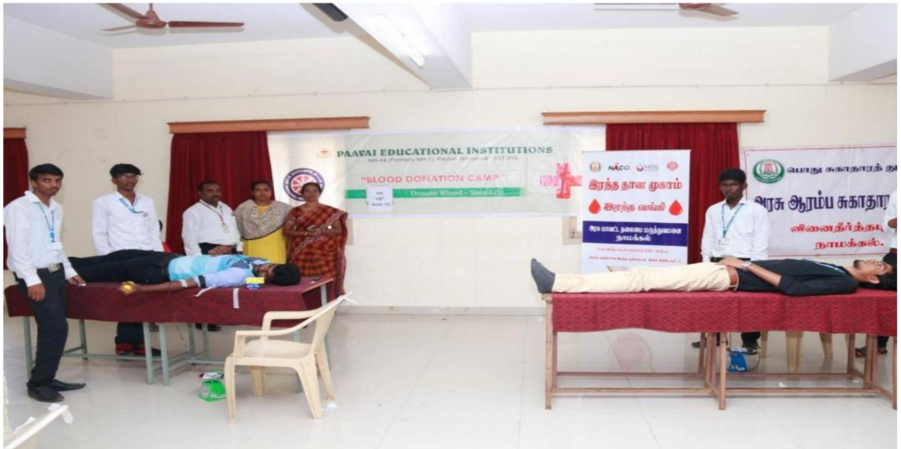
Blood Donation Camp - Date: 18.08.2018