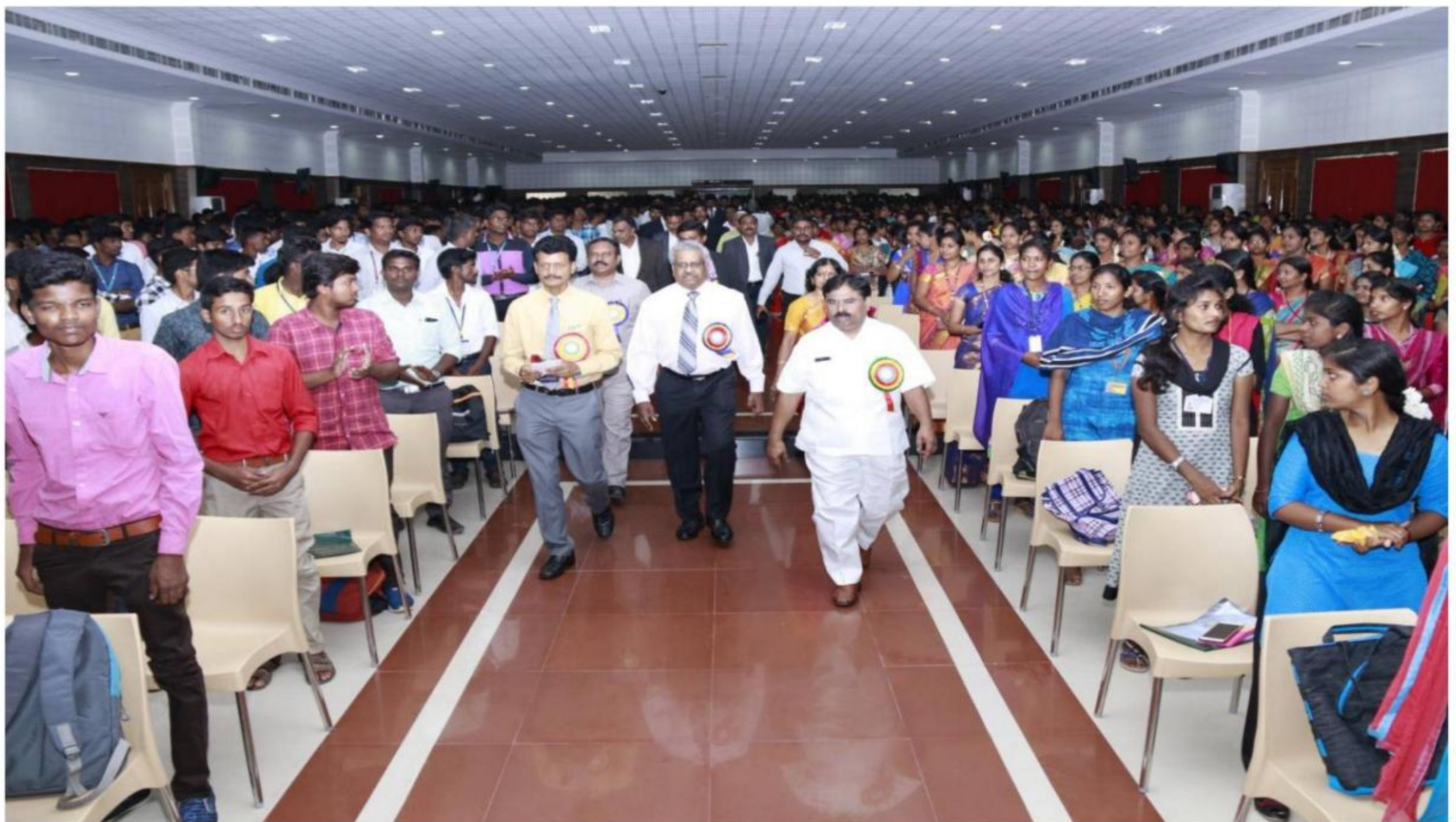
Techfinix-'18 2.0 - Date: 28.09.2018 & 29.09.2018

A two day national level technical symposium Techfinix'18 – 2.0 was organized by the departments of Paavai Engineering College on 28th and 29th September 2018. Students from various colleges all over Tamilnadu participated in 40+ events like paper presentation, project expo, code debugging, robo war, IC racing, aviation art, trac hunk, chemophilia, brick art work, spunky bit, swell-o-net, blind coddling, circuitrix, circuit debugging, water rocketry, robo soccer etc., on these two days. We provided the volunteer ship for Techfinix-'18 2.0 various events. Our NSS volunteers 80 students were provided the volunteer ship in this programme.