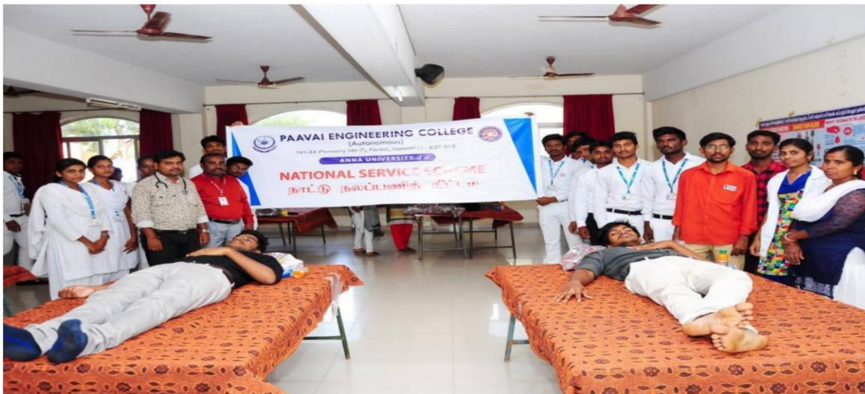
MEDICAL-EYE-DENTAL-BLOOD DONATION CAMP - DATE: 04.02.2020