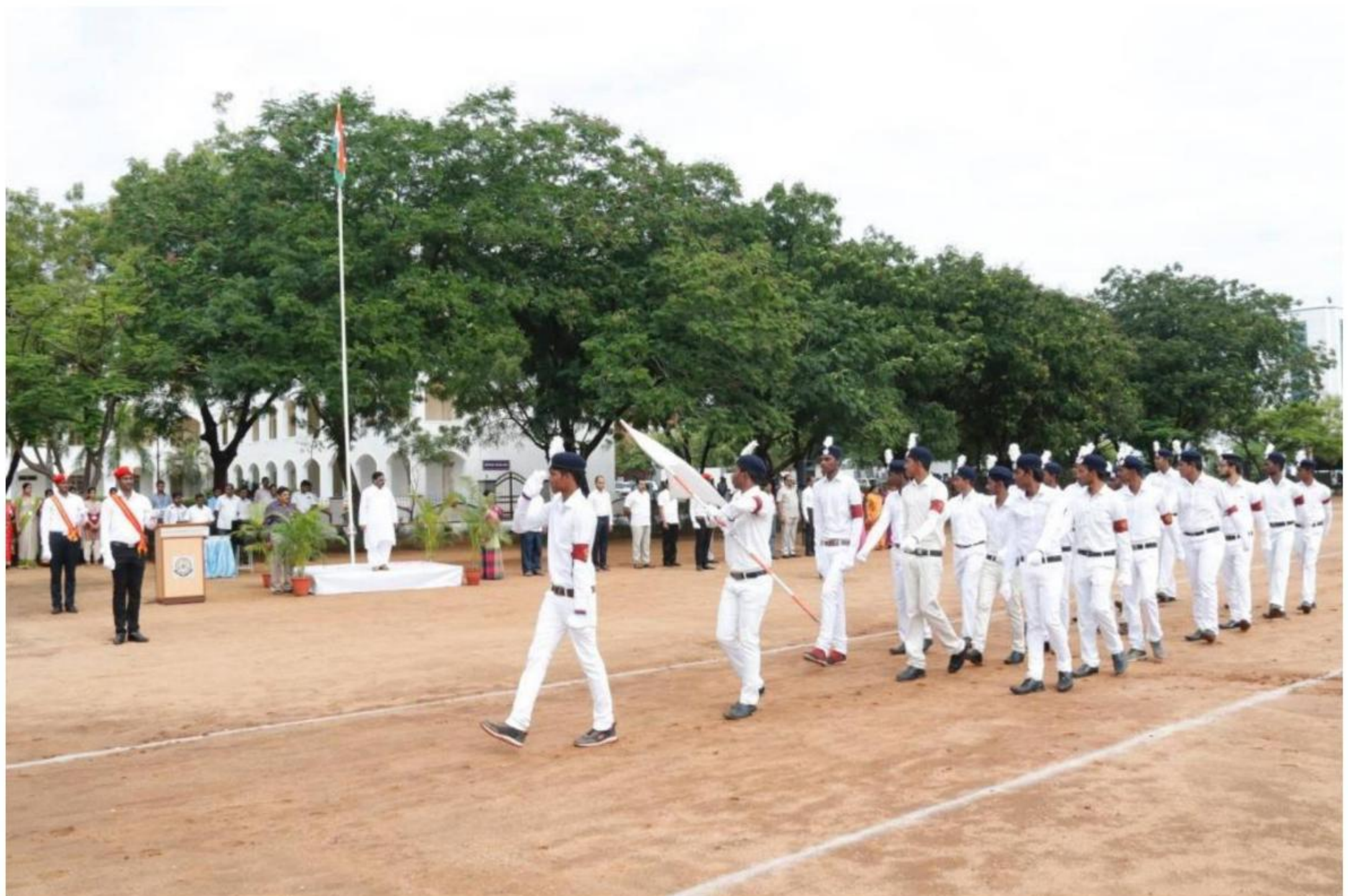
Independence Day Celebration on 15.08.2017

We celebrated our Independence Day on 15 th August, 2017. Our NSS volunteers more than 75 students willingly participated in the march past. At the end of the programme, Independence oath was taken by our students.