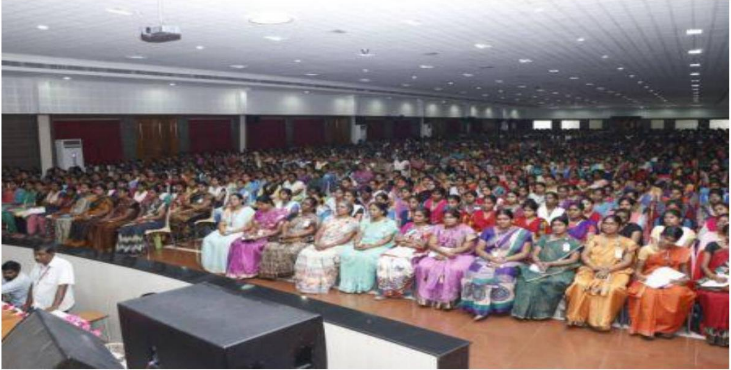
INTERNATIONAL WOMEN'S DAY CELEBRATION - DATE: 07.03.2020