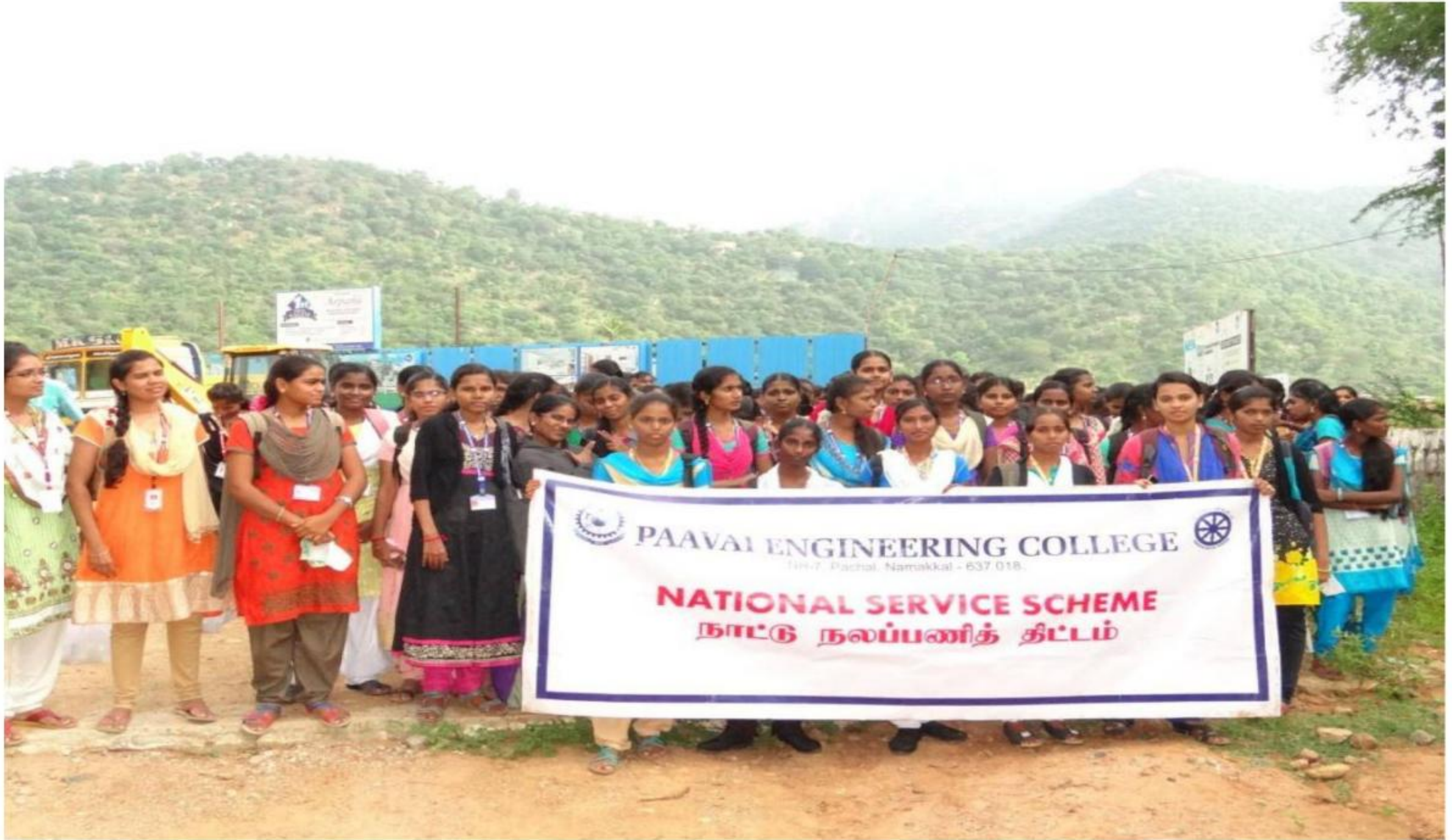
Trekking Expedition on 25.09.2017

Our students and faculty members went on a trekking expedition to Yercaud on 25.09.2017 (Saturday). It was a long adventurous journey undertaken on foot by the first year students. In this trekking program 100 students were participated.