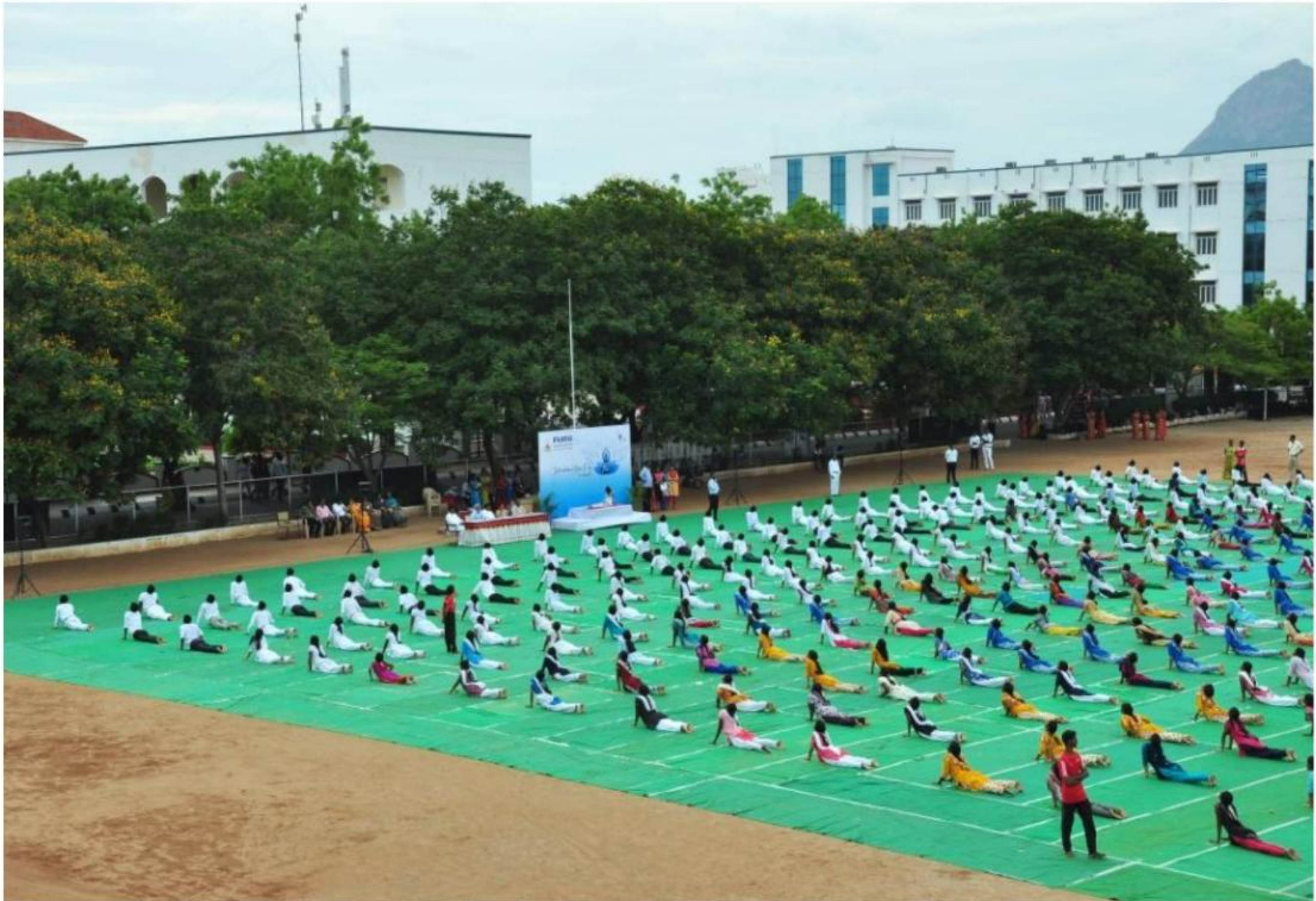
International Yoga Day Awareness and Celebration - Date: 21.06.2019