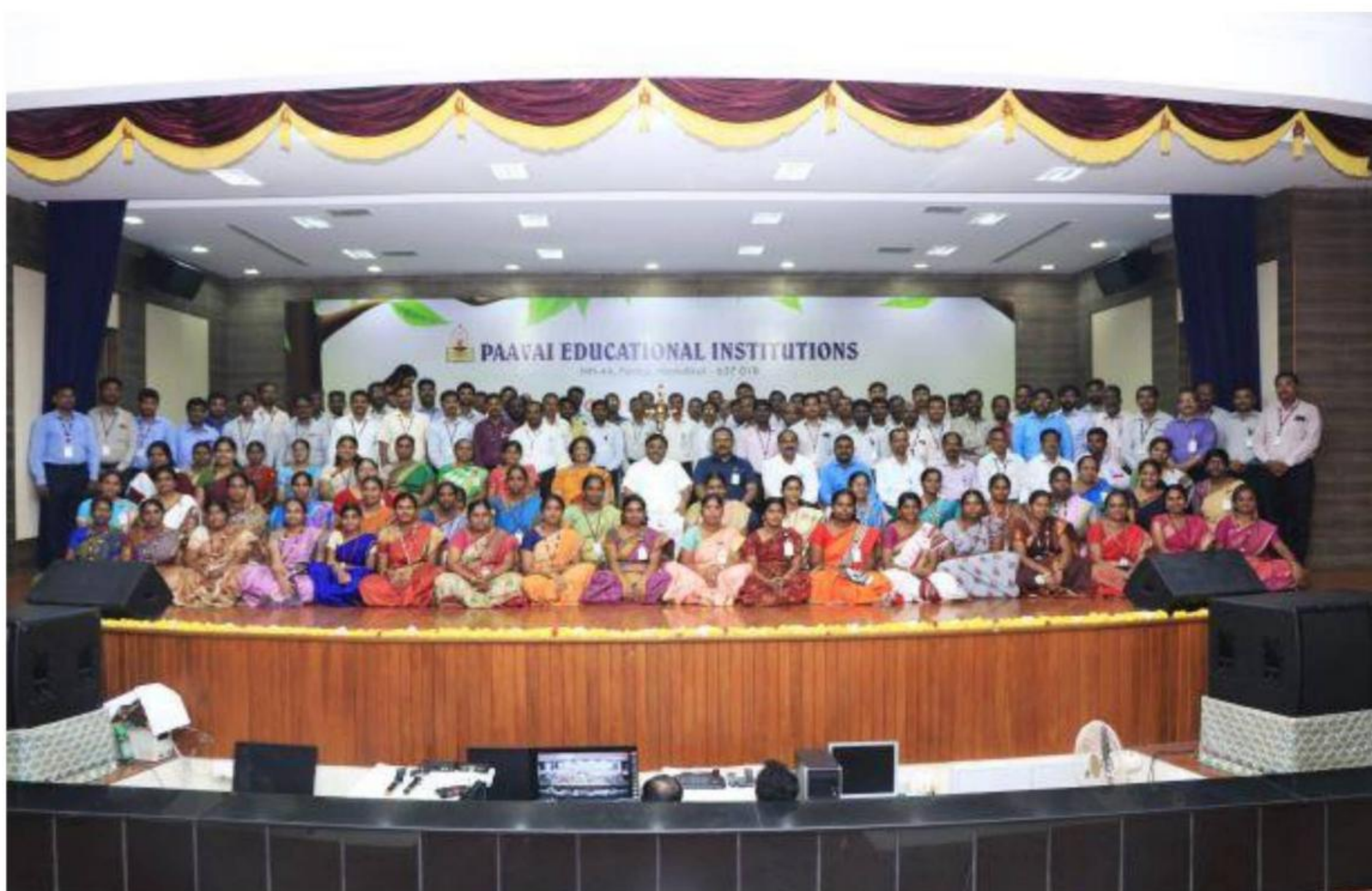
TEACHERS DAY CELEBRATION - DATE: 10.09.2019