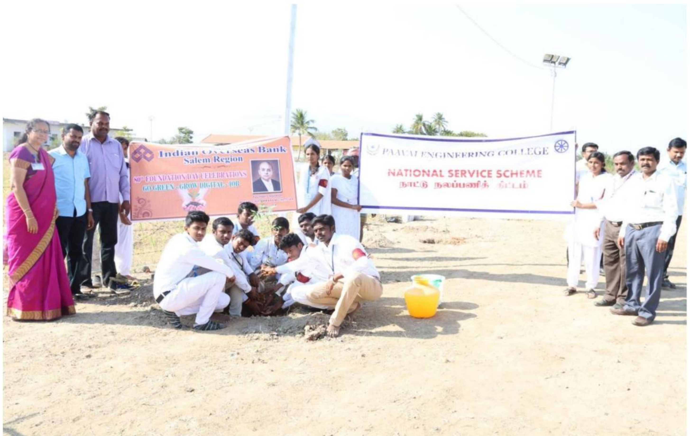
Tree Plantation on 10.02.2017 Our NSS Volunteers Planting the Trees in the Bus Yard premises