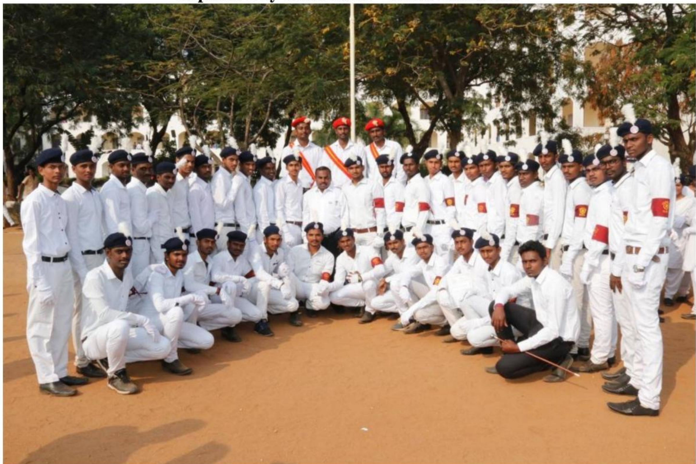
Republic Day Celebration on 26