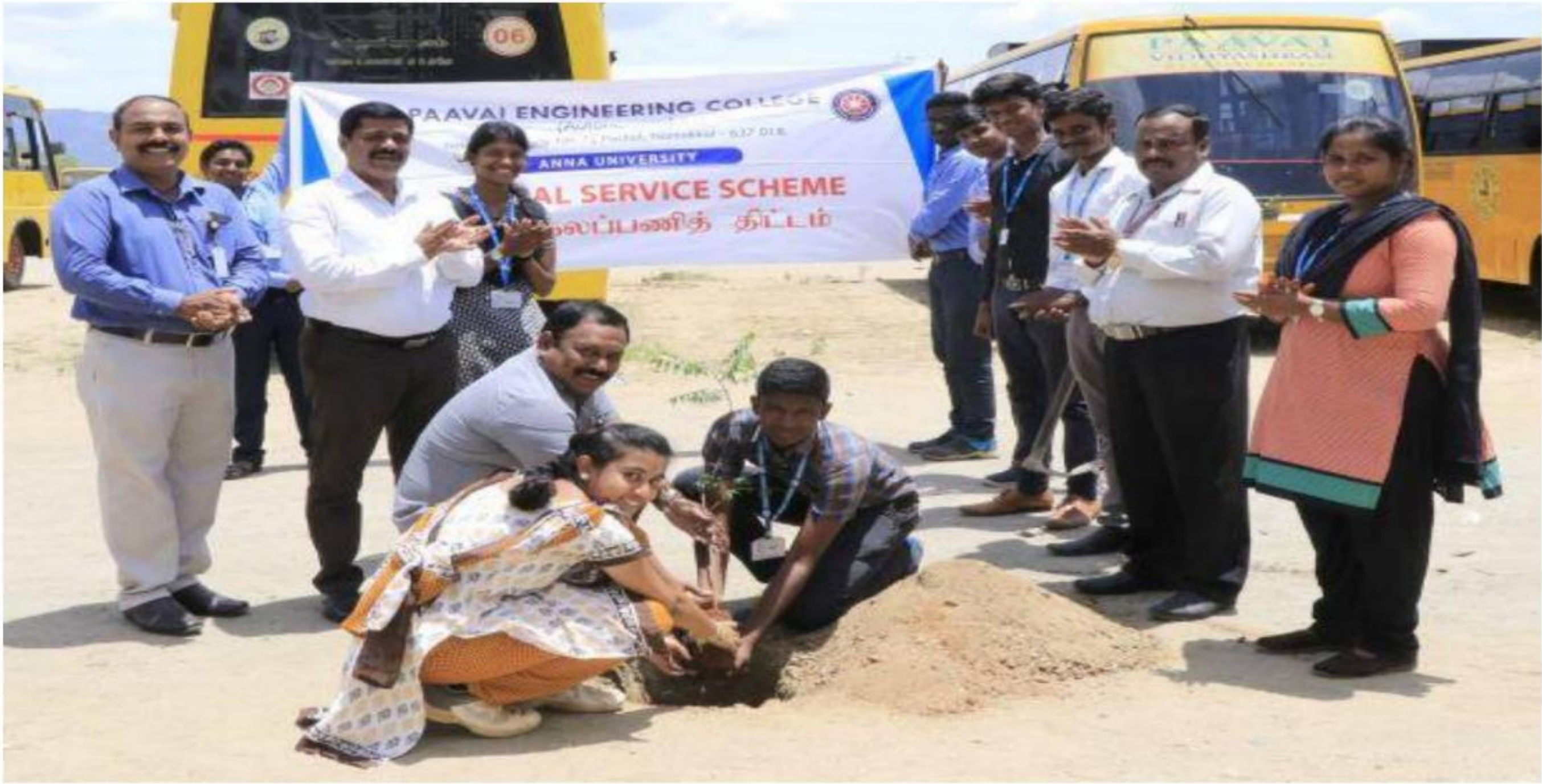
TREE PLANTATION - DATE: 14.08.2019

In connection with “One Student One Tree”, Paavai Engineering College, NSS Volunteers planted the saplings around in the Bus Yard on 14.08.2019 (Wednesday). We planted 100 saplings and provided the roof for the trees. In this tree plantation activity 25 volunteers were participated.