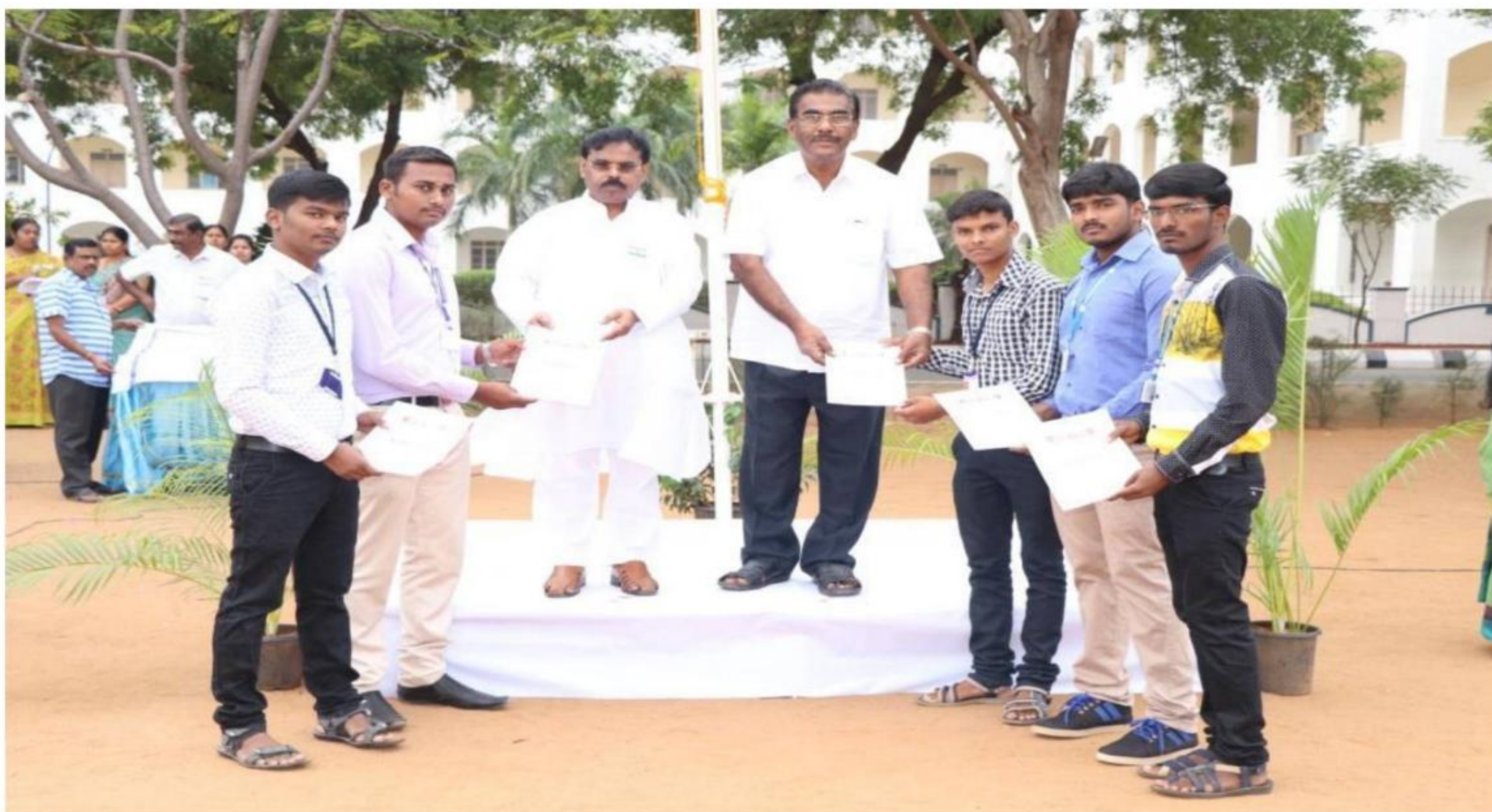
Republic Day Celebration on 26.01.2017 NSS Volunteers in the Republic Day March Past and Receiving Blood Donation certificates