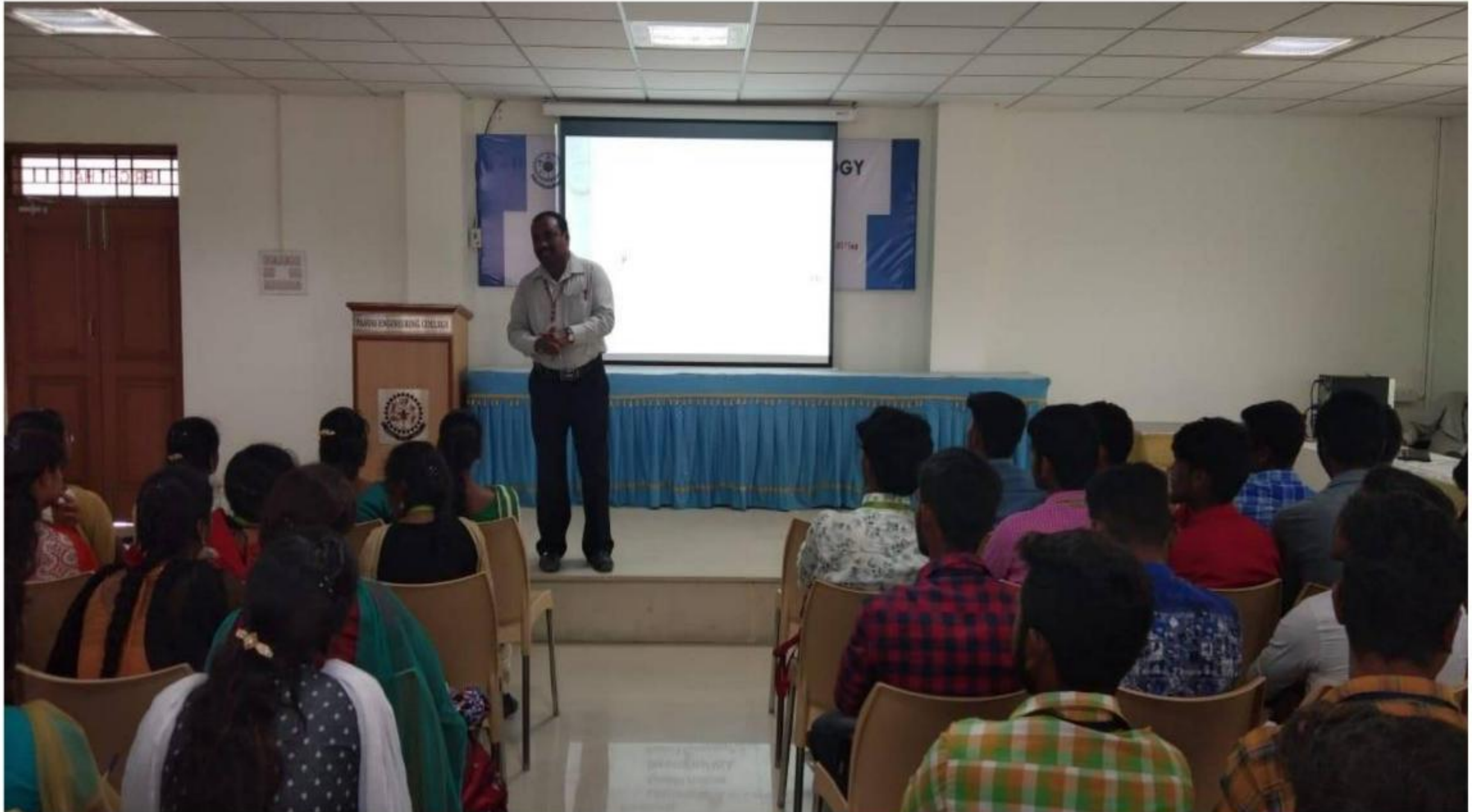
GENERAL ORIENTATION PROGRAMME - DATE: 12.09.2019

We conducted a general orientation programme for all NSS volunteers in our college on 12.09.2019 (Thursday). The NSS History, Motto, Logo, organizing NSS regular activities and special camp activities were presented to the volunteers. The NSS activities for the academic year 2019-20 were discussed. All the first year volunteers were participated in this event.