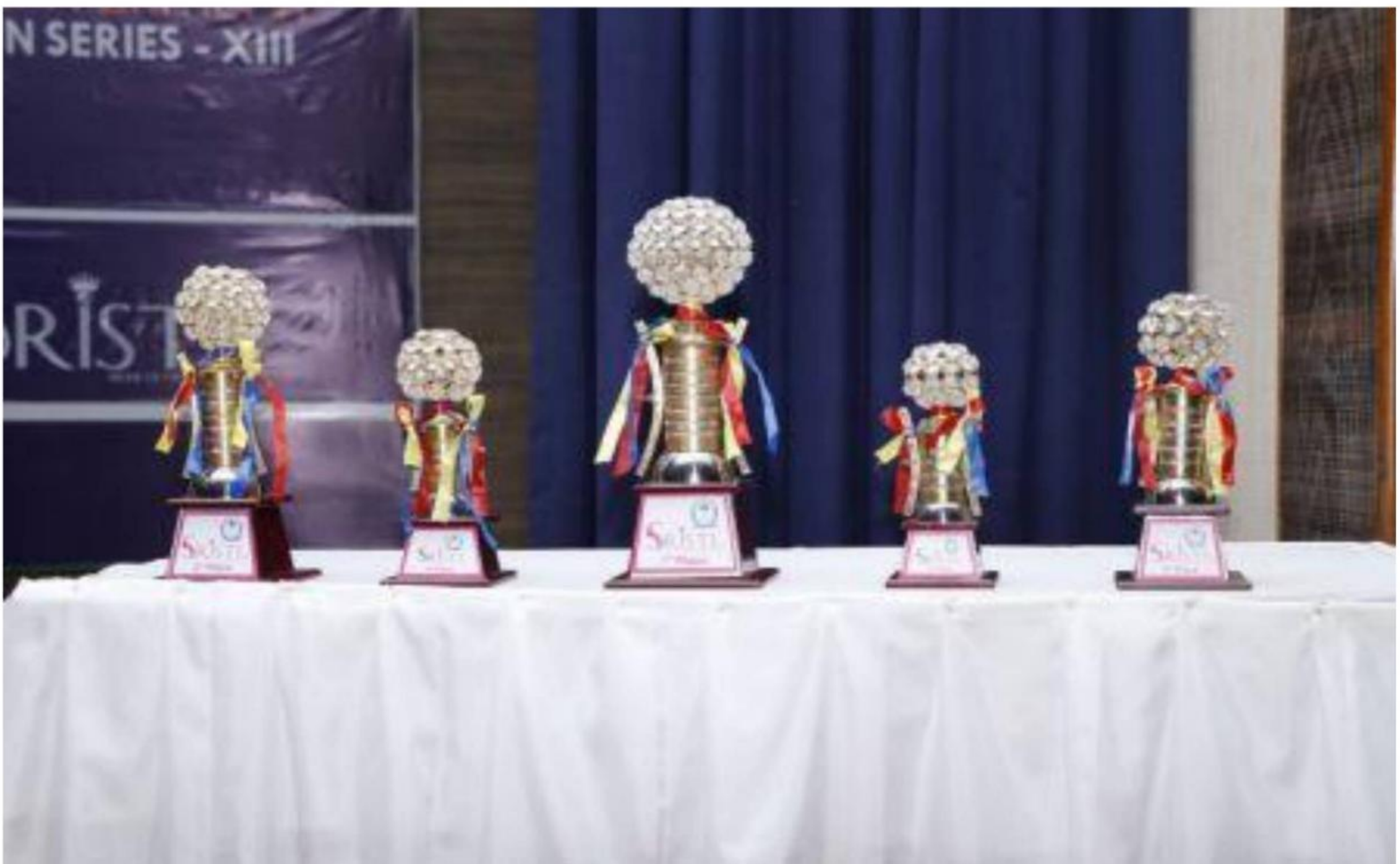
INTERNATIONAL WOMEN'S DAY CELEBRATION - DATE: 07.03.2020