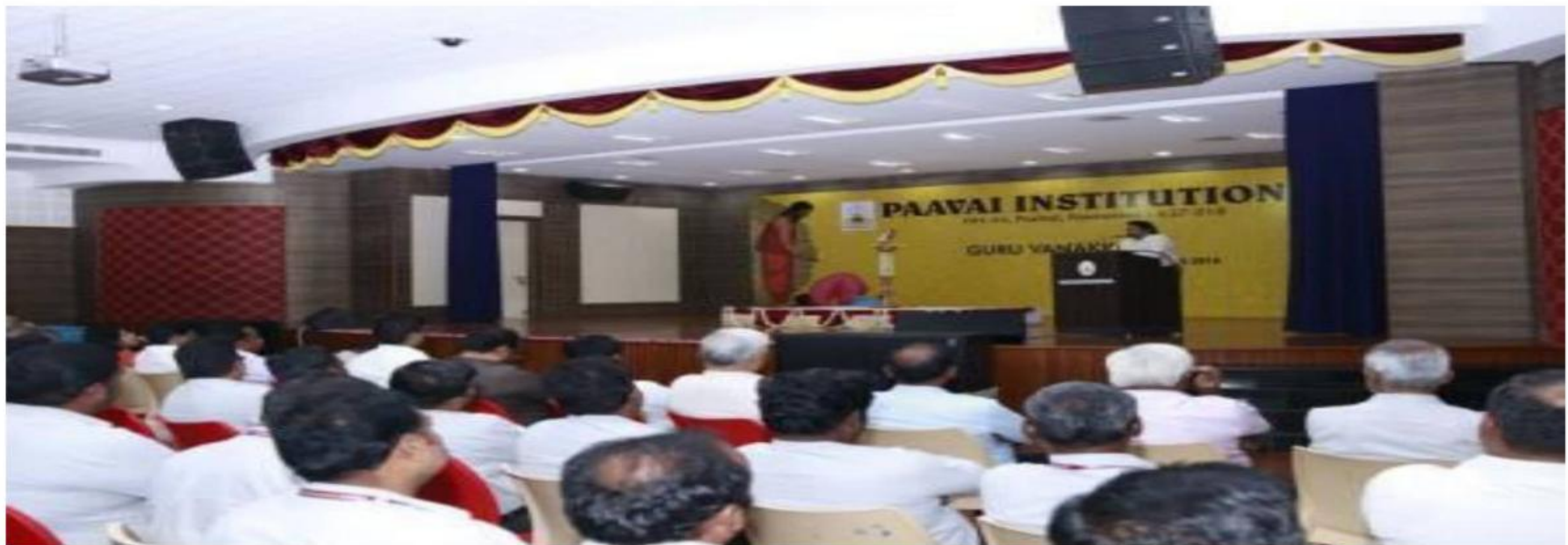
Teachers Day Celebration - Date: 10.09.2018