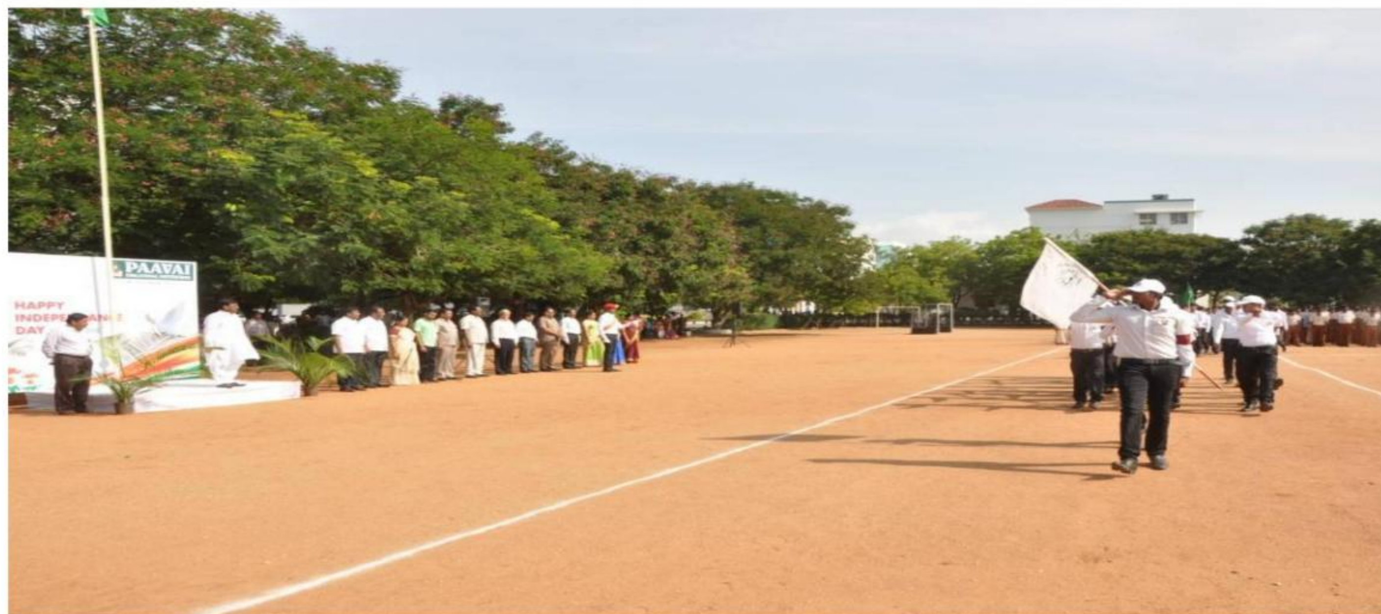
Independence Day Celebration on 15.08.2016 Our NSS Volunteers March past in the Independence Day Celebration

We celebrated our Independence Day on 15 th August, 2016. Our NSS volunteers more than 100 students willingly participated in the march past. At the end of the programme, Independence oath was taken by our students.