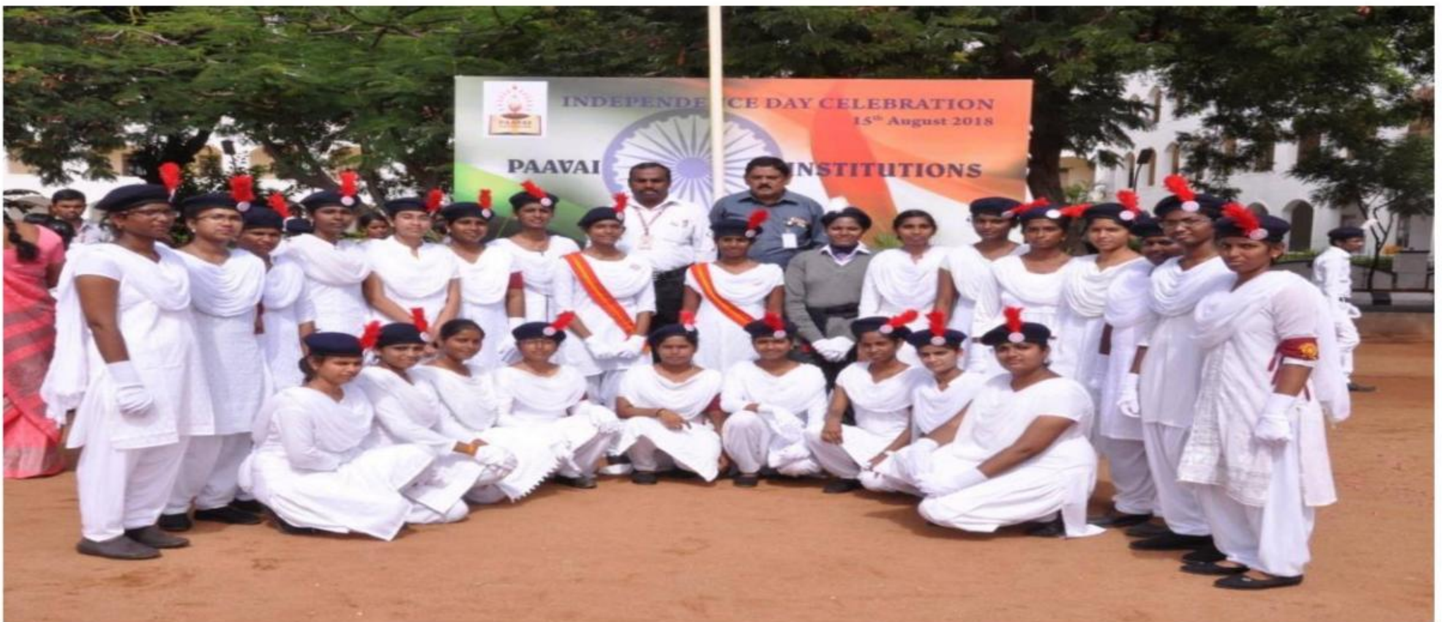
Independence Day Celebration - Date: 15.08.2018