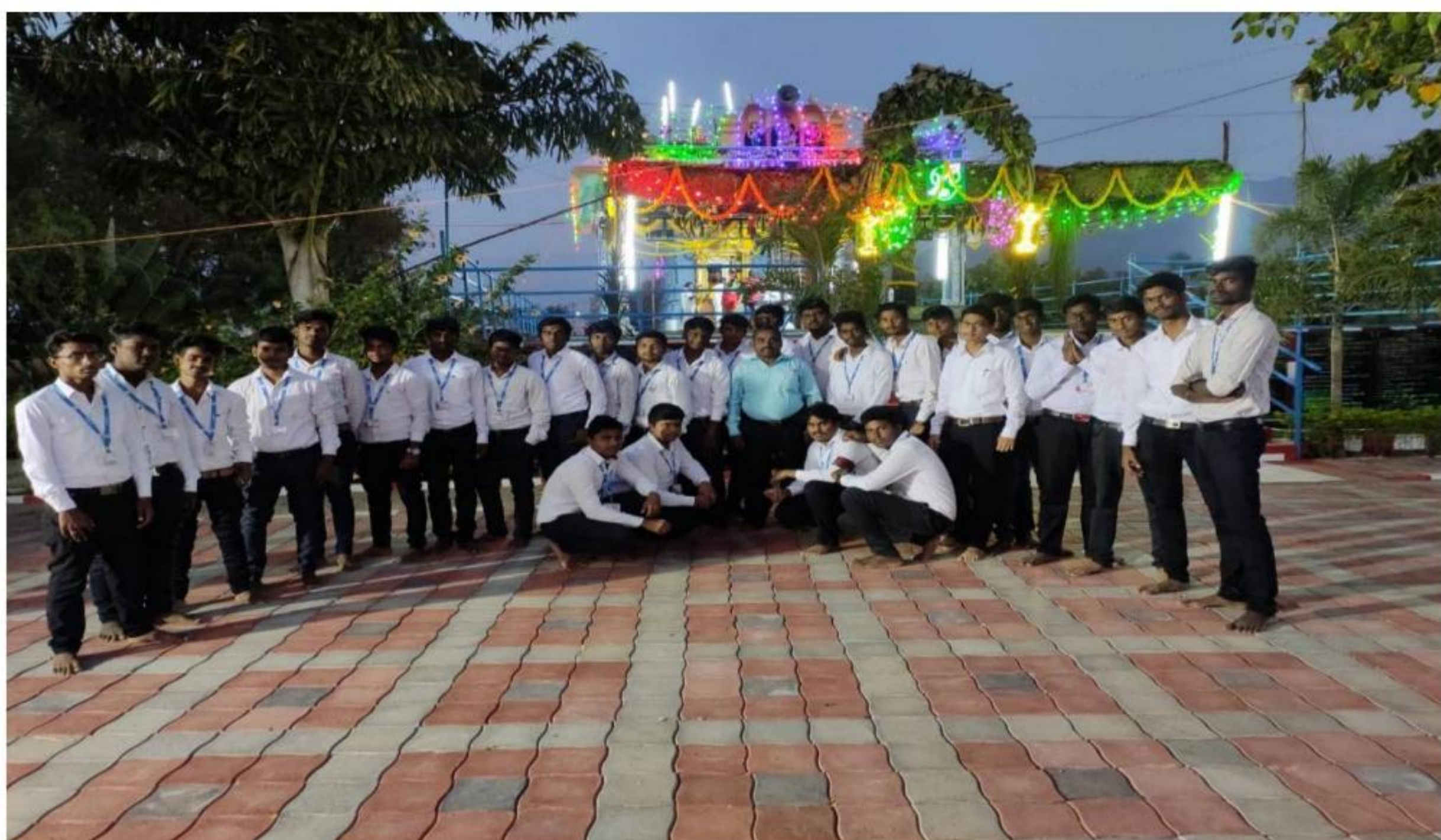
KASI VINAYAKAR KOVIL KUMBHASEIKAM VOLUNTEER SHIP – DATE: 26.02.2020