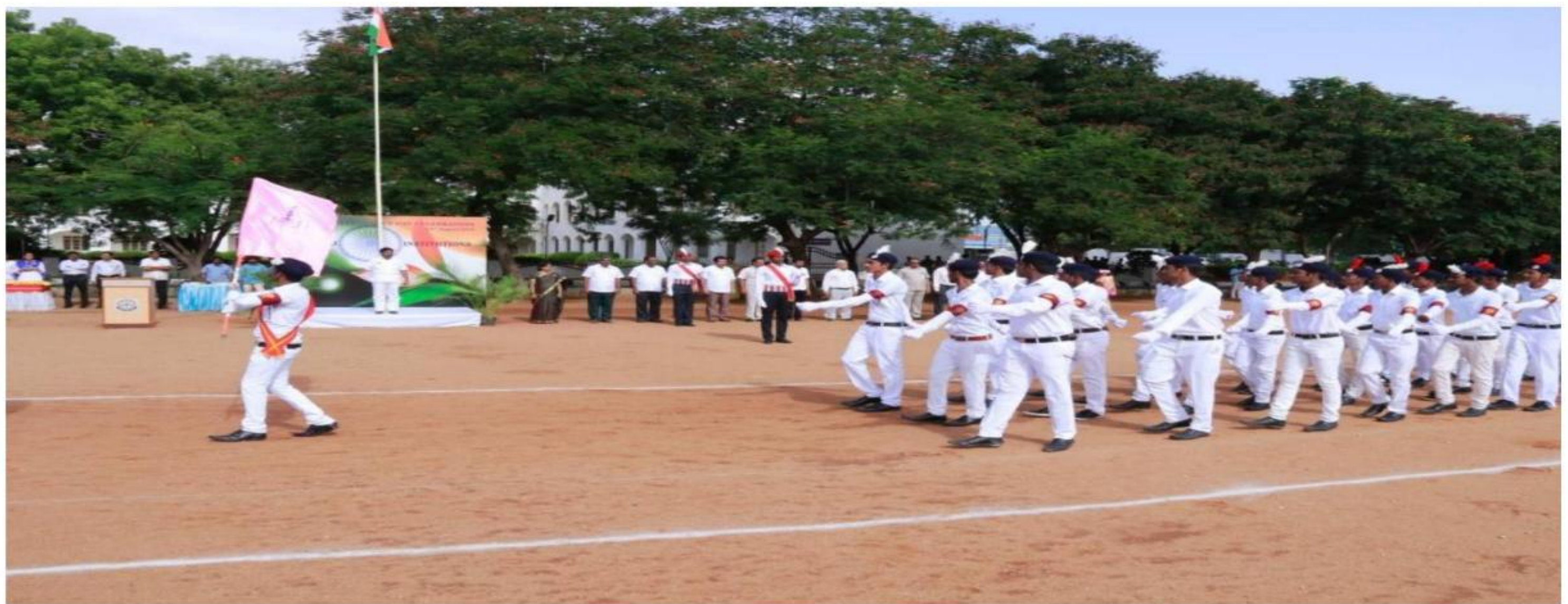
Independence Day Celebration - Date: 15.08.2018

We celebrated our Independence Day on 15 th August, 2018. Our NSS volunteers more than 75 students willingly participated in the march past. At the end of the programme, Independence oath was taken by our students. The NSS Volunteers and Blood donors honored with the Certificates.