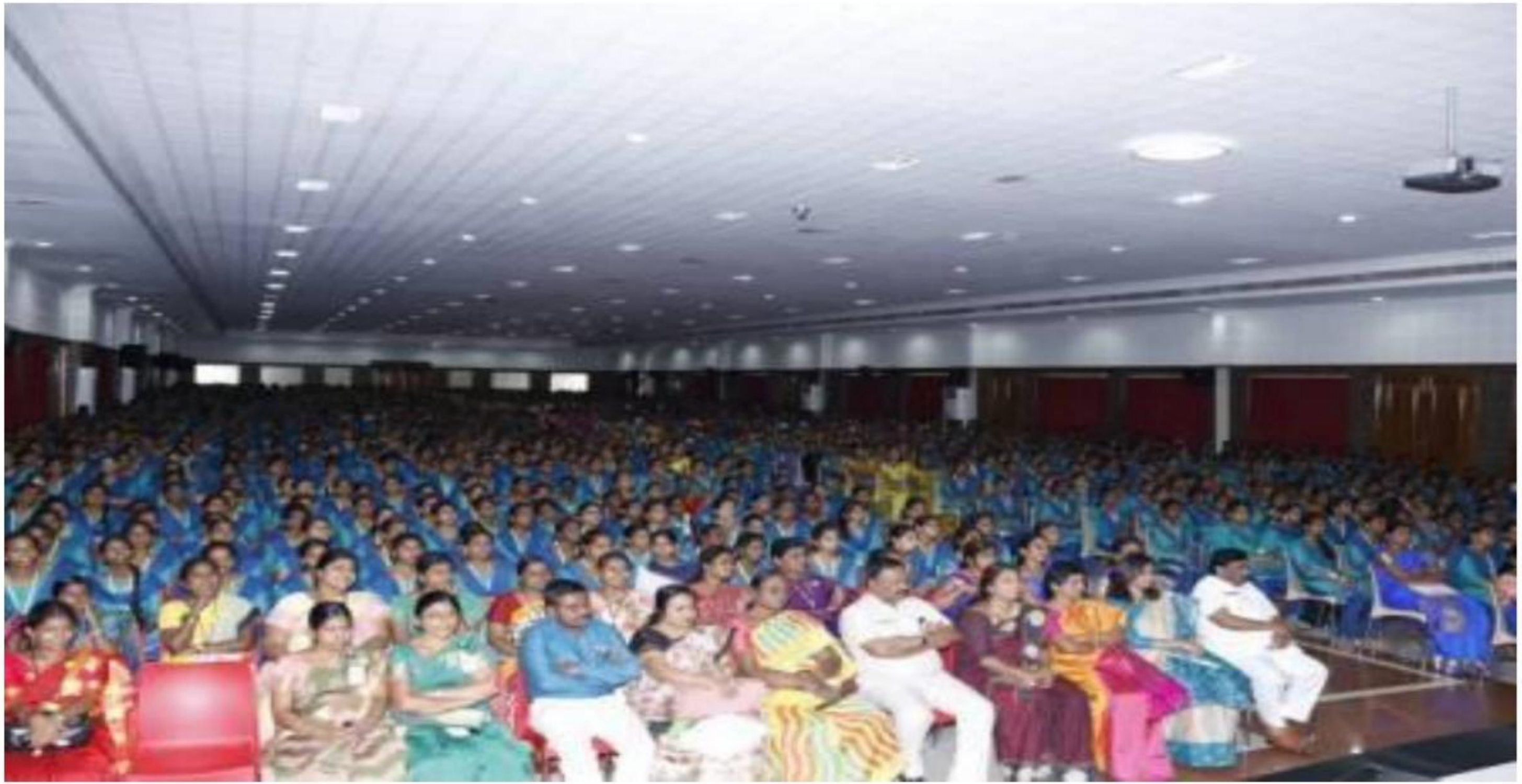
International Women's Day Celebration on 08.03.2017