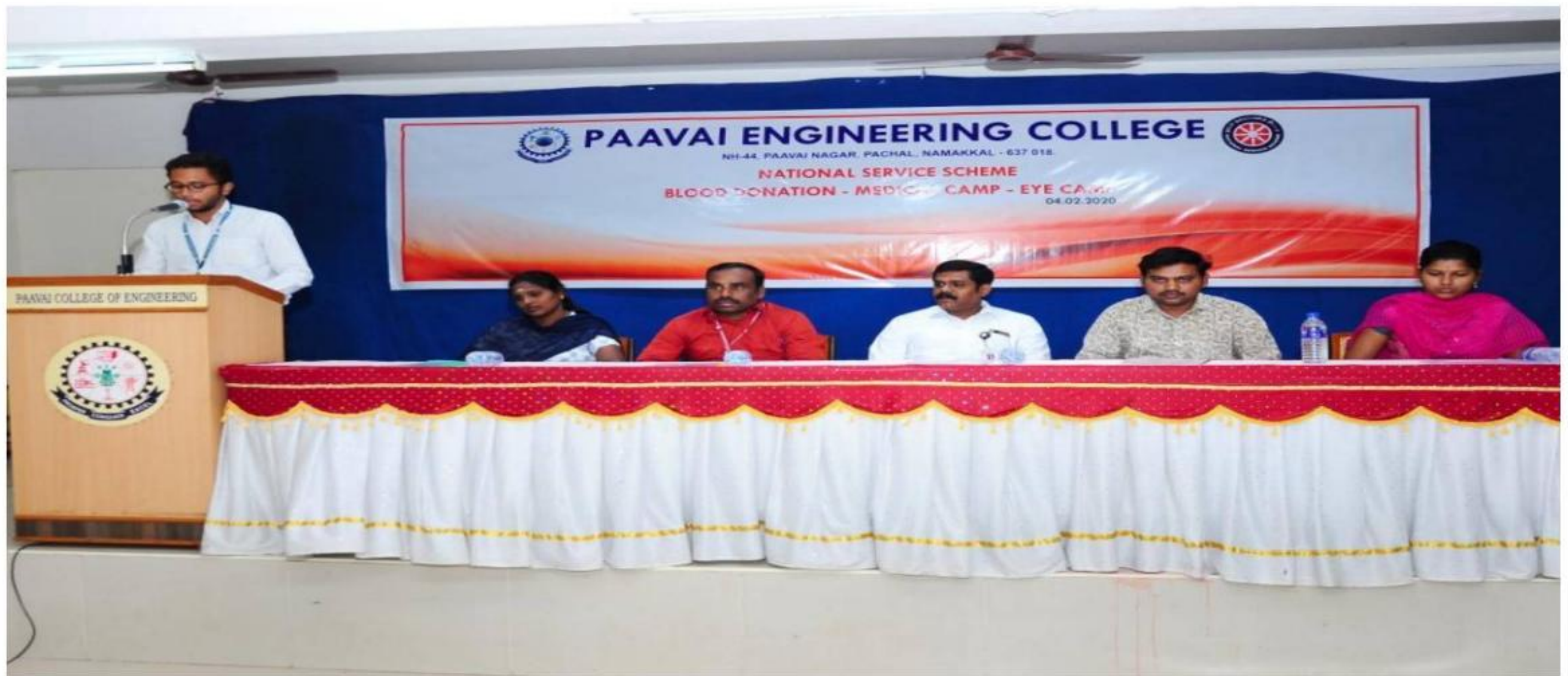
MEDICAL-EYE-DENTAL-BLOOD DONATION CAMP - DATE: 04.02.2020