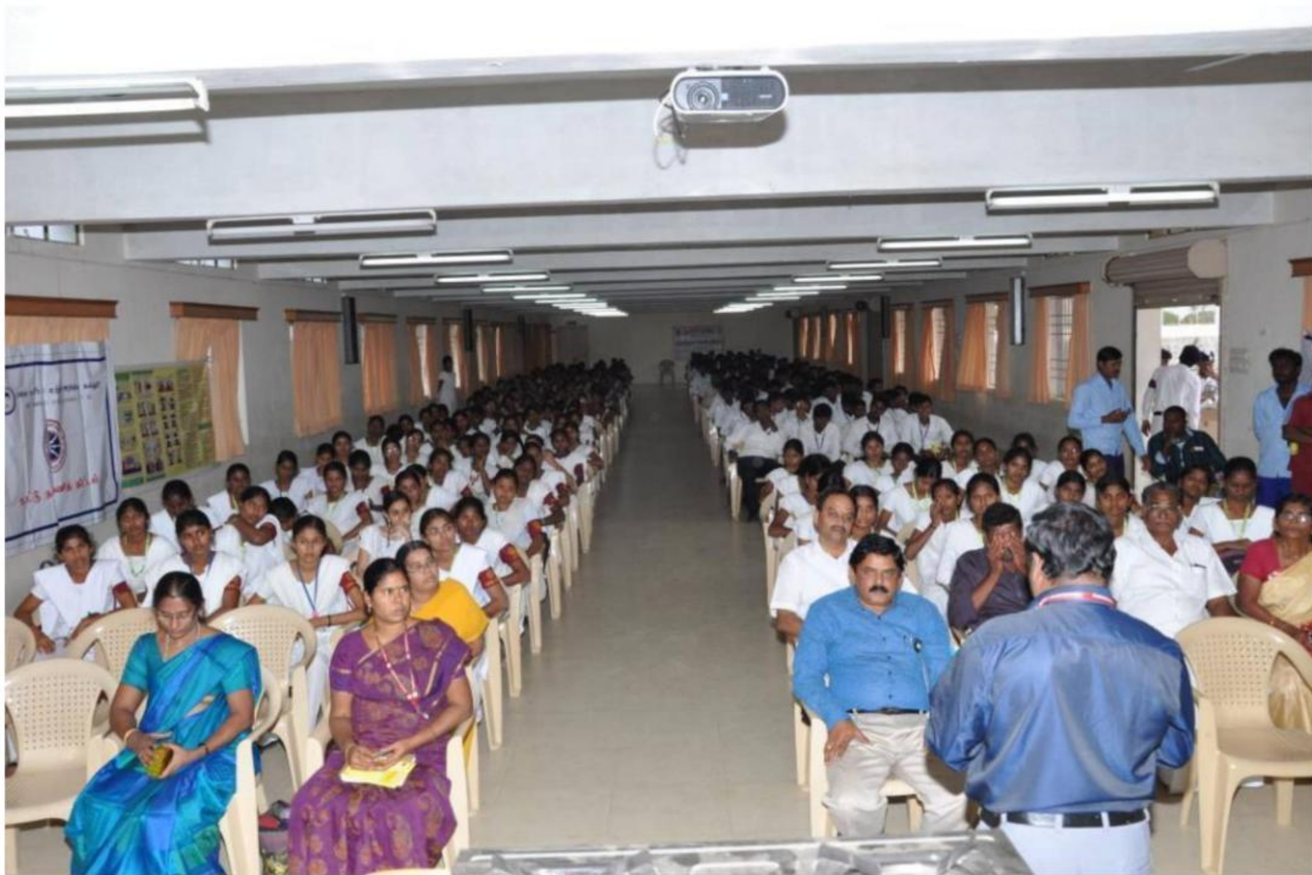
General Orientation Programme on 01.09.2017