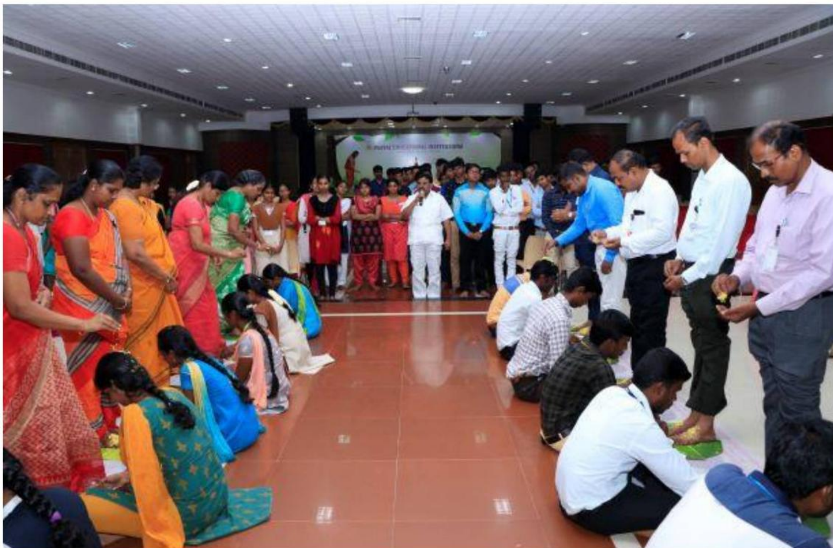
TEACHERS DAY CELEBRATION - DATE: 10.09.2019