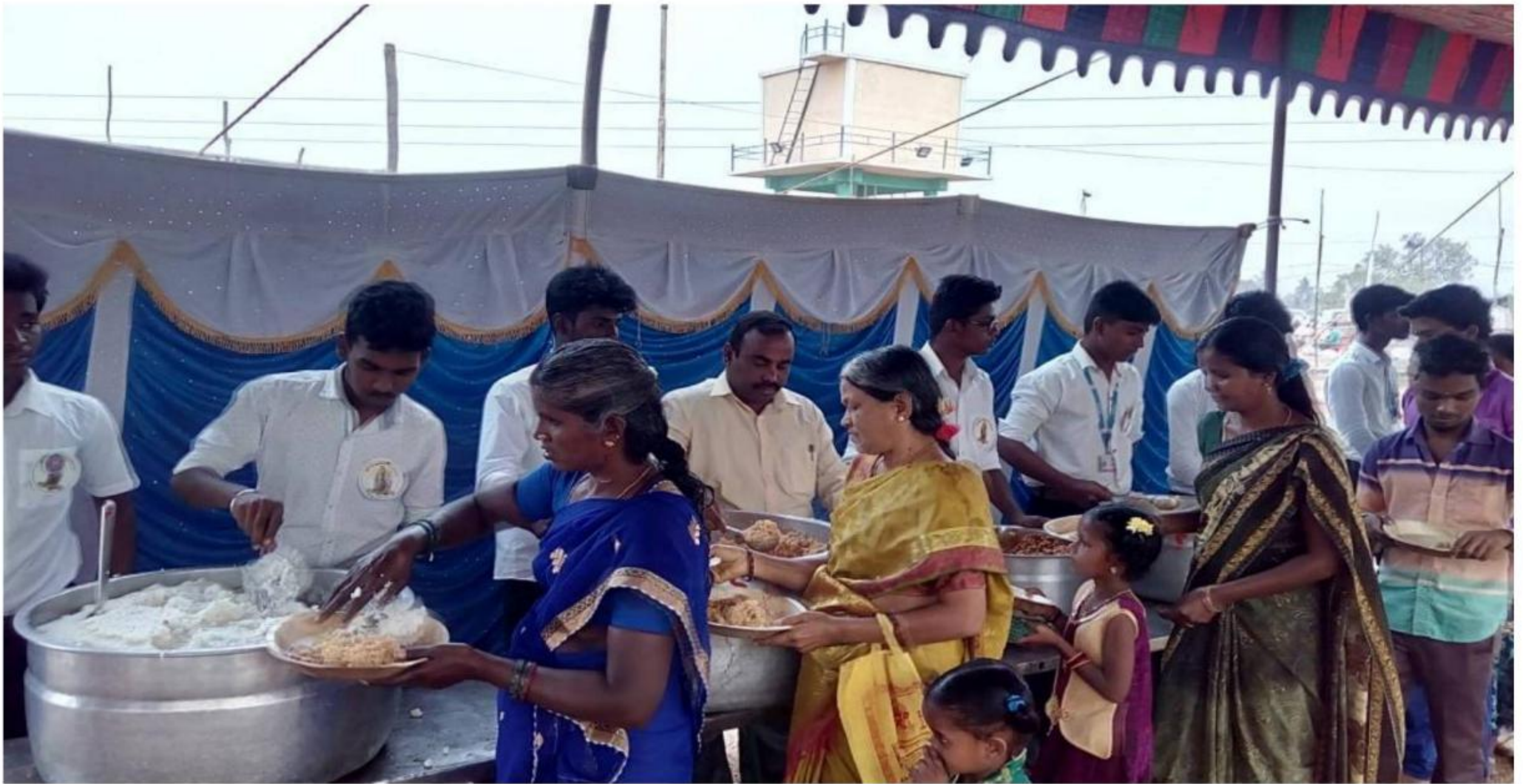
Sri Shirdi Saibaba Kovil Kumbhaseikam Volunteer ship - Date: 10.02.2019

Our NSS provided NSS volunteer ship for Sri Shirdi Saibaba Kovil Kumbhaseikam on 10.02.2019 (Sunday) at Moogilkuthu Thathanoor, Salem. Our students involved in the food committee, making the crowd properly visiting the Sri Shirdi Saibaba temple. In this activity 100 volunteers were participated.