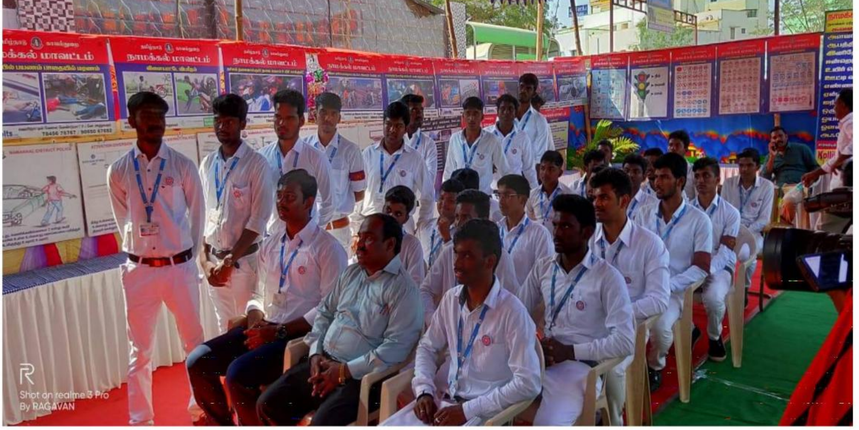
ROAD SAFETY AWARENESS PROGRAMME - DATE: 21.01.2020