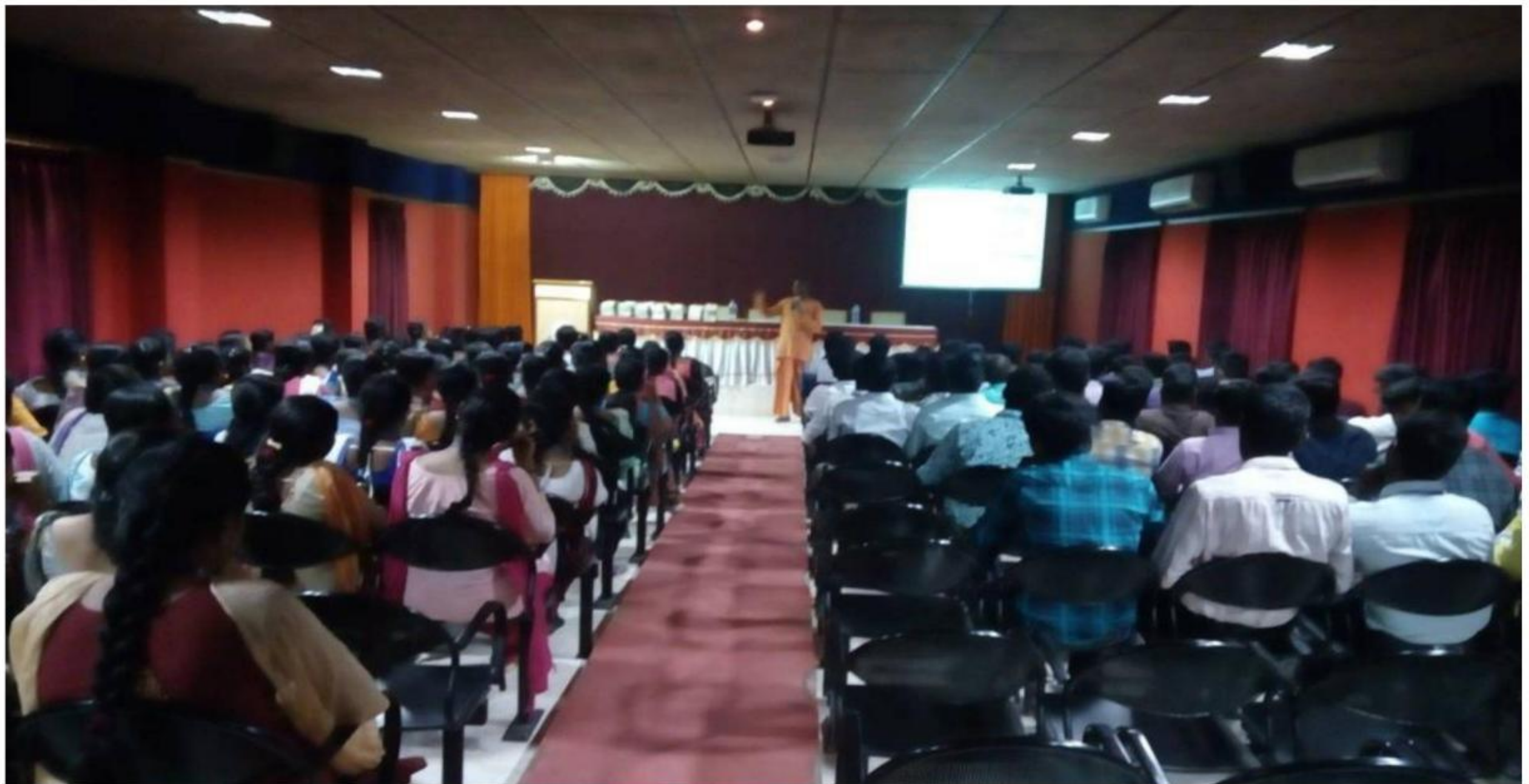
Spiritual Orientation Programme - Date: 20.12.2018

We conducted a spiritual orientation programme for all students in our college on 20.12.2018 (Thursday). The Lord Krishna History, Bagavath Geethai, Athma and man good activities and their usefulness were presented. All the interested students were participated in this event.