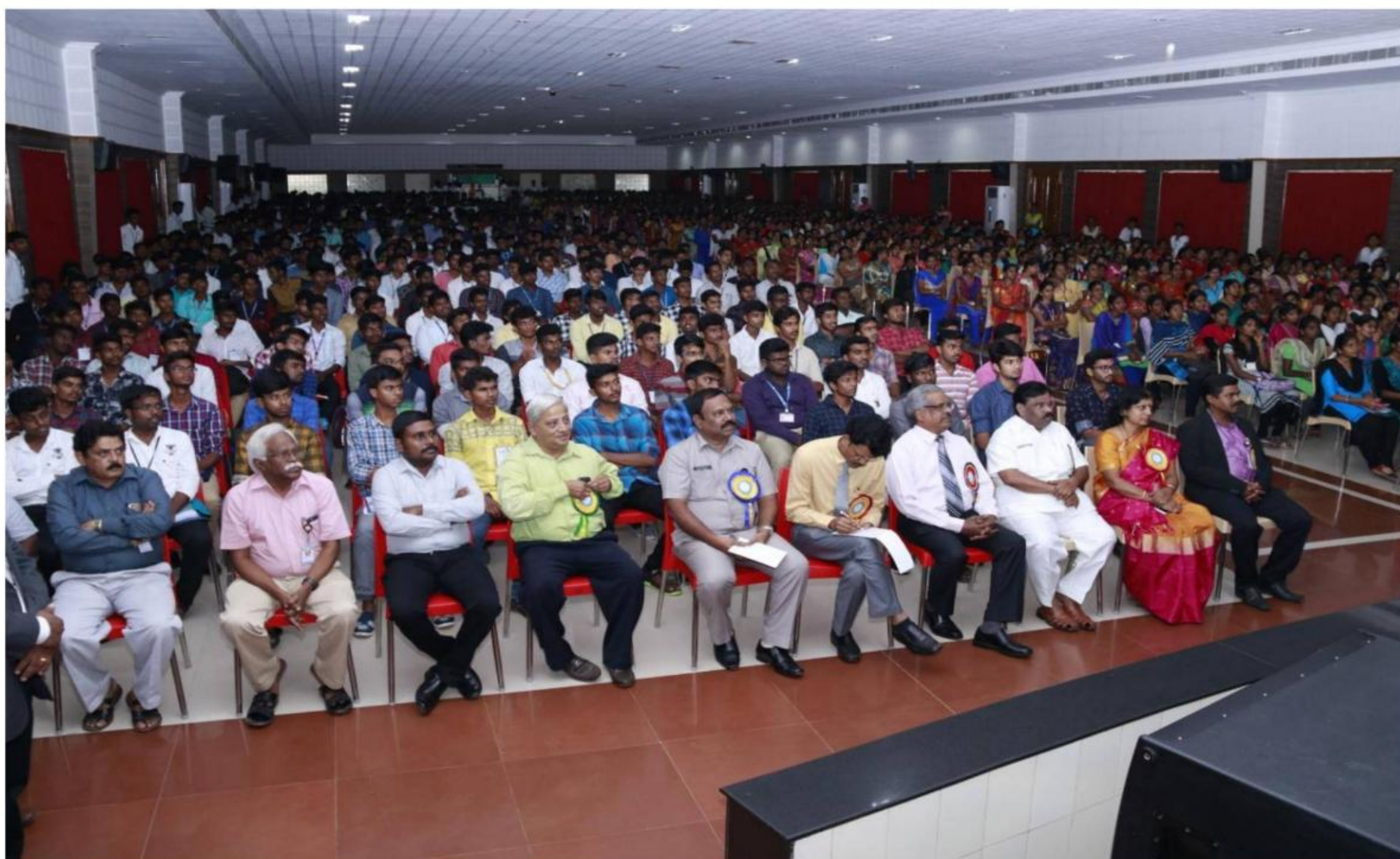
Techfinix-'18 2.0 - Date: 28.09.2018 & 29.09.2018