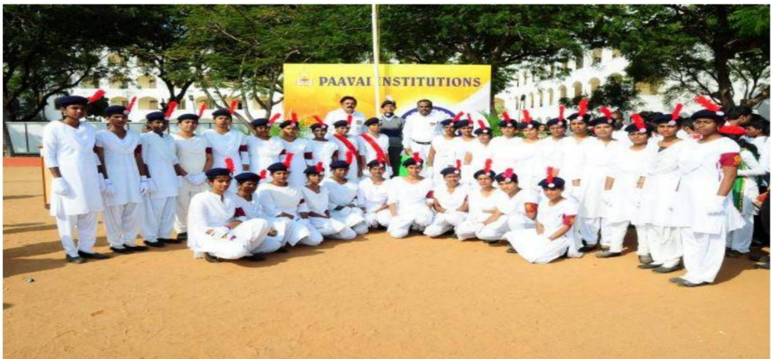
REPUBLIC DAY CELEBRATION - DATE: 26.01.2020