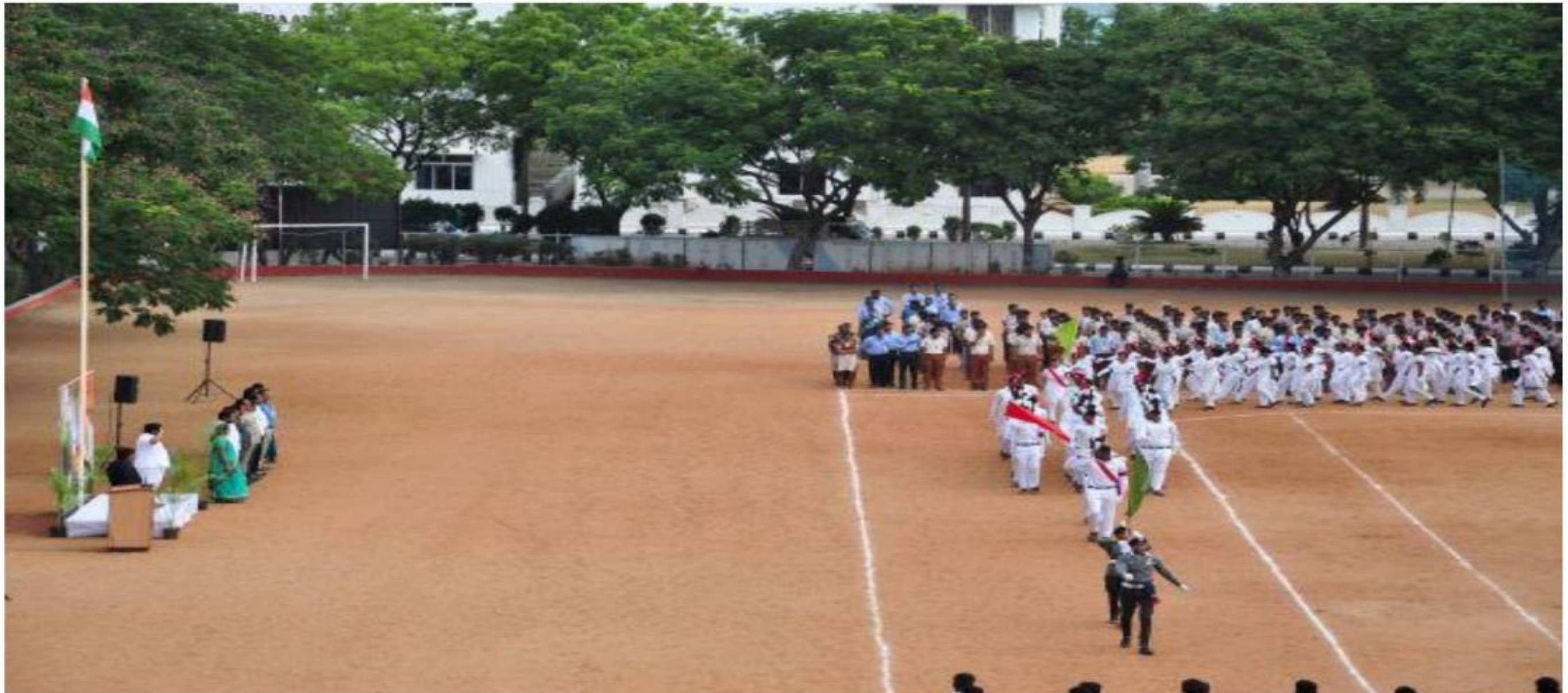
INDEPENDENCE DAY CELEBRATION - DATE: 15.08.2019