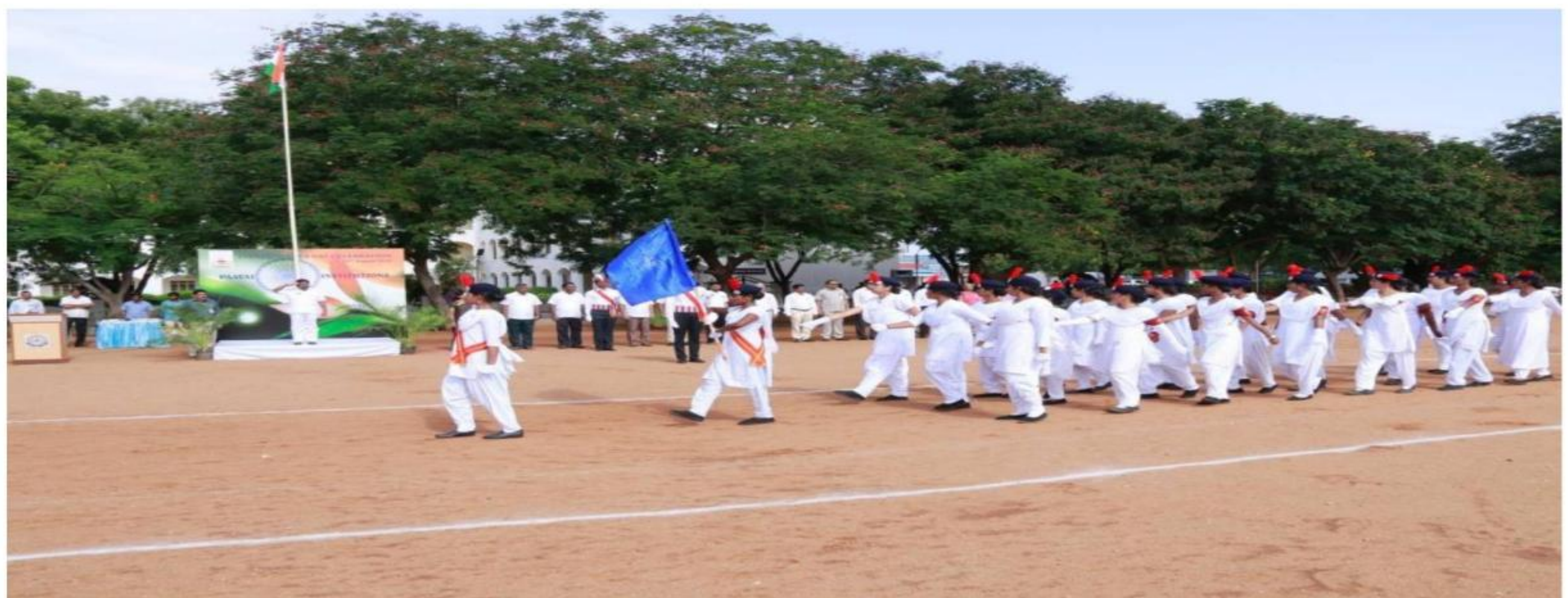
Independence Day Celebration - Date: 15.08.2018