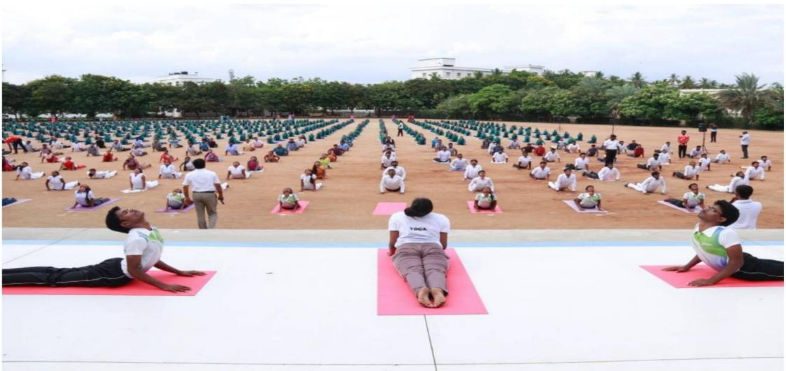
International Yoga Day Awareness and Celebration - Date: 21.06.2018