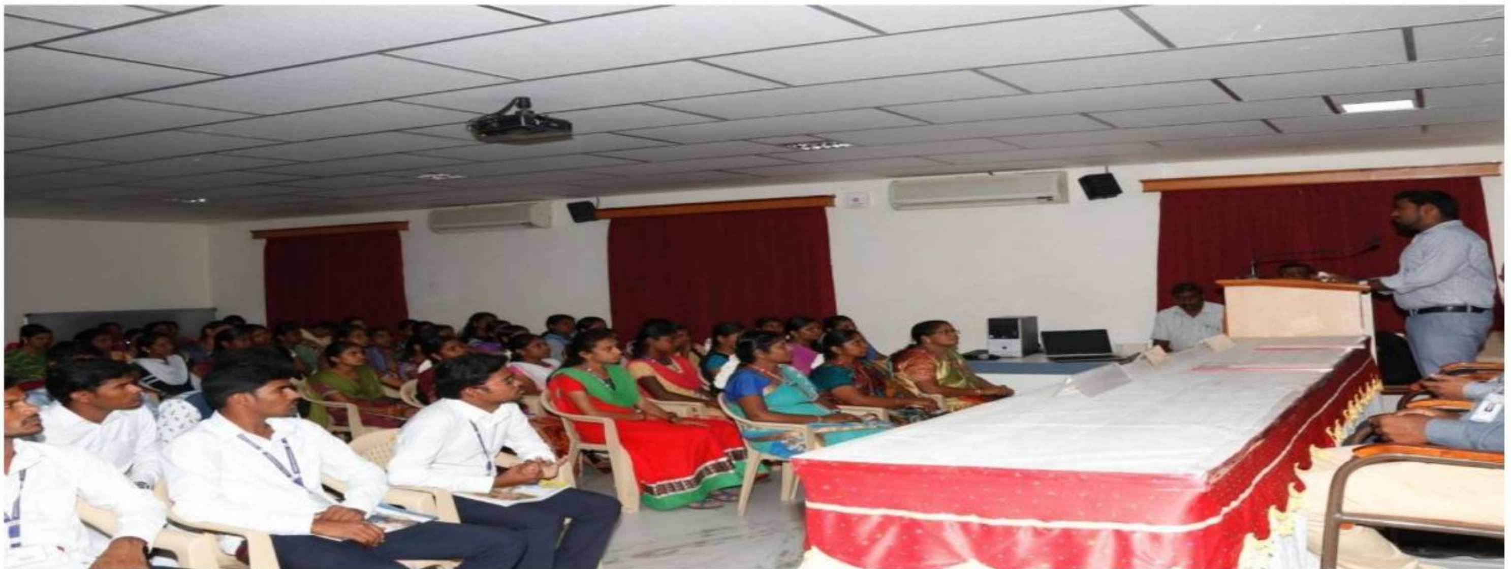
General Orientation Programme - Date: 07.09.2018

We conducted a general orientation programme for all NSS volunteers in our college on 07.09.2018 (Friday). The NSS History, Motto, Logo, organizing NSS regular activities and special camp activities were presented to the volunteers. The NSS activities for the academic year 2018-19 were discussed. All the first year volunteers were participated in this event.