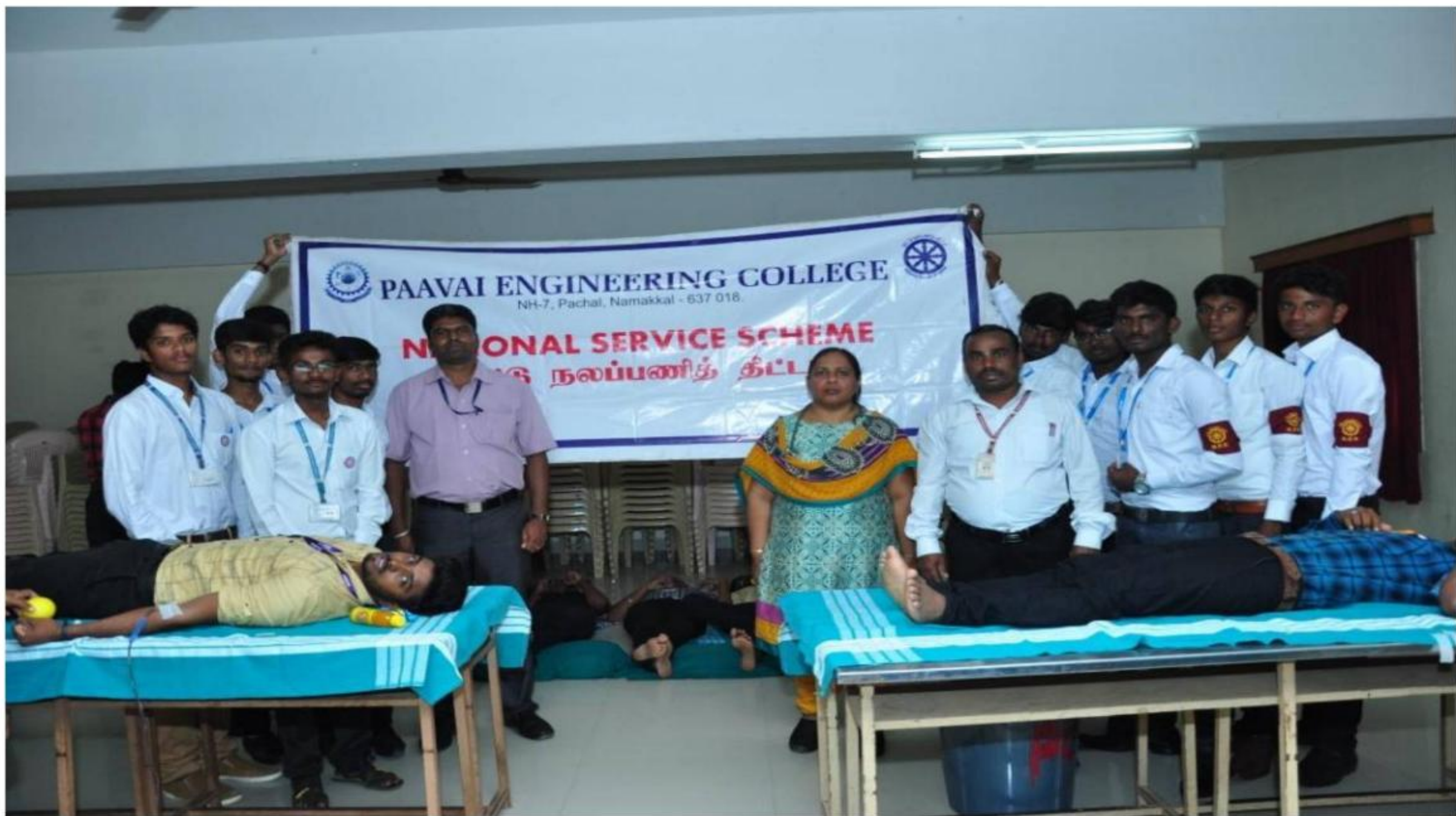
Blood Donation Camp - Date: 09.11.2018