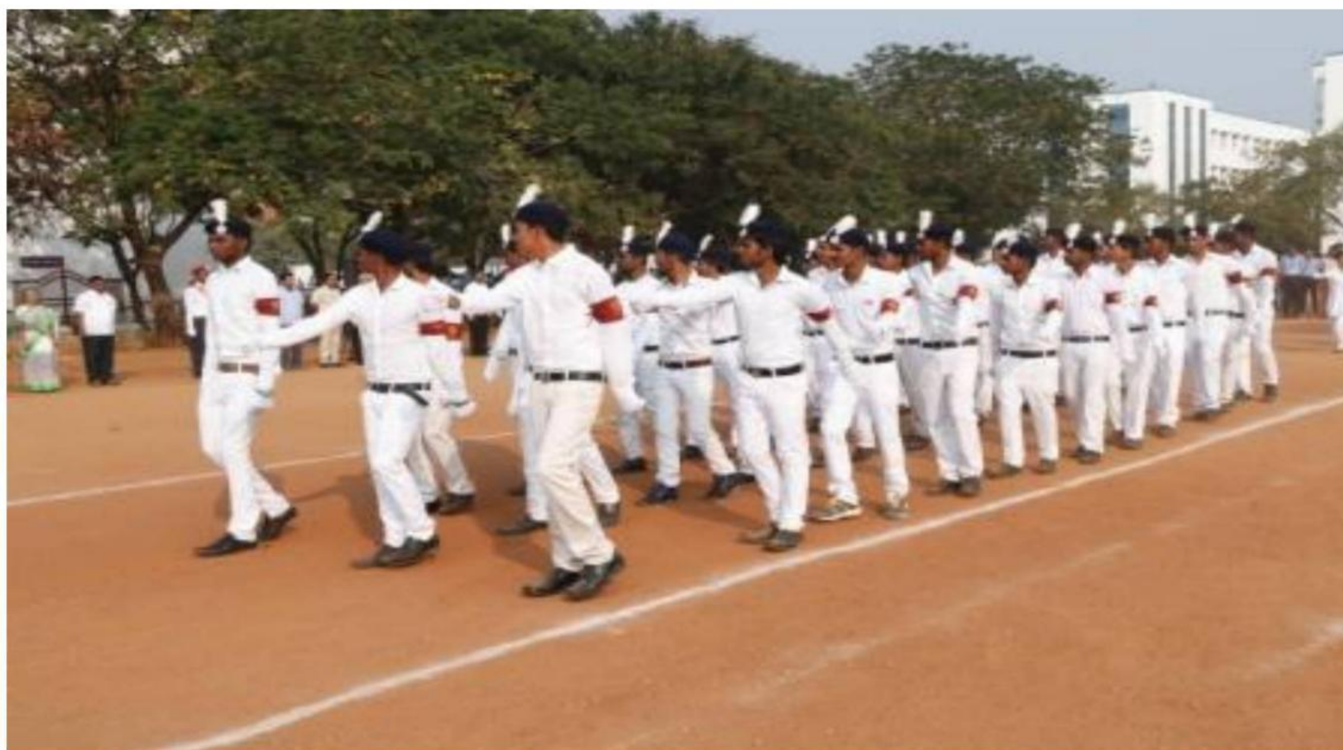
Republic Day Celebration on 26.01.2016

We celebrated our Republic Day on 26 th January, 2016. Our NSS volunteers more than 75 students willingly participated in the march past. At the end of the programme, Republic Day oath was taken by our students. The NSS Volunteers and Blood donors honored with the Certificates.