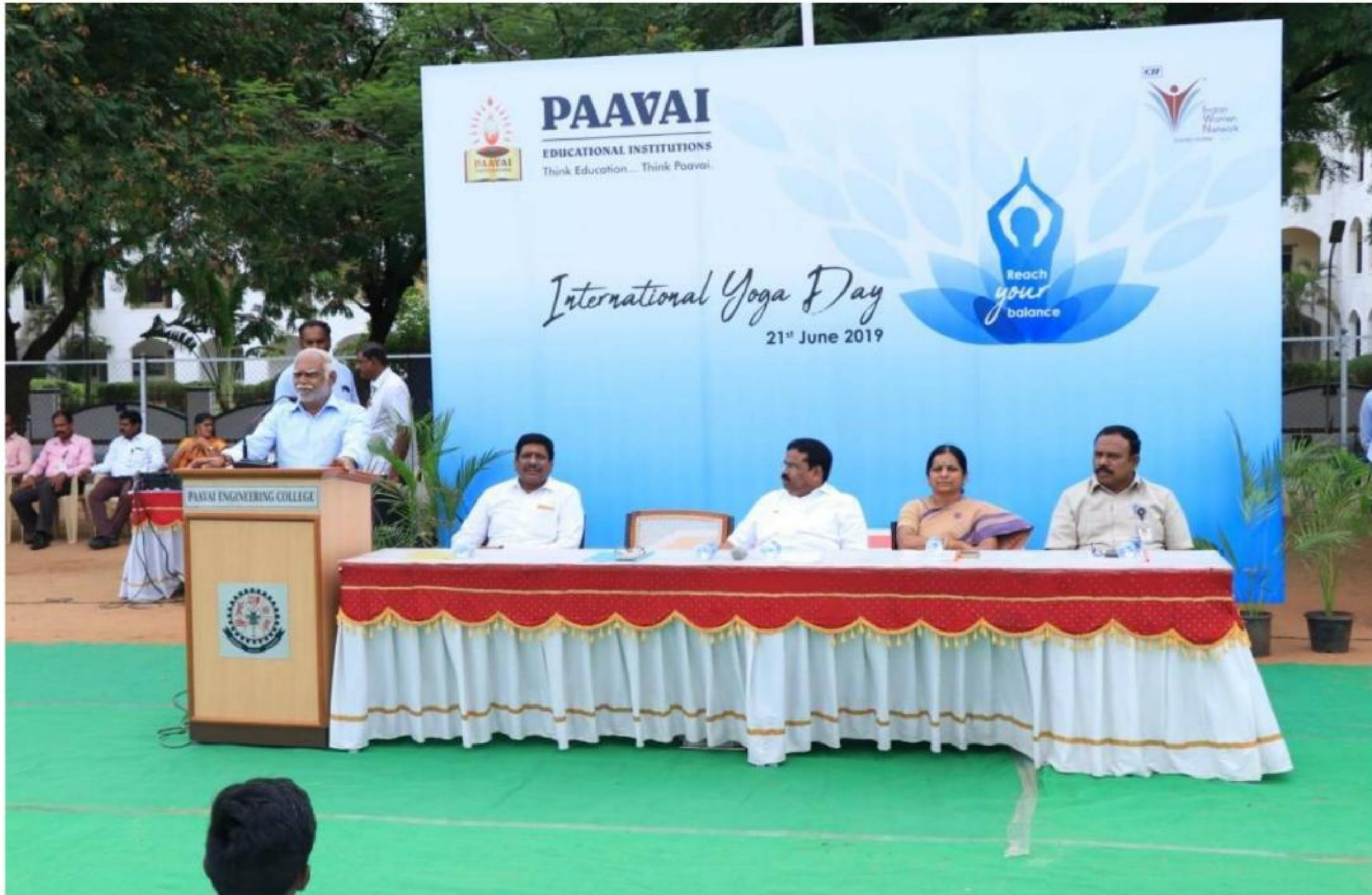
International Yoga Day Awareness and Celebration - Date: 21.06.2019