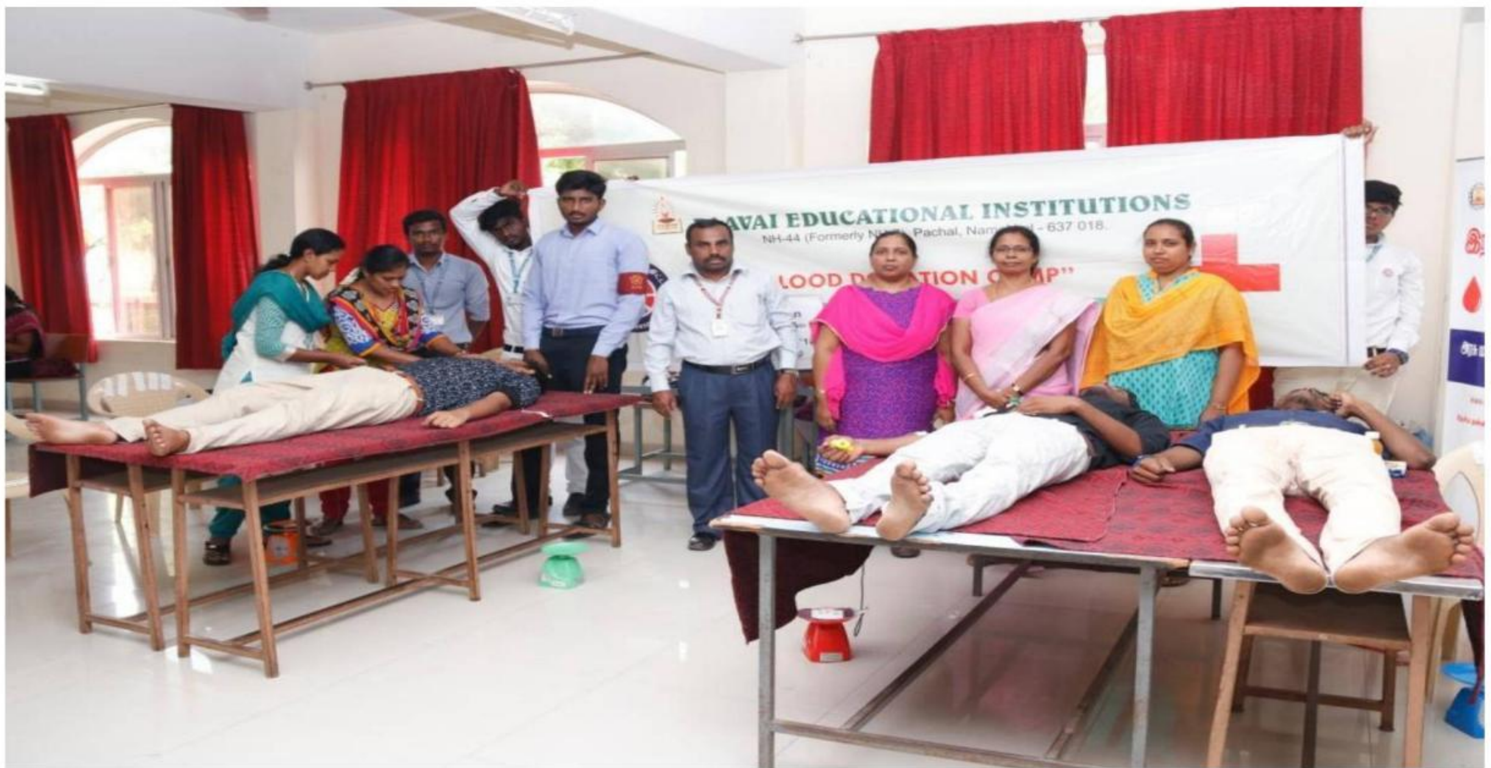
Blood Donation Camp - Date: 12.04.2018