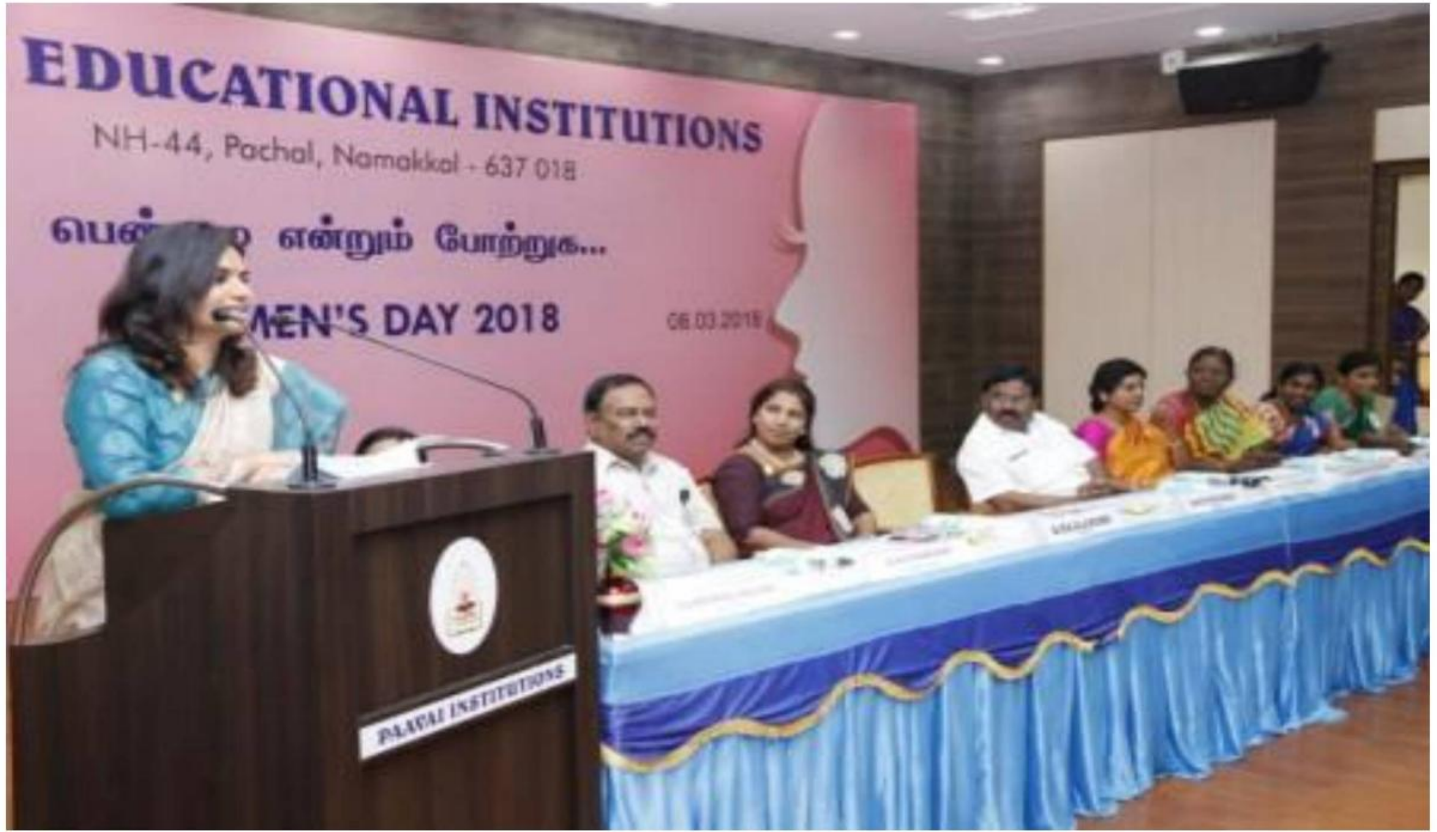
International Women's Day Celebration on 08.03.2018