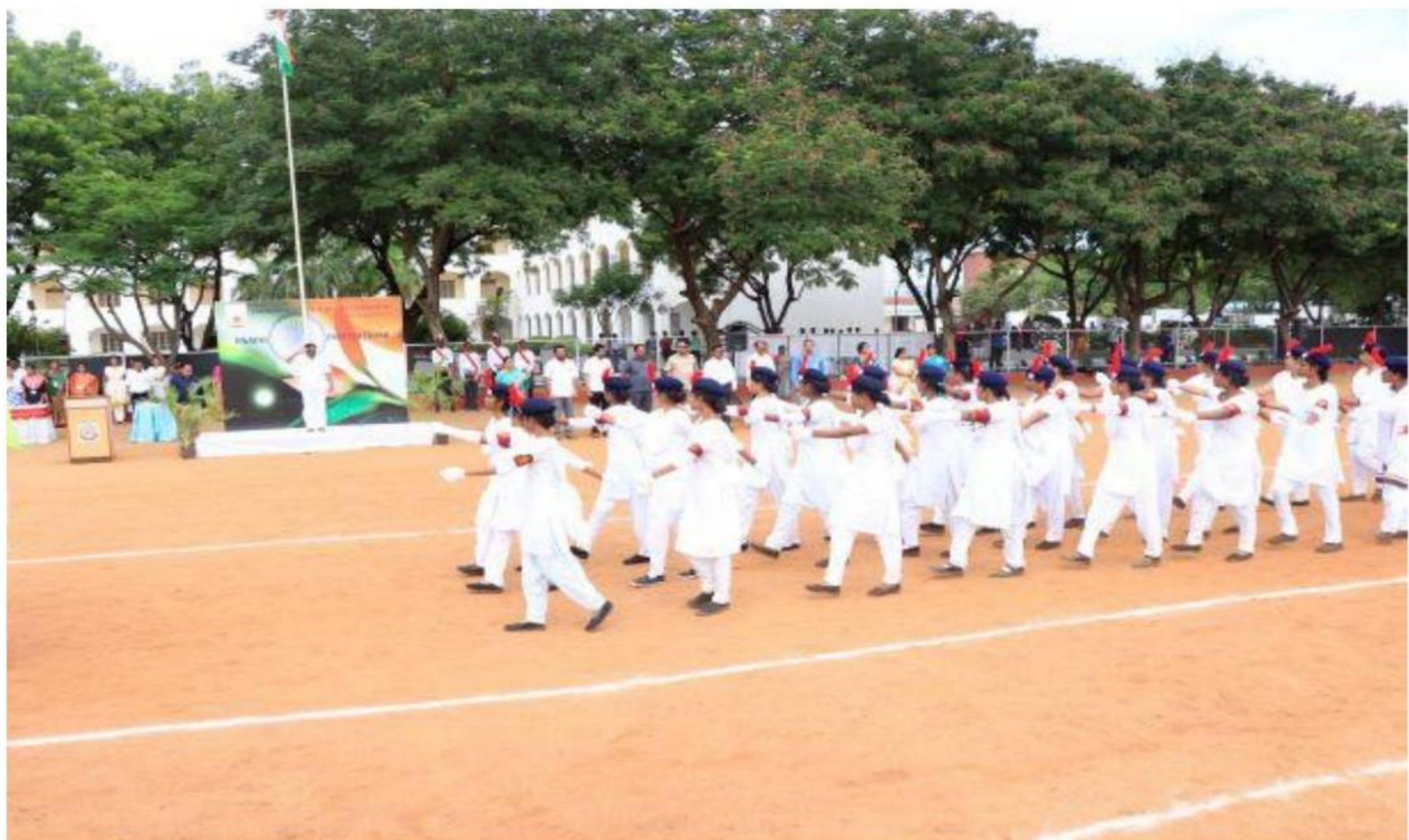
INDEPENDENCE DAY CELEBRATION - DATE: 15.08.2019