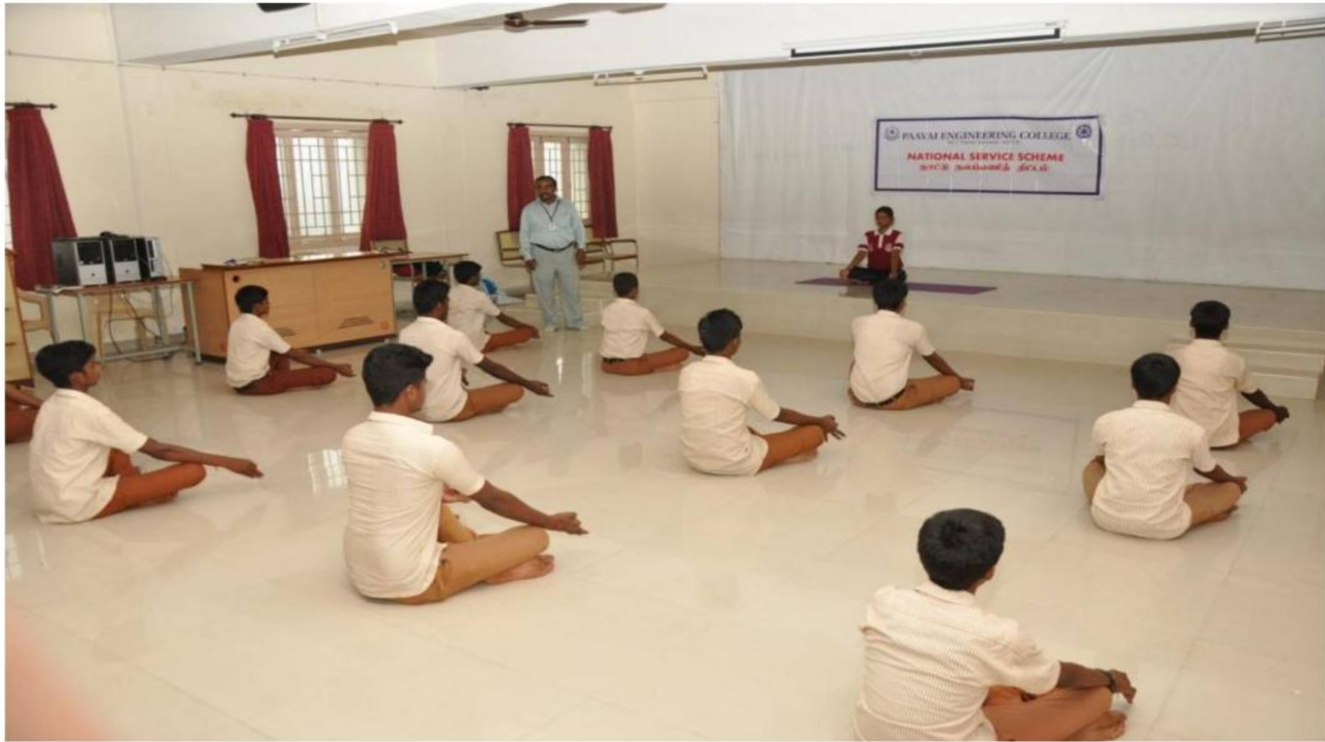
International Yoga Day Celebration on 21.06.2015 Our students performing the various Yoga- Asanas