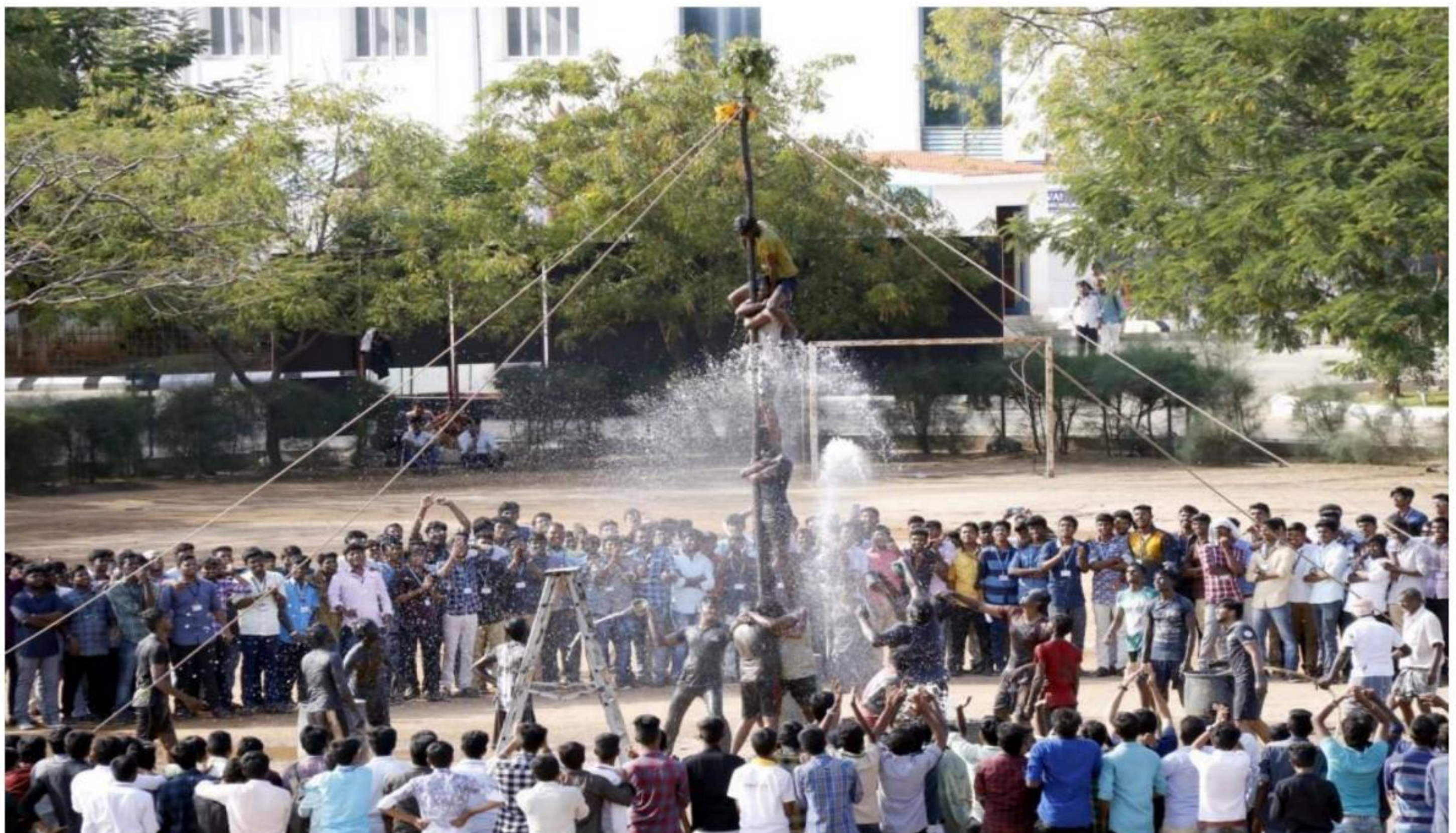
ASTRA-2018 on 08.02.2018 & 09.02.2018