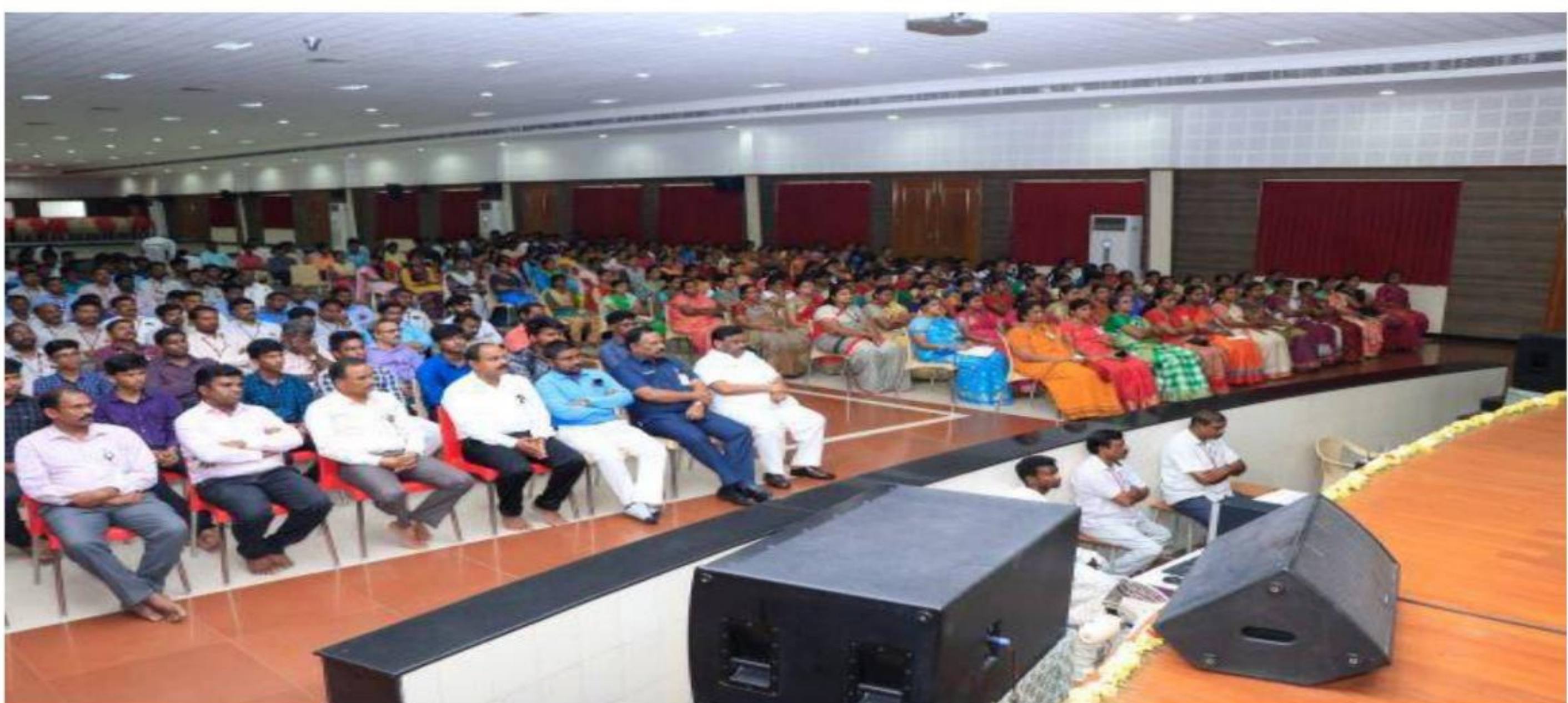
TEACHERS DAY CELEBRATION - DATE: 10.09.2019