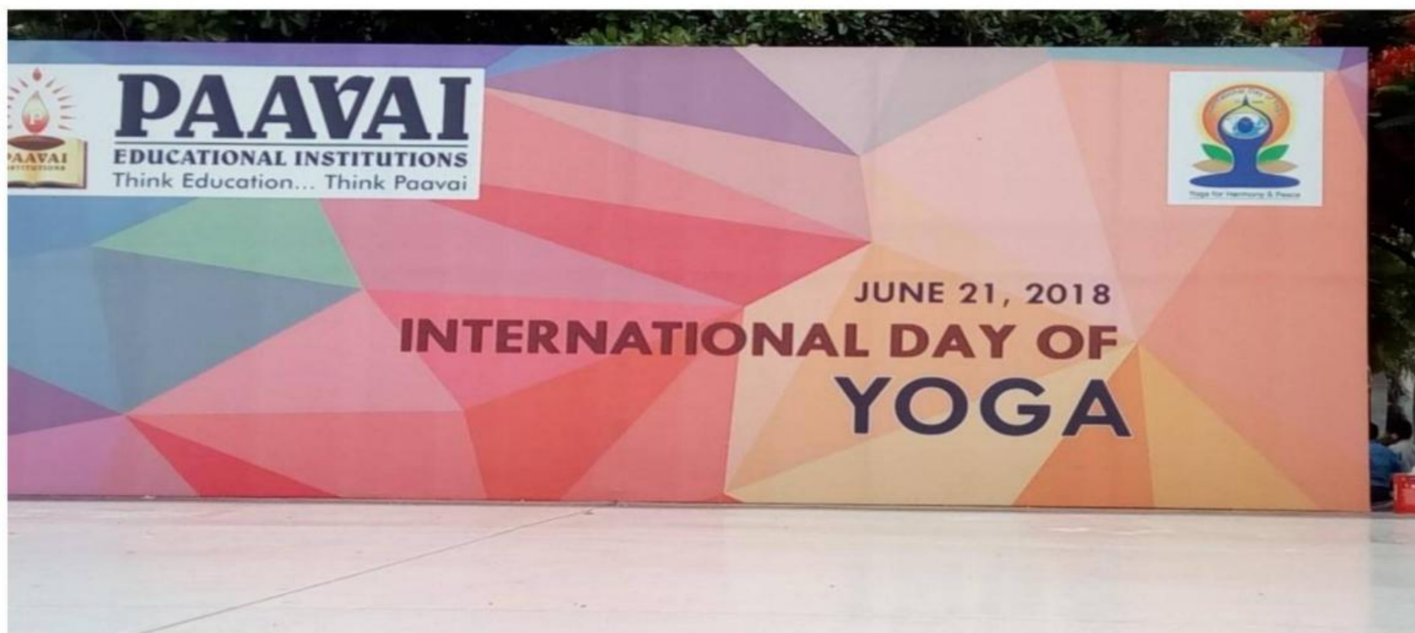
International Yoga Day Awareness and Celebration - Date: 21.06.2018