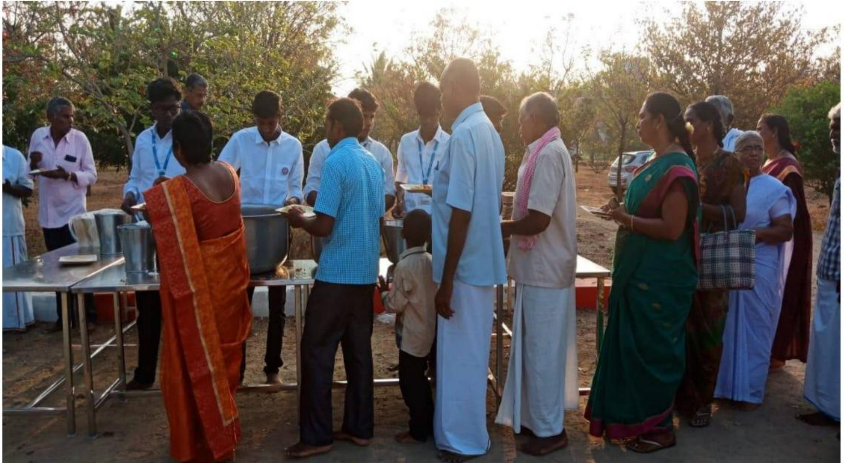
KASI VINAYAKAR KOVIL KUMBHASEIKAM VOLUNTEER SHIP – DATE: 26.02.2020

Our NSS provided NSS volunteer ship for Kasi Vinayakar Kovil Kumbhaseikam on 26.02.2020 (Wednesday) at Andagalurgate, Rasipuram. Our students involved in the food committee, making the crowd properly visiting the Kasi Vinayakar temple. In this activity 30 volunteers were participated.