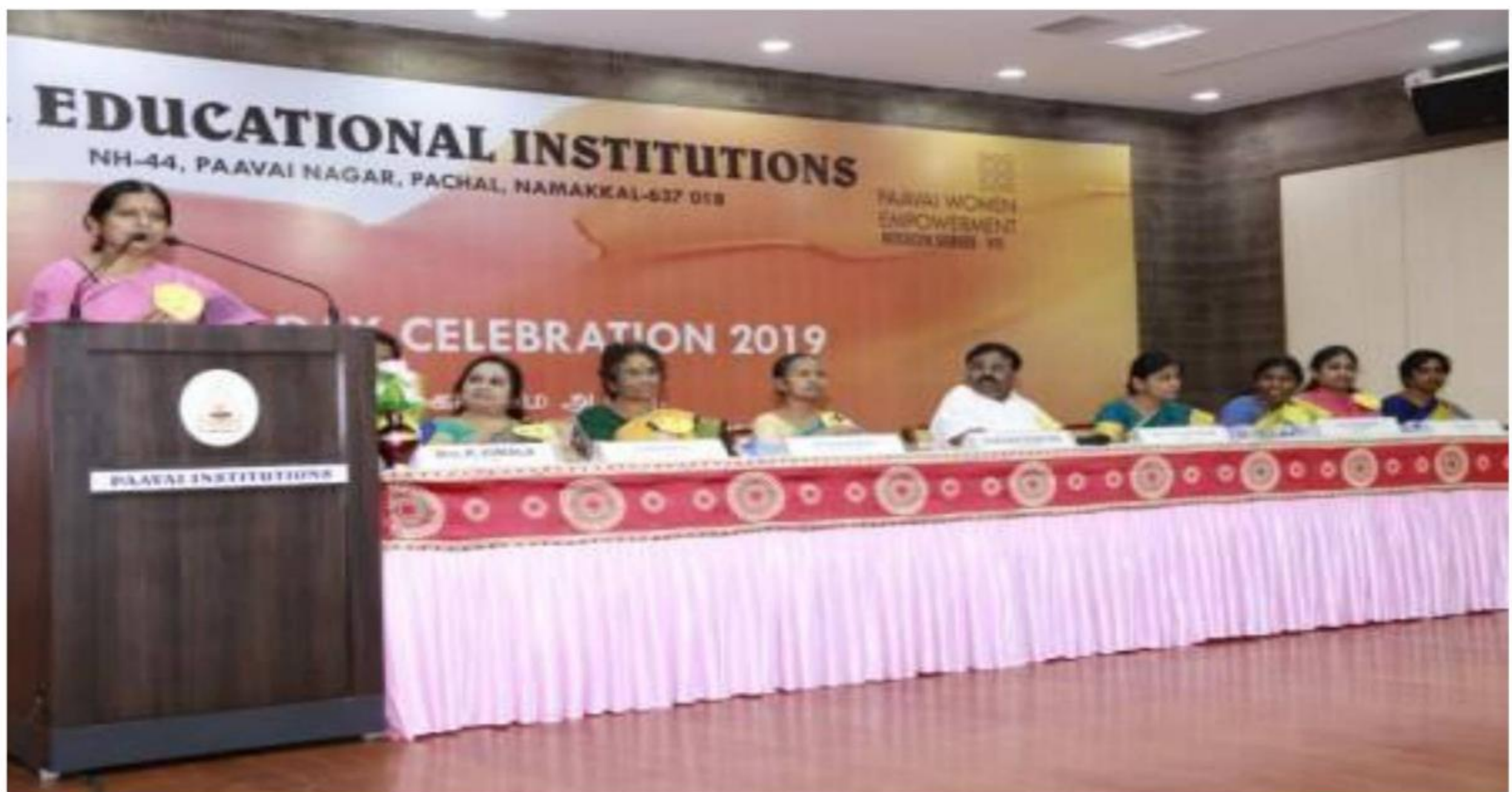
International Women's Day Celebration on 08.03.2019 International Women's Day Celebration Date: 08.03.2019