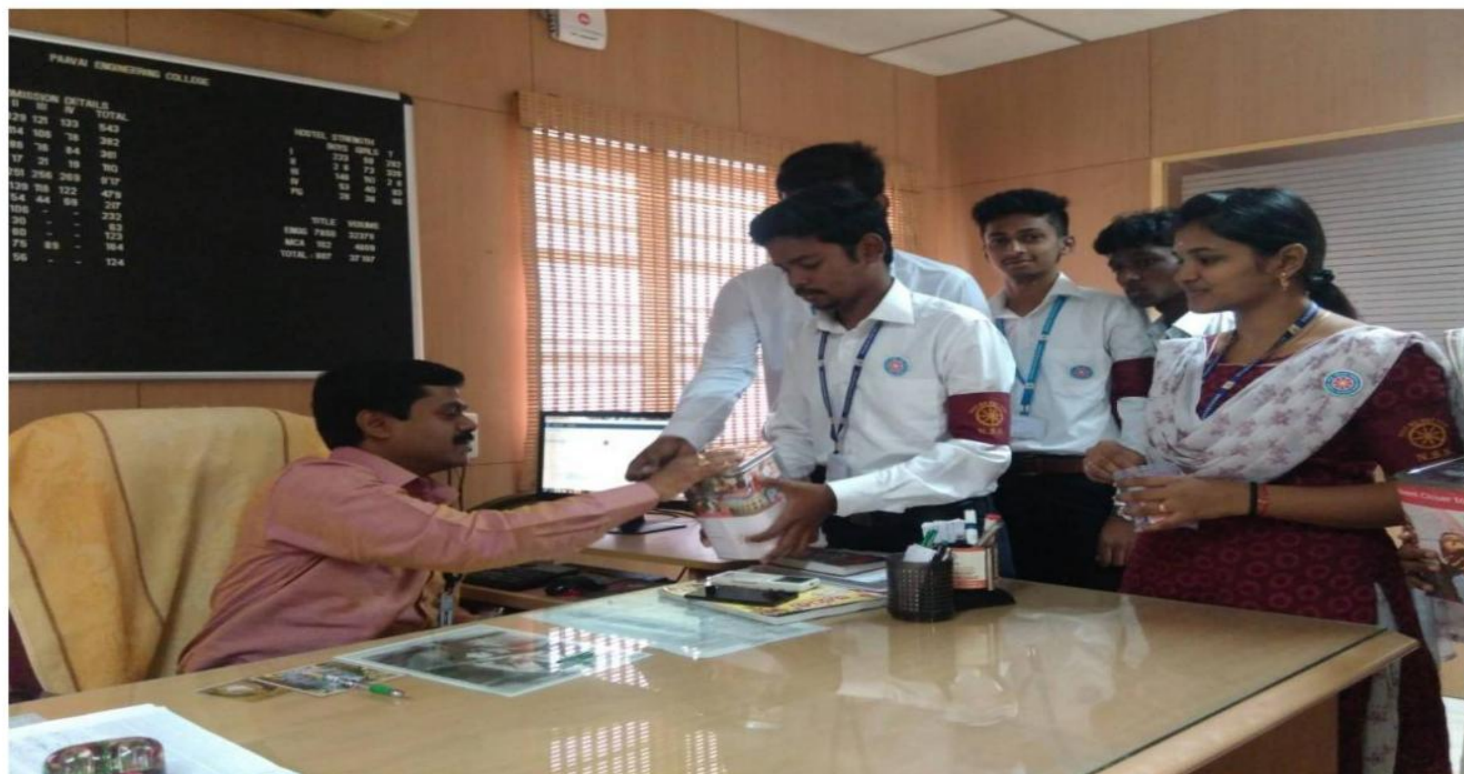
International White Cane Day on 09.11.2016 Our NSS Volunteers Collecting Fund for Visually Challenged People.

Indian Association for the Blind, Madurai is celebrating the International White Cane Day for the Blind. In this connection all students and staff members were contributed the amount for the visually challenged children on 09.11.2016 (Wednesday) and the total amount is Rs.10170.00. The donated amount DD for Rs.10170 bearing No.324039 dated 06.01.2017 from Corporation Bank, Namakkal was sent to the “Indian Association for the Blind, Madurai-625104” for visually challenged children education purpose.