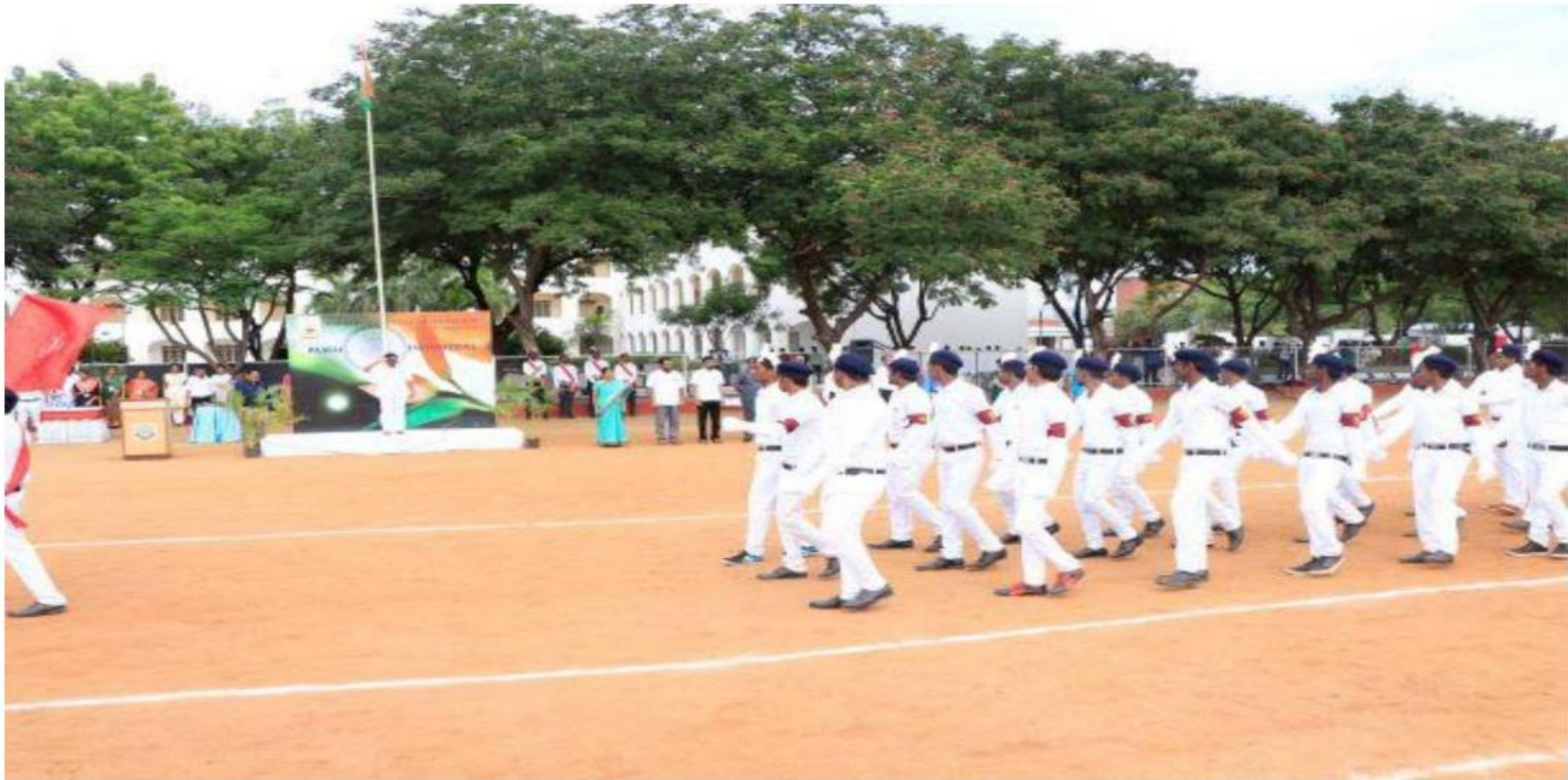
INDEPENDENCE DAY CELEBRATION - DATE: 15.08.2019

We celebrated our Independence Day on 15 th August, 2019. Our NSS volunteers more than 75 students willingly participated in the march past. At the end of the programme, Independence oath was taken by our students. The NSS Volunteers and Blood donors honored with the Certificates.