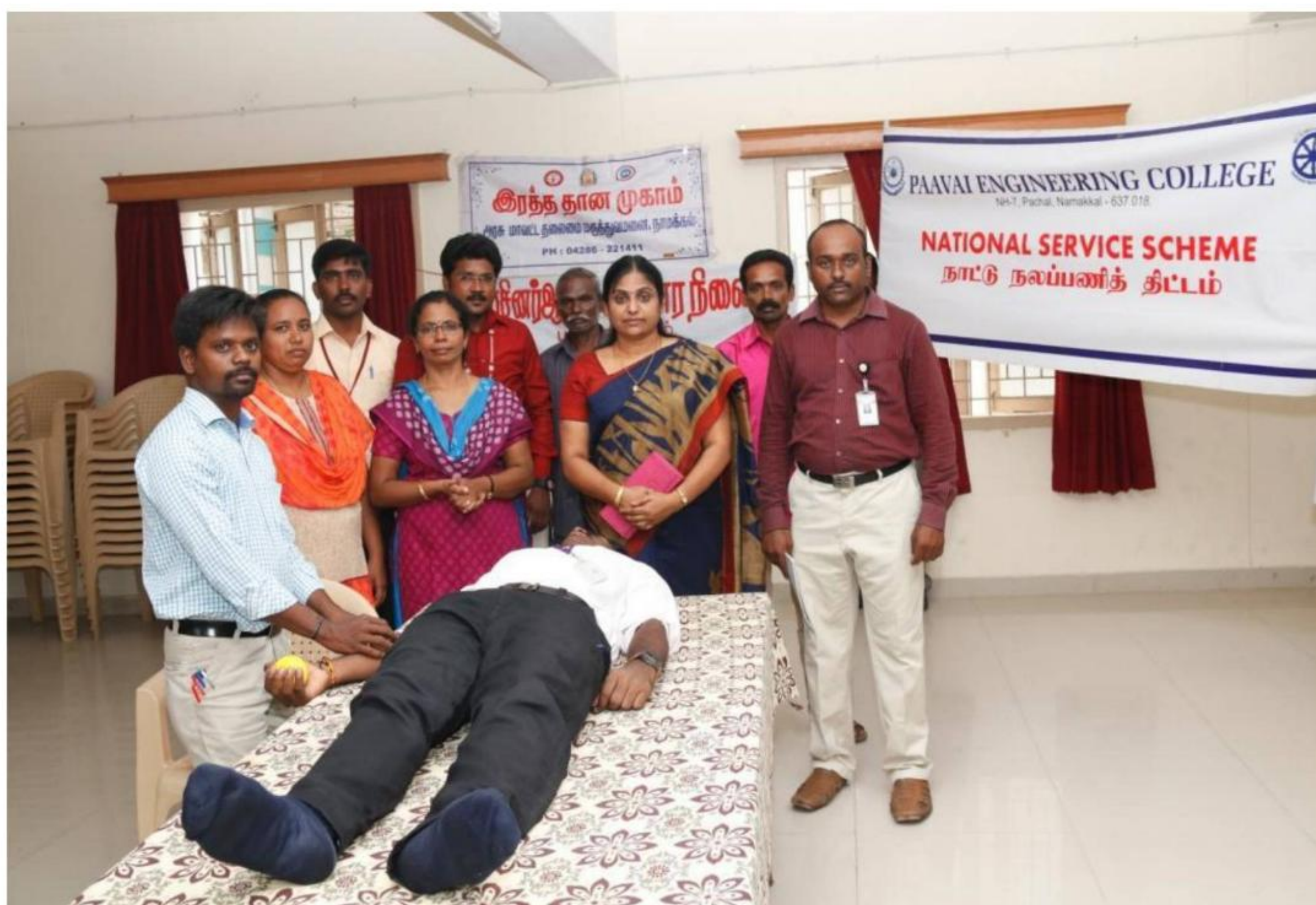
Blood Donation Camp on 10.08.2017