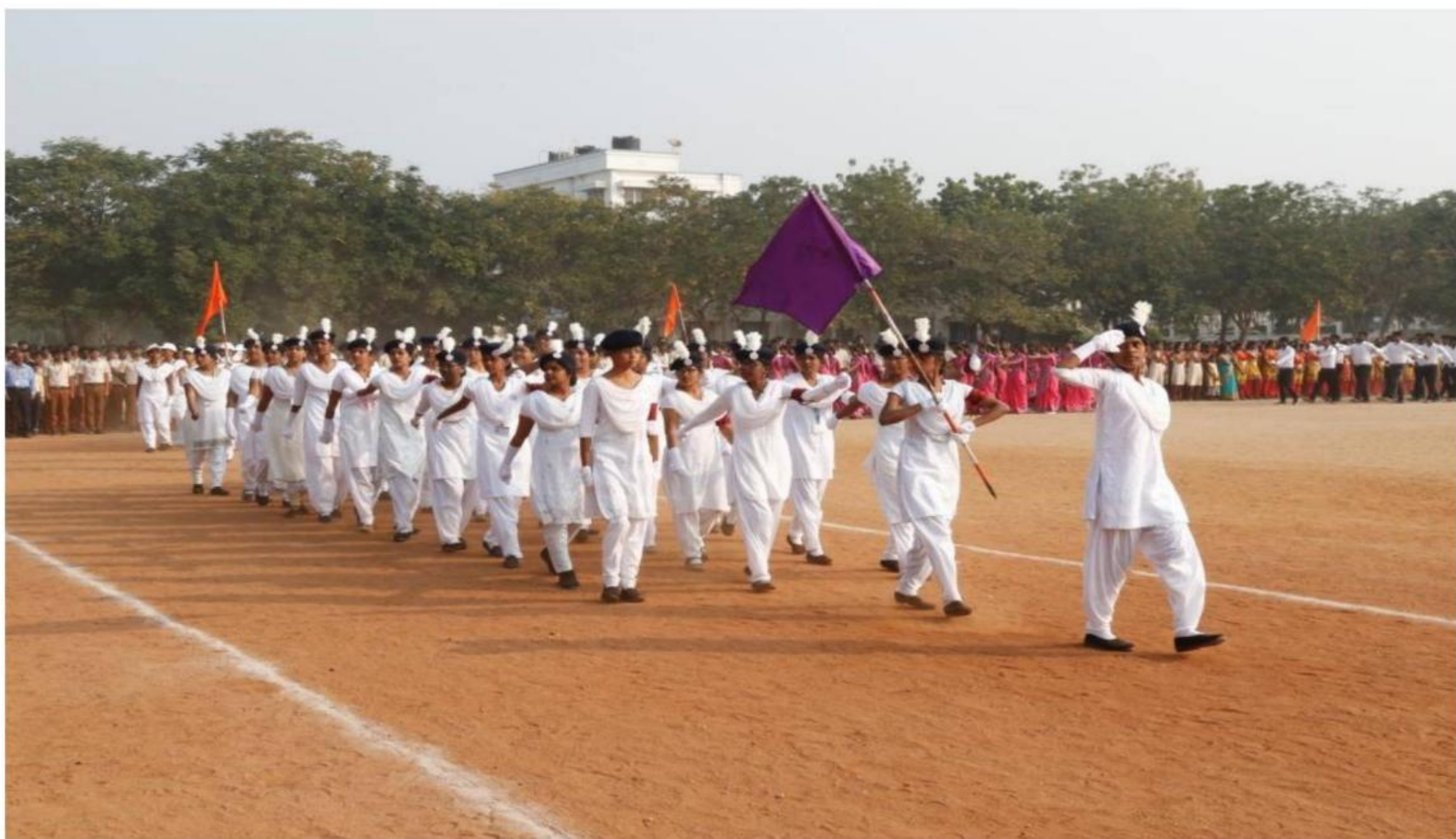
Republic Day Celebration - Date: 26.01.2018