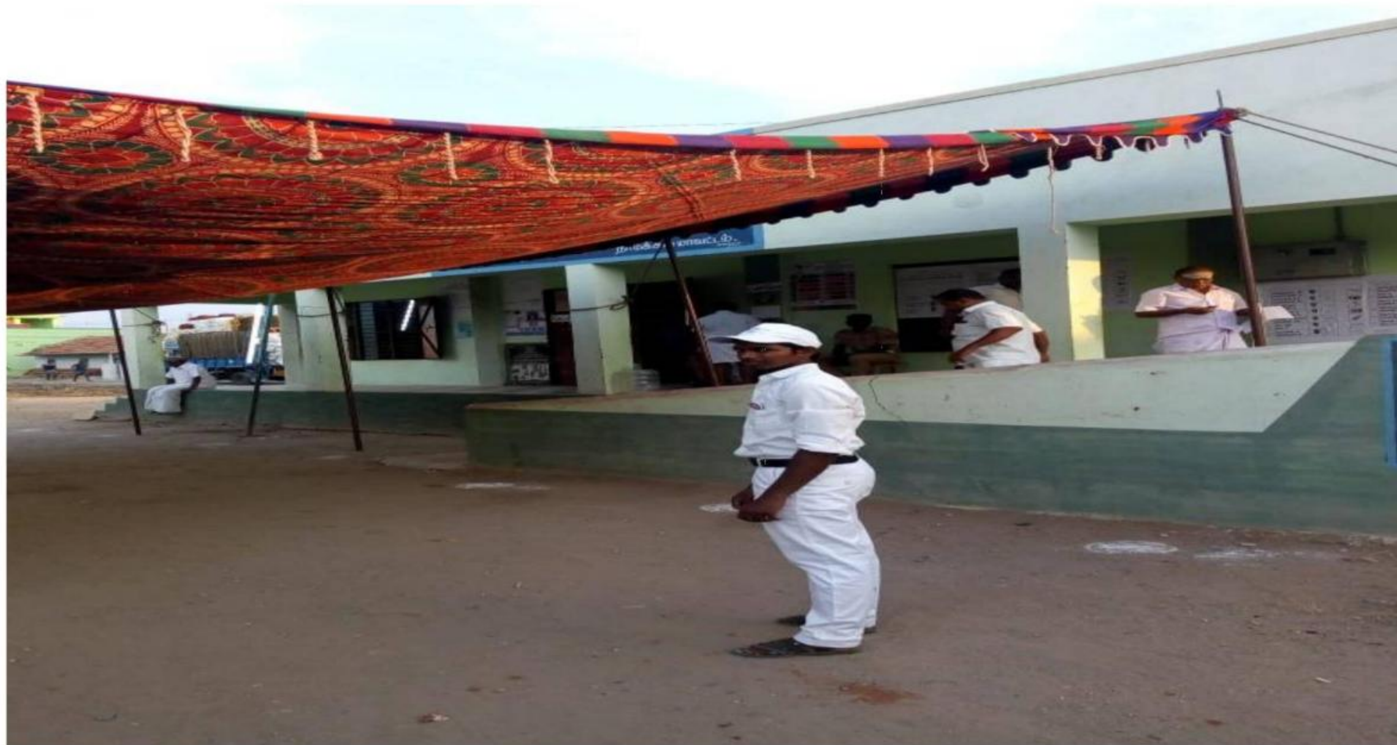
Lok Sabha Election-2019 Volunteer ship on 18.04.2019

The Election Commission of Namakkal required NSS volunteers for their volunteer ship in Lok Sabha Election 2019. Our NSS 25 volunteers provided some much-needed help on the voting day in the various allotted voting booths. The NSS volunteers helped elderly voters on the day of polling. The volunteers ensured smooth movement of voters to search in the voter name list and locating polling booth.