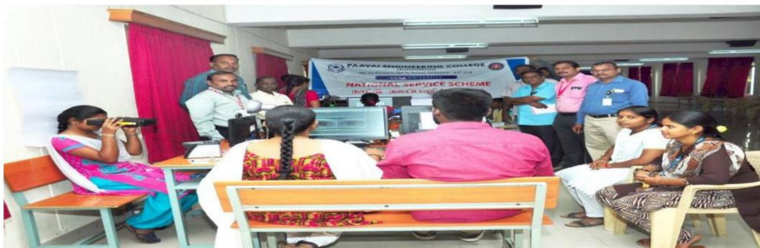
AADHAAR ENROLLMENT & UPDATION SPECIAL CAMP - DATE: 05.02.2020 to 10.02.2020