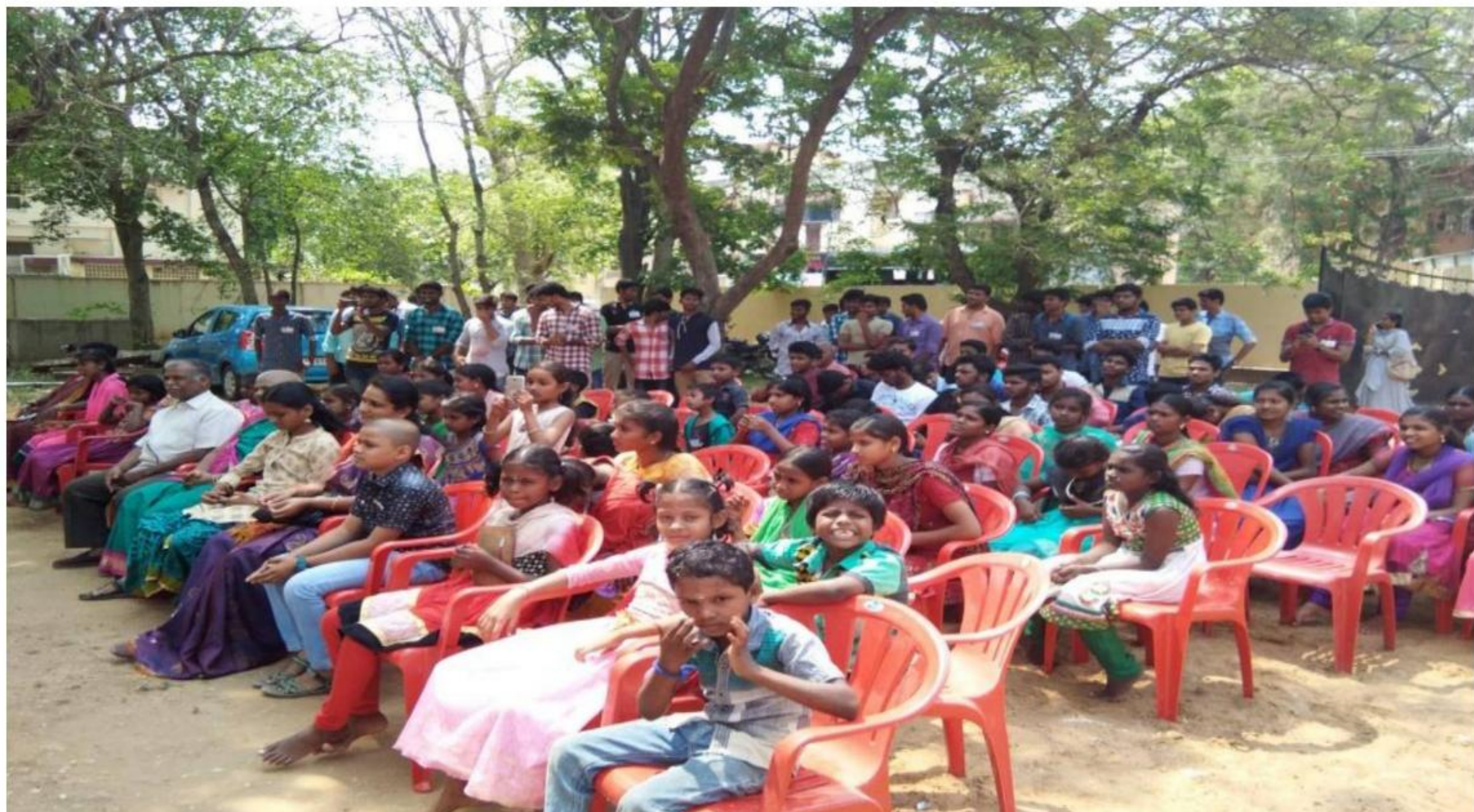
Government Sri Annai Sathya Orphanage, Salem – Fund Collection on 27.03.2018

Paavai Institutions, National Service Scheme and Must Doers Foundation (Paavai Students) jointly collected the fund for orphan students “Government Sri Annai Sathya Orphanage, Salem” on 27.03.2018. For that all the Students and Staff members were contributed. We purchased various materials like Books, Notes, School Bags and Dictionaries and issued to the orphan students on 01.04.019. This contribution has helped to provide the education support to the children studies.