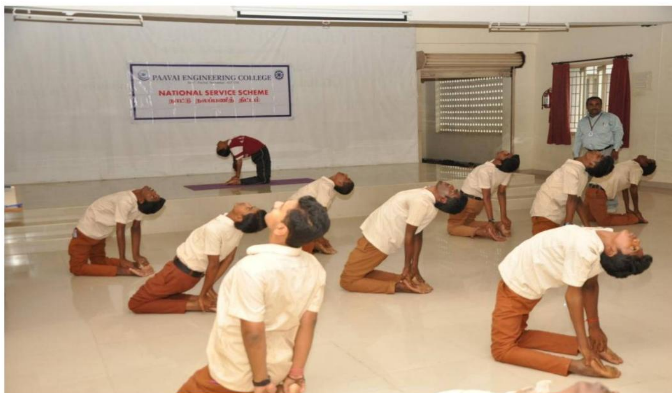
International Yoga Day Celebration on 21.06.2015 Our students performing the various Yoga- Asanas

We observed International Yoga Day on 21 st June, 2015. Under the auspices of NSS and YRC, more than 100 students willingly participated in the event of celebrating the International Yoga Day and performed the fundamental asanas in Yoga. At the end of the programme, an oath was taken to do Yoga regularly at least for 30 minutes every day.