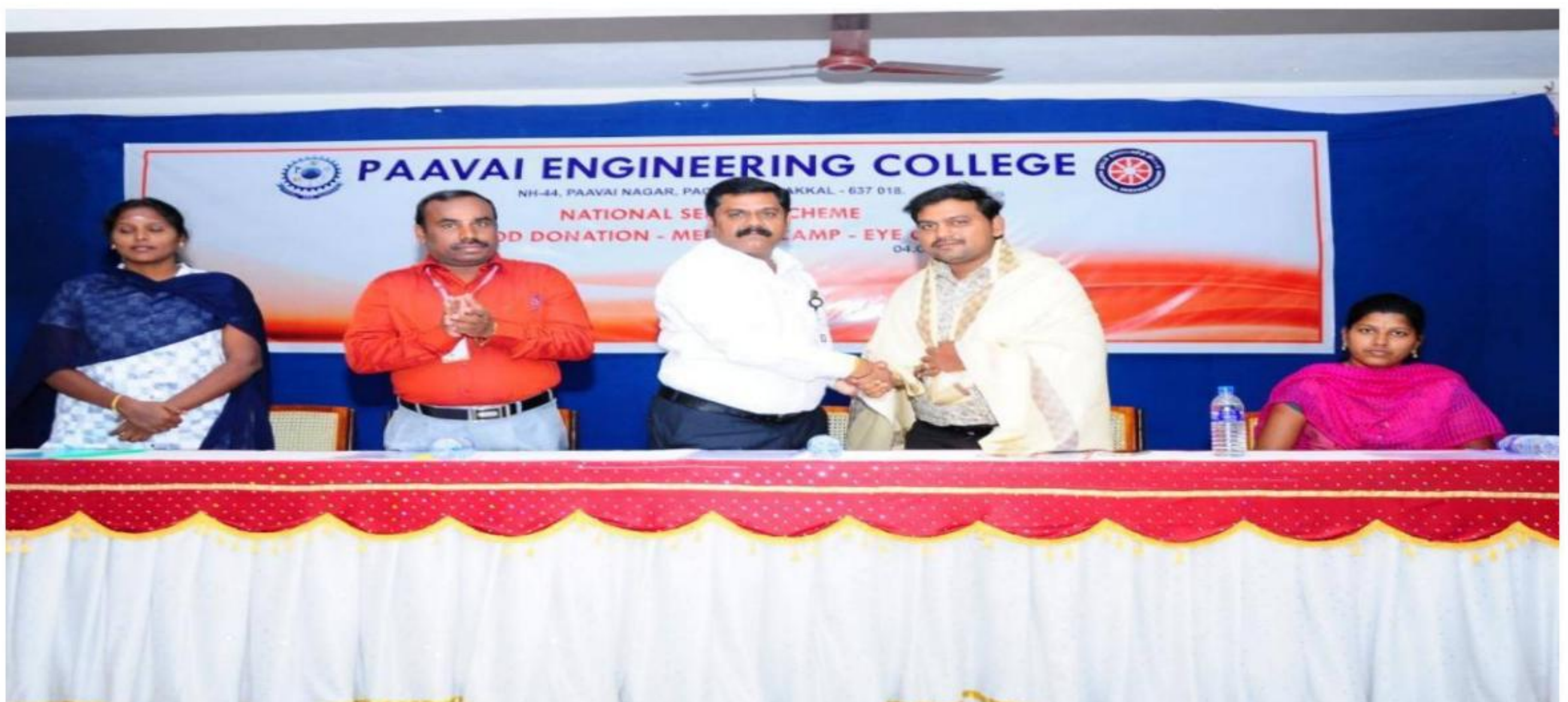
MEDICAL-EYE-DENTAL-BLOOD DONATION CAMP - DATE: 04.02.2020