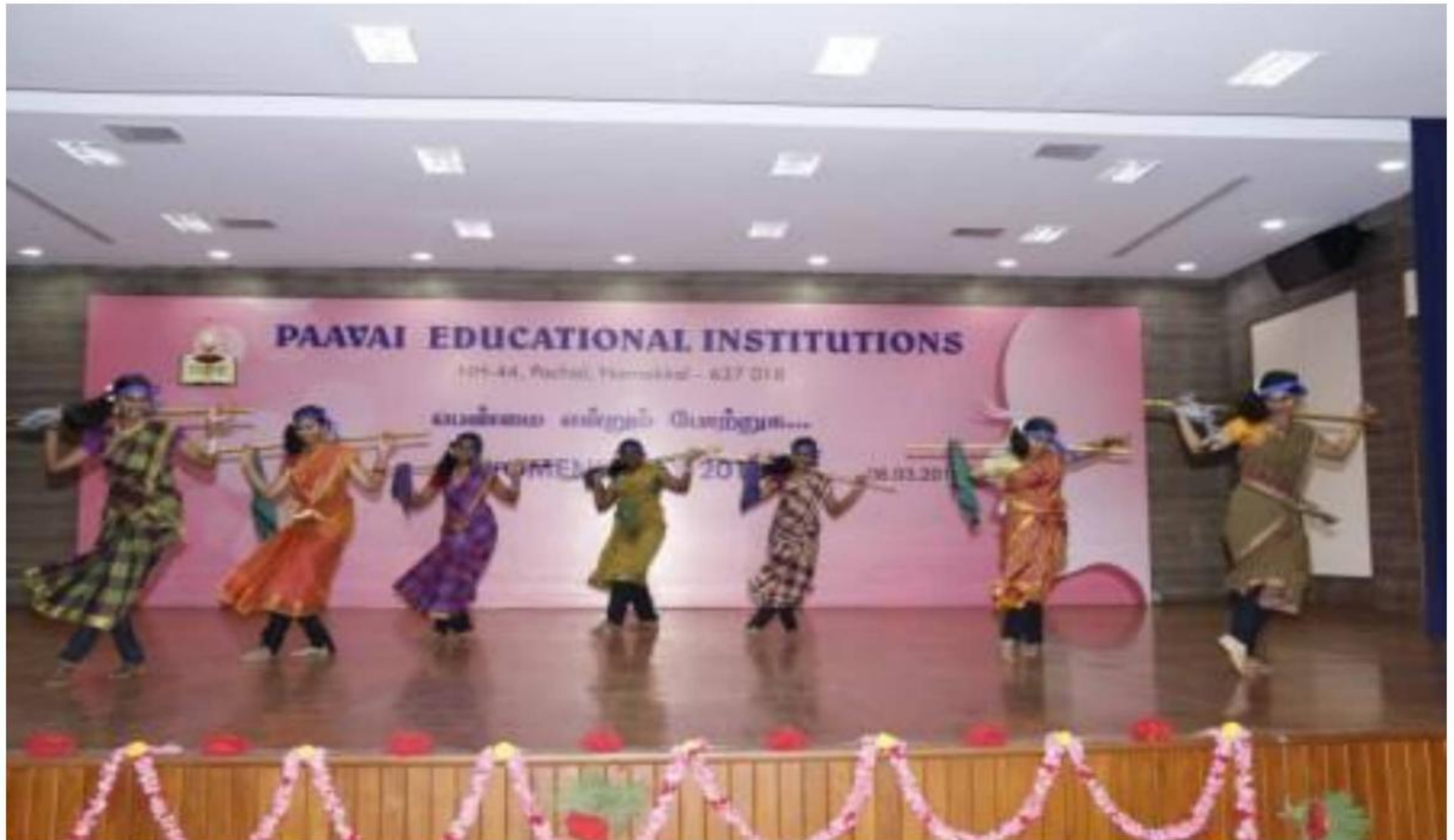
International Women's Day Celebration on 08.03.2018