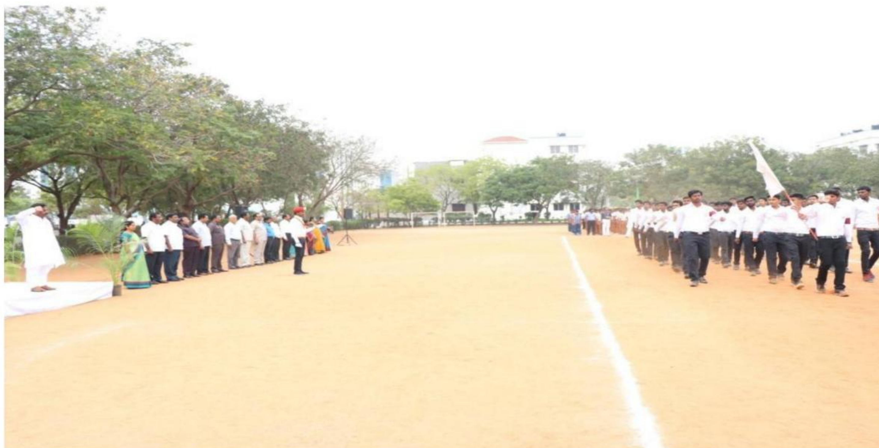
Republic Day Celebration on 26.01.2017 NSS Volunteers in the Republic Day March Past and Receiving Blood Donation certificates

We celebrated our Republic Day on 26 th January, 2017. Our NSS volunteers more than 50 students willingly participated in the march past. At the end of the programme, Republic Day oath was taken by our students. The NSS Volunteers and Blood donors honored with the Certificates.