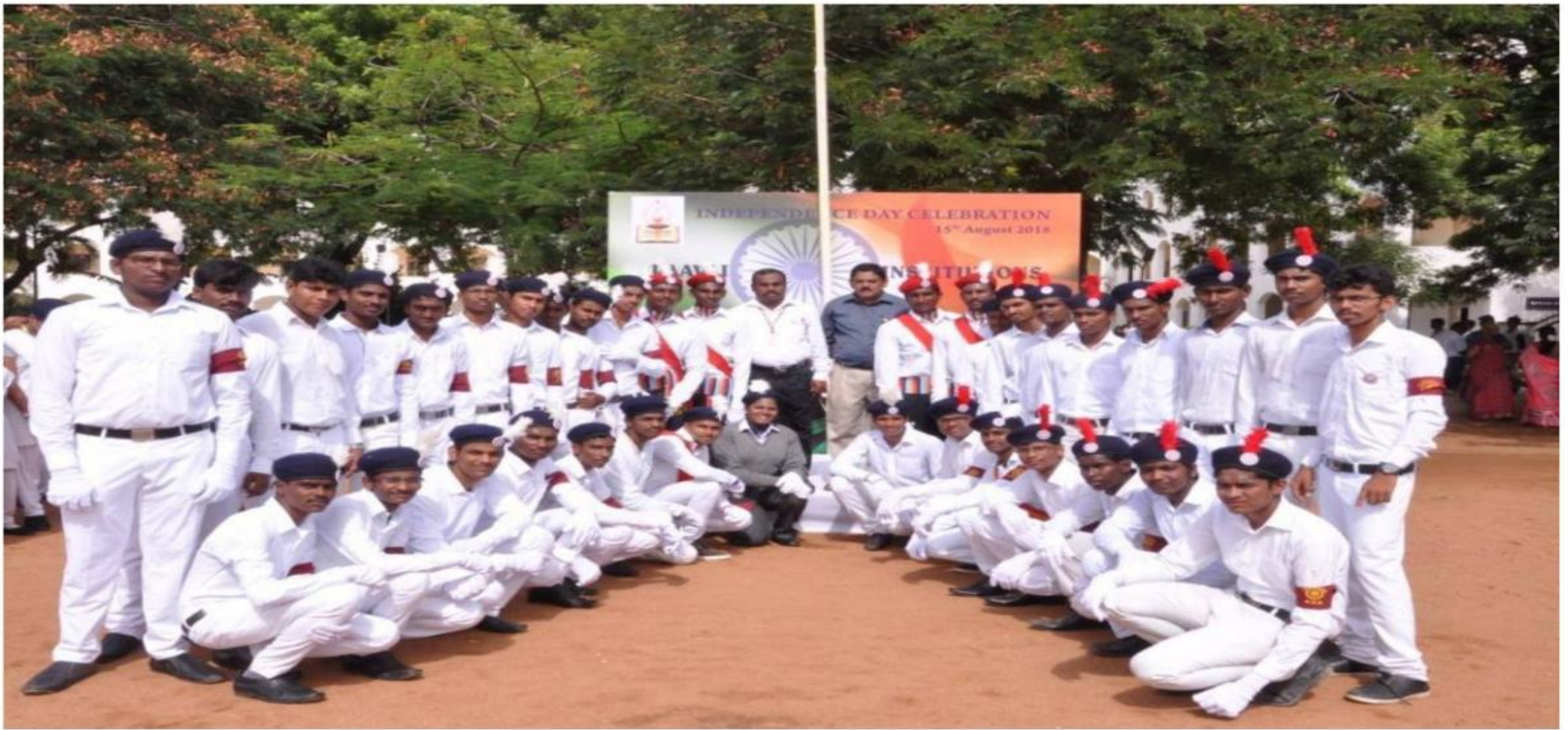
Independence Day Celebration - Date: 15.08.2018