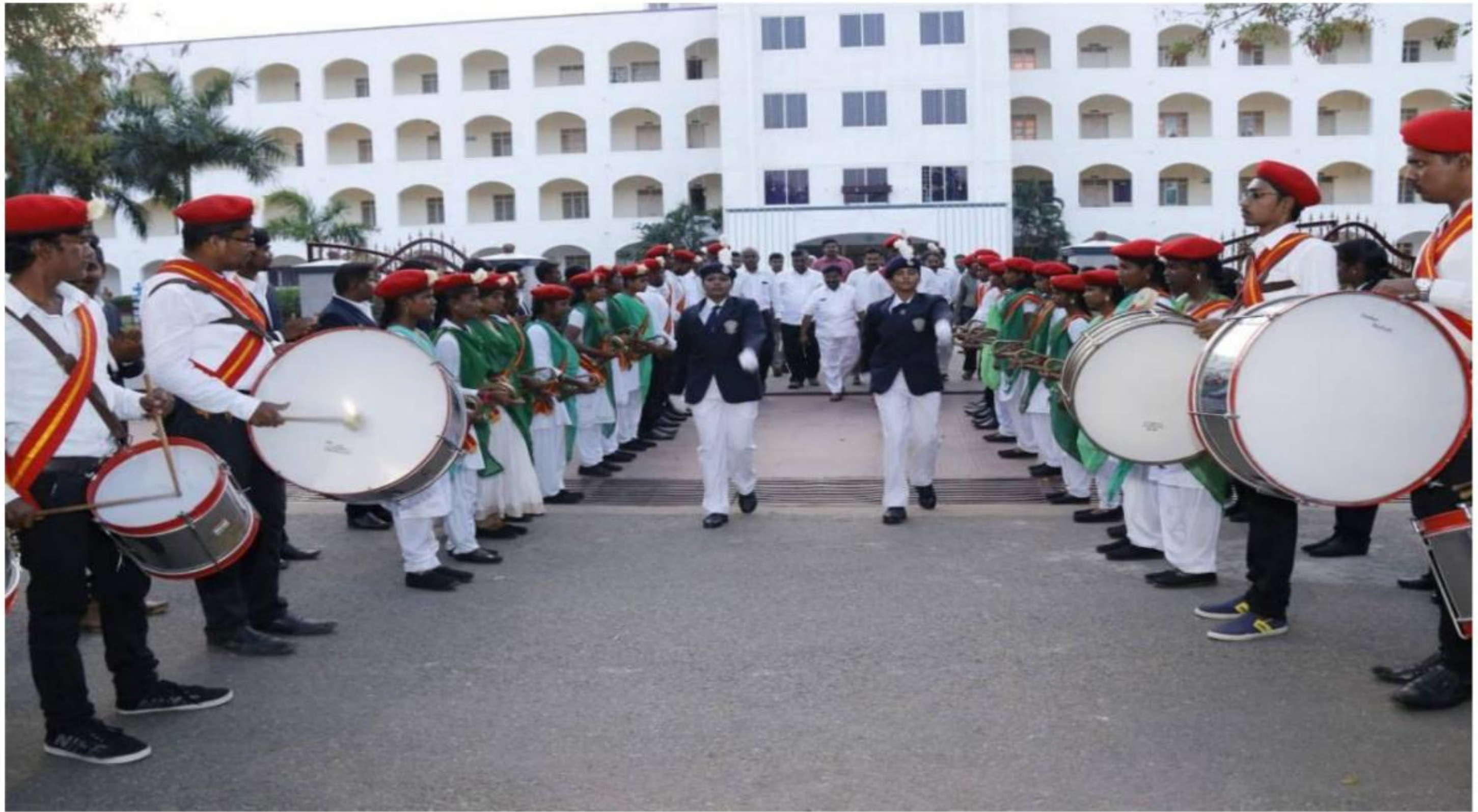
Annual Day-2018 on 24.02.2018