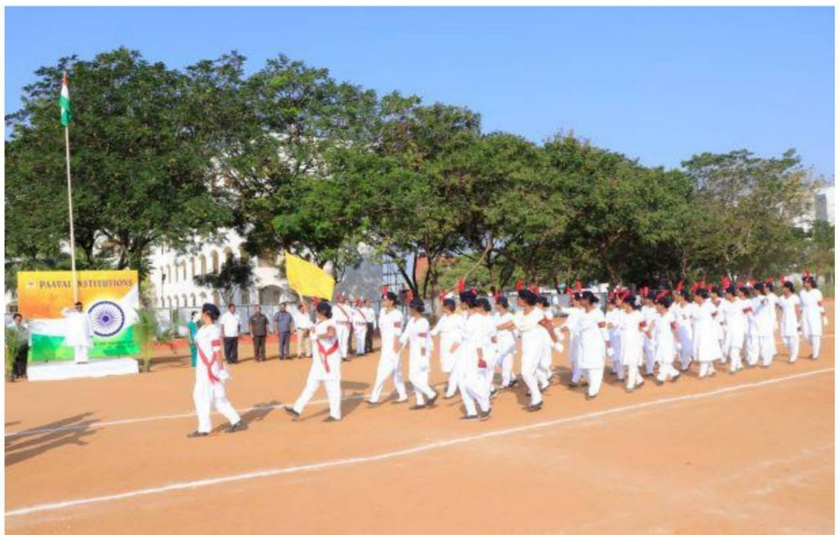
REPUBLIC DAY CELEBRATION - DATE: 26.01.2020