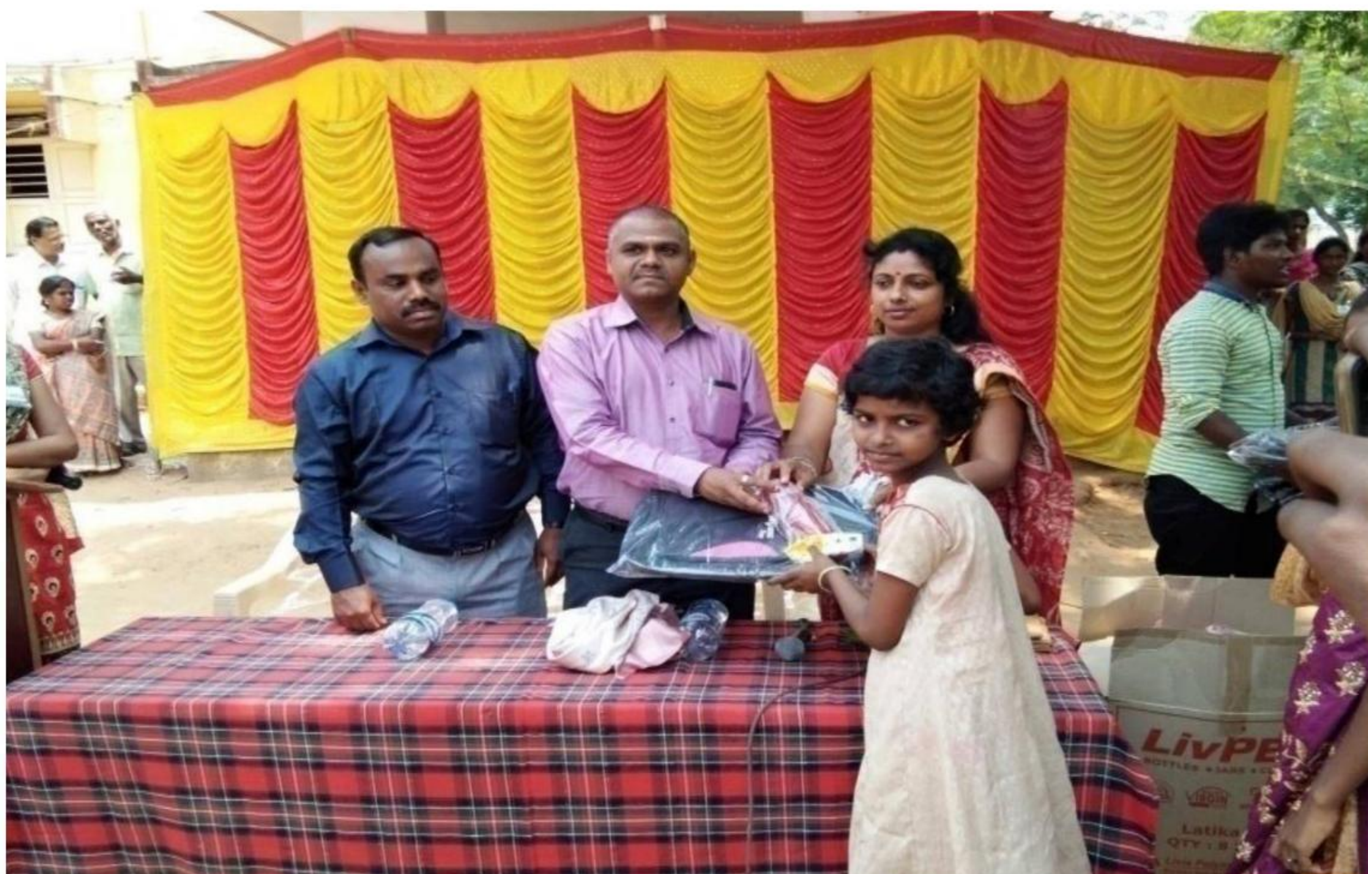
Government Sri Annai Sathya Orphanage, Salem – Fund Collection on 27.03.2018