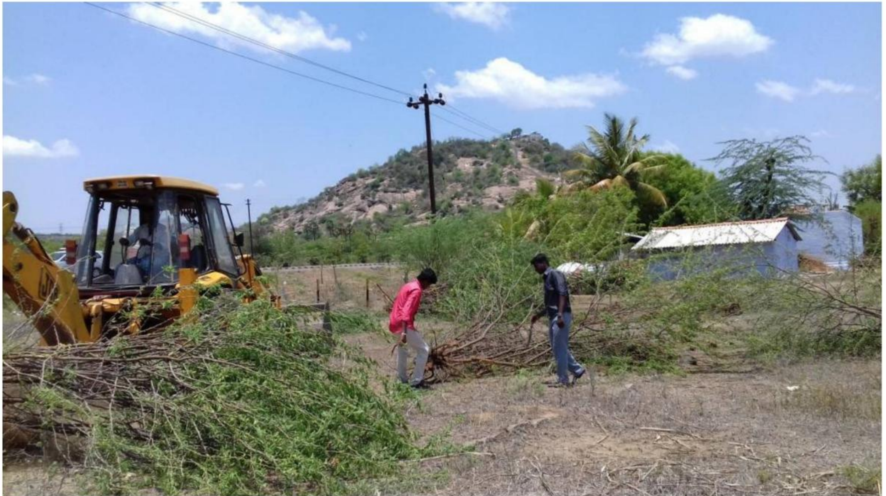
Removal of Kombaikadu Semai Karuvelan Trees on 31.03.2017 Our NSS Volunteers removing the Semai Karuvelan Trees