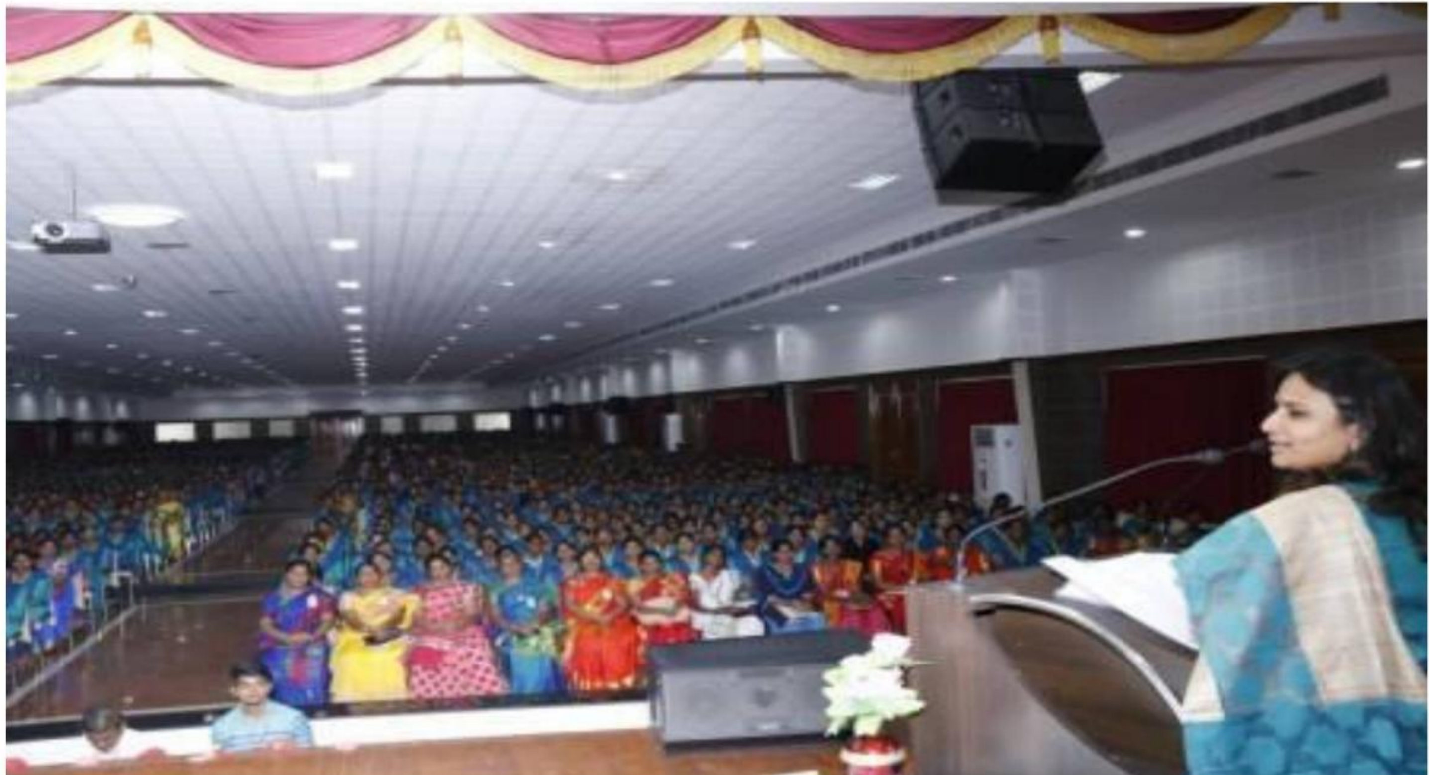
International Women's Day Celebration on 08.03.2017