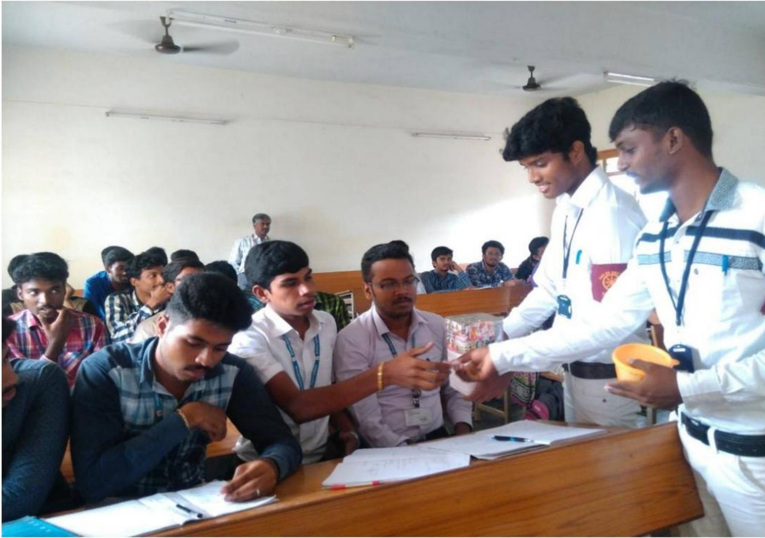
International White Cane Day on 27.09.2017