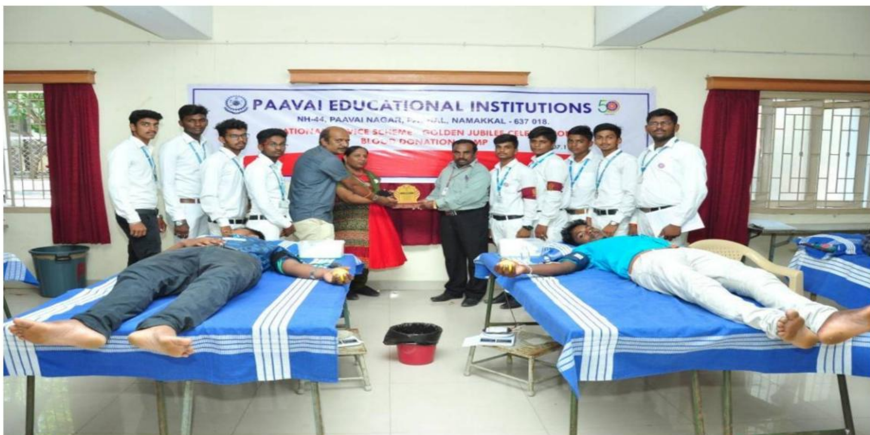
BLOOD DONATION CAMP - DATE: 24.07.2019