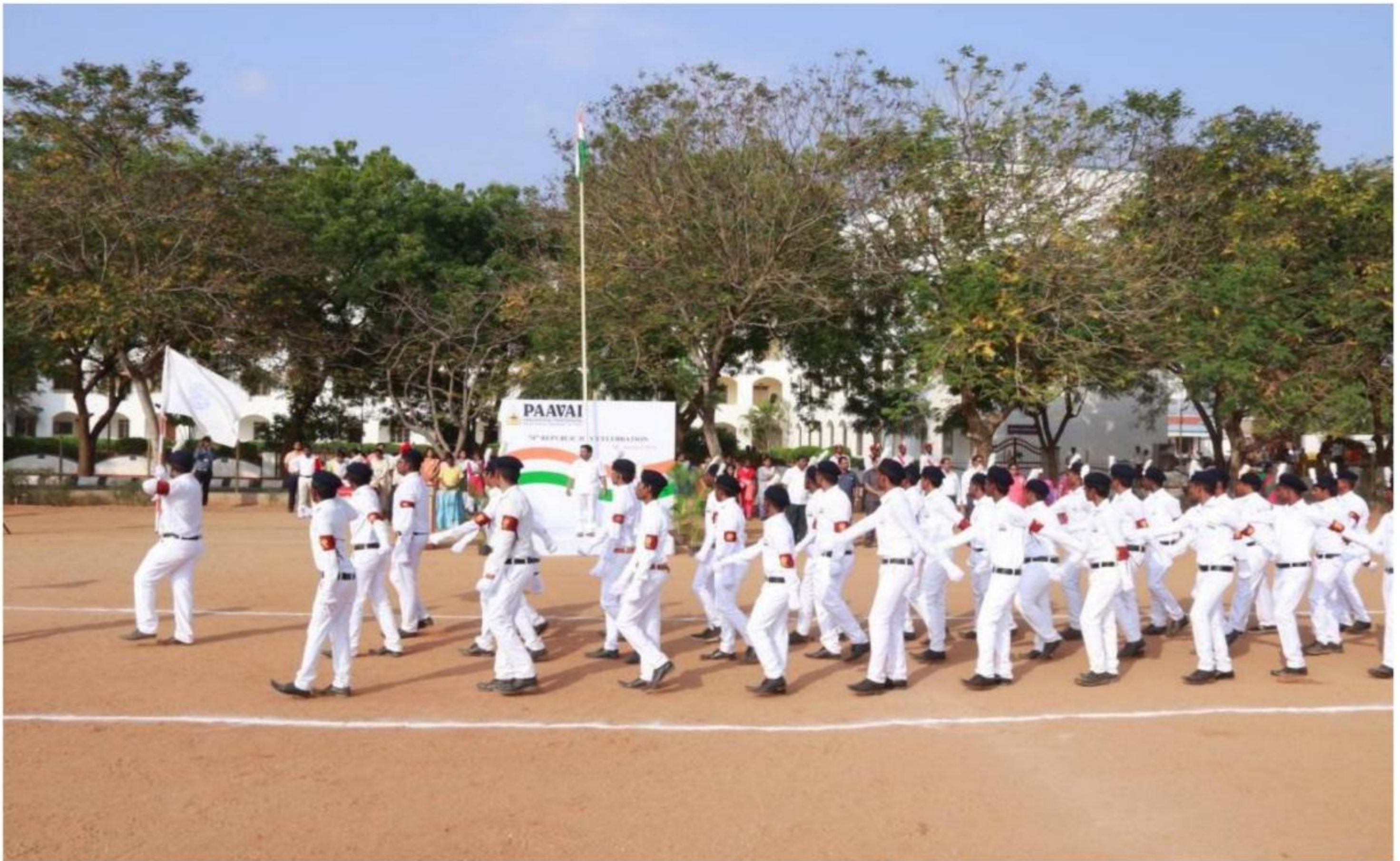
Republic Day Celebration - Date: 26.01.2019