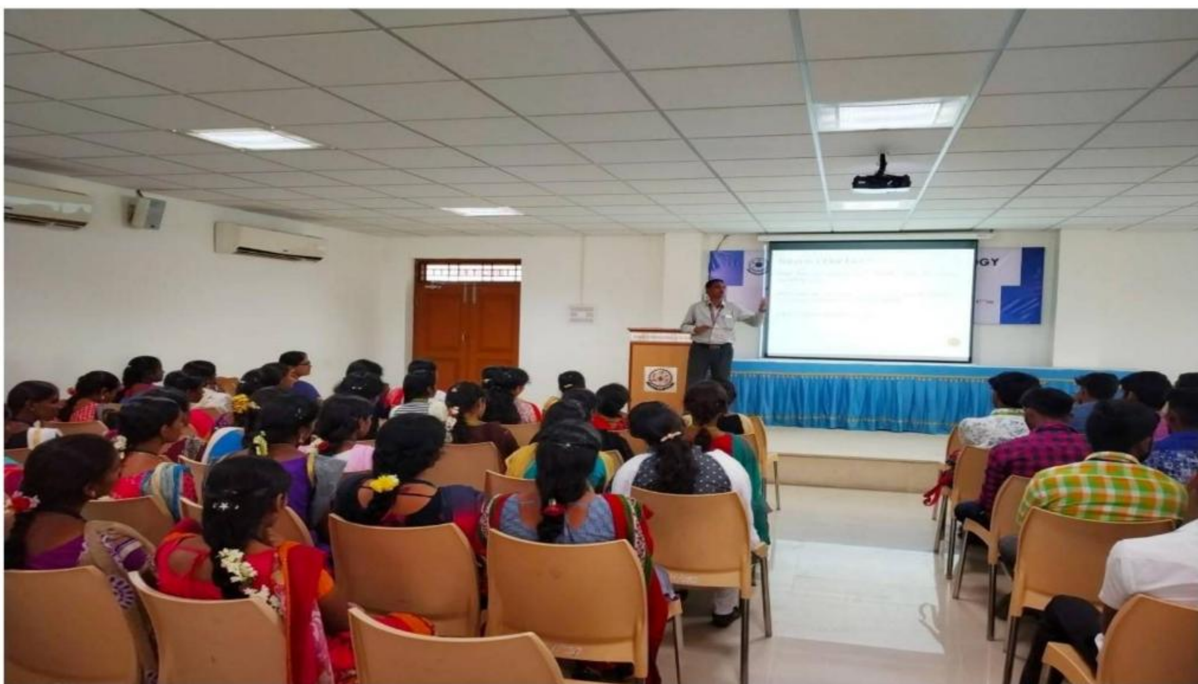
GENERAL ORIENTATION PROGRAMME - DATE: 12.09.2019