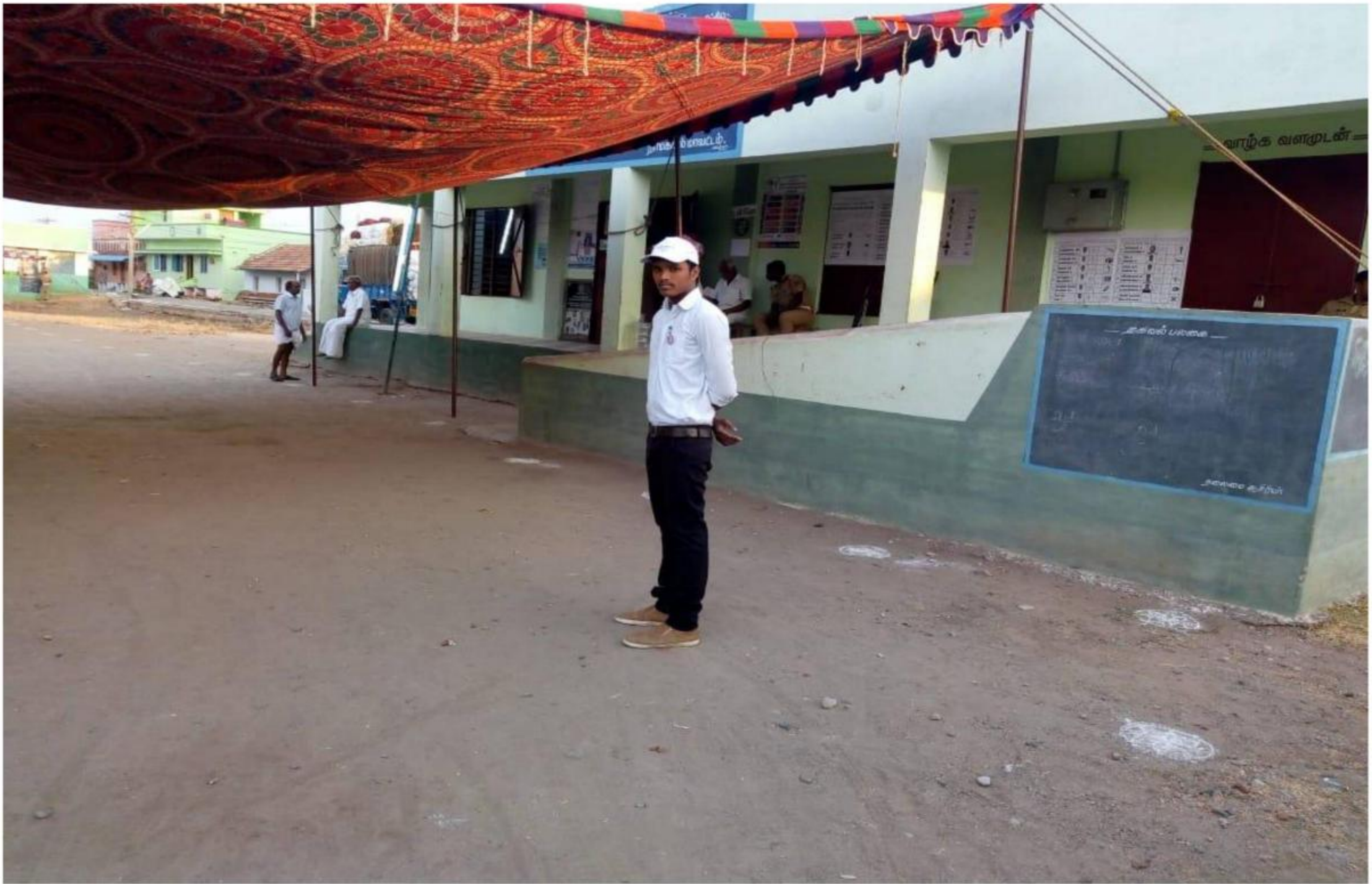
Lok Sabha Election-2019 Volunteer ship on 18.04.2019