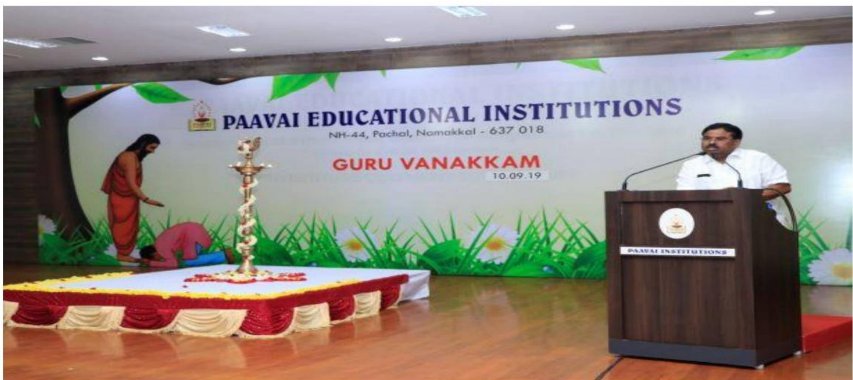
TEACHERS DAY CELEBRATION - DATE: 10.09.2019