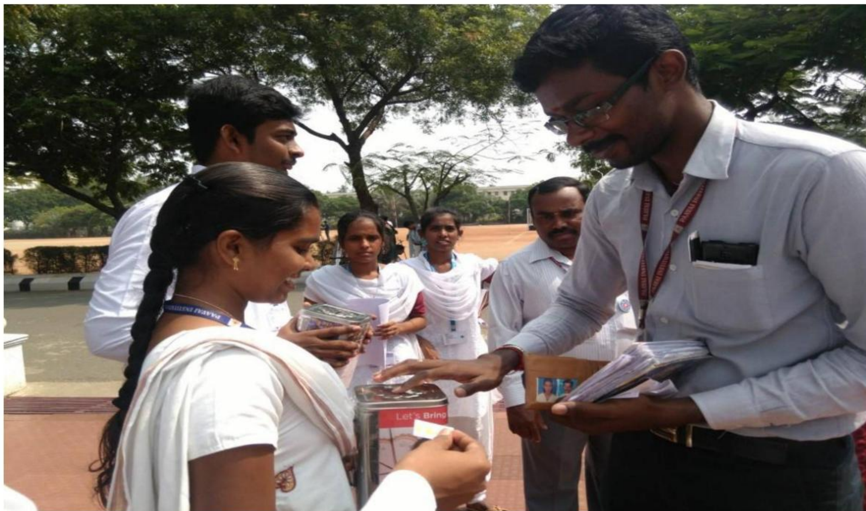
International White Cane Day on 09.11.2016 Our NSS Volunteers Collecting Fund for Visually Challenged People.