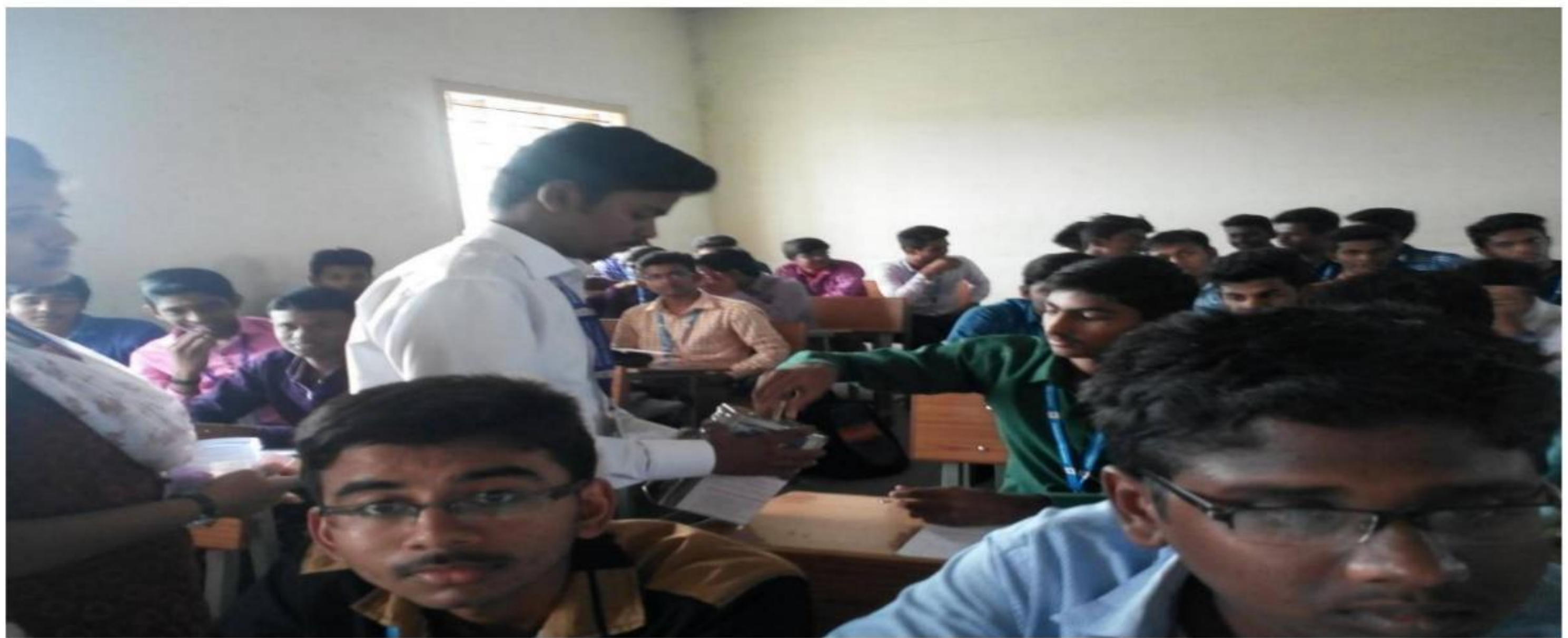
Kaja Flood Relief Fund Collection - Date: 20.11.2018

Tamilnadu Delta areas were affected by Kaja storm. For that our NSS volunteers collected fund from our college students and staff members on 20.11.2018 (Tuesday).