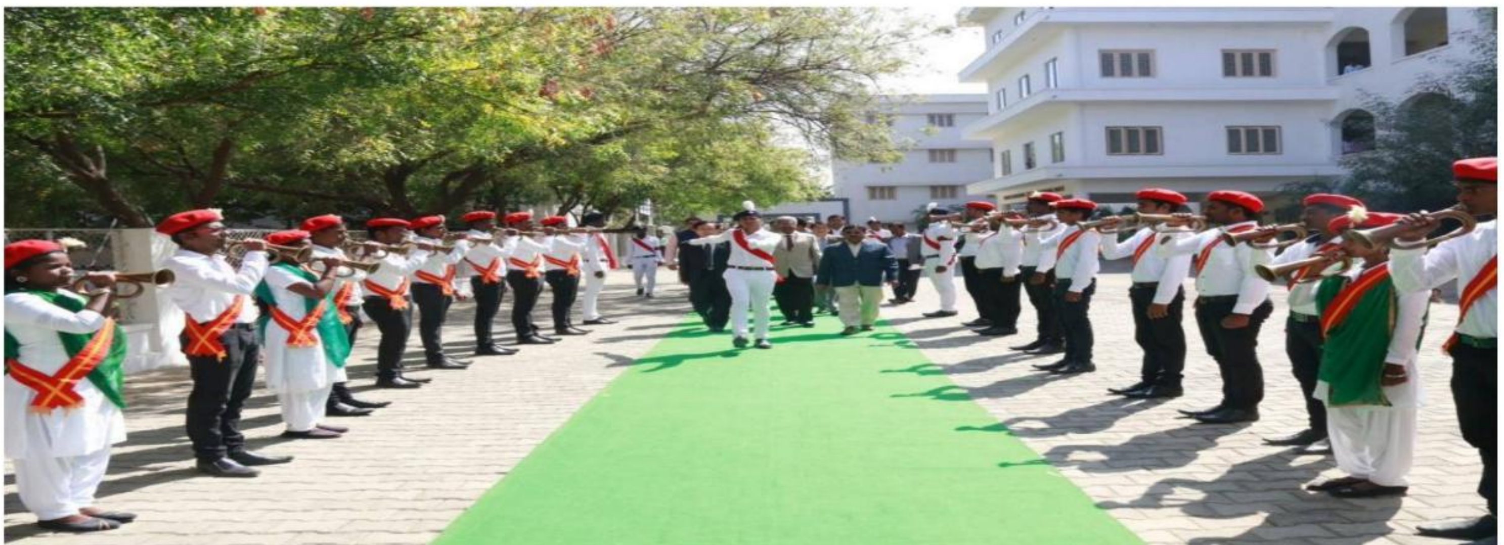
INDO-TAIWAN SUMMIT Volunteer ship on 25.02.2019 & 26.02.2019

Paavai Engineering College (Autonomous), Namakkal hosted a two-day International convention titled, “Indo-Taiwan Summit” supporting Innovation and Research through Collaboration on 25 th and 26 th of February, 2019. In this event we provided our volunteer ship and our 75 NSS volunteers provided volunteer ship.