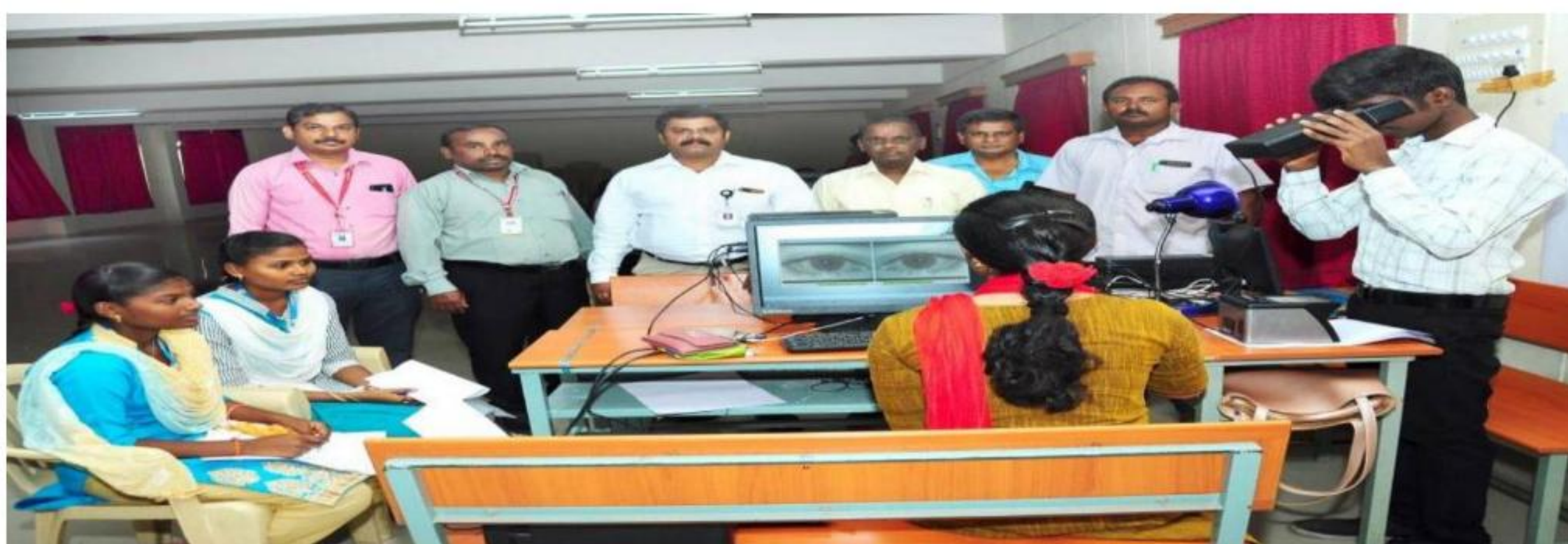
AADHAAR ENROLLMENT & UPDATION SPECIAL CAMP - DATE: 05.02.2020 to 10.02.2020