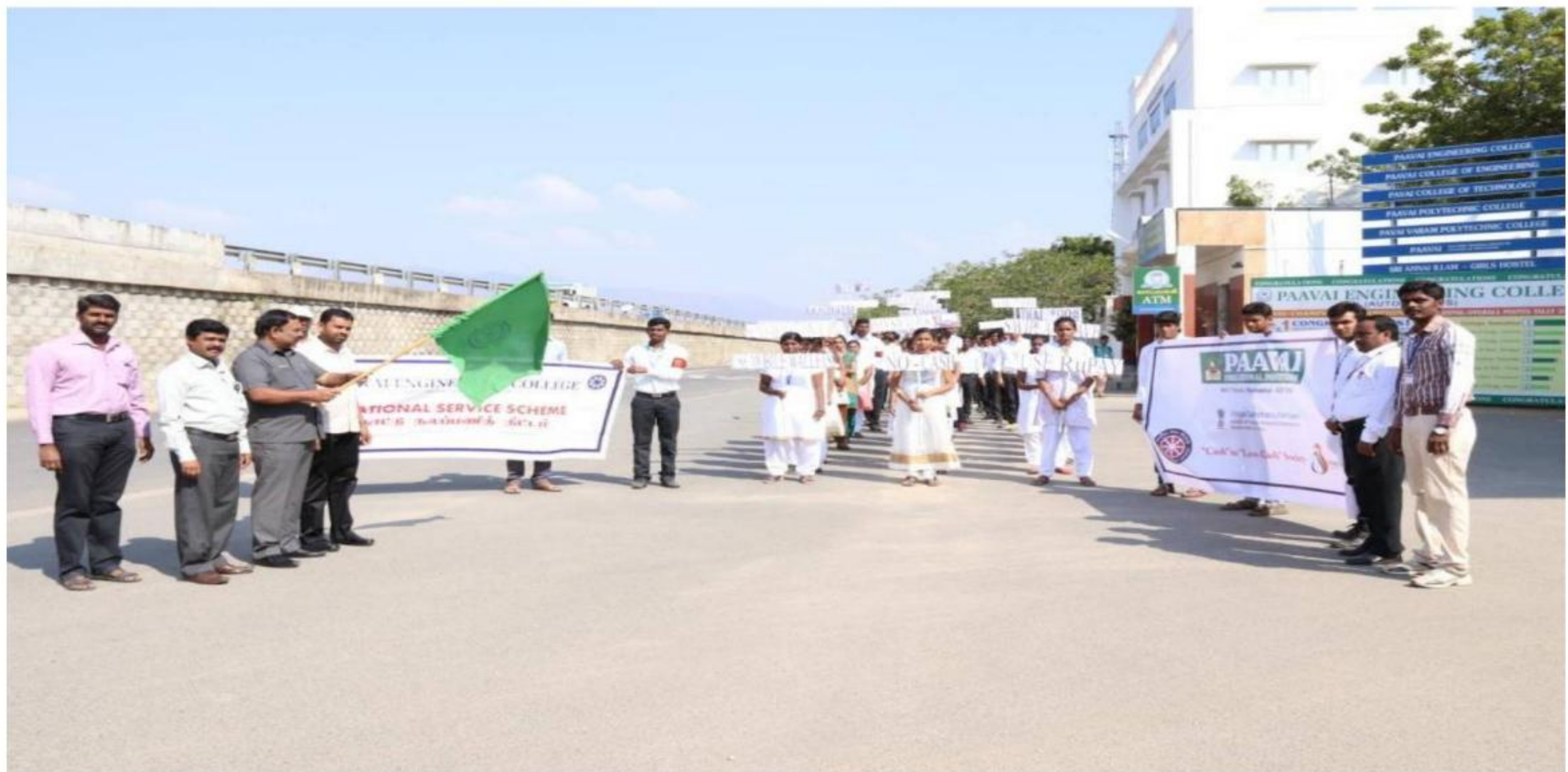
VISAKA (Vittiya Saksharata Abhiyan) Campaign on 03.02.2017 Our NSS Volunteers Creating Awareness in the VISAKA Campaign

As per the circular issued by the Ministry of Human Resource Development, Government of India, New Delhi, We were organized VISAKA (Vittiya Saksharata Abhiyan) Campaign at 9.30 AM on 03.02.2017 (Friday) from Paavai Institutions to Pudhu Chatiram with 50 NSS Volunteers for promoting digital economy in India. In this campaign we were created the awareness among the public for Rupay, Mobile wallets, Send money on UPI, Physical POS, Mobile POS and Virtual POS. The awareness given to the Shop keepers, Merchants, Owners and the public the real time usage of digital transactions.