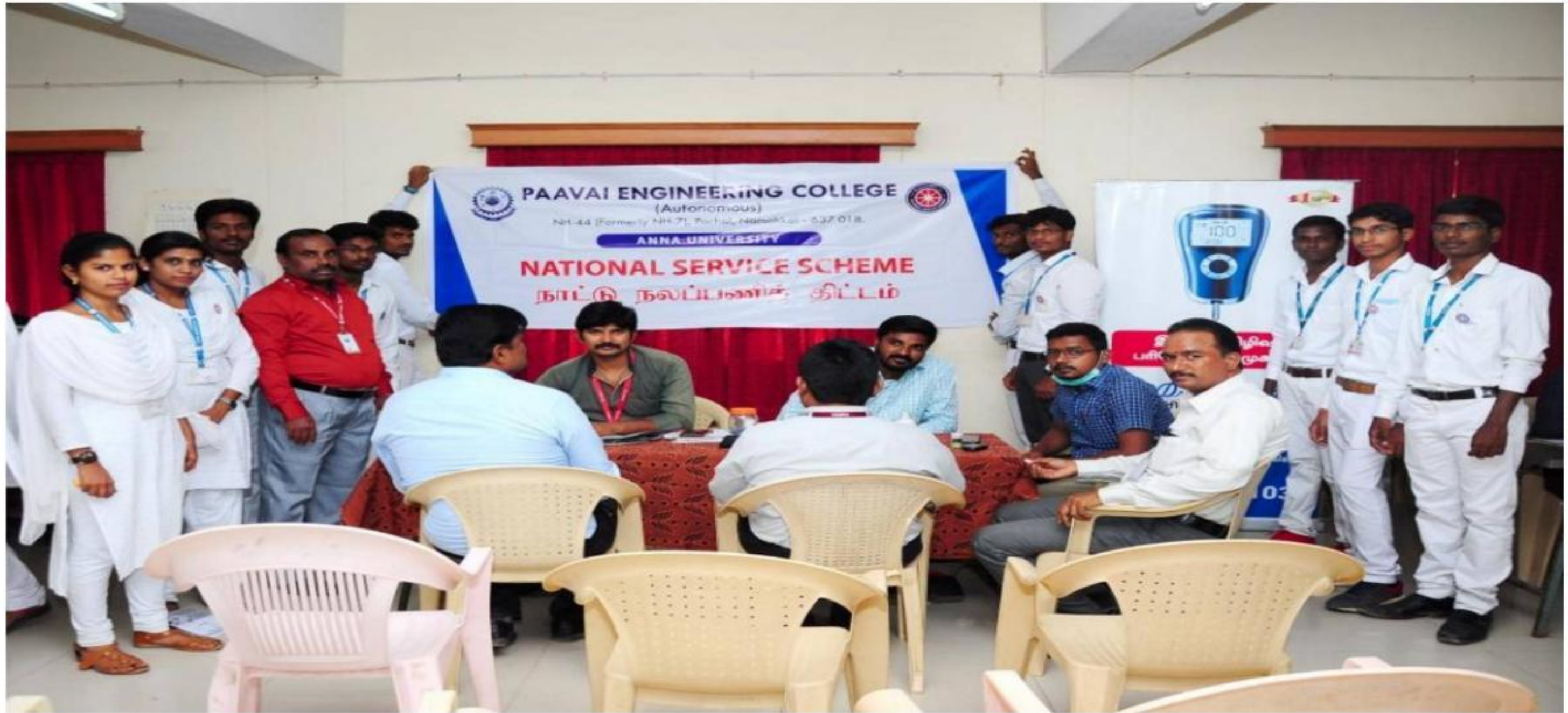
MEDICAL-EYE-DENTAL-BLOOD DONATION CAMP - DATE: 04.02.2020