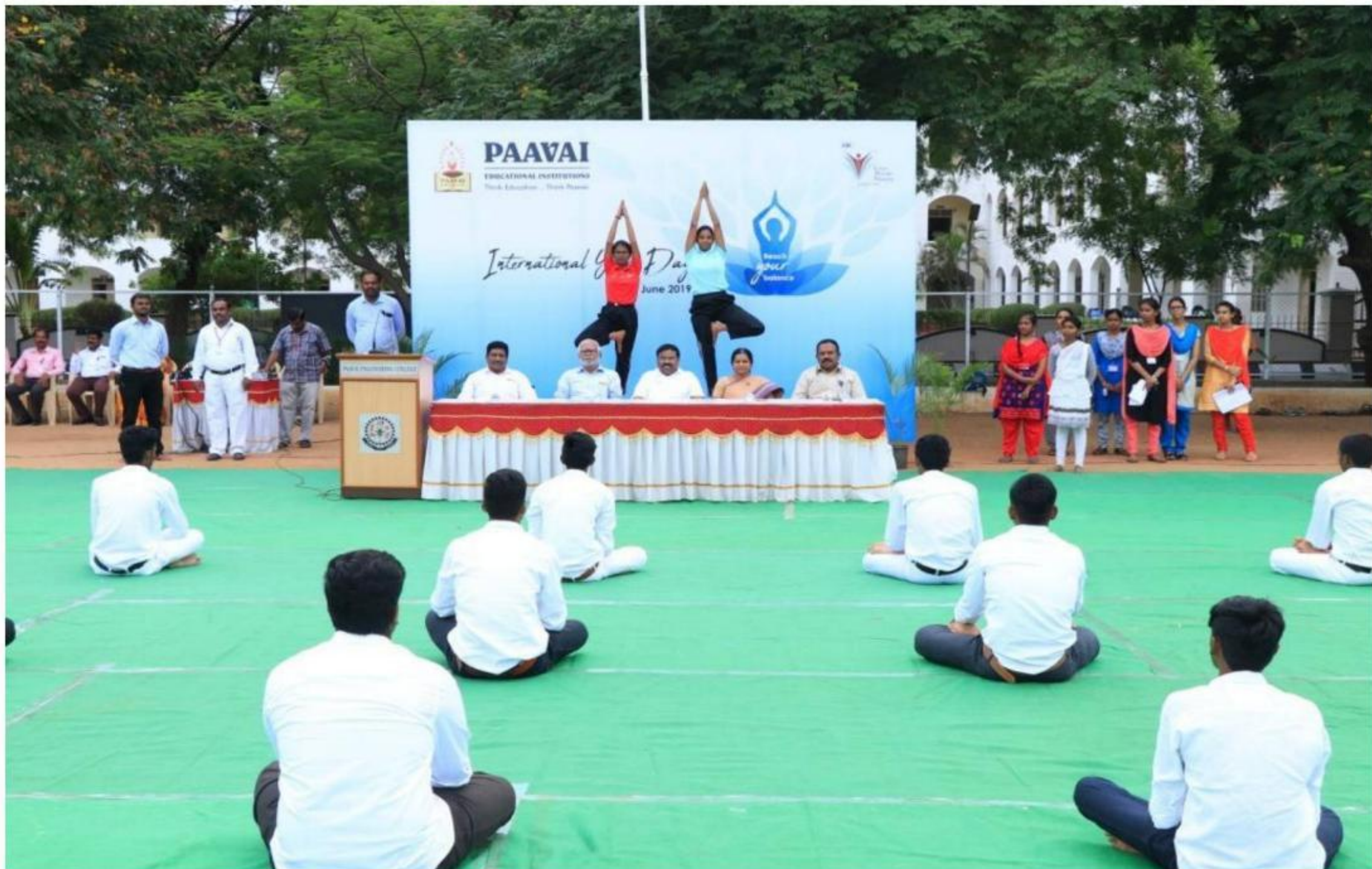
International Yoga Day Awareness and Celebration - Date: 21.06.2019