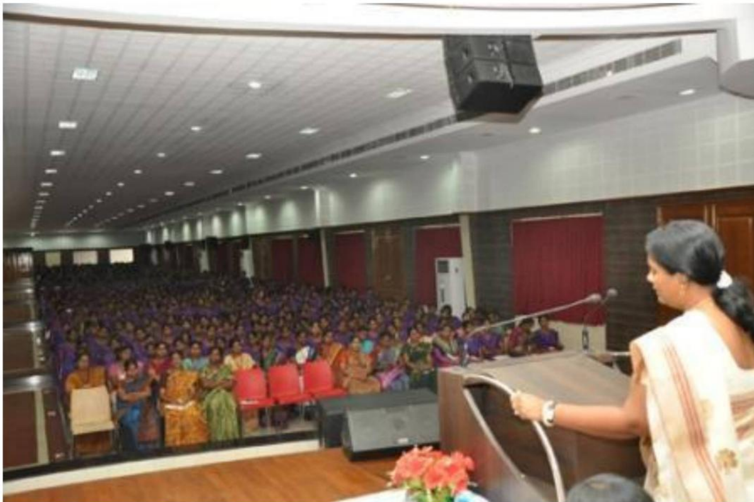
International Women's Day Celebration on 08.03.2016