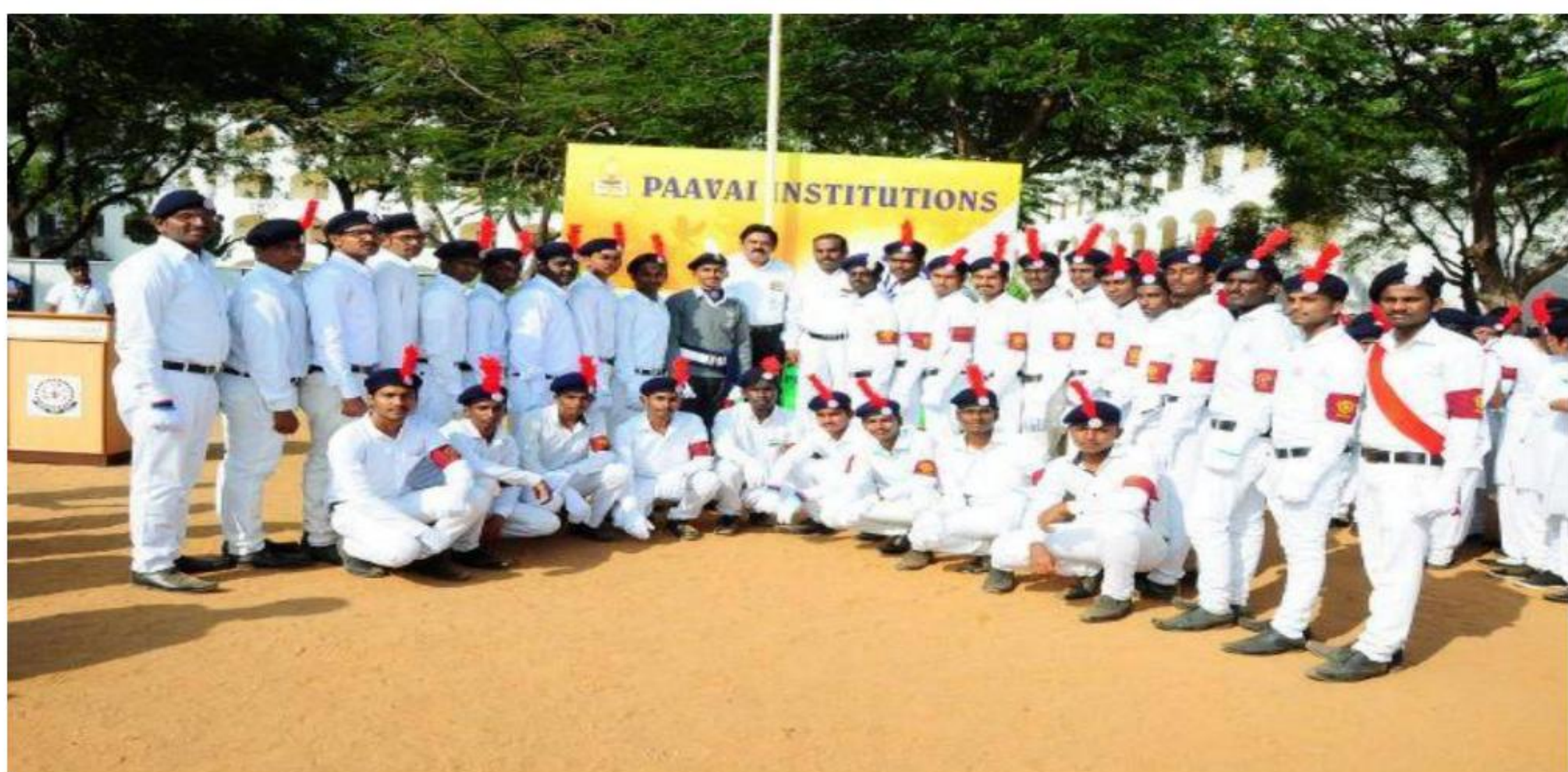
REPUBLIC DAY CELEBRATION - DATE: 26.01.2020