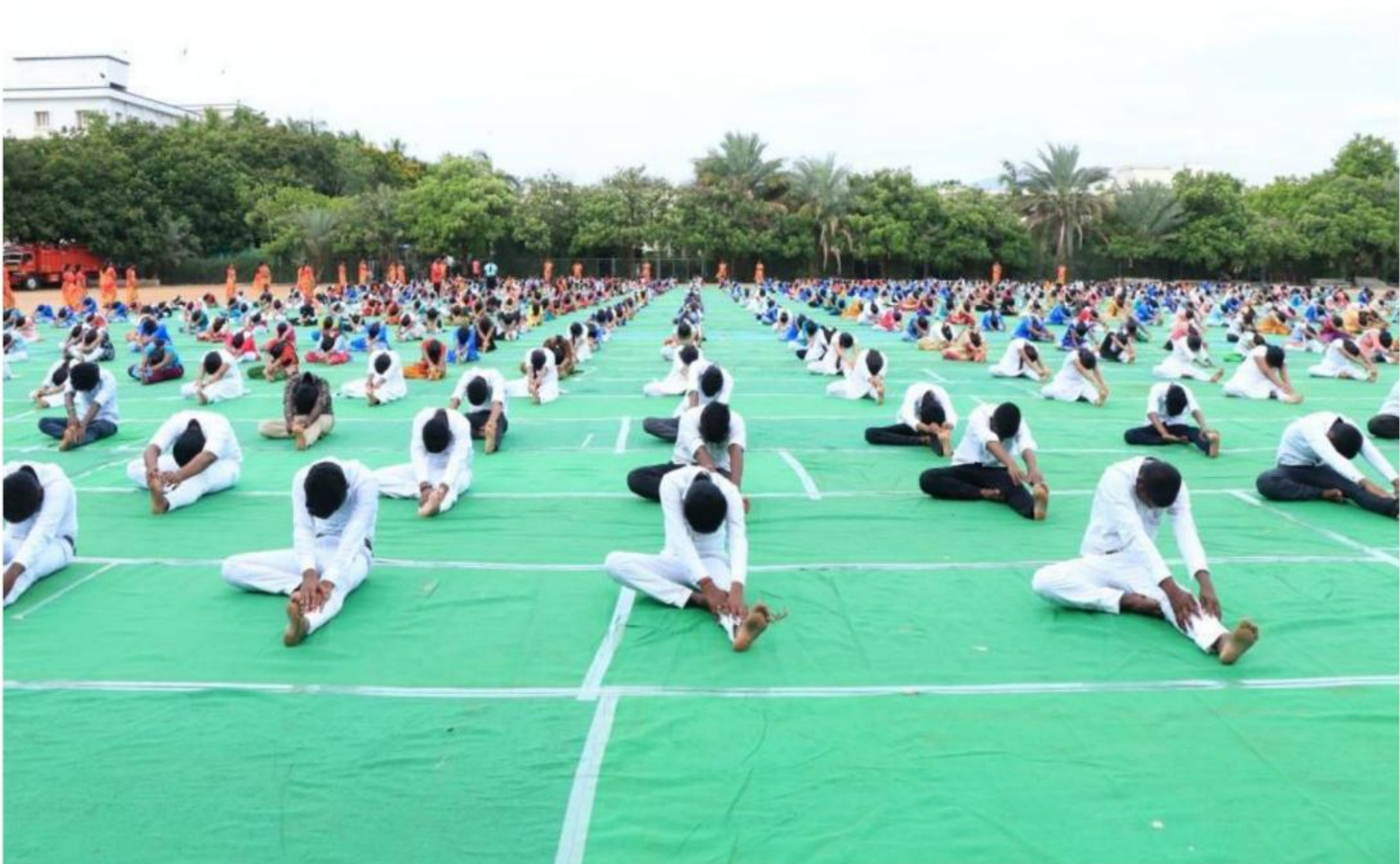
International Yoga Day Awareness and Celebration - Date: 21.06.2019