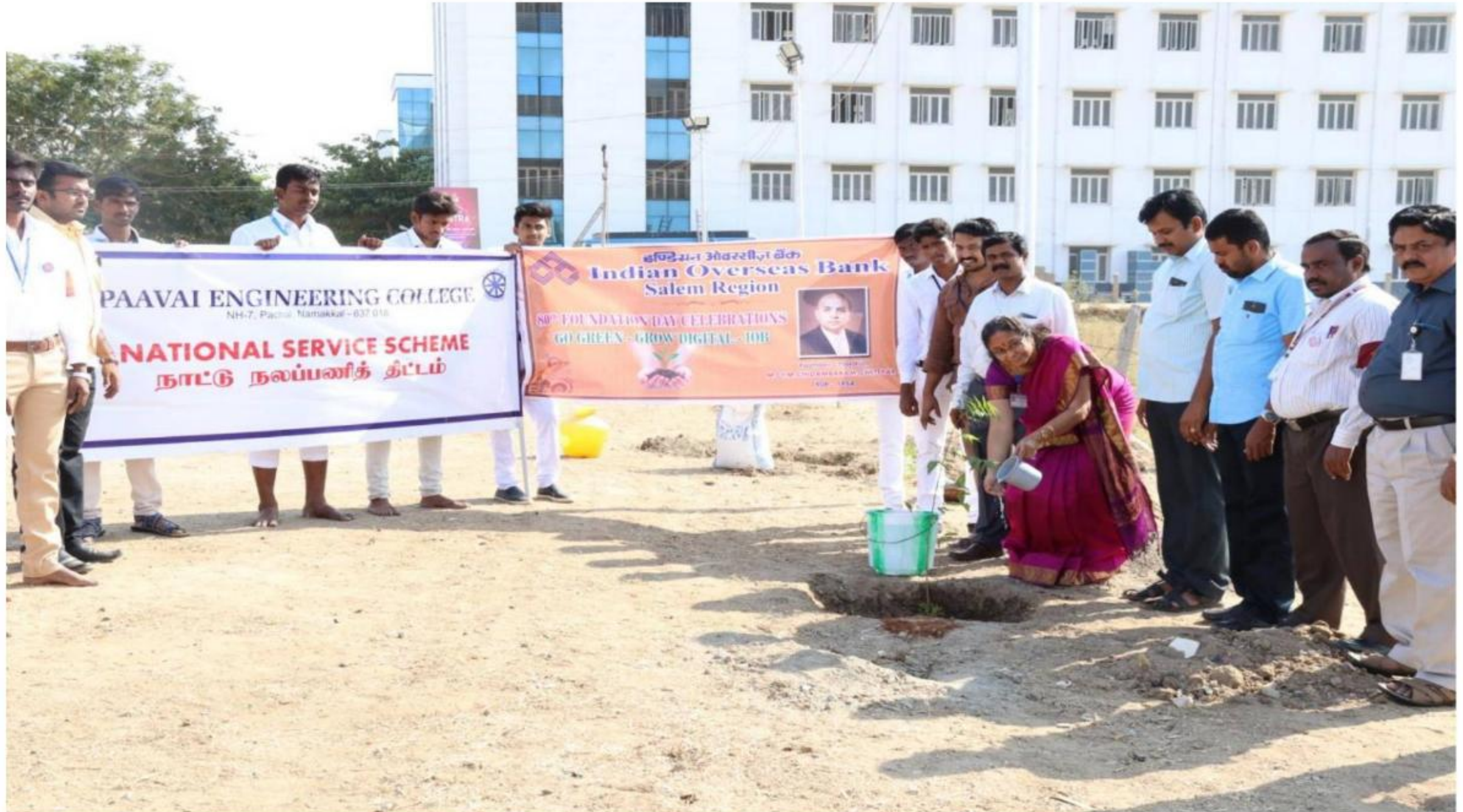
Tree Plantation on 10.02.2017 Our NSS Volunteers Planting the Trees in the Bus Yard premises

In association with Indian Overseas Bank, Namakkal and Paavai Engineering College, NSS Volunteers planted the saplings around in the Bus Yard. We planted 50 trees and provided the roof for the trees. In this tree plantation activity 25 volunteers were participated.