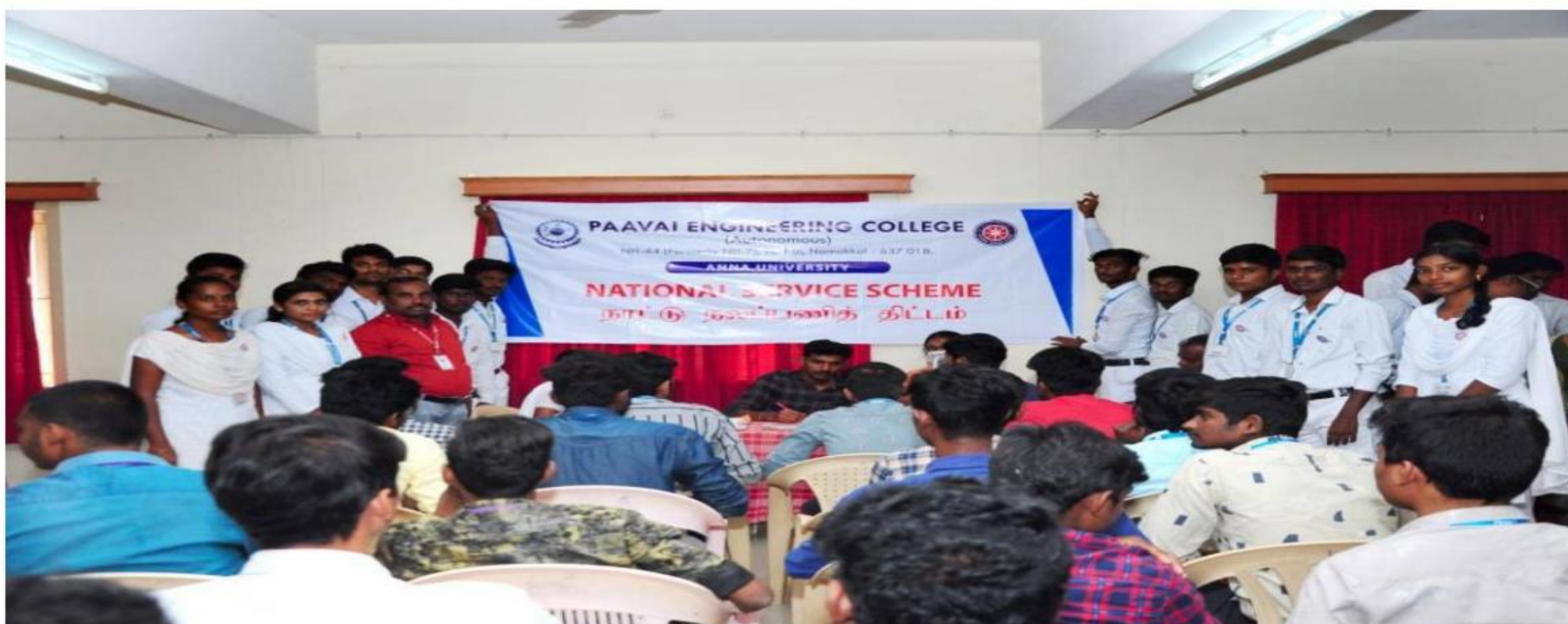
MEDICAL-EYE-DENTAL-BLOOD DONATION CAMP - DATE: 04.02.2020