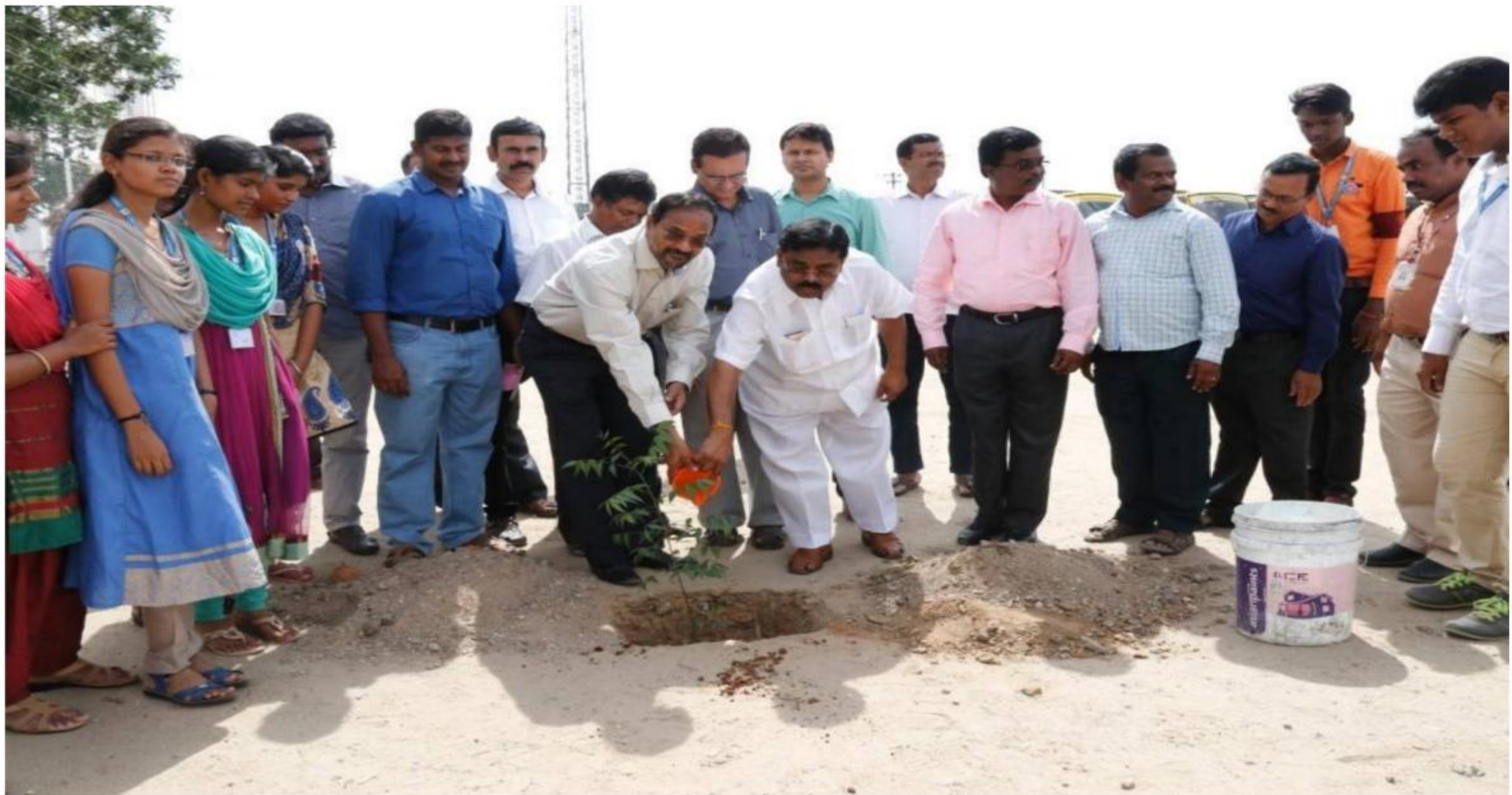
Tree Plantation on 24.07.2017 Our Chairman, Bank Officers and NSS Volunteers Planting the Saplings in the Bus Yard premises

In association with Indian Overseas Bank, Namakkal and Paavai Engineering College, NSS Volunteers planted the saplings around in the Bus Yard on 24.07.2017 (Monday). We planted 50 saplings and provided the roof for the trees. In this tree plantation activity 25 volunteers were participated.