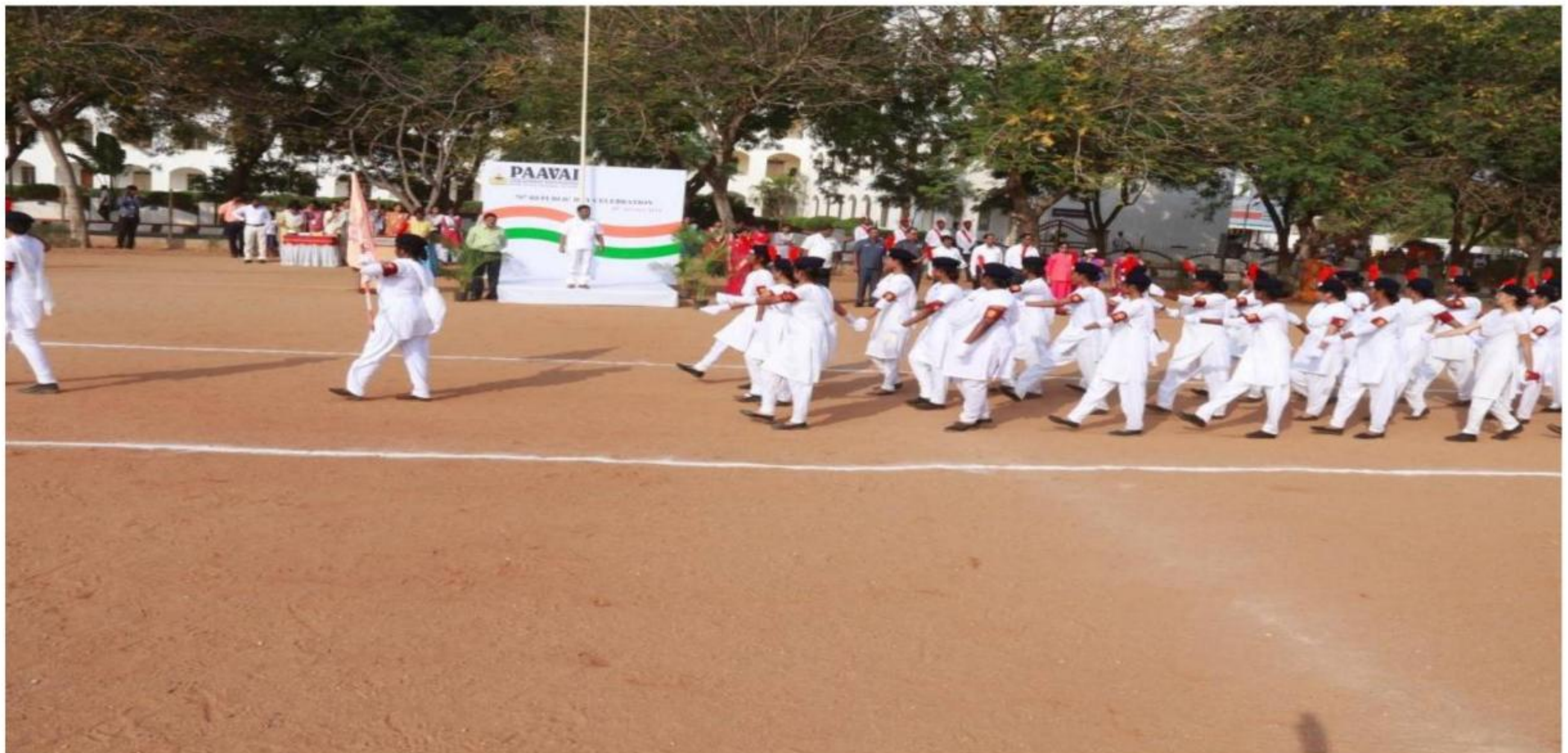
Republic Day Celebration - Date: 26.01.2019

We celebrated our Republic Day on 26 th January, 2019. Our NSS volunteers more than 75 students willingly participated in the march past. At the end of the programme, Republic Day oath was taken by our students. The NSS Volunteers and Blood donors honored with the Certificates.