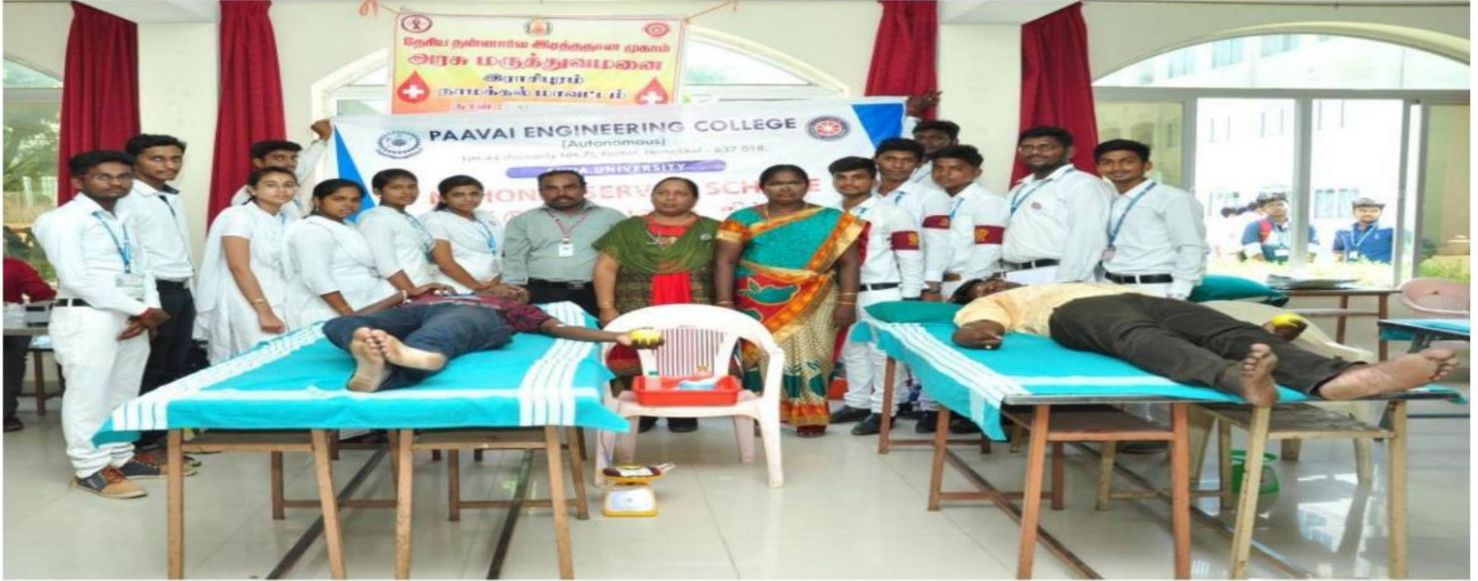
BLOOD DONATION CAMP - DATE: 24.07.2019