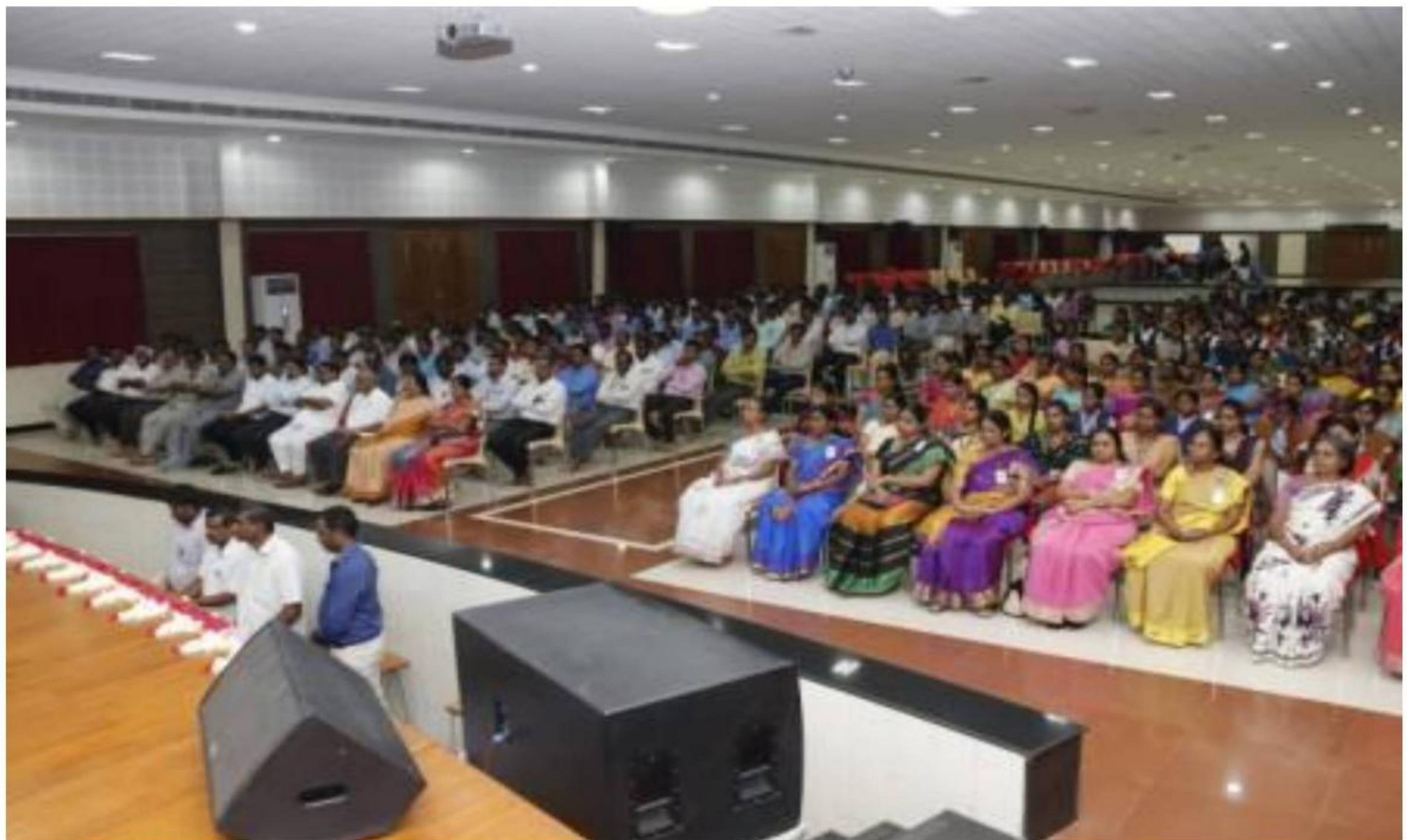
Teachers Day Celebration on 07.09.2017