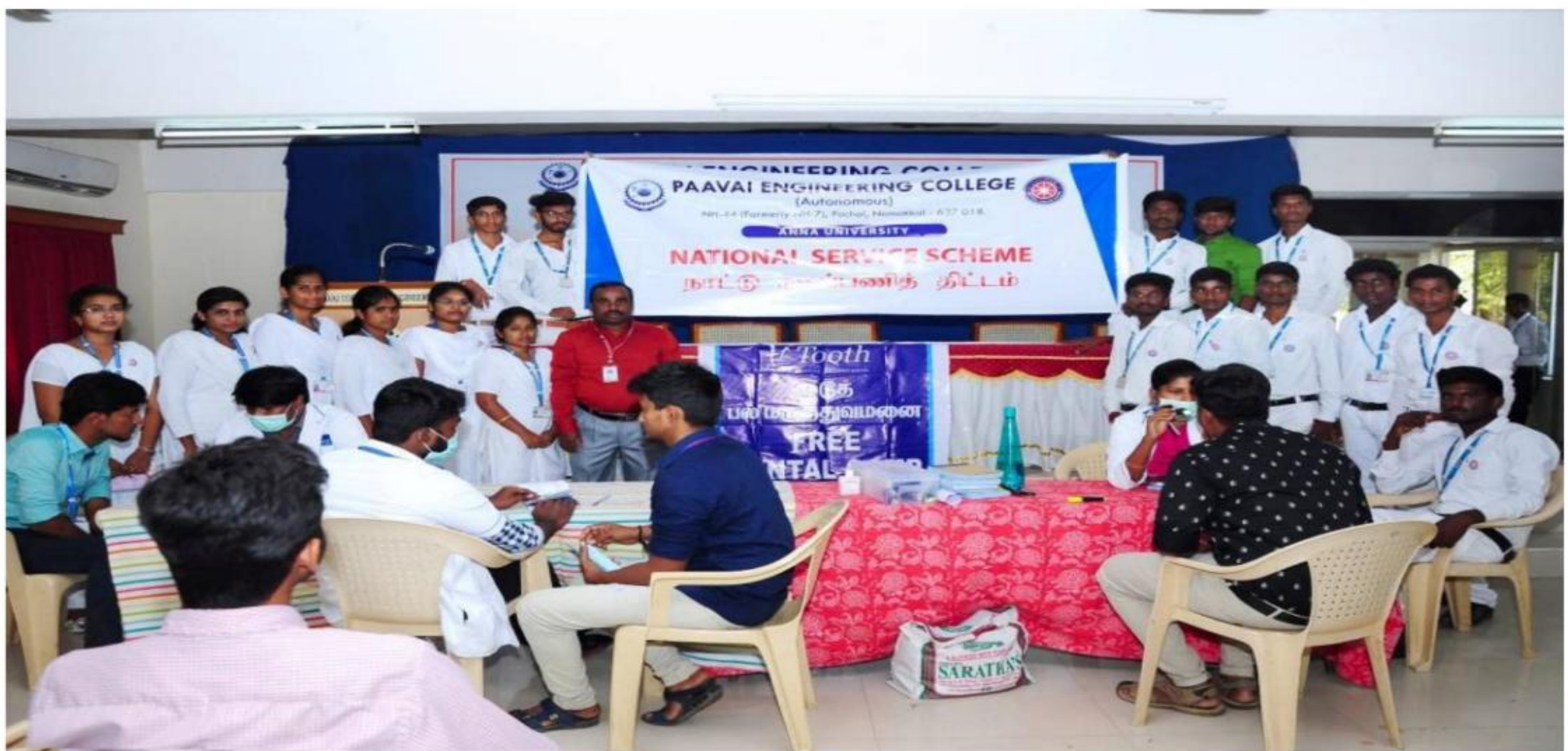
MEDICAL-EYE-DENTAL-BLOOD DONATION CAMP - DATE: 04.02.2020