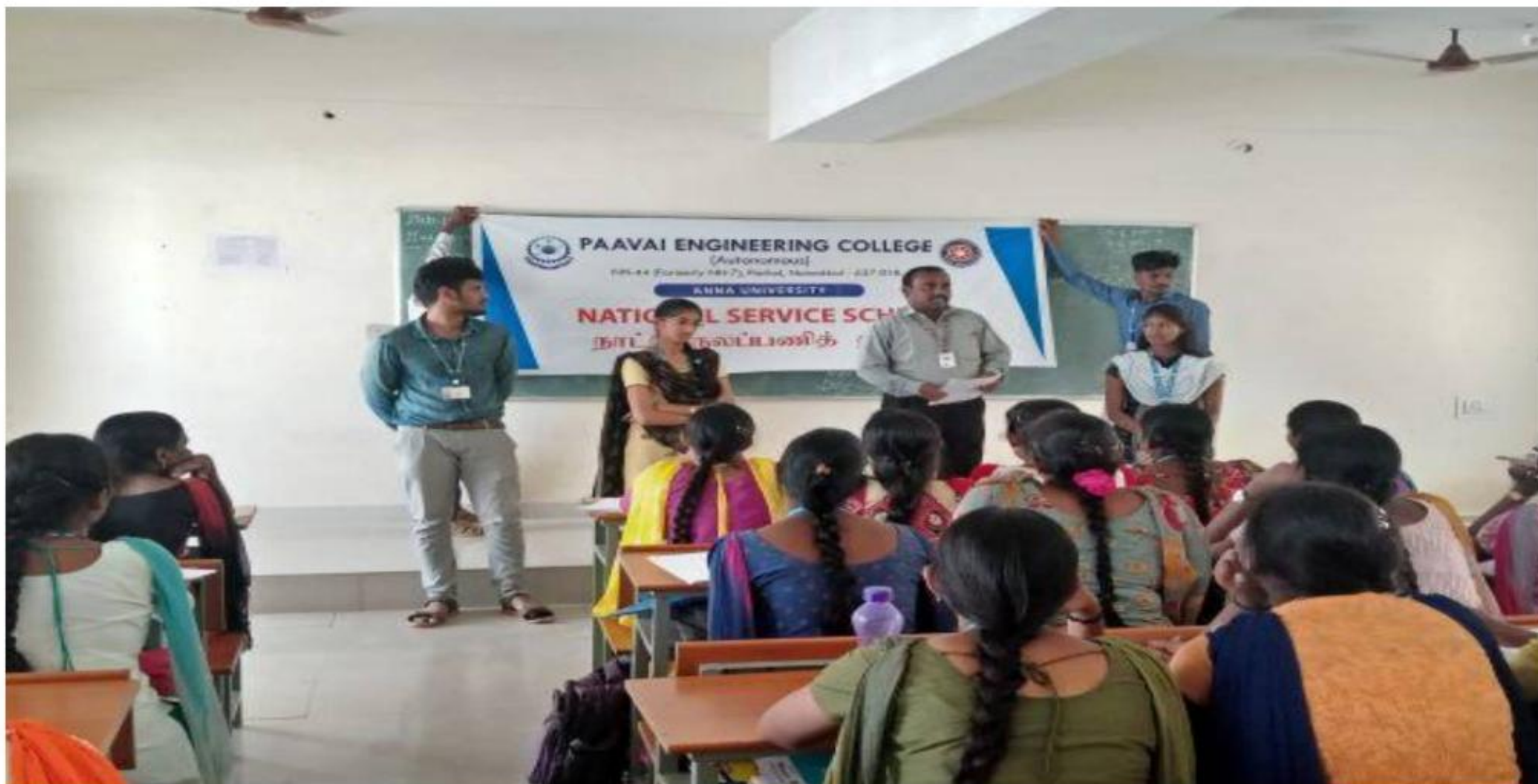
COVID-19 (CORONA VIRUS) AWARENESS PROGRAMME - DATE: 16.03.2020

The awareness given to the students about the Corona virus spread and methods to avoid the spread of the virus. The event was aimed to spread awareness about the Novel Corona Virus and precautionary measures for the same.