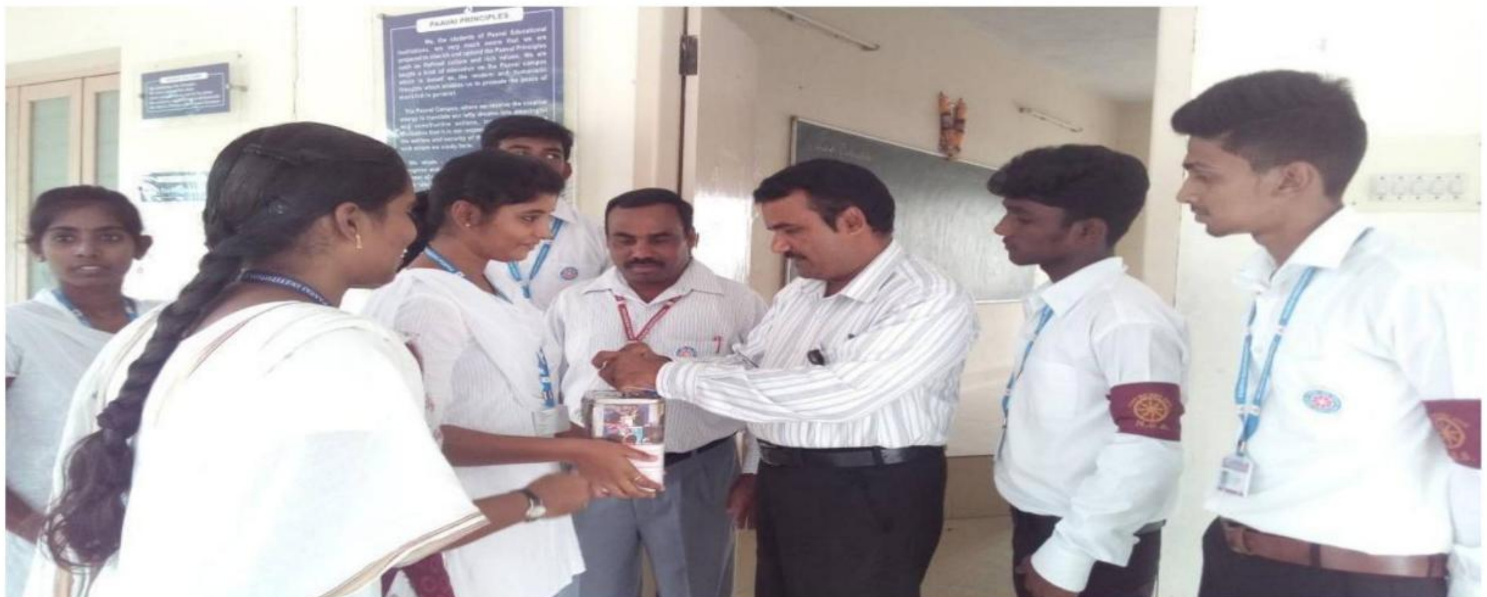
Kaja Flood Relief Fund Collection - Date: 20.11.2018