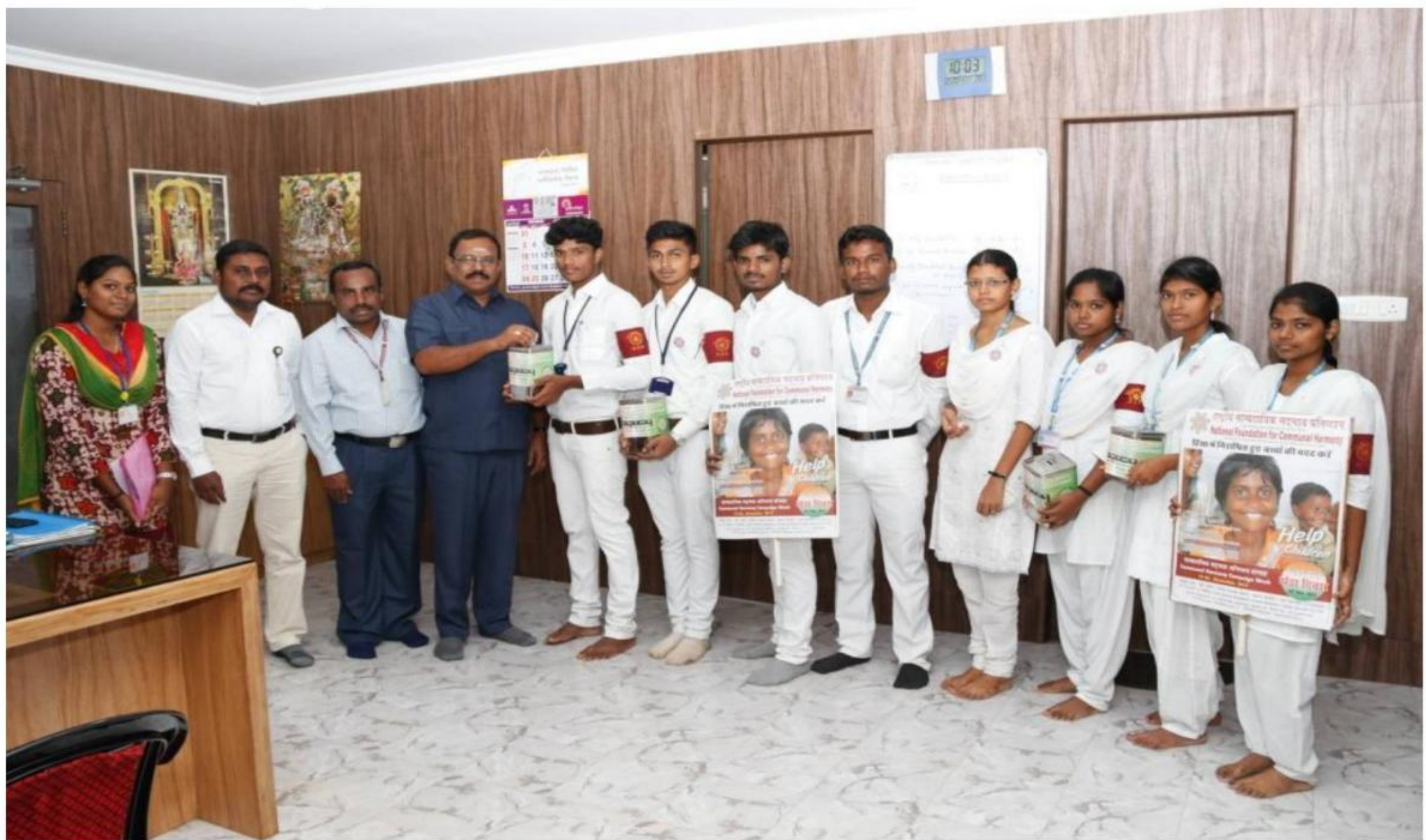
National Foundation for Communal Harmony- Flag Day Celebration on 20.11.2017

The collected amount made a Demand Draft (DD No.765348 Dated: 05.01.2018 Corporation Bank, Namakkal) and send to the Secretary, National Foundation for Communal Harmony, New Delhi – 110003.