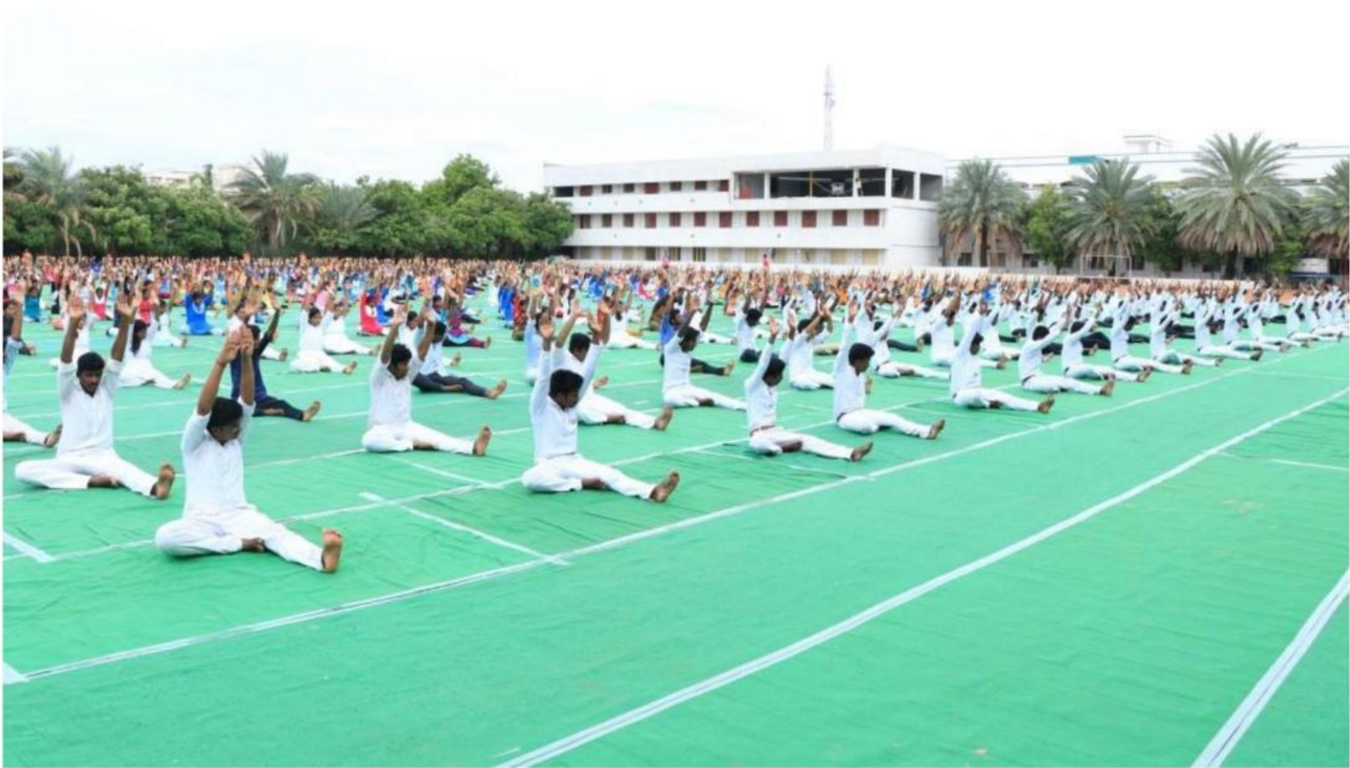
International Yoga Day Awareness and Celebration - Date: 21.06.2019