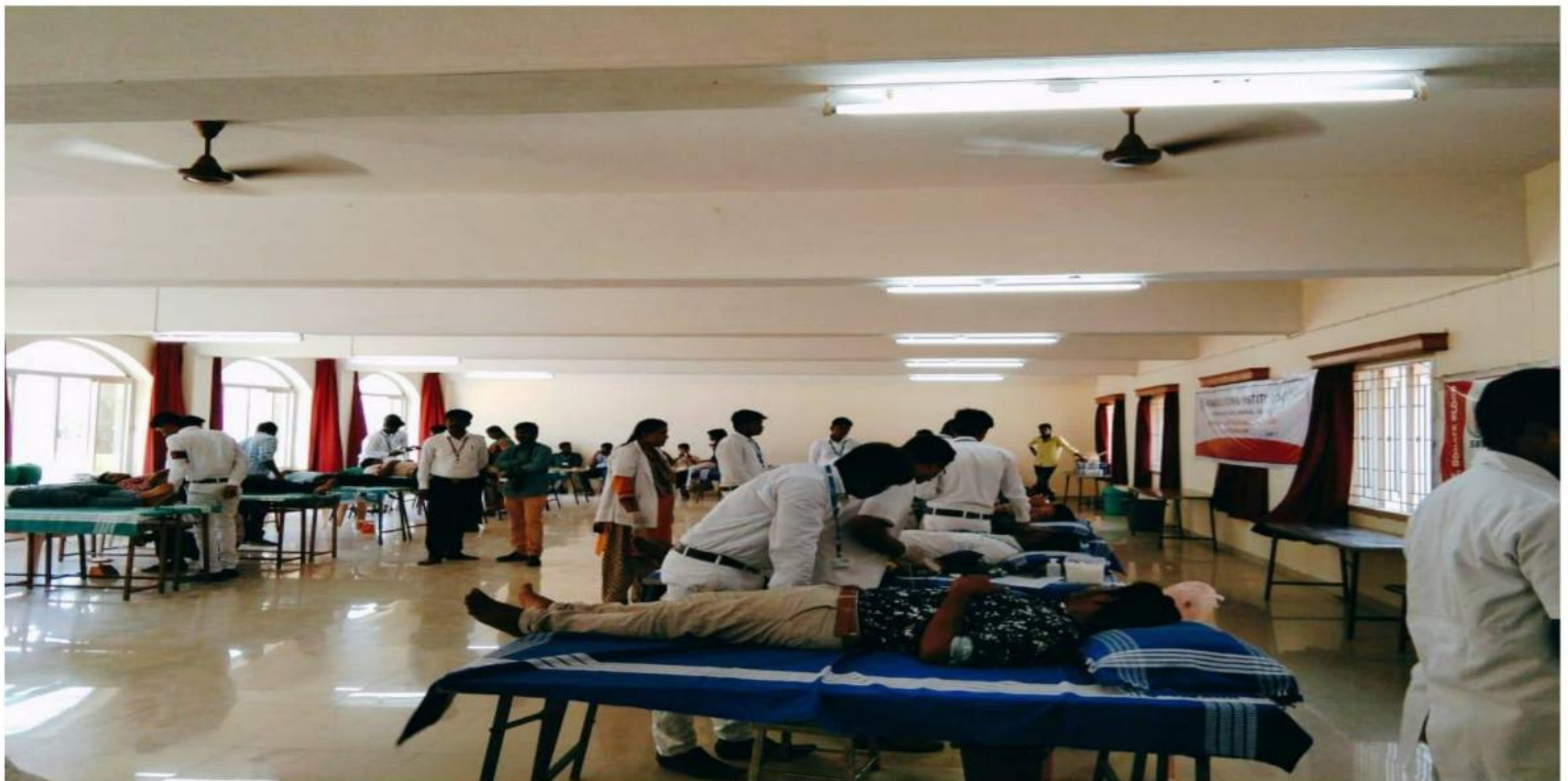
BLOOD DONATION CAMP - DATE: 24.07.2019