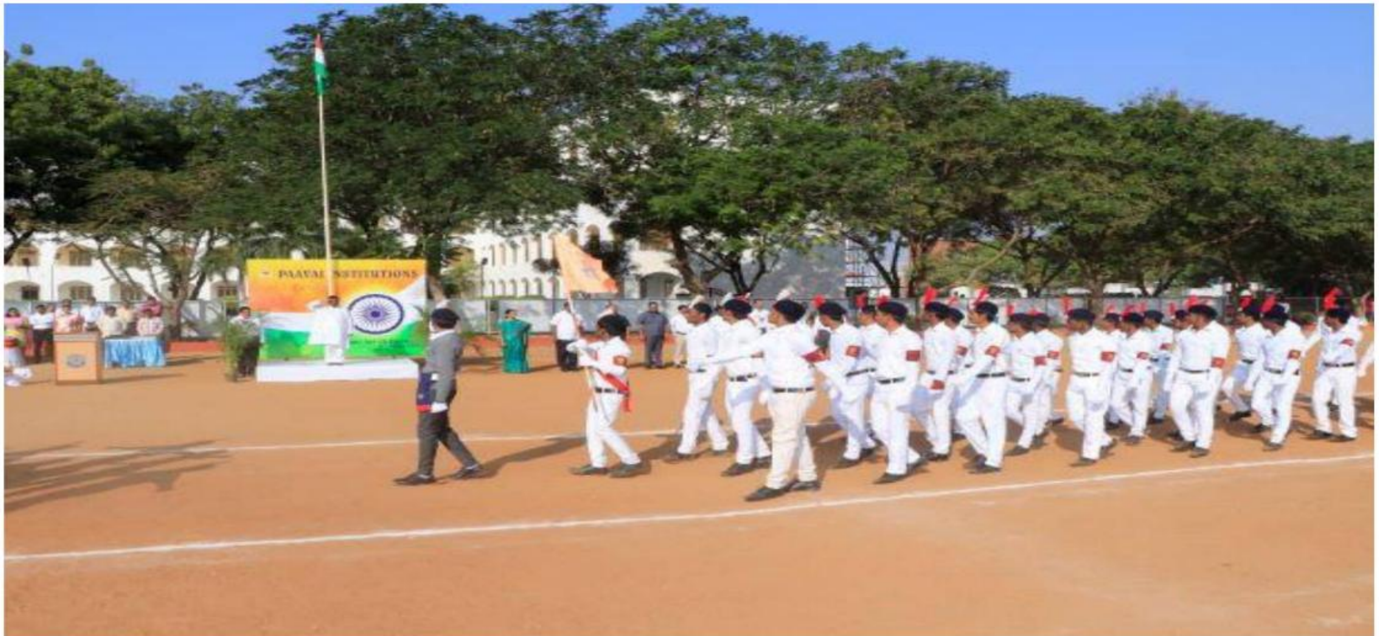
REPUBLIC DAY CELEBRATION - DATE: 26.01.2020

We celebrated our Republic Day on 26 th January, 2020. Our NSS volunteers more than 75 students willingly participated in the march past. At the end of the programme, Republic Day oath was taken by our students. The NSS Volunteers and Blood donors honored with the Certificates.