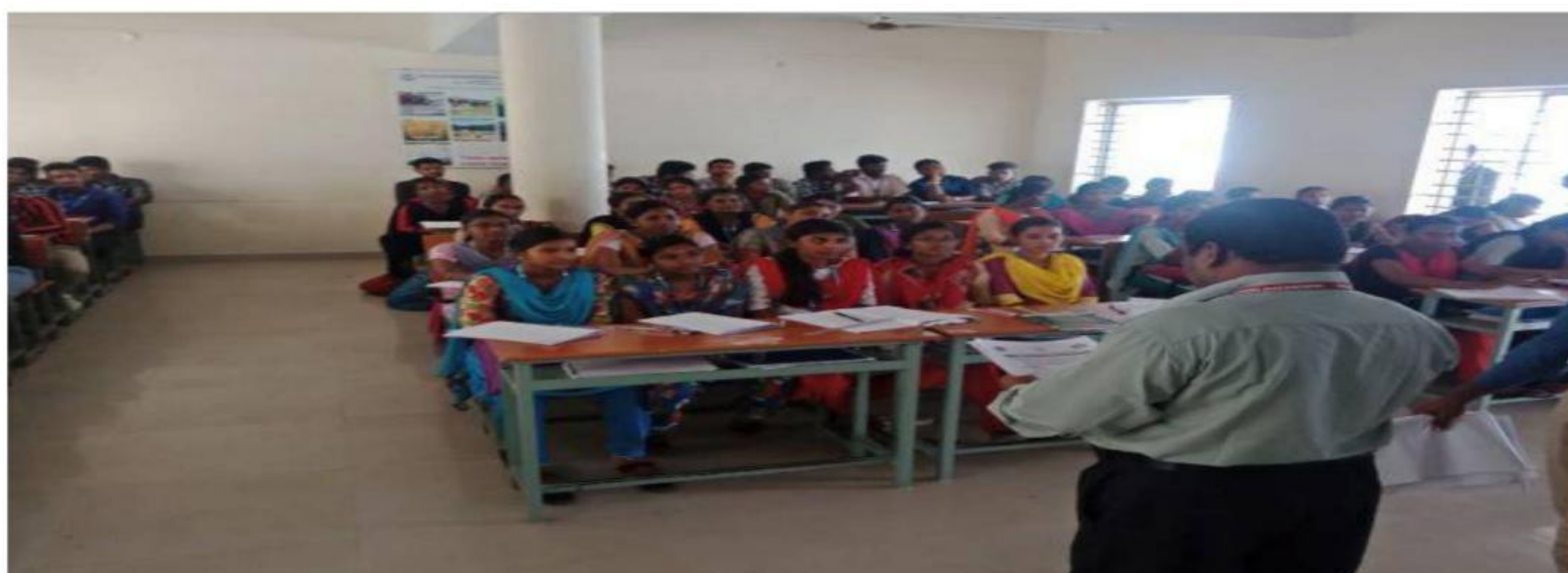
COVID-19 (CORONA VIRUS) AWARENESS PROGRAMME - DATE: 16.03.2020