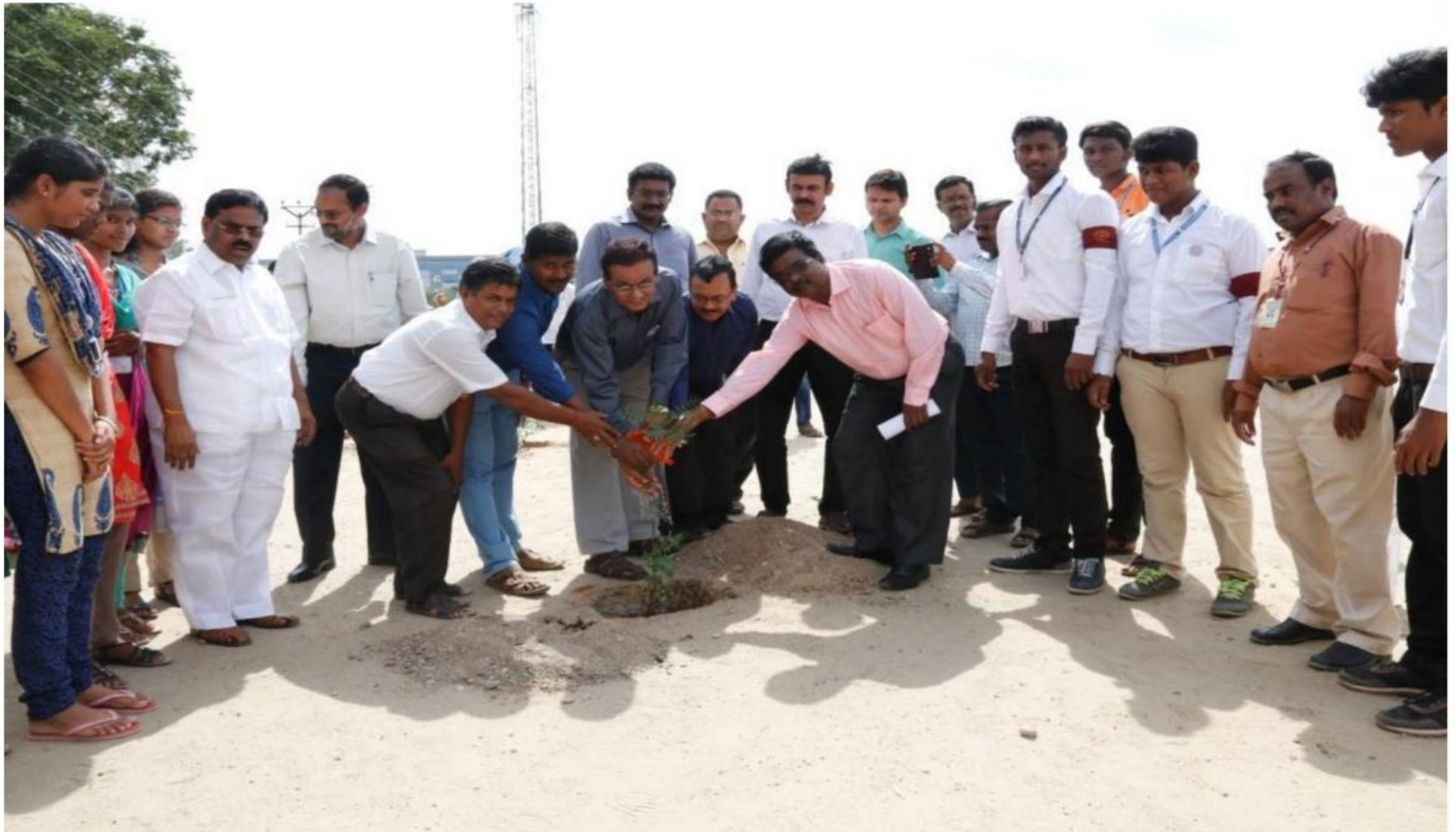
Tree Plantation on 24.07.2017 Our Chairman, Bank Officers and NSS Volunteers Planting the Saplings in the Bus Yard premises