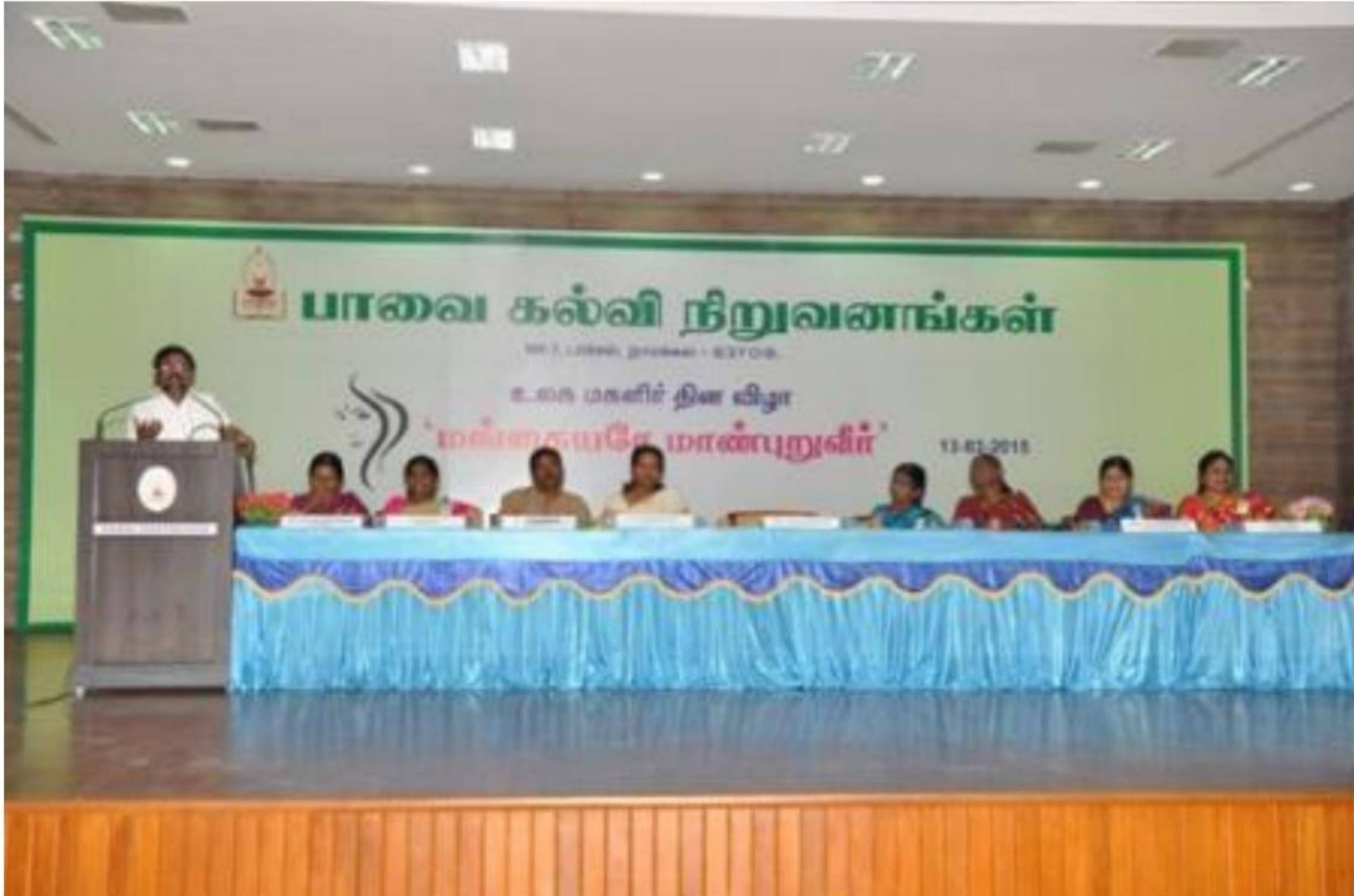
International Women's Day Celebration on 08.03.2016

International Women's Day celebrated on 08 th March 2016 in Anandha Arangam. The programme commenced with the prayer song. The Chairman of Paavai Institutions in his presidential address expressed his delight of being conditioned and loved by women in the forms of mother, wife and daughter and asserted that Paavai is proud of the women folk of Paavai. The Correspondent of Paavai Institutions felicitated the gathering and honoured the Chief Guest with shawl. The programme came to an end with the Vote of thanks, followed by the National Anthem.