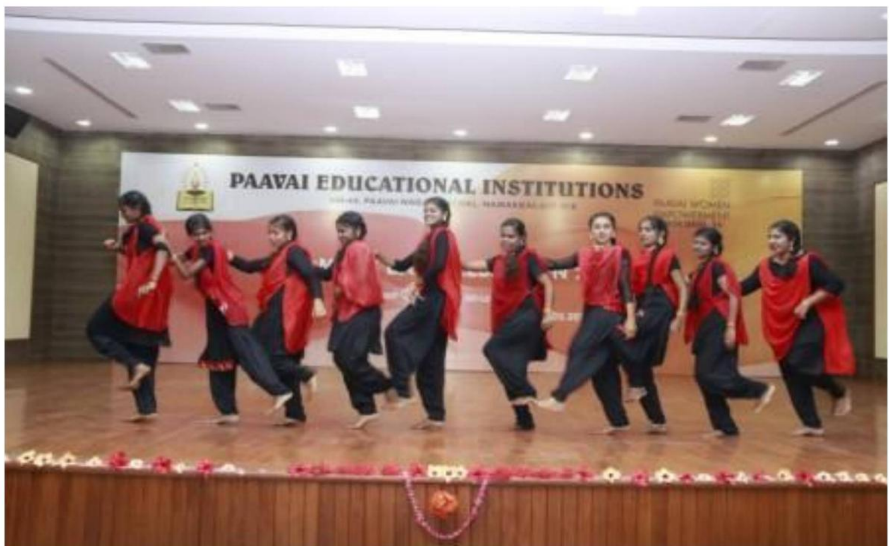
International Women's Day Celebration on 08.03.2019 International Women's Day Celebration Date: 08.03.2019