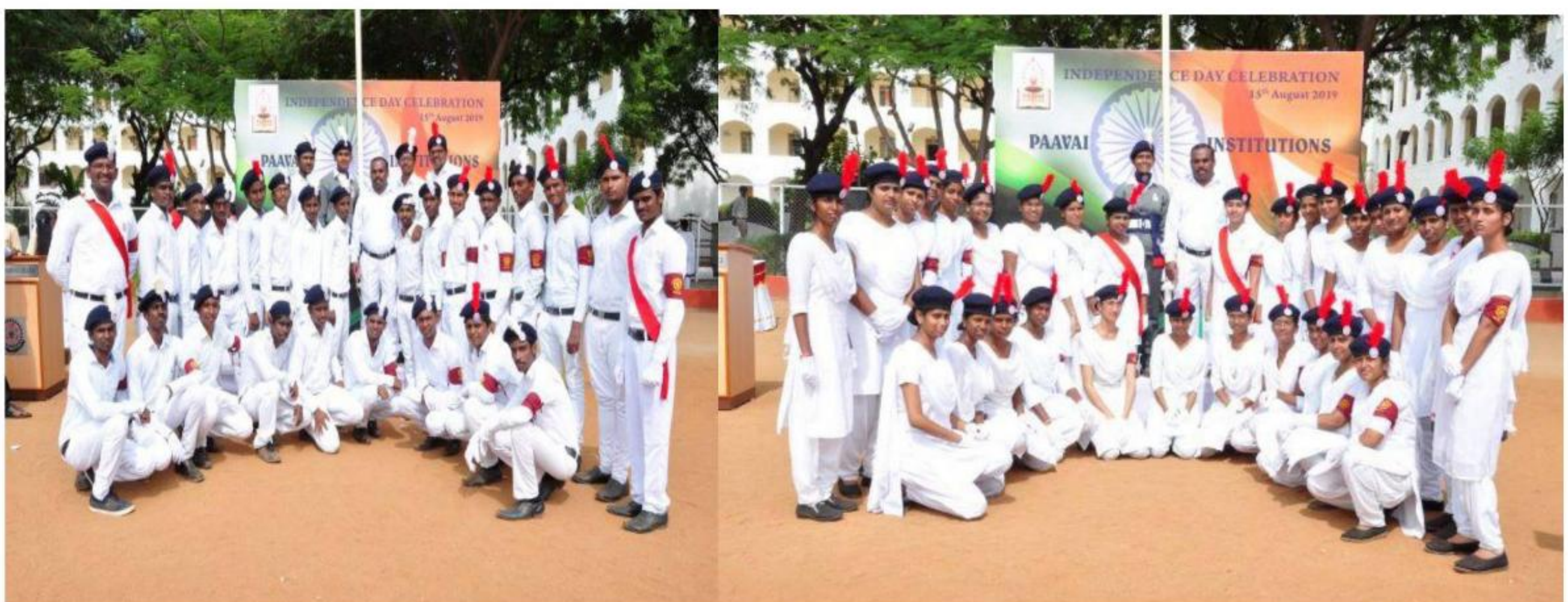
INDEPENDENCE DAY CELEBRATION - DATE: 15.08.2019