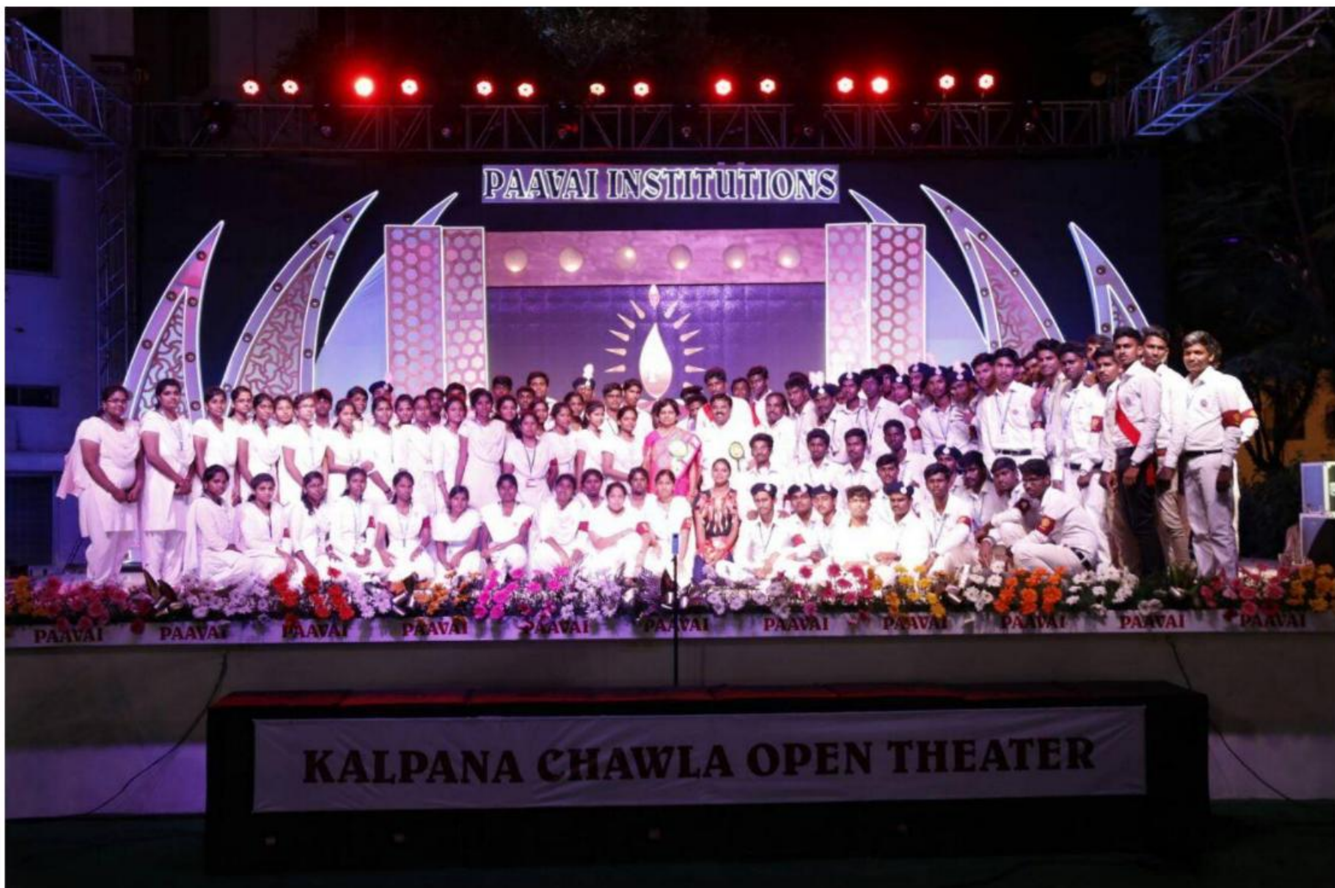
Annual Day-2018 on 24.02.2018