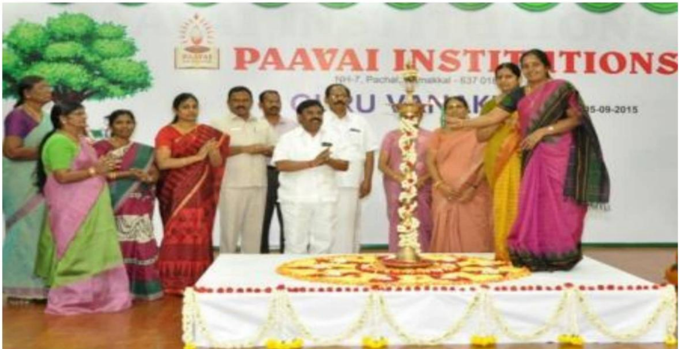
Teachers Day Celebration on 05.09.2015