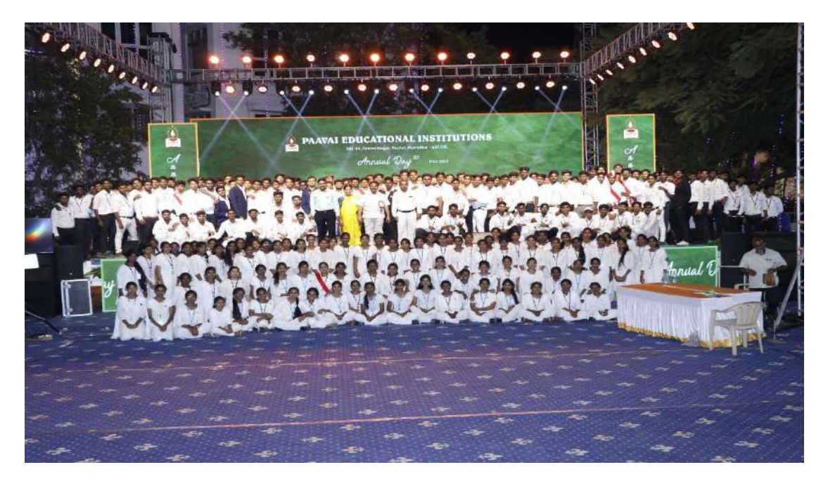
Annual Day Celebration NSS Volunteers Group photo (11.03.23)