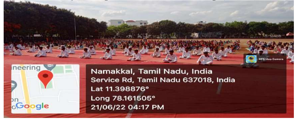
Students performing the fundamental Asanas in Yoga (21.06.22)