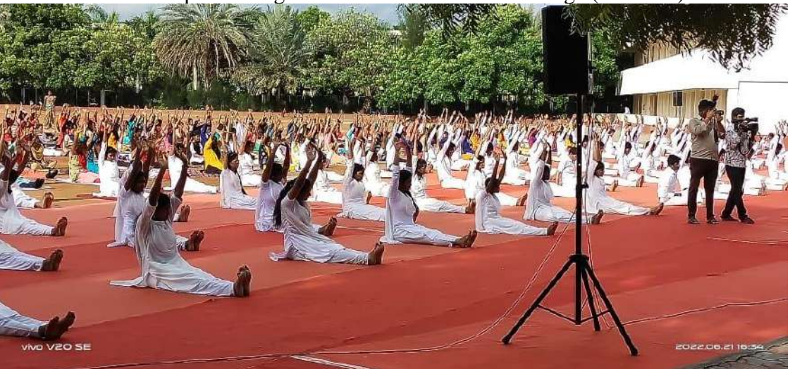
Students performing the fundamental Asanas in Yoga (21.06.22)