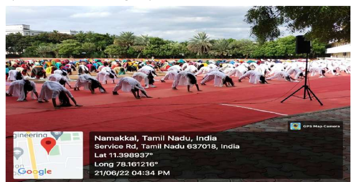
Students performing the fundamental Asanas in Yoga (21.06.22)

Activity Name: International Yoga Day Awareness and Celebration Date: 21.06.2022