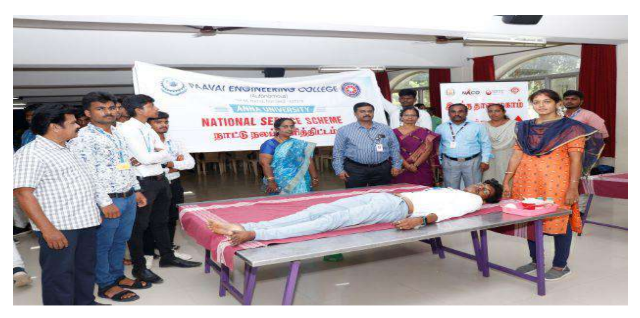
Our volunteers and students donating blood in the camp (11.08.22)