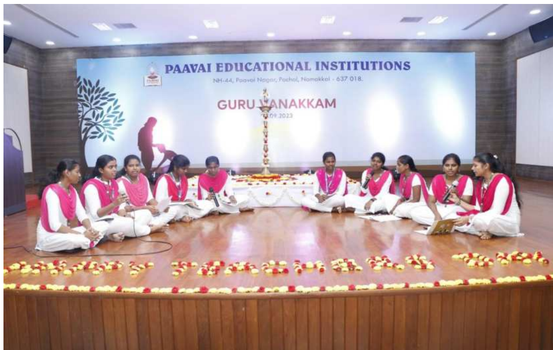
Teacher's Day Celebration (05.09.2023)