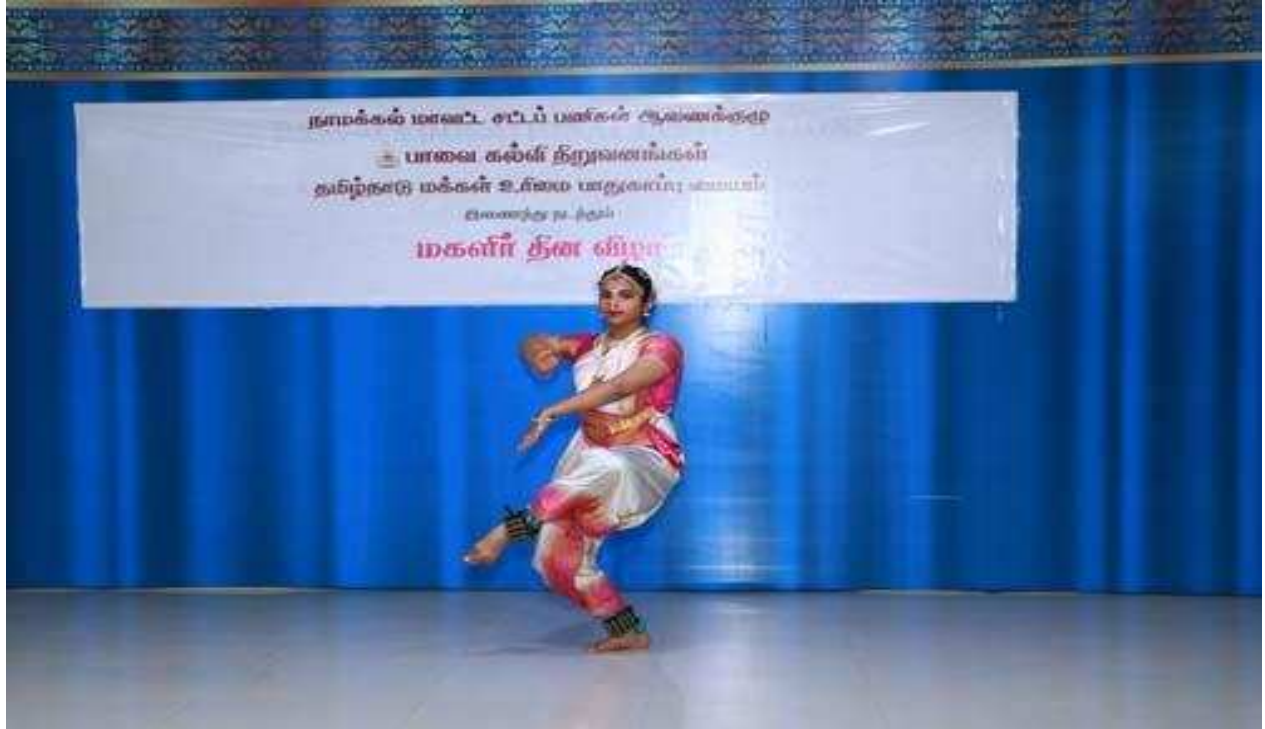
Women's Day Celebration (08.03.2024)