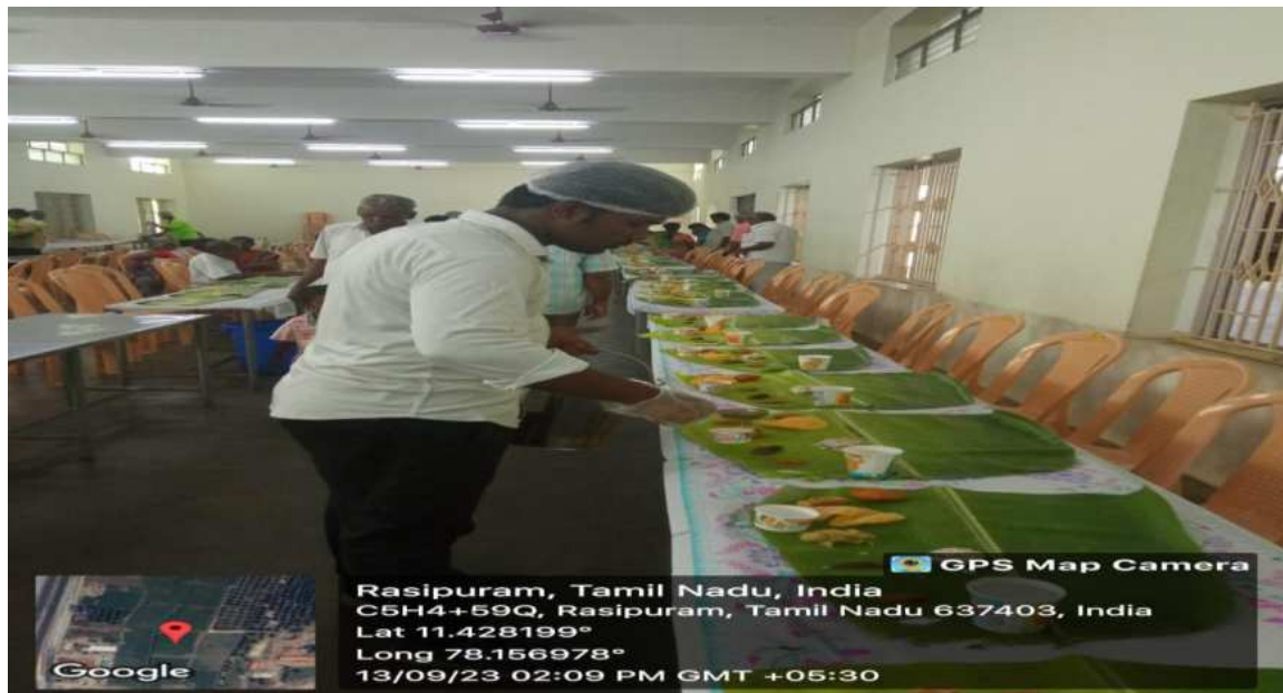
Our Volunteers providing volunteer ship for Bannai Amman Function, Kolijinpatti (13.09.2023)