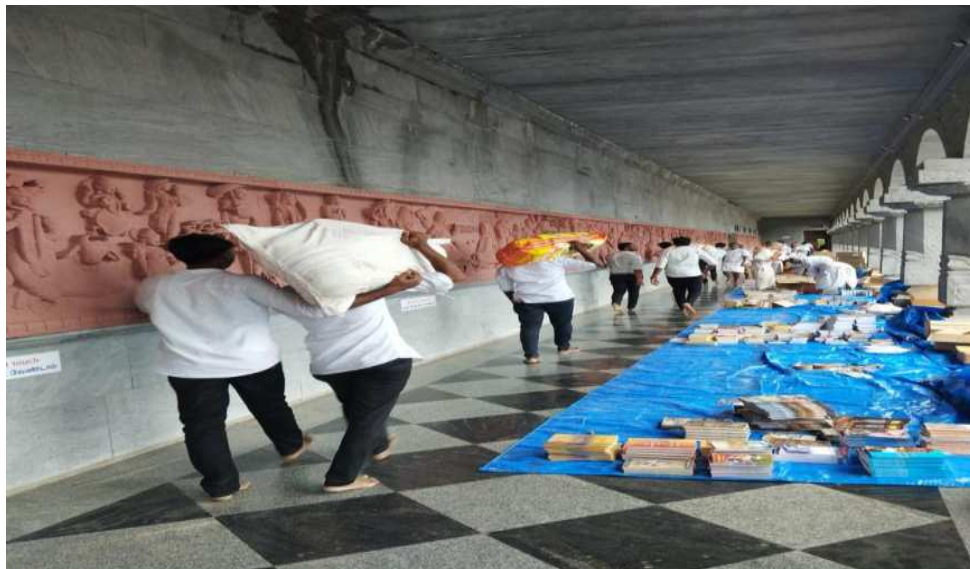
Our volunteers providing service to ISKCON Temple, Salem (07.09.2023)