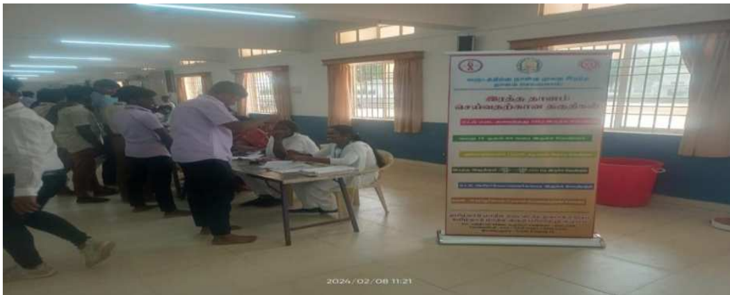
Our volunteers and students donating blood in the camp (08.02.2024)