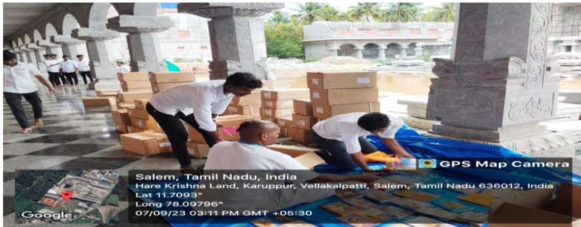
Our volunteers providing service to ISKCON Temple, Salem (07.09.2023)

National Service Scheme, Paavai Engineering College, Namakkal, 30 NSS volunteers helped and supported on 07.09.2023 for re-arranging the things for Krishna Janmasthanmi Celebration at ISKCON Temple, Salem.