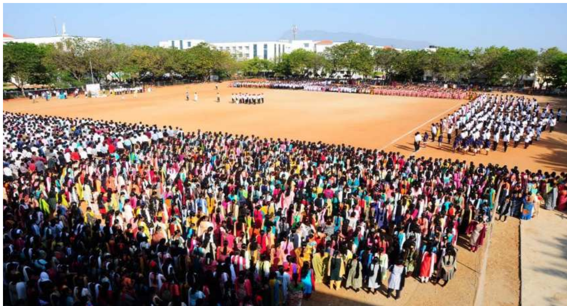
Republic Day Celebration (26.01.2024)