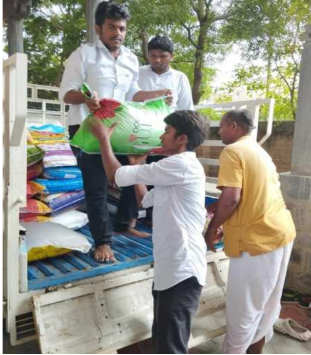
Our volunteers providing service to ISKCON Temple, Salem (07.09.2023)

Activity Name: Volunteer ship for Krishna Janmasthanmi Celebration at ISKCON, Salem Date: 07.09.2023