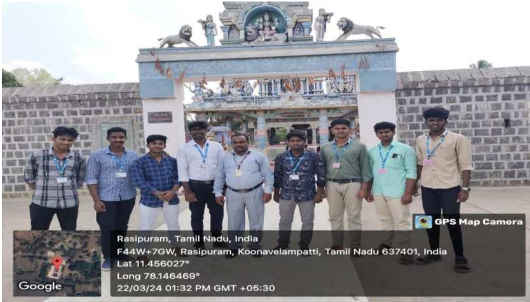
Hundial amount counting NSS volunteers Group photo (22.03.2024)

Paavai Engineering College, National Service Scheme, 10 volunteers provided volunteership on 22.03.2024 for Hundial amount counting at Aliya Elangai Amman Kovil, Namakkal along with the Officers from Department of Hindu Charities, Namakkal and Kovil Members.