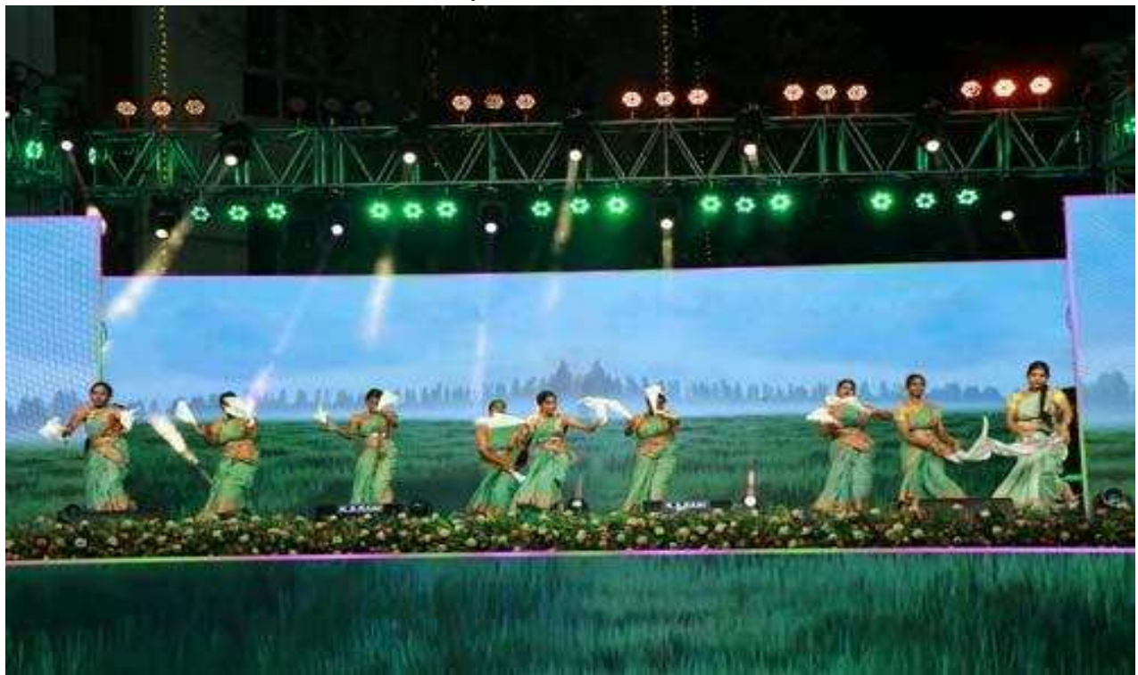
Annual Day Celebration (16.03.2024)