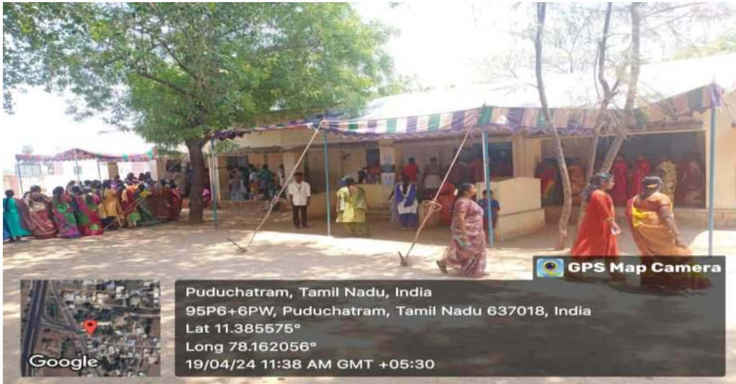
Our volunteers providing volunteer ship Lok-Shaba Election-24 (19.04.24)

Paavai Engineering College 25 NSS volunteers provided volunteer ship outside polling booth for Lok-shaba Election-2024 on 19.4.24 along with Namakkal and Pudduchattram police. They made the queue properly to pole their vote in the booth. Also they helped and supported for older age people to vote properly.