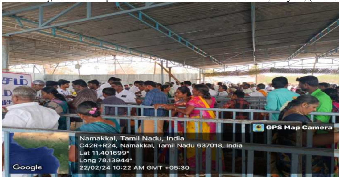
Providing volunteer ship for Kalamman Kovil Kumbhasheikam, Kalyani, (22.02.2024)