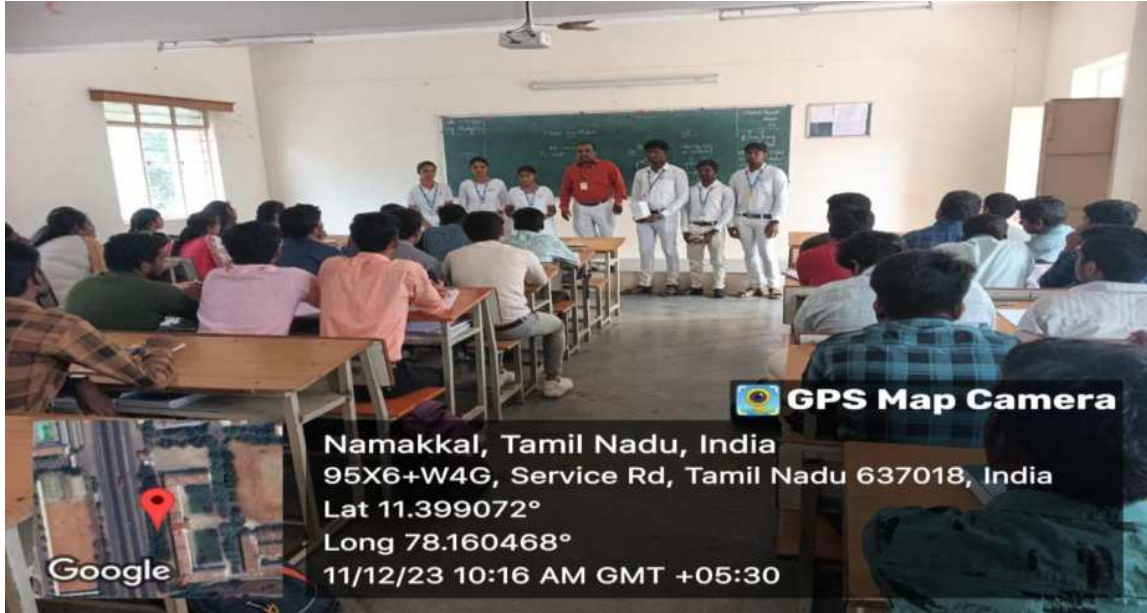
Our NSS volunteers collecting the fund from staff members and students 11.12.2023

Indian Association for the Blind, Madurai is celebrating the International White Cane Day for the Blind. In this connection all students and staff members were contributed the amount for the visually challenged children on 11.12.2023 (Monday) and the total amount is Rs.19288.00. The donated amount was sent to the “Indian Association for the Blind, Madurai-625104”, All the Children Orphanage, Chennai and Annai Teresa Old Age Home, Chennai for visually challenged and orphanage children education purpose.