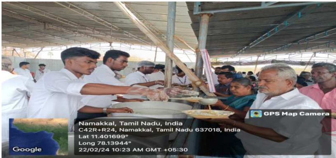
Providing volunteer ship for Kalamman Kovil Kumbhasheikam, Kalyani, (22.02.2024)

Paavai Engineering College, National Service Scheme, 50 volunteers rendered their service on 22.02.2024 for food serving and crowd control volunteer ship for Kumbhasheikam of Kalamman Kovil, Kalyani, Namakkal.