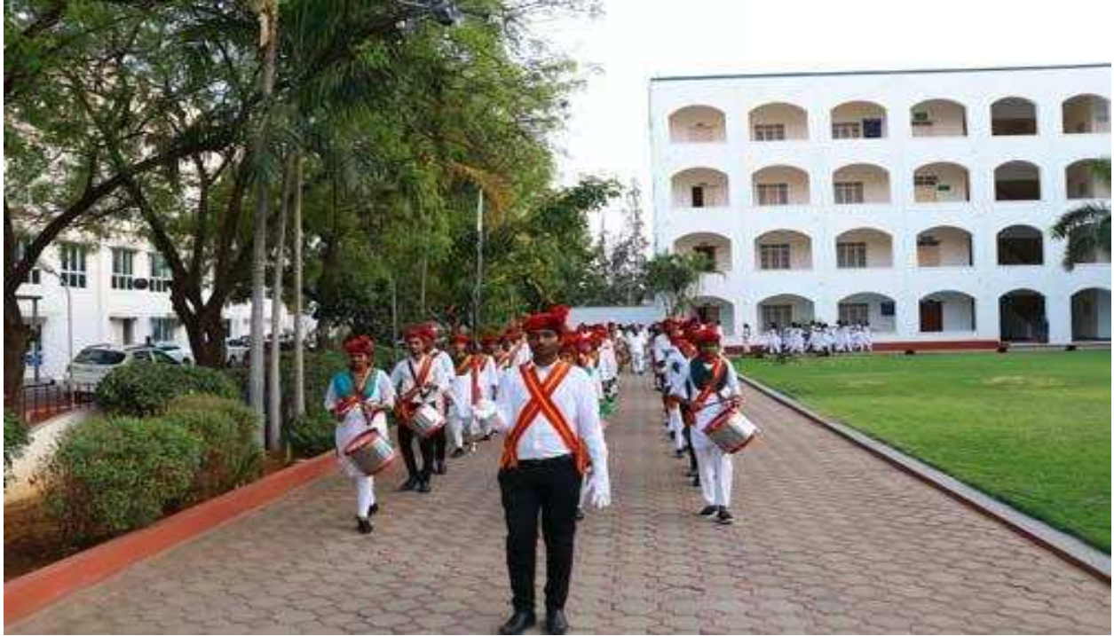
Annual Day Celebration (16.03.2024)