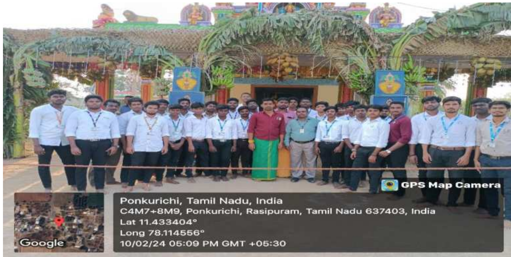
Providing volunteer ship for Amman Kovil Kumbhasheikam, Kallupalayam, (10.02.2024)

Paavai Engineering College, National Service Scheme, 40 volunteers rendered their service on 10.02.2024 and 11.02.2024 for food serving and crowd control volunteer ship for Amman Kovil, Kallupalayam, Kumbhasheikam, Namakkal.