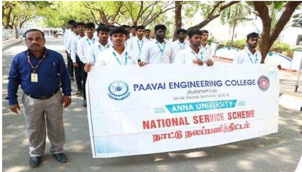
Participating NSS volunteers in the Voter's awareness Campaign Rally (26.03.2024)