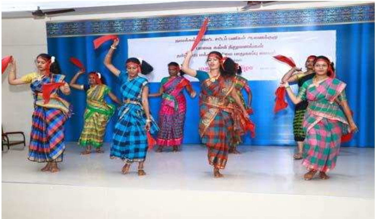
Women's Day Celebration (08.03.2024)