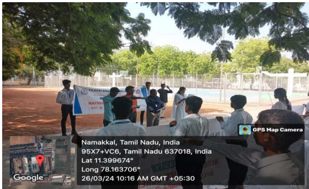
The Voter's pledge taken by our NSS volunteers in the event (26.03.2024)