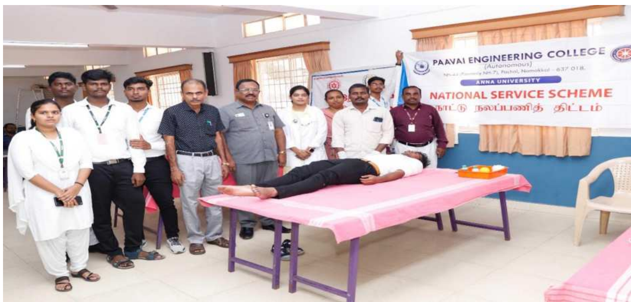
Our volunteers and students donating blood in the camp (07.08.2023)