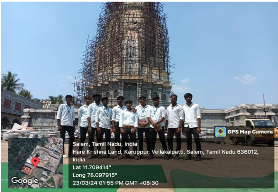
Providing volunteer ship at ISKCON Temple, Salem (23.03.2024)