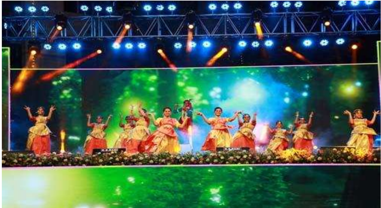
Annual Day Celebration (16.03.2024)