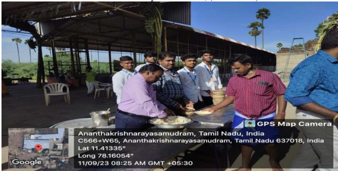
Our Volunteers providing volunteer ship for Aavudaiyar Kovil Function, Ananthakrishnarayasamudhram, (11.09.2023)