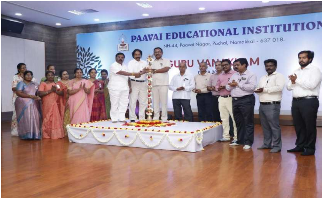
Teacher's Day Celebration (05.09.2023)