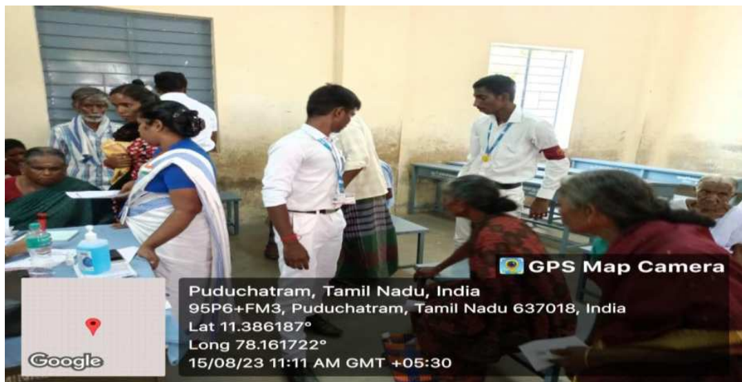
Our Volunteers providing volunteer ship for Free Eye Camp, Pudhuchatram (15.08.2023)