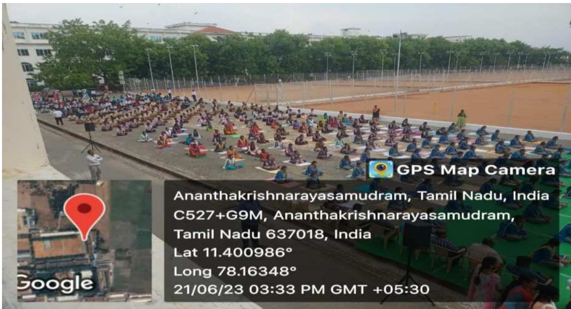
Students performing the fundamental Asanas in Yoga (21.06.2023)