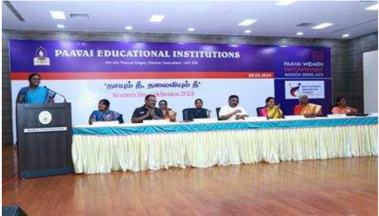
Women's Day Celebration (08.03.2024)