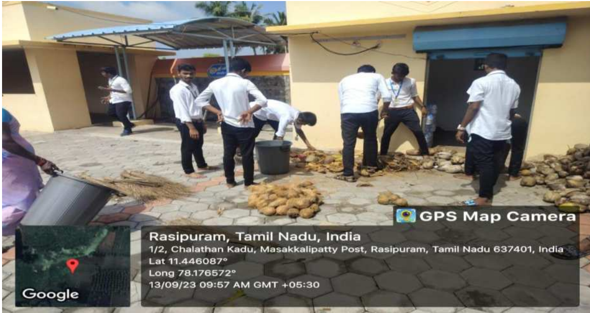
Our Volunteers providing volunteer ship for Bannai Amman Function, Kolijinpatti (13.09.2023)

National Service Scheme, Paavai Engineering College, Namakkal, 30 NSS volunteers provided volunteer ship on 13.09.23 at Bannai Amman Kovil Function, Kolijinpatti, Namakkal. They rendered their services for food serving in the temple function.