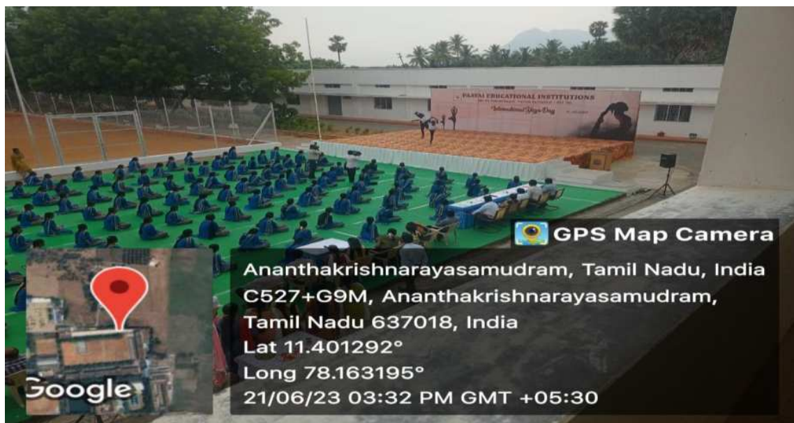
Students performing the fundamental Asanas in Yoga (21.06.2023)