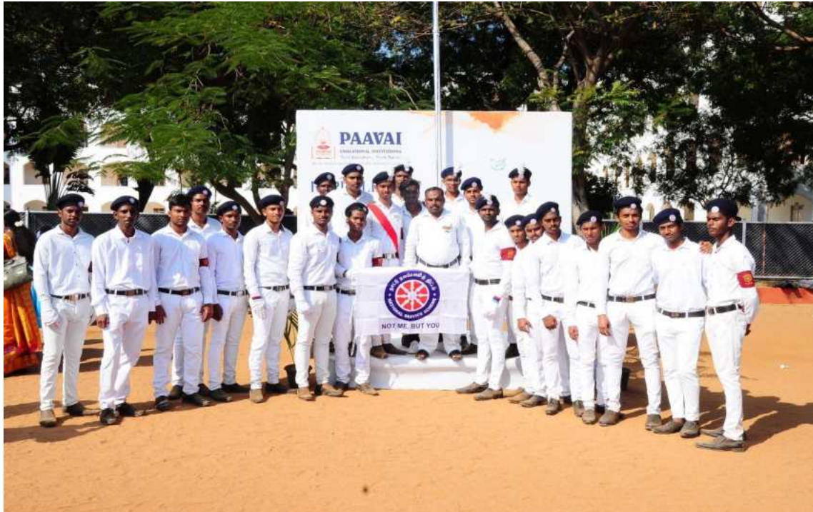
Republic Day Celebration (26.01.2024)