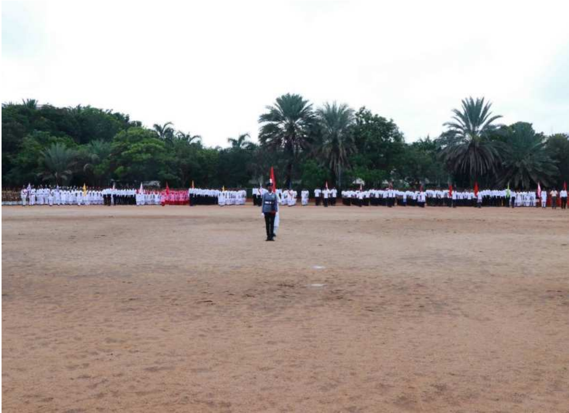
Independence Day Celebration (15.08.2023)