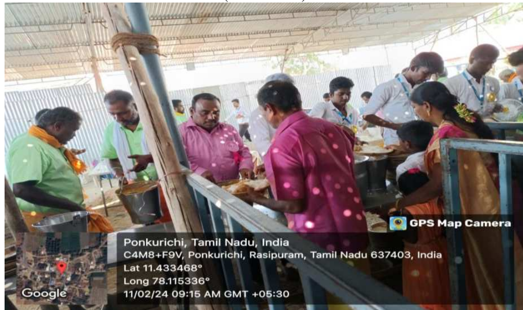
Providing volunteer ship for Amman Kovil Kumbhasheikam, Kallupalayam, (11.02.2024)