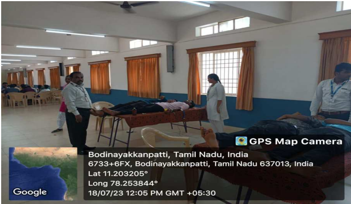
Our volunteers and students donating blood in the camp (18.07.2023)