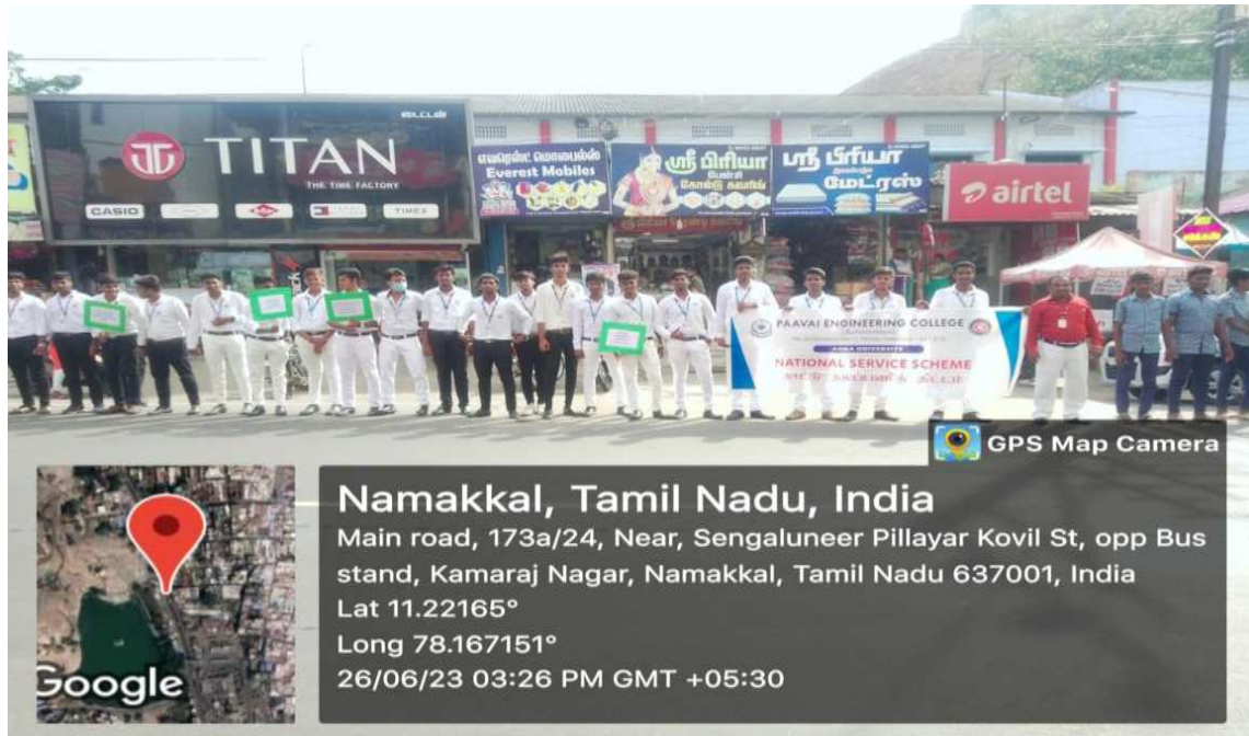
International day Drug Abuse and illicit trafficking-2023 awareness rally (26.06.2023)