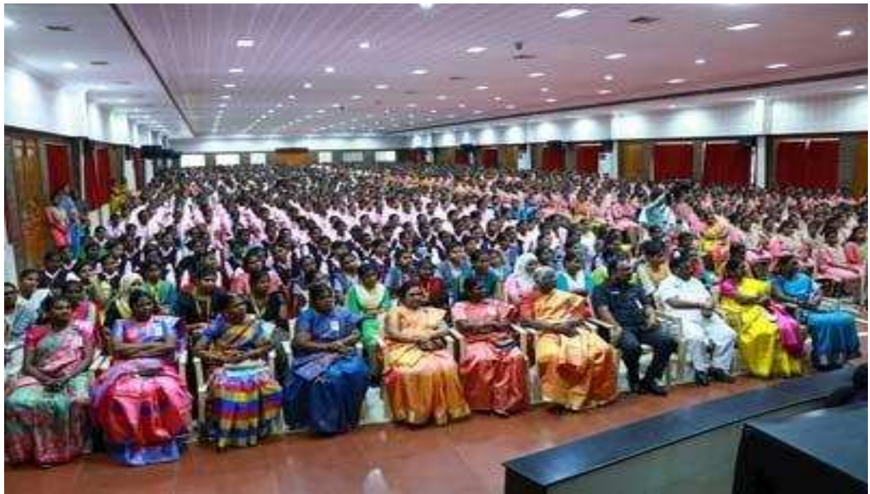
Women's Day Celebration (08.03.2024)