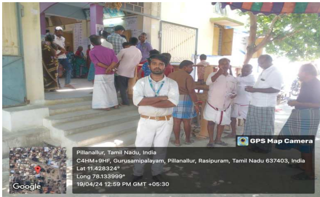
Our volunteers providing volunteer ship Lok-Shaba Election-24 (19.04.24)