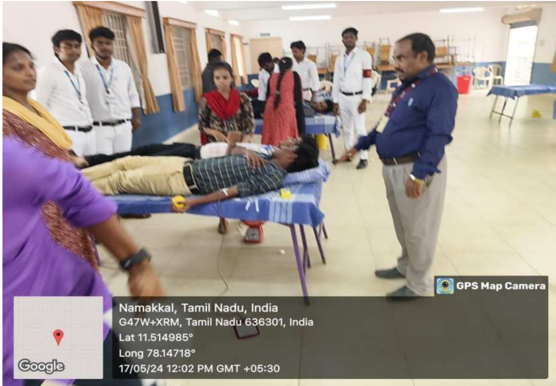
Our volunteers and students donating blood in the camp (17.05.2024)