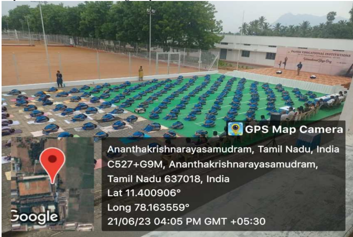
Students performing the fundamental Asanas in Yoga (21.06.2023)

Activity Name: International Yoga Day Awareness and Celebration Date: 21.06.2023