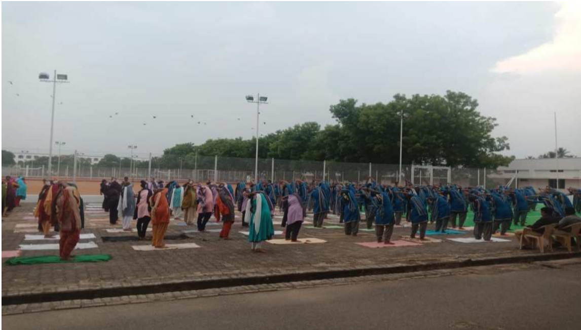
Students performing the fundamental Asanas in Yoga (21.06.2023)

Activity Name: International Yoga Day Awareness and Celebration Date: 21.06.2023