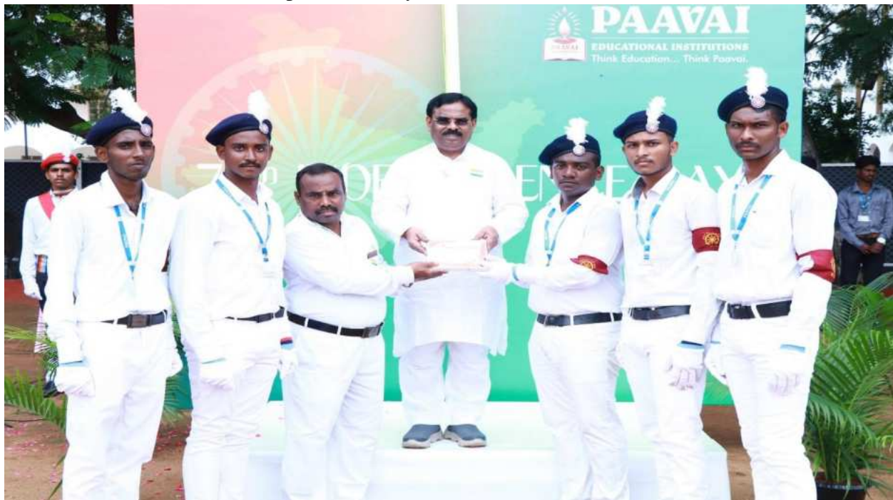
Independence Day Celebration (15.08.2023)