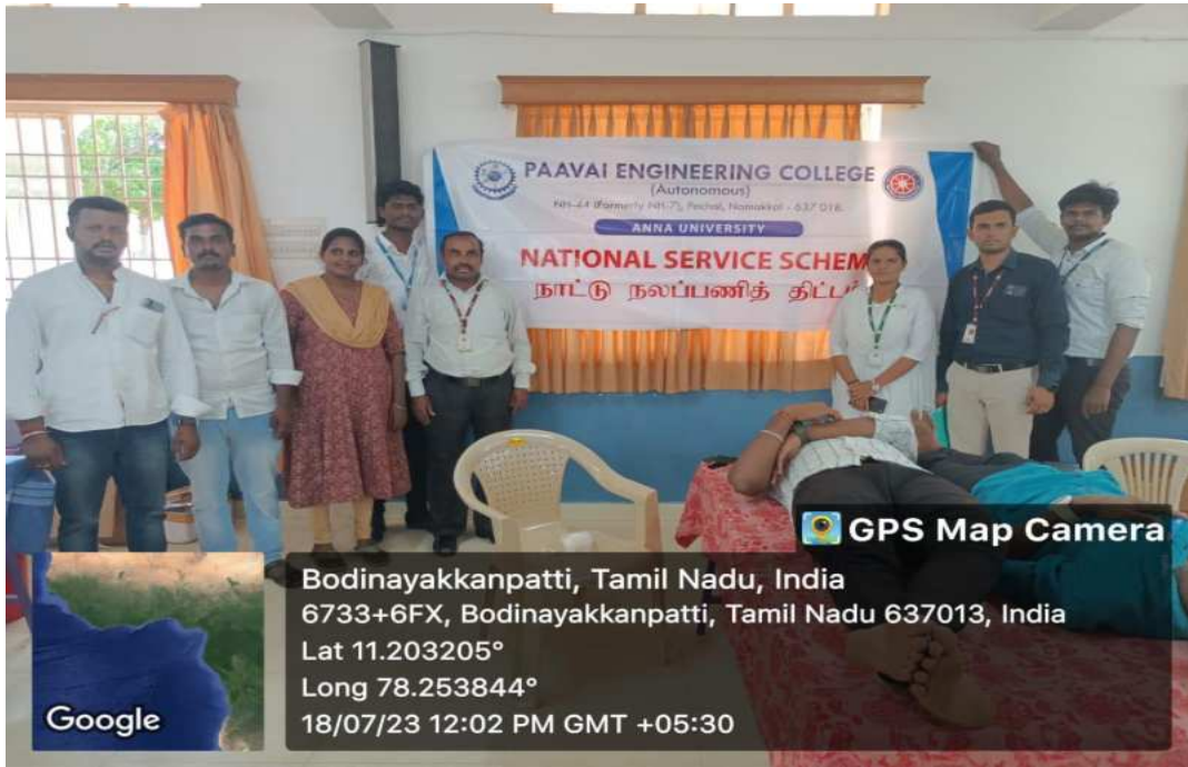
Our volunteers and students donating blood in the camp (18.07.2023)