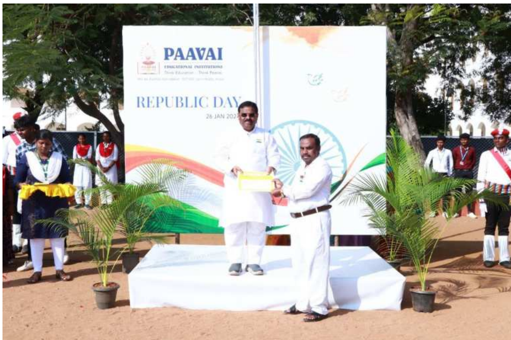
Republic Day Celebration (26.01.2024)

The event concluded with the distribution of certificates and prizes to meritorious students and faculty members. Republic Day celebration ended on a high note with the singing of the national anthem. The Chairman, Correspondent, Vice Chairman, Secretary, Joint Secretary, Director Admissions, Director Administrations, Principals, Deans, Controller of Examinations, Heads, Faculty members and Students of Paavai Institutions were present in the function.