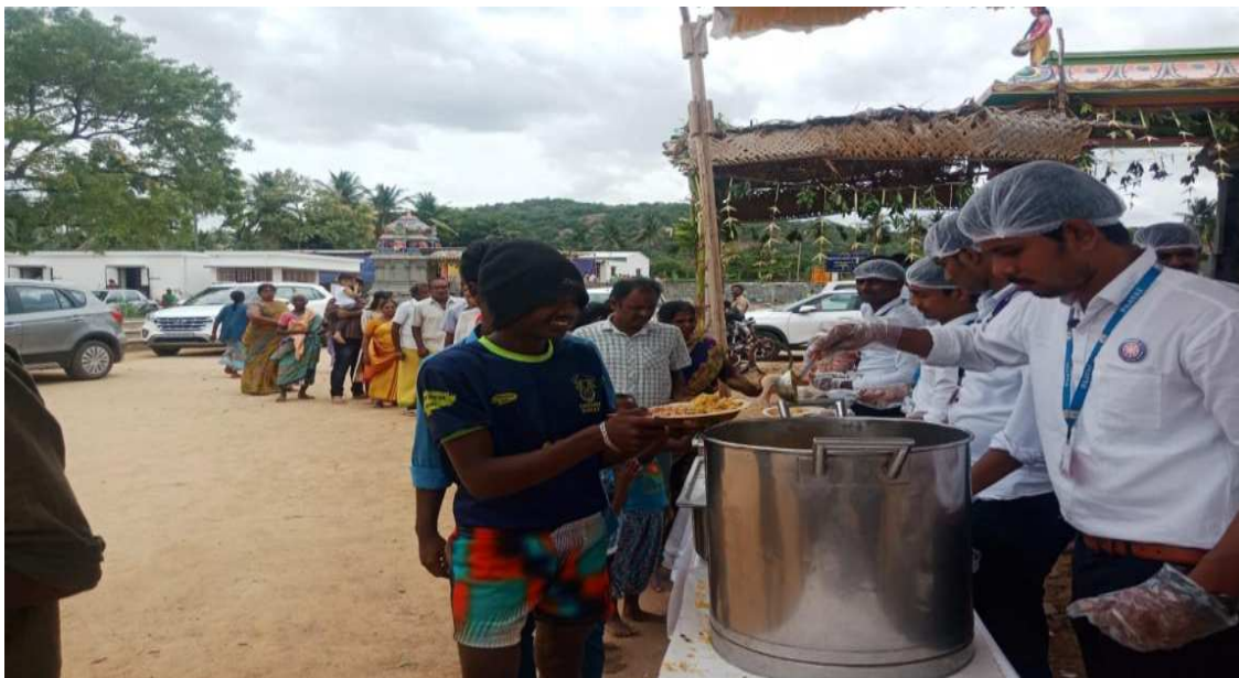
Our Volunteers providing volunteer ship for Atthanoor Amman Kovil (22.07.2023)