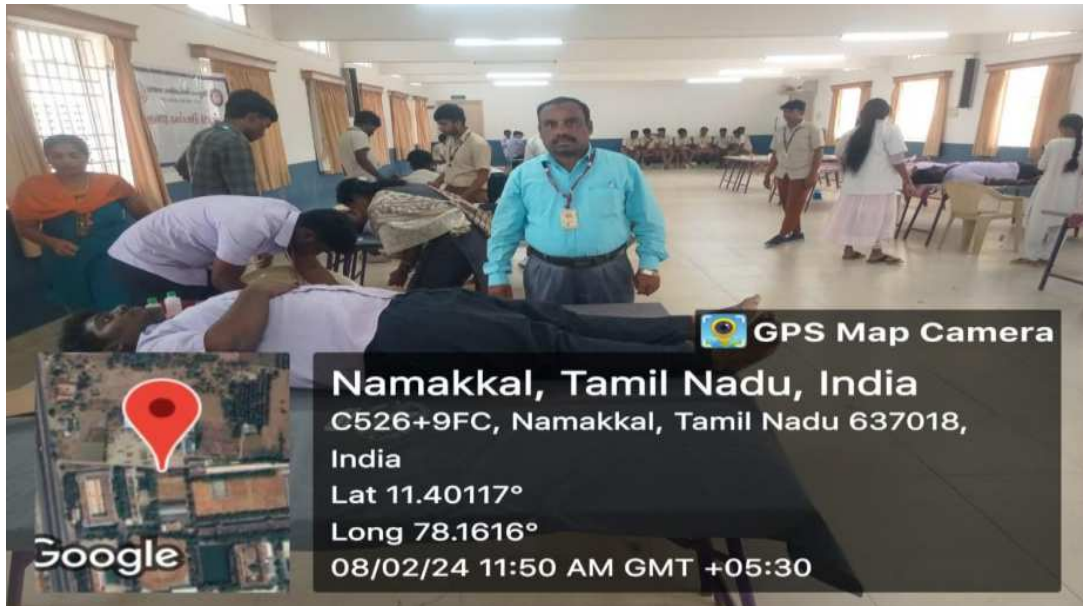
Our volunteers and students donating blood in the camp (08.02.2024)