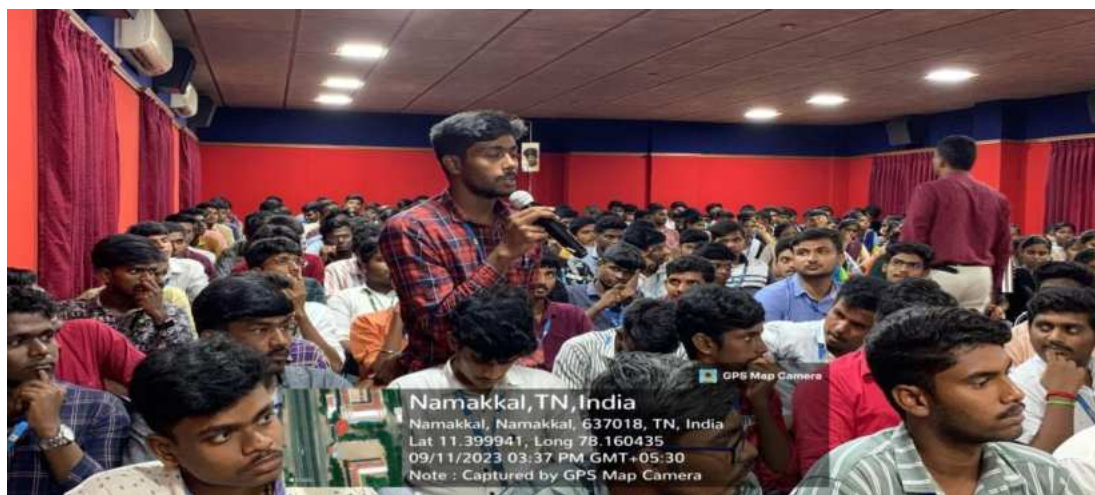
World Suicide Prevention Day Awareness given to students (11.09.2023)