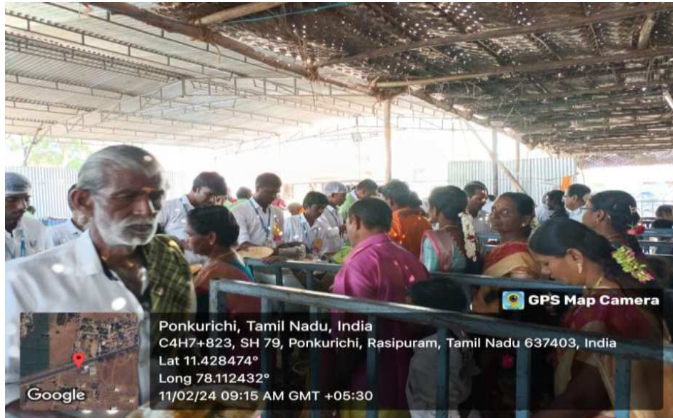
Providing volunteer ship for Amman Kovil Kumbhasheikam, Kallupalayam, (11.02.2024)