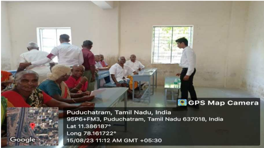
Our Volunteers providing volunteer ship for Free Eye Camp, Pudhuchatram (15.08.2023)

Paavai Engineering College National Service Scheme 20 NSS volunteers provided volunteer ship on 15.8.23 for free Eye Camp organized by Lions Club Puchatram in association with Vivekananda Eye Hospital, Tiruchengode. 200 peoples were benefited by this eye camp.