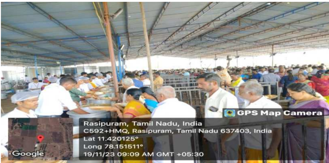
Our Volunteers providing volunteer ship for Sri Sellandi Amman Kovil. Kumbhasheikam Semmampatti (19.11.2023)