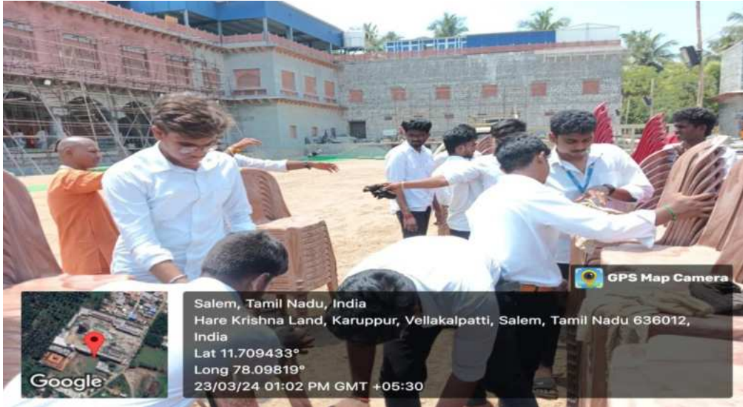
Providing volunteer ship at ISKCON Temple, Salem (23.03.2024)

National Service Scheme, Paavai Engineering College, Namakkal, 10 NSS volunteers helped and supported on 07.09.2023 for re-arranging the things at ISKCON Temple, Salem.