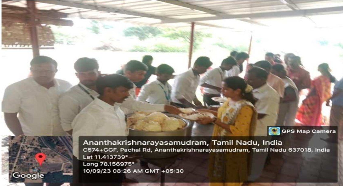
Our Volunteers providing volunteer ship for Aavudaiyar Kovil Function, Ananthakrishnarayasamudhram, (10.09.2023)

National Service Scheme, Paavai Engineering College, Namakkal, 10 NSS volunteers provided volunteer ship from 10.09.23 to 11.09.23 at Aavudaiyar Kovil Function, Ananthakrishnarayasamudhram, Namakkal. They rendered their services for food serving in the temple function.