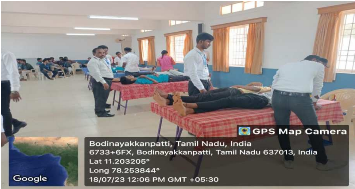
Our volunteers and students donating blood in the camp (18.07.2023)