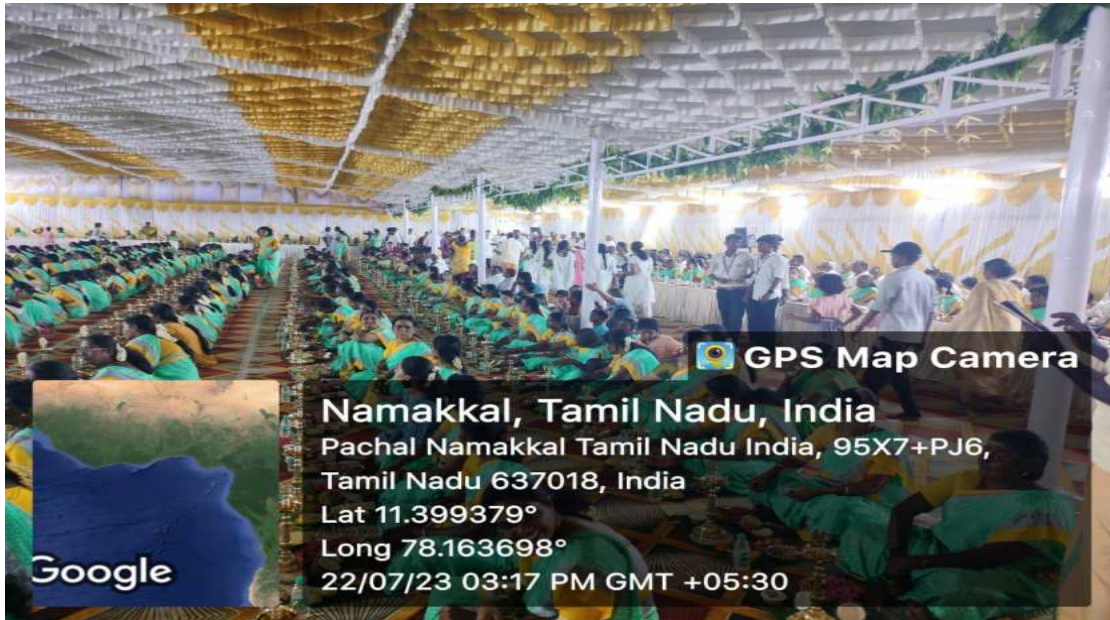
Our Volunteers providing volunteer ship for Atthanoor Amman Kovil (22.07.2023)

Paavai Engineering College, National Service Scheme, provided volunteership for Atthanoor Amman Kovil Vizhaku Poojai on 22.07.2023 along with 100 volunteers (50 Boys, 50 Girls). They rendered their service for food serving and Vizhaku Poojai.