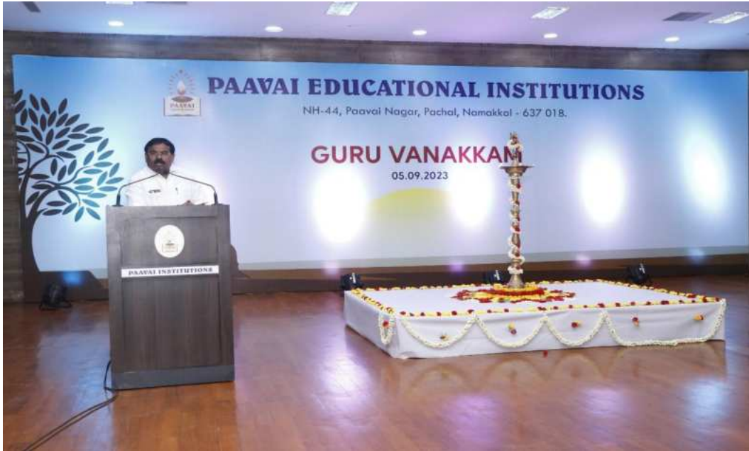
Teacher's Day Celebration (05.09.2023)