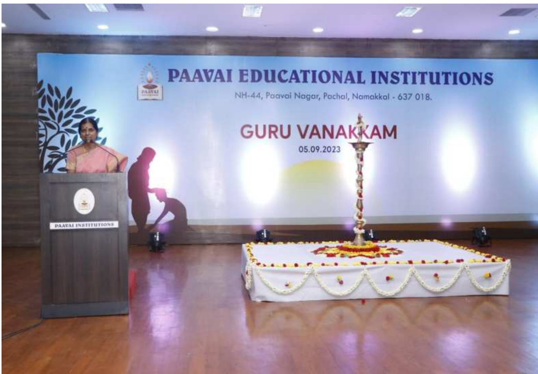
Teacher's Day Celebration (05.09.2023)