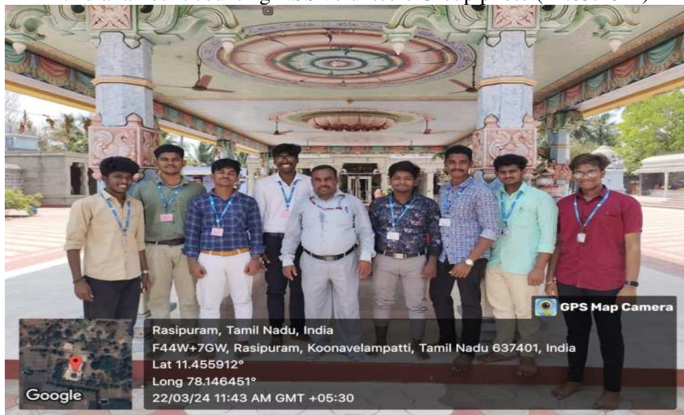
Hundial amount counting NSS volunteers Group photo (22.03.2024)