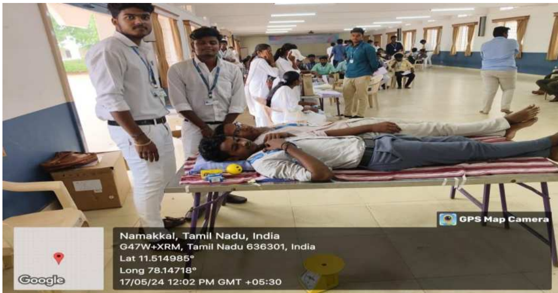
Our volunteers and students donating blood in the camp (17.05.2024)