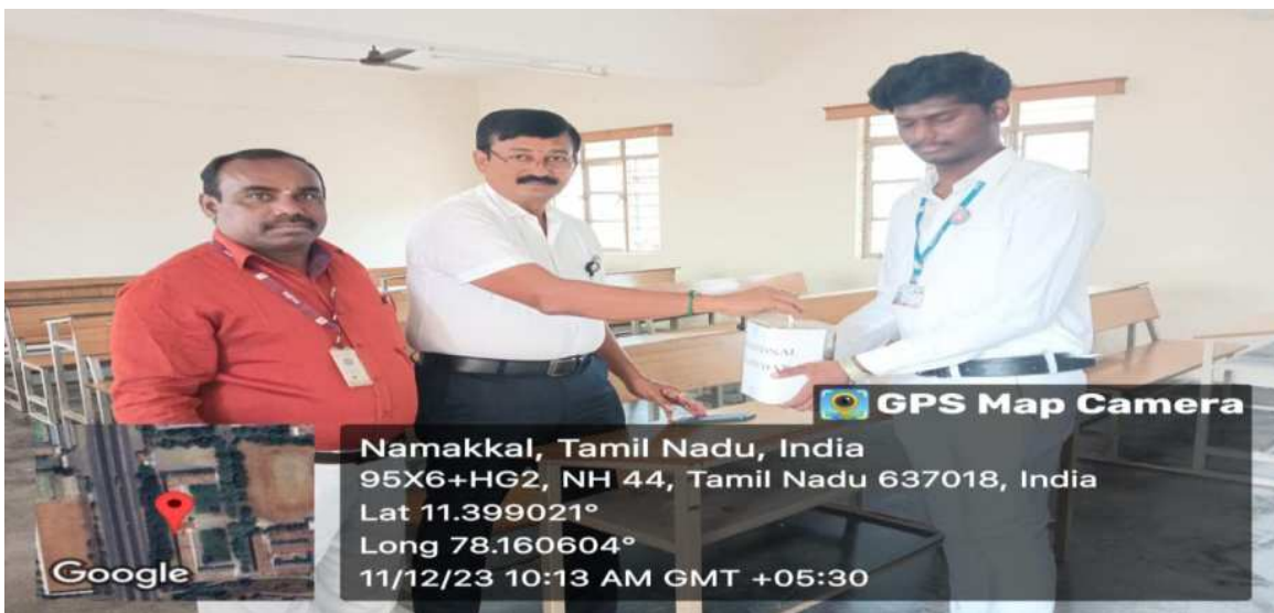
Our NSS volunteers collecting the fund from staff members and students 11.12.2023