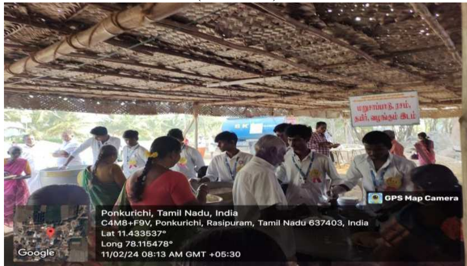
Providing volunteer ship for Amman Kovil Kumbhasheikam, Kallupalayam, (11.02.2024)