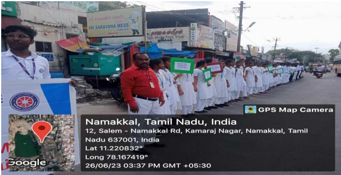
International day Drug Abuse and illicit trafficking-2023 awareness rally (26.06.2023)