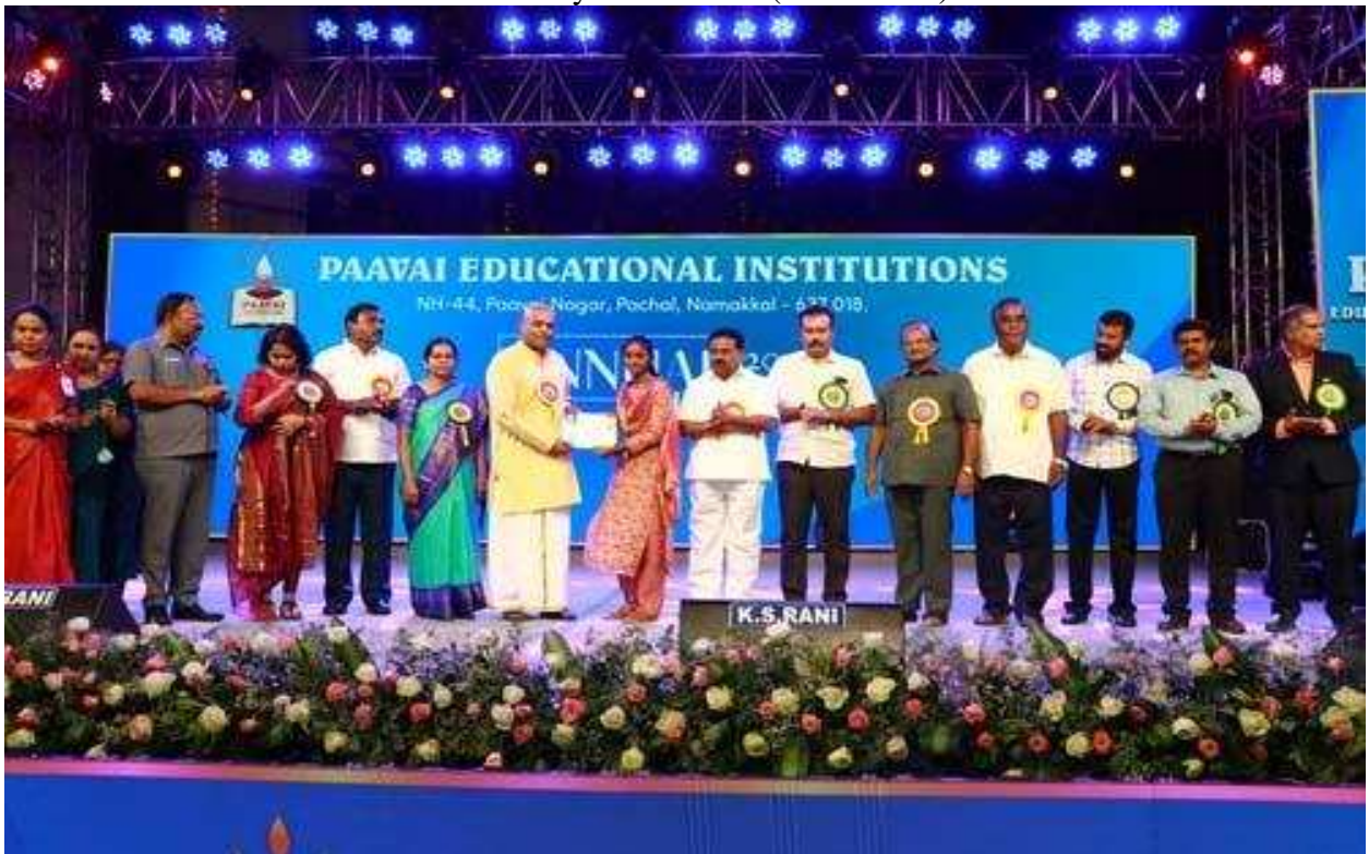
Annual Day Celebration (16.03.2024)