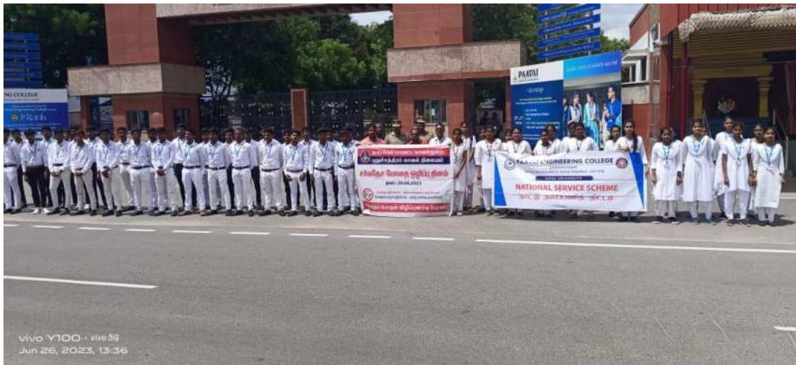
International day Drug Abuse and illicit trafficking-2023 awareness rally (26.06.2023)