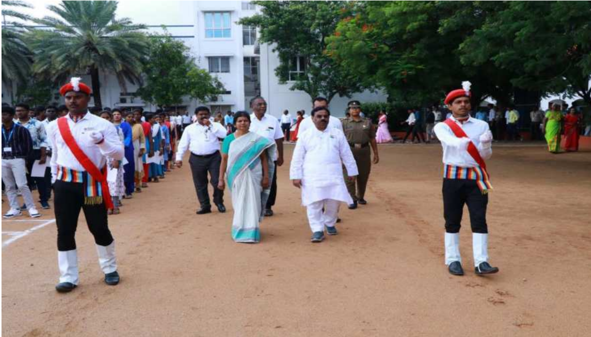
Independence Day Celebration (15.08.2023)