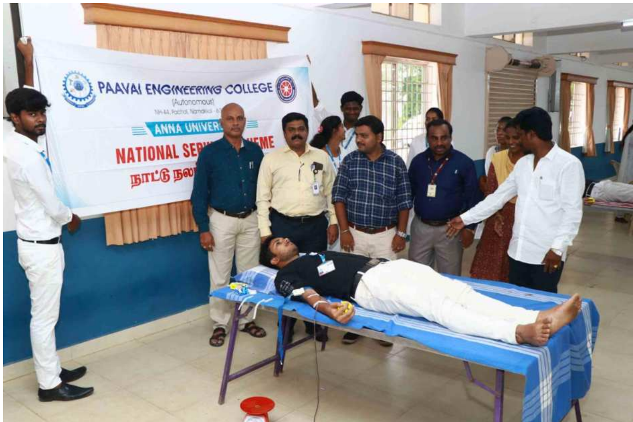
Our volunteers and students donating blood in the camp (17.05.2024)