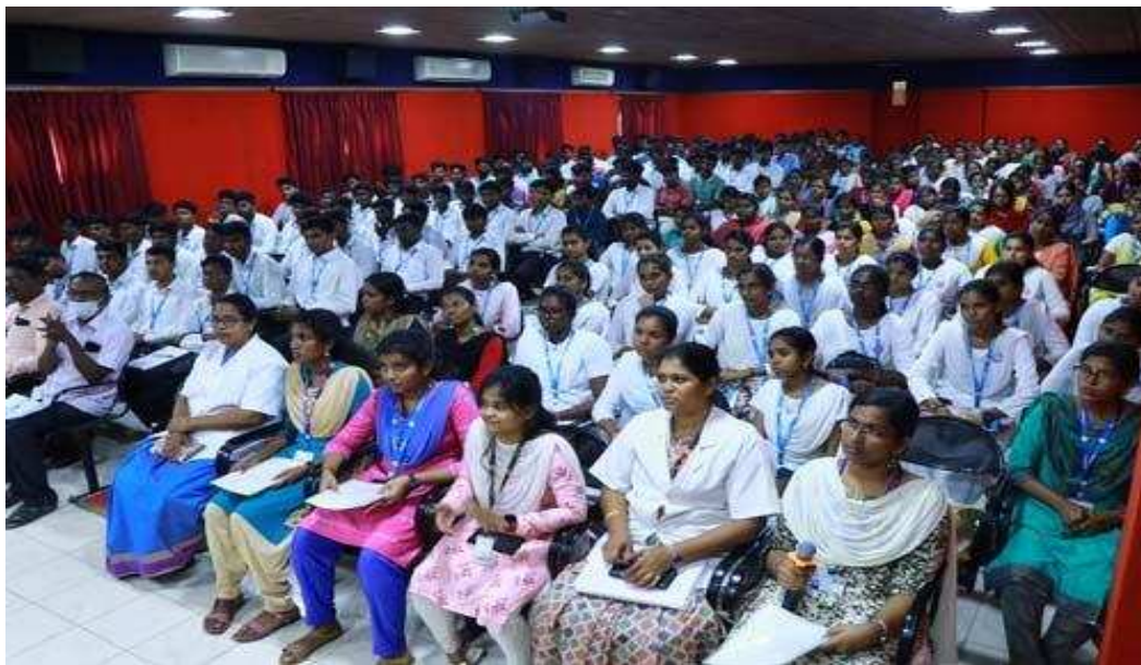
NSS volunteers and students participating in the world consumer day awareness seminar (20.03.2024)