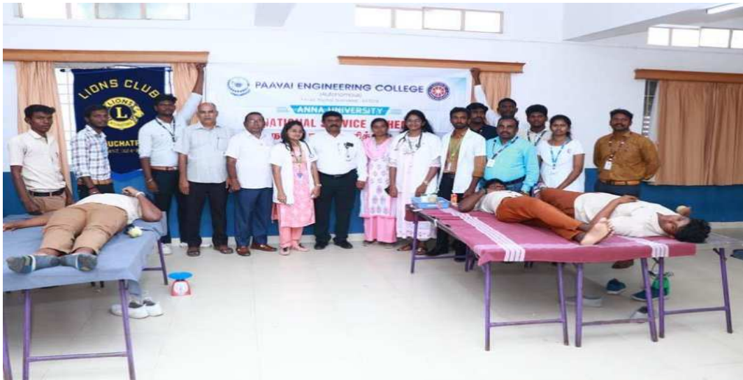
Our volunteers and students donating blood in the camp (08.02.2024)