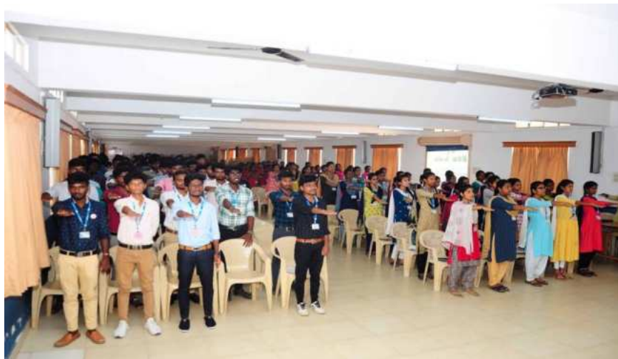
World Youth Red Cross Day Pledge taken by our Volunteers (08.05.2024)