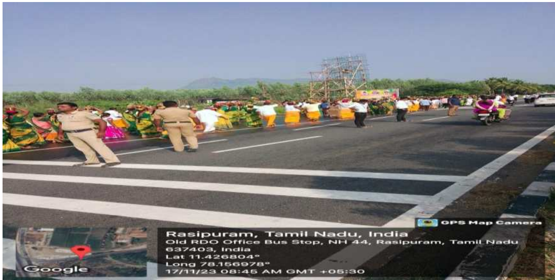
Our Volunteers providing volunteer ship for Sri Sellandi Amman Kovil. Kumbhasheikam Semmampatti (17.11.2023)

Paavai Engineering College 30 NSS volunteers provided volunteer ship for Sri Sellandi Amman Kovil function on 17.11.23 and provided crowd control and traffic control along with the police department. Paavai Engineering College 100 NSS volunteers provided volunteer ship on 19.11.23 for Sri Sellandi Amman Kovil. Kumbhasheikam Semmampatti, Namakkal. They rendered their services for crowd control and food serving in the temple function.