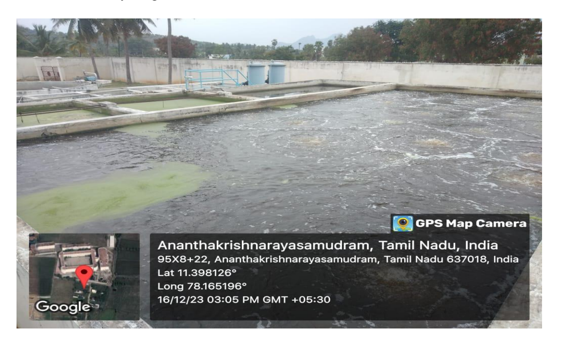
Waste Water Recycling plant