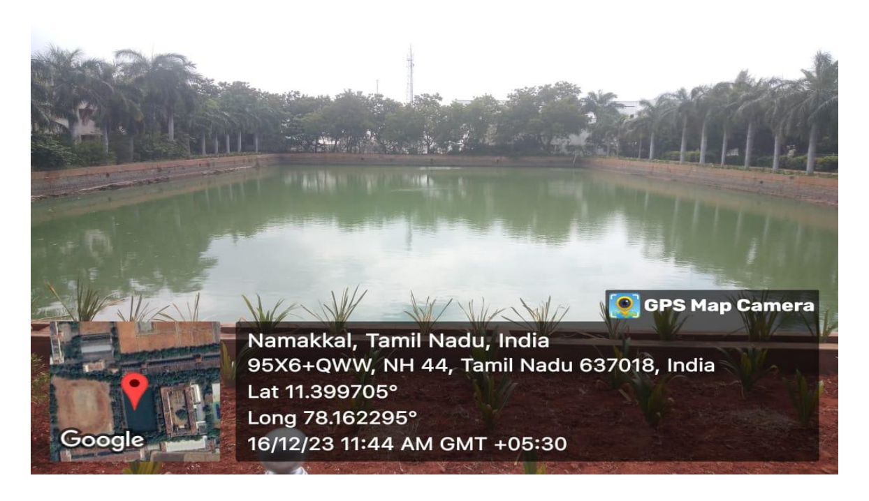
Rain Water Harvesting: Capacity 2 Crore Litres

04286-243038, 58,88 & 98 Fax: 04286-243068 Email: pecprincipal@paavai.edu.in website: http://pec.paavai.edu.ir