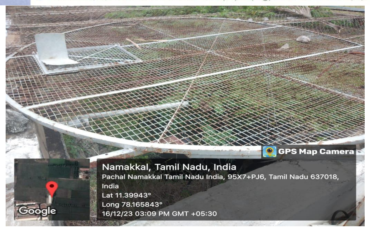
Open well 3

04286-243038, 58,88 & 98 Fax: 04286-243068 Email: pecprincipal@paavai.edu.in website: http://pec.paavai.edu.ir