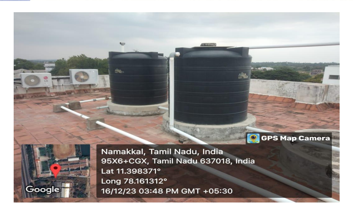
Water Tank 4 with capacity of 2,000 Litres each

04286-243038, 58,88 & 98 Fax: 04286-243068 Email: pecprincipal@paavai.edu.in website: http://pec.paavai.edu.ir