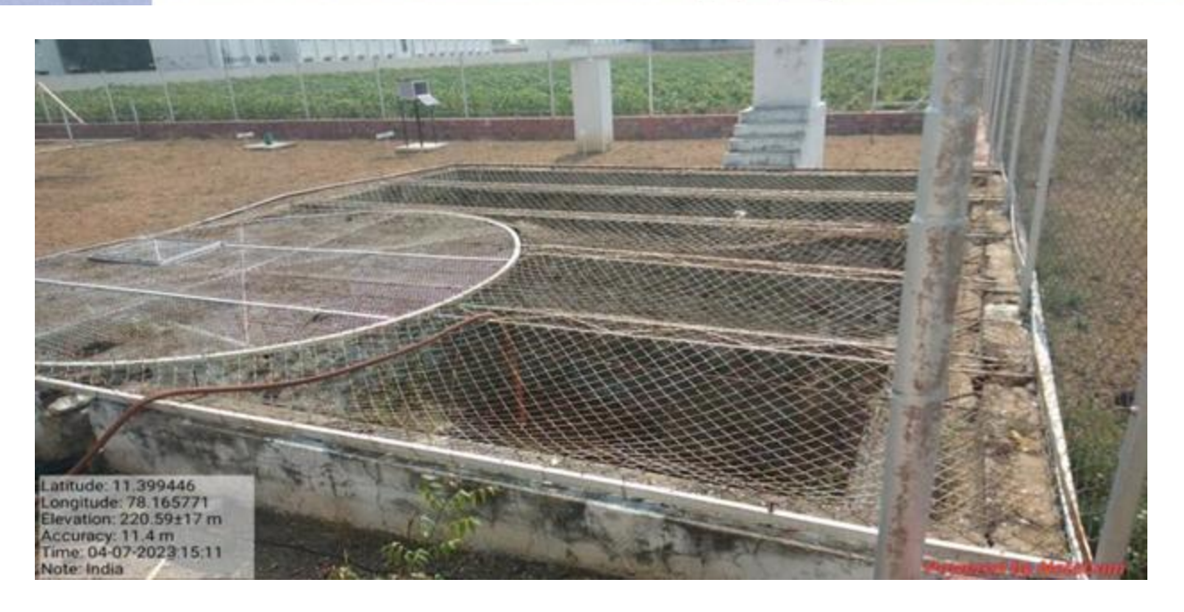
Open well 1

04286-243038, 58,88 & 98 Fax: 04286-243068 Email: pecprincipal@paavai.edu.in website: http://pec.paavai.edu.in