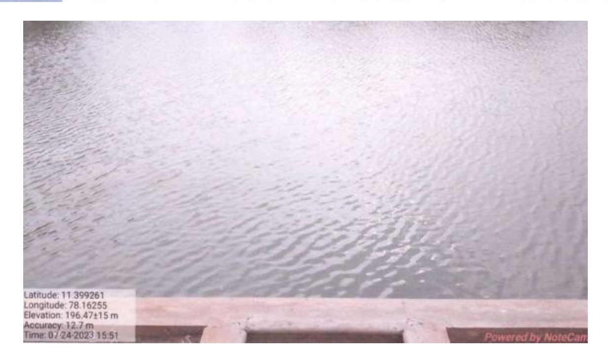
Construction of Bunds

04286-243038, 58,88 & 98 Fax: 04286-243068 Email: pecprincipal@paavai.edu.in website: http://pec.paavai.edu.in