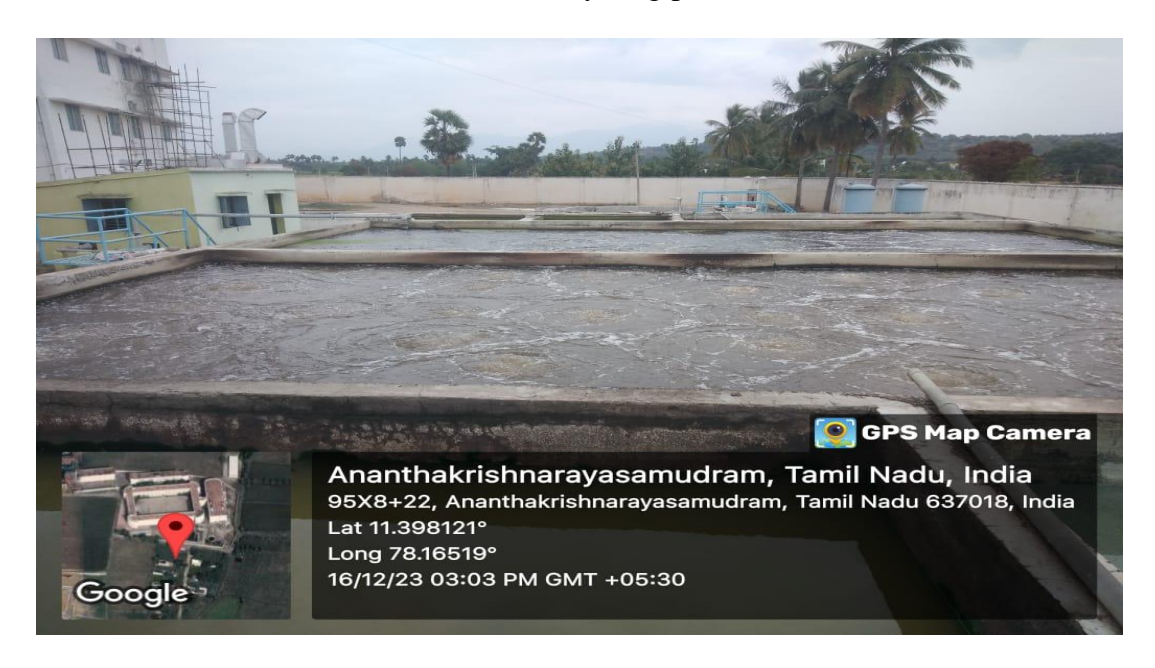
Waste Water Recycling plant