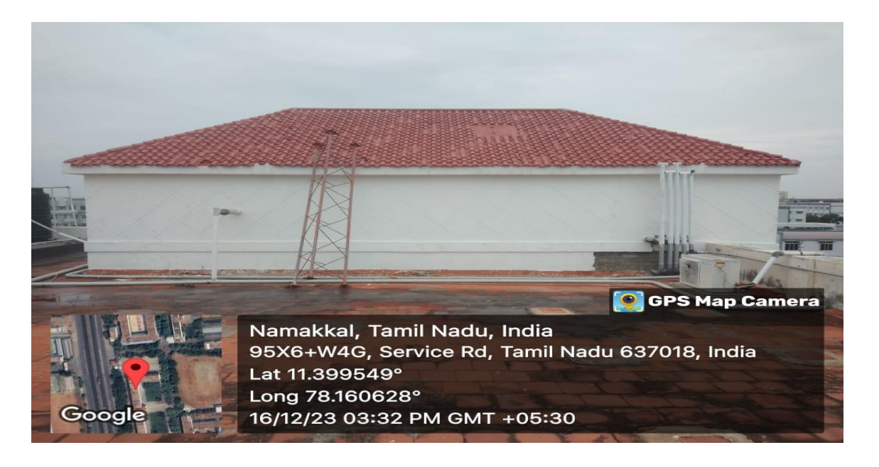
Water Tank 1 with capacity of 6,000 Litres