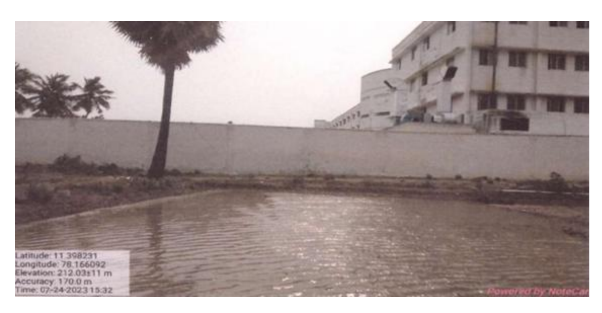
Construction of Bunds