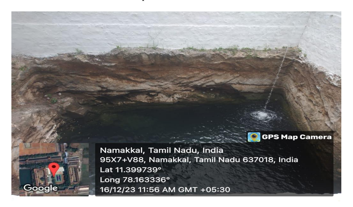
Open well 2