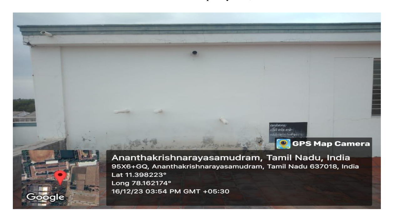
Water Tank 3 with capacity of 5,000 Litres