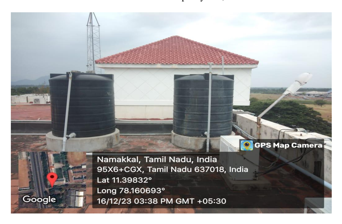
Water Tank 5 with capacity of 2,000 Litres each